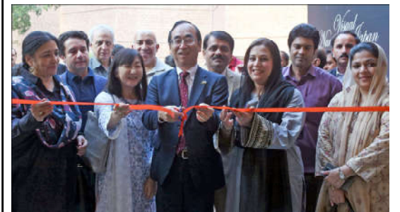
LAHORE: Ambassador of Japan to Pakistan WADA Mitsuhiro cutting the ribbon during inauguration ceremony of painting exhibition at Al-Hamra art Gallery, in the Provincial Capital.