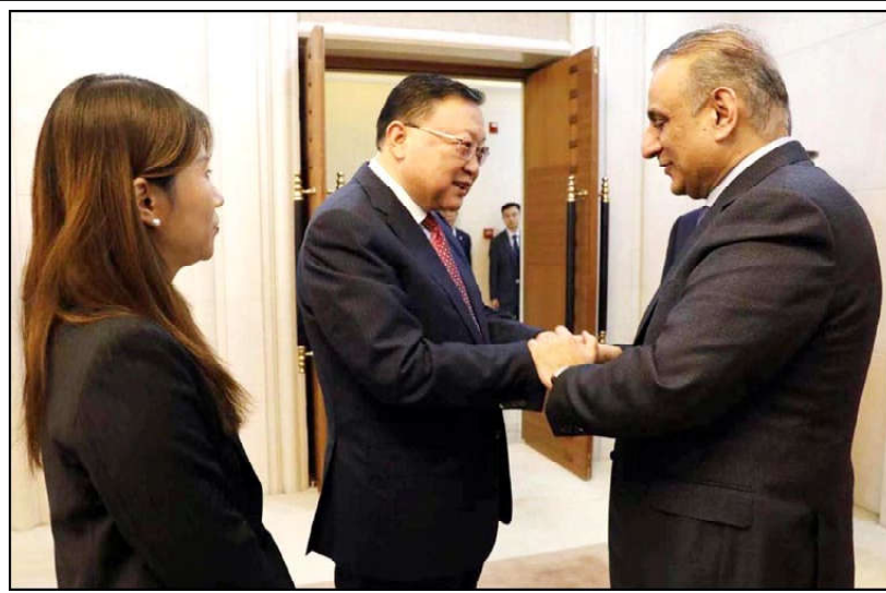
Federal Minister for Communications, Abdul Aleem Khan being received by Chinese Transport Minister Li Xiapeng in Beijing.

their account within two to three days. However, the CEO of BHCC informed the court that no amount has been transferred to their account to date. The Assistant Advocate General, Finance Department, and Law Officers of the Health Department failed to satisfy the court regarding the release and transfer of Rs. 50 million. Previously, the Chief Secretary Balochistan held a meeting with the Chairman and members of BHCC, Secretary Finance, and Secretary Health, where it was decided that BHCC would submit its future demands/requirements through the Health Department to the Finance Department. Accordingly, BHCC submitted its demands, but no action has been taken yet, which was acknowledged by the Law Officers of the Finance and Health Departments. The honorable judges expressed displeasure, stating that the behavior of the Finance and Health Departments suggests they do not want BHCC to function as a fully autonomous organization. The court directed the Secretaries of Finance and Health to comply with its orders and appear personally on the next hearing.