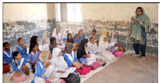
HYDERABAD: Student of Government Girls Urdu Primary School Hali road studying on the floor due to furniture not available.