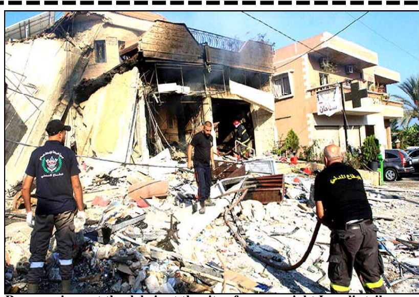
Rescuers inspect the debris at the site of an overnight Israeli strike on a pharmacy in the southern Lebanese village of Akbiyeh.

Speaking at the session in New York, Biden, who has come under fire for his administration's unconditional support to Israel, as it commits acts of genocide in the Gaza Strip, said it was time for a cease-fire in Gaza. He said that "innocent civilians" in the blockaded Palestinian enclave were "going through hell," adding that now was the time for Israel and Hamas to agree to a cease-fire and hostage deal. The deal would "bring the hostages home and secure security for Israel" and ease the suffering in Gaza and end this war.