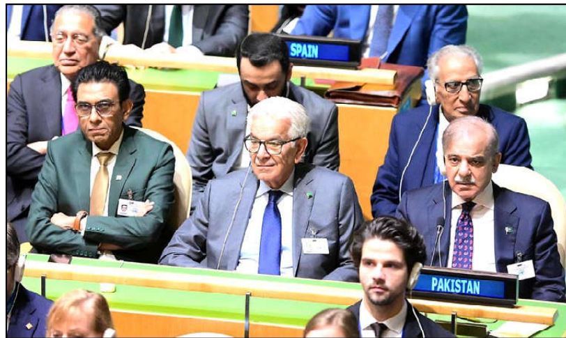
NEW YORK: Prime Minister Muhammad Shehbaz Sharif attending the inaugural session of United Nations General Assembly, New York.

"It will be better to form the constitutional court with mutual consultation," he added.