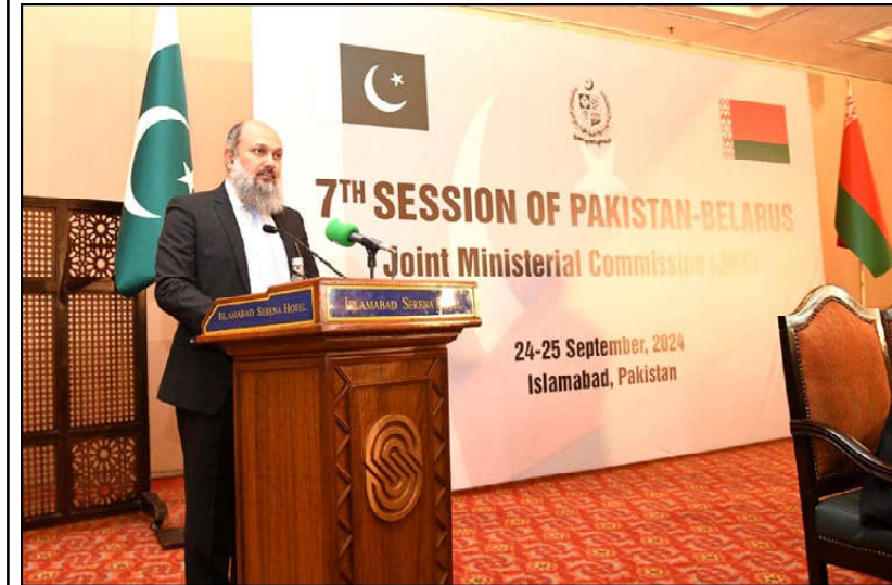
ISLAMABAD: Federal Minister for Commerce Jam Kamal Khan addressing to the 7th Session of Joint Ministerial Commission between Pakistan and Belarus.