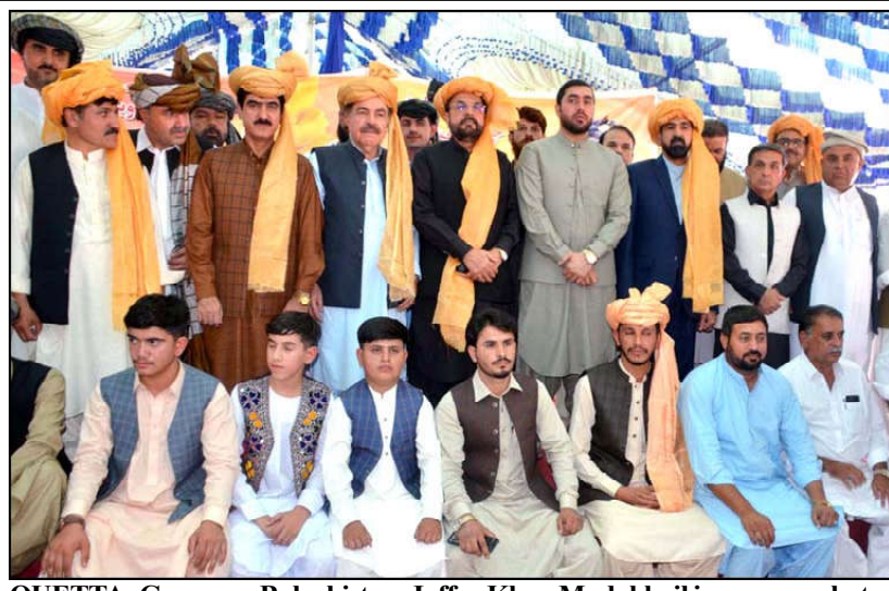
QUETTA: Governor Balochistan, Jaffar Khan Madokhail in a group photograph with Parliamentarians, Bureaucrats, Member Civil Societies and Students on occasion of Pashtun Culture Day.

Both the sides also agreed for establishing joint working group to promote bilateral trade relations between Pakistan and Tajikistan and agreed for initiating trade partnership in edibles goods, besides developing storage facilities along the boarder sides and taking measures for trade facilitation. Speaking on the occasion, Rana Tanveer said that Pakistan was ready to help the Tajikistan for fulfilling its requirements of edibles goods.