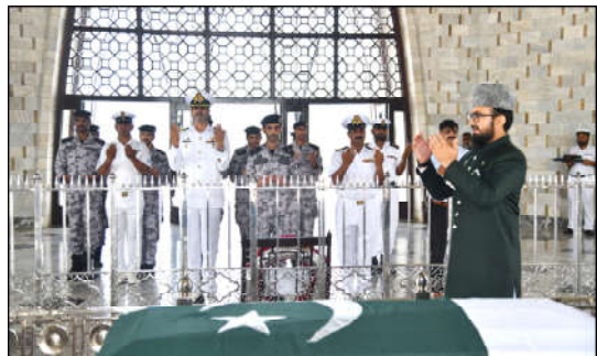
Qatar Emiri Naval Forces delegation offering Fateha at Mazar-e-Quaid during visit to Karachi.