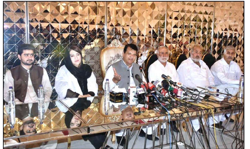
PESHAWAR: Federal Minister for Kashmir Affairs, GB, SAFRON and President PML-N Khyber Pakhtunkhwa Engr. Amir Muqam addressing a press conference.

The governor of Balochistan also announced to give one lakh cash rupees to the boys and girls who perform traditional dances and skits on the stage.