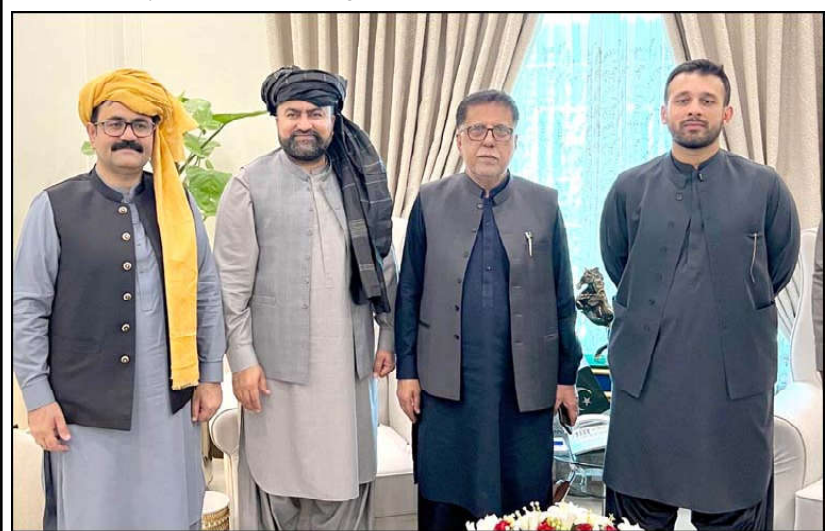
QUETTA: Chief Minister Balochistan Mir Sarfraz Ahmed Bugti in a group photo with Provincial Ministers Mir Muhammad Sadiq Umrani, Bakht Muhammad Kakar and Parliamentary Secretary Nawabzada Zareen Magso on eve of Pashtun Culture Day

The minister said that the review petition had not become ineffective after the announcement of detailed judgment in the reserved seats case.