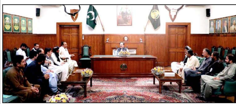
QUETTA: Different delegations meeting with Governor Balochistan Sheikh Jaffar Khan Mandokhail