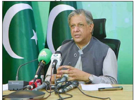
ISLAMABAD: Federal Minister for Law and Justice Senator Azam Nazeer Tarar addressing an important press conference.

The verdict states: "When election authorities engage in actions [...] such as unlawfully denying the recognition of a major political party and treating its nominated candidates as independents, they not only compromise the rights of these candidates but also significantly infringe upon the rights of the electorate and corrode their own institutional legitimacy."