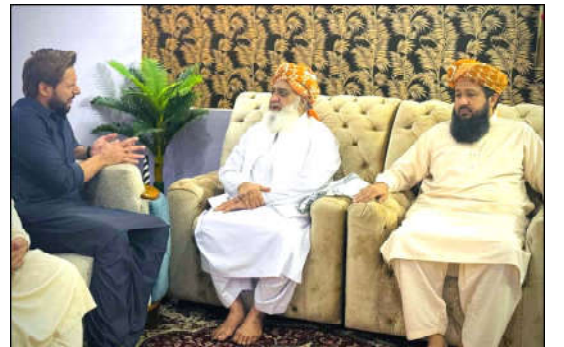
KARACHI: Jamiat Ulema-e-Islam (JUI-F) Chief, Maulana Fazal-ur-Rehman exchanges views with Former Pakistan Captain and All-Rounder, Shahid Khan Afridi during meeting held in Karachi.

BRICS: Democratisation of the world order based on multipolarity, multilateralism, UN Charter and International Law, Demilitarisation of international relations, rejecting any new military alliances like "Asian NATO", QUAD or AUKUS, Dedollarisation of the world economy and greater trade in non-dollar currencies as dollar was being weaponised.