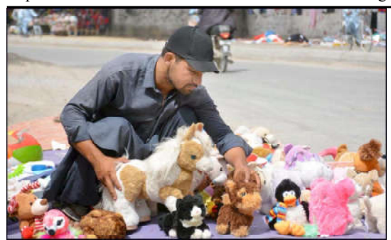
QUETTA: A vendor displaying stuffed toys to attract the customers at roadside near Sunday Bazaar at Joint road.