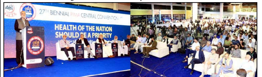
KARACHI: Jamaat-e-Islami (JI) Pakistan Ameer Engr Hafiz Naeemur Rehman addressing at the two-day biannual countrywide central convention organized by the Pakistan Islamic Medical Association (PIMA) at the Karachi Expo Center.

One of his most watched bilateral meetings will be with Dr. Muhammad Yunus, head of Bangladesh's new caretaker government, amid dramatic improvement in Islamabad. Dhaka ties following the ouster of PM Sheikh Hasina that has sent shock waves across India.