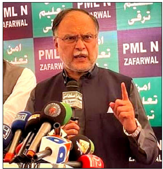
NAROWAL: Federal Minister for Planning and Development Ahsan Iqbal talking to media persons.

Different devices and gadgets were recovered from the students, which they were using for cheating in the entry test, he added. Necessary action is being taken against the students who were caught while cheating in the medical entry test, the Vice Chancellor of BUMHS informed.