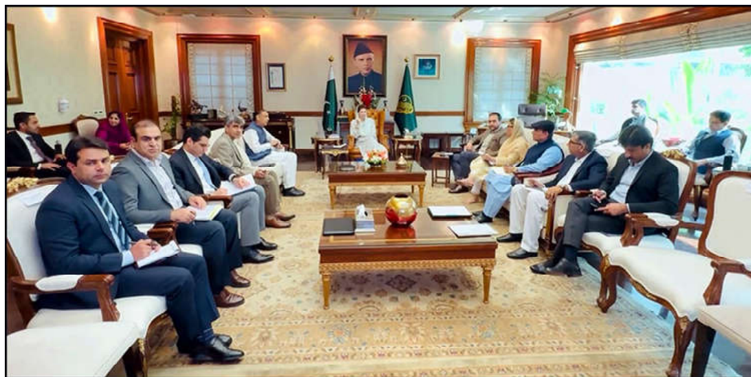
LAHORE: Punjab Chief Minister Maryam Nawaz Sharif presides over the high level meeting regarding transforming Agriculture in Punjab.

He reaffirmed the PPP's commitment to continue advocating for democracy, the constitution, and the rule of law, saying that the legal community stands alongside the party in this mission. The lawyers expressed their appreciation for Governor Kundi's leadership, saying that the central leadership of the party has entrusted an excellent individual with the Governor's responsibilities.