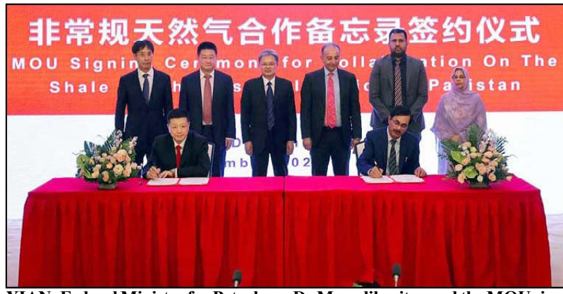
XIAN: Federal Minister for Petroleum Dr Musadik witnessed the MOU signing ceremony between OGDCL and Chinese company CCDC in Xian, China.

ISLAMABAD (INP): Pakistan with an aim to alleviate energy needs of the country through indigenous resources. Federal Minister for Petroleum, Dr. Musadik Malik, in Xi'an, Shaanxi Province, China, witnessed the MoU signing ceremony during the ongoing 8th Silk Road International Expo for Investment and Trade, according to a news release received here. The MoU highlights the commitment of both countries to developing Pakistan's shale and tight gas potential, aiming to address the country's energy needs through indigenous resources.