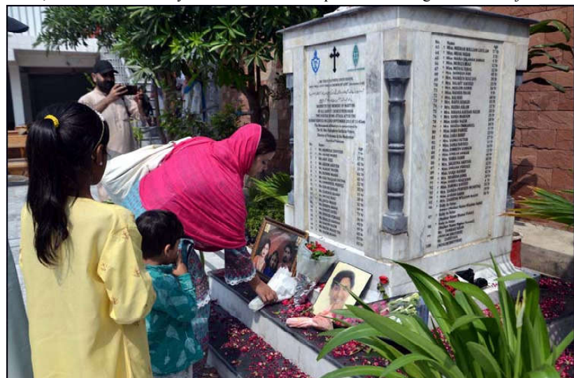
PESHAWAR: A special ceremony was organized in connection of 11 years of two suicide bombings in the year 2013 at the famous All Saints Church Kohati Gate in Peshawar