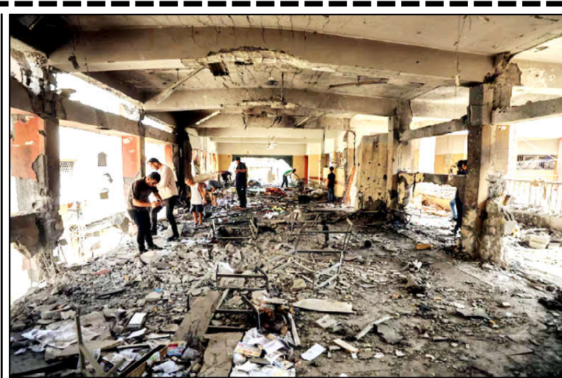
Palestinians inspect the damage to a school sheltering displaced people after it was hit by an Israeli strike, amid the Israel-Hamas conflict, at Beach refugee camp in Gaza City.

The Israeli military accuses Hamas of hiding in school buildings where many thousands of Gazans have sought shelter — a charge denied by the Palestinian group. Hamas on Saturday condemned the strike on Al-Zeitun School C, describing it in a statement as "a war crime under American cover", a reference to Washington being Israel's most important military backer.