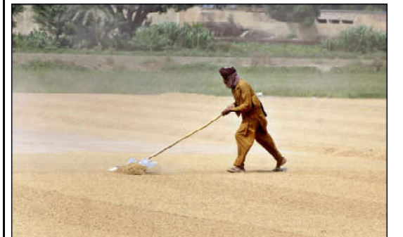
MULTAN: Labourer is busy spreading raw rice for drying in the field.

According to sources, IPPs did not generate as much electricity as they imported fuel and also received billions of rupees subsidy from the government.