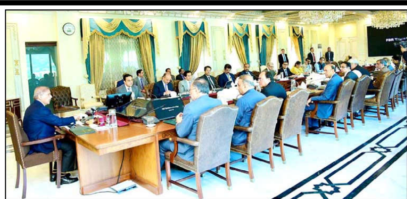
ISLAMABAD: Prime Minister Muhammad Shehbaz Sharif chairs a meeting on transformation plan of Federal Board of Revenue.