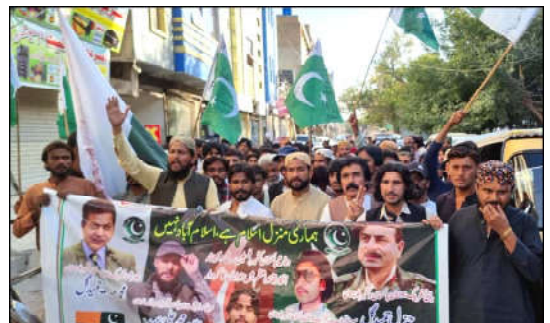
QUETTA: Members of Tehreek-e-Jawan-e-Pakistan are holding rally in favor of Pakistan Armed Forces, at Quetta press club.