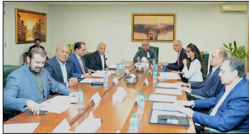
Federal Minister for Privatisation, Abdul Aleem Khan presiding Privatisation Commission Board Meeting in Islamabad.