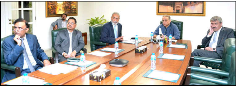
ISLAMABAD: Federal Minister Communications, Privatization & Board of Investment Abdul Aleem Khan presides over high level meeting of NHA.

mentation of amendment ordinance 2024 whatever proceedings of the judiciary is, its draft will be prepared and proceedings of the judiciary will be available for the people. Supreme Court Practice and Procedure amendment ordinance is aimed at bringing more transparency in court's process. A committee was constituted under Practice and Procedure act-2023. Improvement is being brought in the committee to ensure hearing of the cases on merit and their disposal. Under new amendment ordinance, Chief Justice can nominate any learned judge member of committee in case of non availability of some member. Meanwhile Federal Minister for Information, Broadcasting, National Heritage and Culture Attaullah Tarar said on Friday that the promulgation of Ordinance on Practice and Procedures Act will further improve transparency in the judicial process. Talking to the media here, he said an ordinance for amendment in the Practice and Procedures Act has been promulgated by the President after approval from the federal cabinet. He said that from now on, the case that comes first would be taken up first by the court and the cases coming after would be fixed on their number.