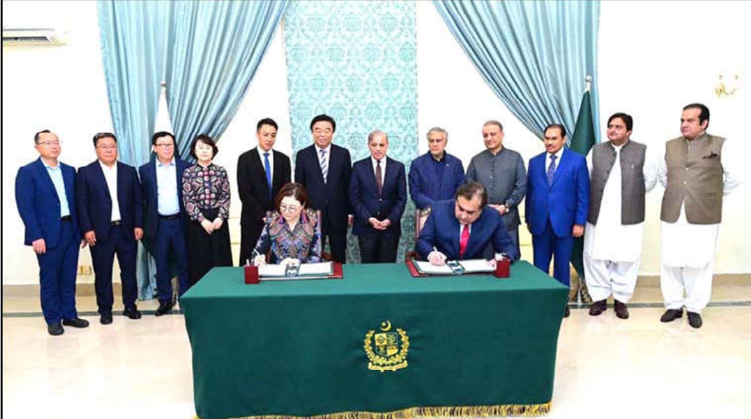
ISLAMABAD: Prime Minister Muhammad Shehbaz Sharif witnesses signing of an MoU between Board of Investment and RUYI Shangdong.

Ph: 2841470/2841473 Vol: XX No. 71, Rabi-ul-Awwal 16, 1446 AH Saturday September 21, 2024, Pages 04, Price Rs.15