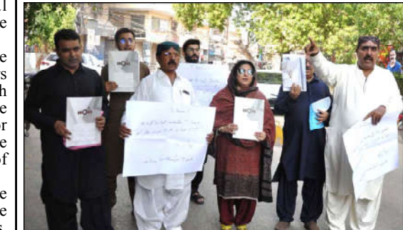
HYDERABAD: Allottees of Shams Icon Plaza are holding protest demonstration for demanding possession, at Hyderabad press club.

The ongoing projects include the construction of the six kilometer-long Hayatabad Jogging and Cycling Track in the provincial capital, the renovation and construction of Peshawar Zoo Road (Palosi Road), the Iqra Chowk Island on University Road, the Park Avenue Island on University Road, and the construction of the Walkway Town Market. Additionally, several projects have been completed at the historic University of Peshawar, including the renovation of the university, repair and construction of the main roads, flooring of key areas, construction of public washrooms, and modern parking facilities.