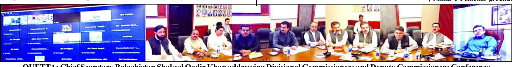
QUETTA: Chief Secretary Balochistan Shakeel Qadir Khan addressing Divisional Commissioners and Deputy Commissioners Conference

Independent Report QUETTA: The Chief Secretary Balochistan, Shakeel Qadir Khan has exhorted all officers to speed up measures for bringing improvement in the service delivery in their respective departments so that people may get all basic facilities at their doorstep. The Chief Secretary was presiding over the Divisional and Deputy Commissioners here on Friday. The meeting discussed about the overdue cases on IPMS, prevention of smuggling, provision of quality education and healthcare facilities, price control, recruitment of the teachers and solarization of agricultural tube wells in the province. Those who were also present in the meeting were included: Additional Chief Secretary Home, Shahab Ali Shah, Secretary Forests and Wildlife, Dostain Khan Jamaldini, Secretary Social Welfare, Abdul Rehman Buzdar, Secretary Industries, Durra Baloch, Secretary Transport, Muhammad Hayat Kakar. The Divisional Commissioners and Deputy Commissioners participated in the meeting through video link.