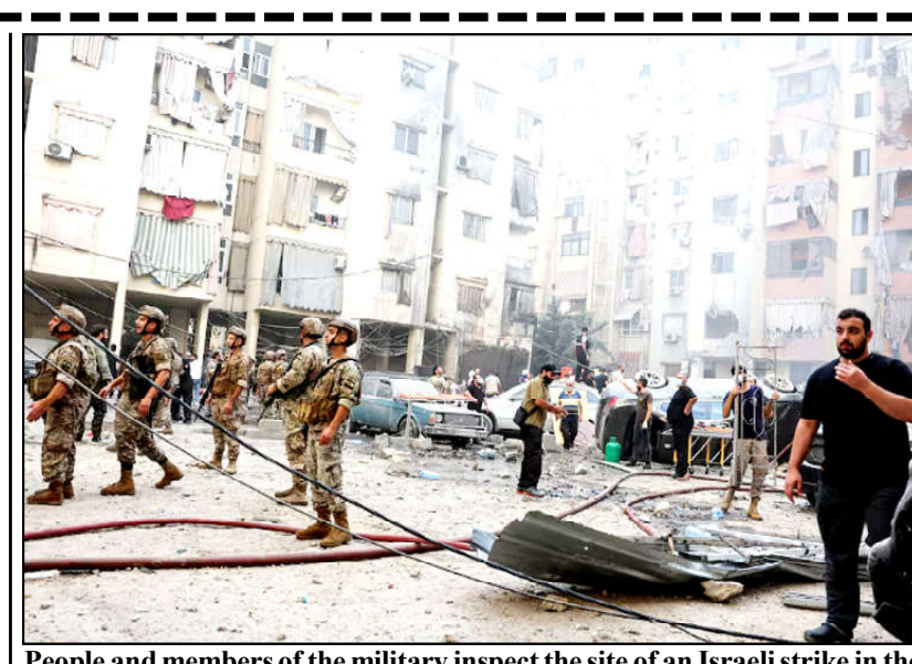
People and members of the military inspect the site of an Israeli strike in the southern suburbs of Beirut, Lebanon.

The Israeli military said it had conducted a "targeted strike" in Beirut, without giving further details. It marks the second time in less than two months that Israel has targeted a leading Hezbollah military commander in Beirut. In July, an Israeli airstrike killed Fuad Shukri, the group's top military commander. Aqil has a $7 million bounty on his head from the United States over his link to the deadly bombing of Marines in Lebanon in 1983, according to the U.S. State Department website.