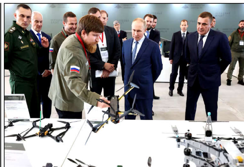
Russia's President Vladimir Putin visits a drone production facility of the Special Technology Centre in Saint Petersburg, Russia.

laden with explosives. For just a few hundred dollars, soldiers on both sides can inflict vast damage on the other side. A large-scale Ukrainian drone attack on Russia triggered an earthquake-sized blast at a major arsenal in the Tver region on Wednesday. Putin said that Russia was making almost weekly advances in drone technology and needed to also develop its drone defences, essentially technology which senses, confuses and then shoots down the attacking drones. "The key task is to produce a wide range of aerial unmanned vehicles, to establish serial production as quickly as possible," Putin said. The Reuters Daily Briefing newsletter provides all the news you need to start your day. Sign up here.