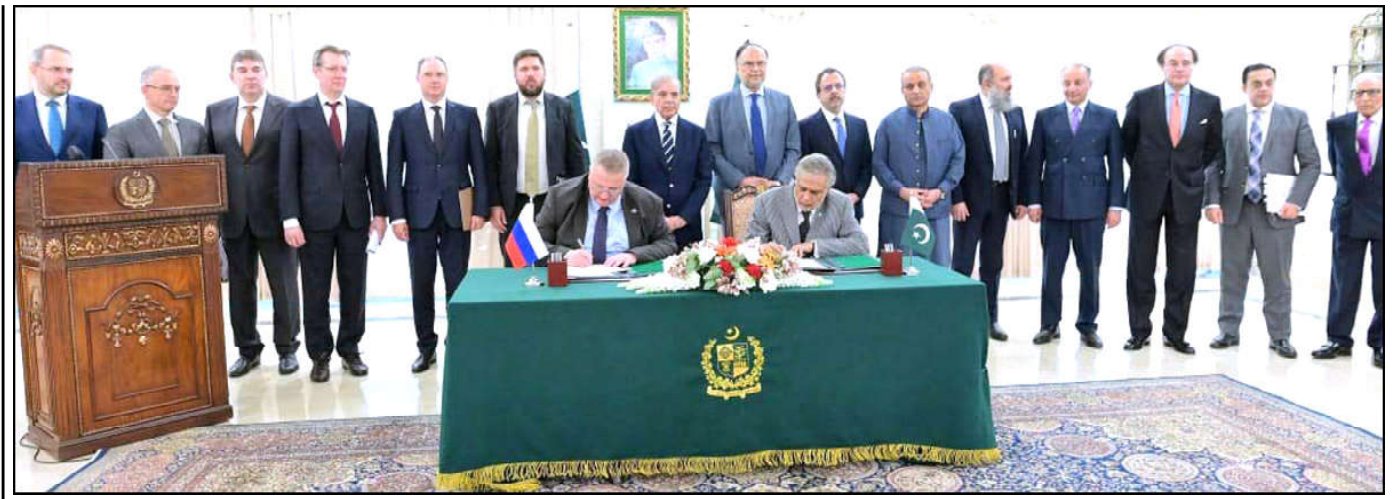
ISLAMABAD: Prime Minister Muhammad Shehbaz Sharif and Deputy Prime Minister of Russian Federation witness signing of a Memorandum of Understanding between Pakistan and Russia to increase cooperation in different fields.