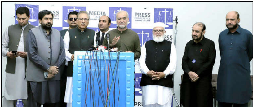
LAHORE: Ameer Jamaat-e-Islami Hafiz Naeem-ur-Rehman and former President and PTI Senior Leader Dr. Arif Alvi talking to media persons.