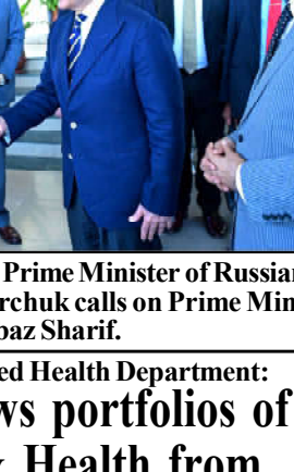
ISLAMABAD: Deputy Prime Minister of Russian Federation, Alexei Overchuk calls on Prime Minister Muhammad Shehbaz Sharif.

ISLAMABAD: Pakistan Peoples Party (PPP) Chairman Bilawal Bhutto-Zardari has reiterated his party's long-standing demand for judicial reforms, emphasising the need for a constitutional court to ensure a fair judicial system. Speaking to representatives of lawyers across the country on Thursday, Bilawal praised the legal community for their resistance against dictatorships, particularly in defeating General Musharraf's regime. "Lawyers have always stood firm against dictators, and their struggle led to the downfall of Musharraf's dictatorship," he said. Bilawal highlighted the views of his late mother, Benazir Bhutto, who believed that judges should avoid political activism. "She used to say that if judges want to lead rallies, they should form a political party. She knew that political involvement by the judiciary would harm the public," he remarked. He also recalled the PPP's commitment to the Charter of Democracy.