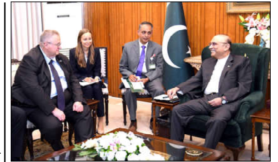
ISLAMABAD: President Asif Ali Zardari in a meeting with the visiting Deputy Prime Minister of Russia, Alexei Overchuk, at Aiwan-e-Sadr.