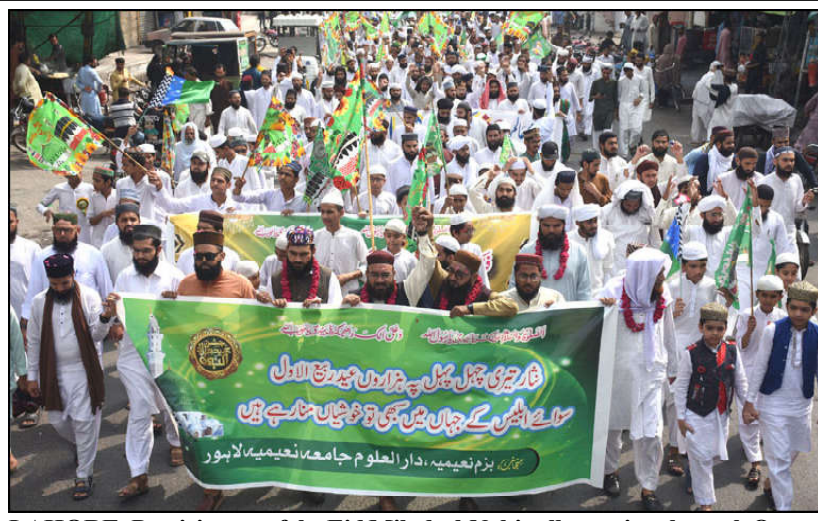
LAHORE: Participants of the Eid Milad-ul-Nabi rally passing through Queen Mary Road.

The Supreme Court's ruling addresses the allocation of reserved seats, specifying that these seats should be distributed between PTI and the Sunni Ethad Council. The Commission, therefore, faces the imperative to execute this decision without further delay. The court's explanatory decision has criticized the Commission's request for clarification as a deliberate attempt to obstruct the execution of judicial ruling.