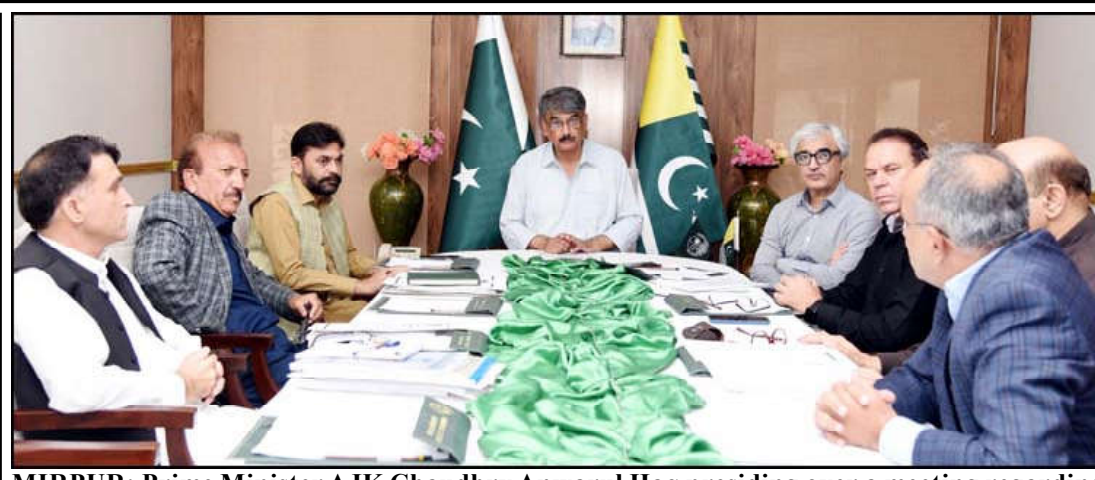
MIRPUR: Prime Minister A.J.K. Chaudhry Anwarul Haq presiding over a meeting regarding A.J.K. University.

The Chief Minister of Khyber Pakhtunkhwa, Ali Amin Khan Gandapur, along with Provincial Minister Auqaf Sahibzada Adnan Qadri and other dignitaries.