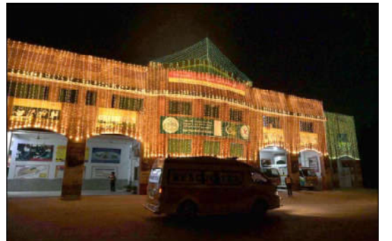
SARGODHA: A beautifully decorated Rescue 1122 building in celebration of 12th Rabi-ul-Awwal.