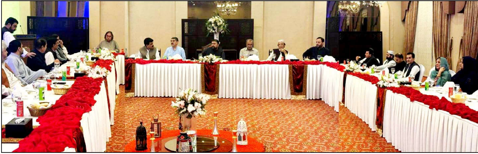
ISLAMABAD: MNAs, MPAs and Senators belong to Balochistan attending a dinner hosted by Chief Minister Balochistan Mir Sarfaraz Ahmed Bugti

Ph: 2841470/2841473 Vol: XX No. 67, Rabi-ul-Awwal 11, 1446 AH Monday September 16, 2024, Pages 04, Price Rs.15