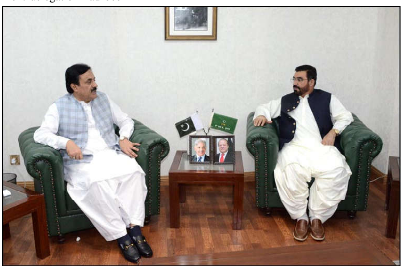
ISLAMABAD: Balochistan Minister Mir Asim Kurd Gailo meeting with Deputy Chairman Senate Syedaal Khan Nassar