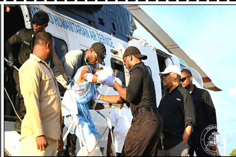
Haiti Prime Minister Garry Conille looks on, as an injured victim who was evacuated to receive medical care following a fuel truck explosion exits a helicopter, in Port-au-Prince, Haiti.

"And that would be it. A giant, grey, melted spot instead of 'the mother of Russian cities,'" he wrote on the Telegram messaging app, referring to Kyiv.