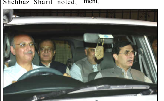
ISLAMABAD: PTI delegation arriving for meeting with JUI(F) chief Mulana Fazlur Rehman at his residence, in the Federal Capital.

ISLAMABAD (APP): As many as 150 business delegates from Pakistan have participated in the World Trade Conference (WTC) in Beijing in which Federal Minister of Commerce Jam Kamal Khan and Federal Minister for the Investment Board Abdul Aleem Khan addressed the conference via video link. They highlighted that Pakistan's Prime Minister Mian Shabbaz Sharif's June-2024 visit to China had begun yielding results.