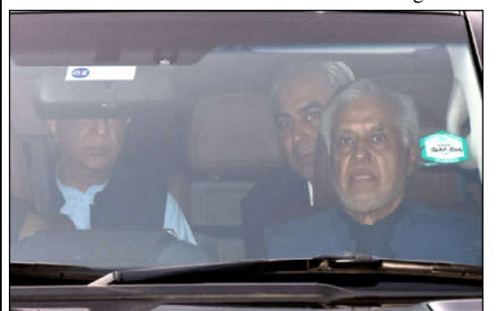
ISLAMABAD: Deputy Prime Minister Ishaq Dar, Interior Minister Mohsin Naqvi leaving Mulana Fazlur Rehman residence after the meeting with JUI(F) chief Mulana Fazlur Rehman

ISLAMABAD (INP): Finance Minister Muhammad Aurangzeb has said that the country will secure an extended International Monetary Fund (IMF) programme on September 25. Speaking at the CFA Society of Pakistan's 21st Annual Excellence Awards, Aurangzeb expressed hope that it will be the country's final IMF programme. However, he warned that failure to sustain reforms might lead to a 25th programme. His remarks come as Islamabad reached an agreement with the Washington-based lender on a $7 billion 37-month loan programme in July earlier this year. However, the future of the bailout package is subject to the approval of the Fund's executive board which is set to convene on September 25 with Pakistan included in its meeting agenda. The country was required to secure external financing of $2 billion from bilateral and commercial lenders as a pre-requisite for the IMF board's approval. It is to be noted that Pakistan owes $5 billion to Saudi Arabia in the form of cash deposits, along with $4 billion and $3 billion from China and the United Arab Emirates (UAE), respectively. Speaking on the occasion, the finance minister stressed the need for macroeconomic stability and said that Pakistan has previously experimented with various economic models, none of which yielded the desired results.