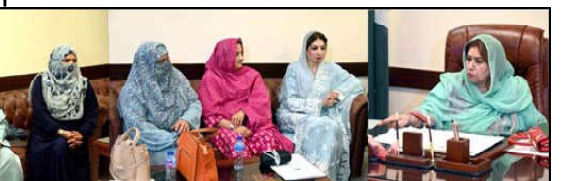
QUETTA: Parliamentary Secretaries and MPAs meeting with Deputy Speaker Balochistan Assembly Ghazala Gola

ISLAMABAD (Online): The process of repatriation of the illegal Afghan nationals to their homeland is underway in a dignified manner. According to latest statistics, the total number of illegal Afghan nationals who were repatriated till yesterday has reached more than seven hundred thirteen thousand. Twenty-one thousand one hundred and ninety three Afghan nationals including 7843 men, 6012 women and 7338 children left the country from 17th August to 09th of September.