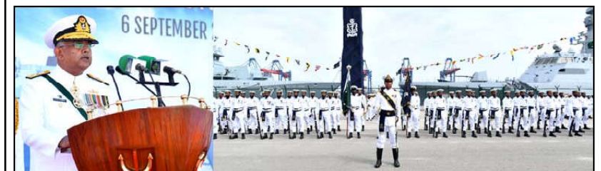
Chief of the Naval Staff Admiral Naveed Ashraf addressing the audience at the Induction Ceremony of PNS BABUR and PNS HUNAIN held at PN Dockyard, Karachi.