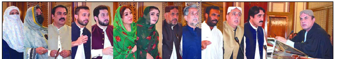
QUETTA: Provincial Ministers, Parliamentary Secretaries and MPs expressing their views on point of order during Balochistan Assembly session

He expressed deep concern over the increased