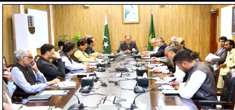
RAWALPINDI: Federal Minister for Planning, Development, and Special Initiatives Ahsan Iqbal chairs the first meeting of the Planning Commission's Policy Board.