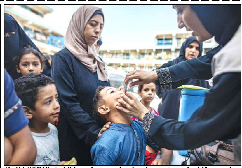
GAZASTRIP: A child receives vaccination drops at a makeshift camp in a school at Khan Yunis for people displaced by the Israeli aggression.