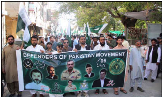
QUETTA: Members of Defenders of Pakistan Movement are holding rally to pay homage to the Ghazis and Shuhada of 06 September 1965 Indo-Pak War on the occasion of Defence Day of Pakistan, at Quetta press club.