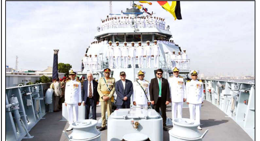
KARACHI: President Asif Ali Zardari in a group photo with senior military officials and crew of Pakistan Navy Ship Hunain during its induction ceremony.

"We cannot repay the debt owed to these martyrs. We pray for their elevated ranks. The Pakistani nation is indebted to its martyrs," Khawaja Asif remarked.