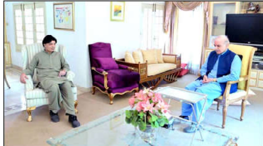
ISLAMABAD: Prime Minister Muhammad Shehbaz Sharif offering condolences to Chaudhary Nisar Ali Khan on the demise of his sister.

major private organizations, corporate leaders, and experts from various fields. On this occasion, Federal Minister said the board members will play a key role in preparing the strategy framework as well as making multi-term, mid-term and long-term plans and the government considers the formation of the policy board as an important milestone and through it the goals of sustainable development will be achieved. Ahsan Iqbal added that the government has set up a policy board to ensure the implementation of the Five Ease Framework, Thirteenth Five Year Plan, and Vision 2030. Key areas such as exports, digital development, environment, energy and equity have been prioritized under this framework.