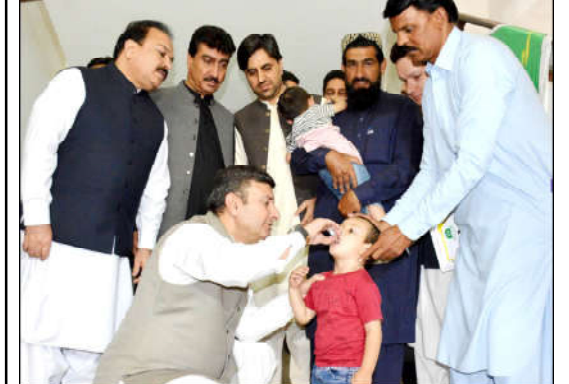
QUETTA: Chief Secretary Balochistan Shakeel Qadir Khan administering polio drop to a child to formally inaugurate anti-polio campaign

According to sources, the terrorists attempted to infiltrate the Civil Administration Colony. Security forces engaged the terrorists, resulting in their elimination. Sources further indicate that a clearance operation is currently underway in the area.