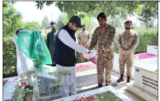
RAWALPINDI: Federal Minister for Overseas Pakistanis and Human Resource Development Chaudhry Salik Hussain visited Army Graveyard to pay tribute to the unwavering bravery and ultimate sacrifices of armed forces in Racecourse.