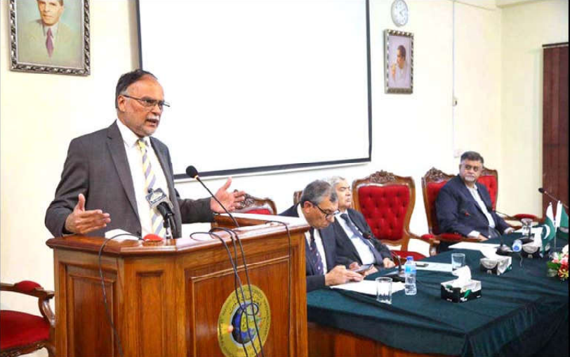
ISLAMABAD: Federal Minister for Planning, Development and Special Initiatives, Prof. Ahsan Iqbal, addressing a symposium on "Climate Change and Health Development Consequences in Pakistan at the Pakistan Academy of Sciences.