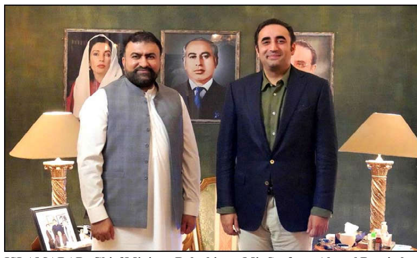
ISLAMABAD: Chief Minister Balochistan Mir Sarfraz Ahmed Bugti photographed with Chairman PPP Bilawal Bhutto Zardari.

ISLAMABAD (INP): Federal Minister for Law Azam Nazeer Tarar says Chief Justice of Pakistan Qazi Faez Isa is not interested in extension of his tenure. Speaking to media in Islamabad, Tarar clarified