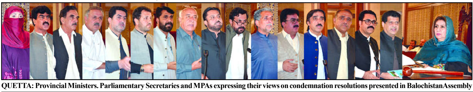
QUETTA: Provincial Ministers, Parliamentary Secretaries and MPs expressing their views on condemnation resolutions presented in Balochistan Assembly

ISLAMABAD (Agencies): Seeking an amendment to the Supreme Court (Number of Judges) Act, 1997, a bill was tabled in the Senate on Monday to increase the number of judges in the Supreme Court to 20 other than the chief justice — to "address the rising number of pending cases". The bill titled "Supreme Court (Number of Judges) (Amendment) Act", 2024, was presented by an independent senator from Balochistan, Mohammad Abdul Qadir. He sought the increase in the number of top court judges from 17 to 21 as "more than 53,000 cases" pending in the apex court.