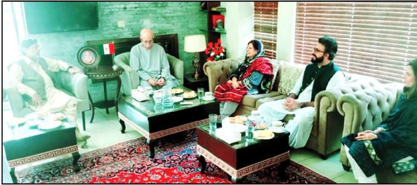
ISLAMABAD: Former caretaker Prime Minister Mian Muhammad Soomro along with his family meeting with Chairman PkMAP and Chairman Tehreek Tahafuz-e-Ain Pakistan Mehmood Khan Achakzai