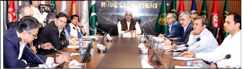
LAHORE: Provincial Health Minister and Chairman of the Cabinet Committee for Law and Order Khawaja Salman Rafique chairs 12 th Law and Order meeting at Home Department.

Rafique emphasized that foolproof security measures will be implemented for the by-elections scheduled for September 12 in Rahim Yar Khan. "Approval has been granted to deploy three companies of the Army and Rangers in the area. Additionally, extraordinary security preparations are in place for the cricket series with Bangladesh. Efforts will be relentless in maintaining peace and order in Punjab. Those disrupting public order will be dealt with firmly, and operations will persist until the last terrorist in the Kacha area is eliminated."