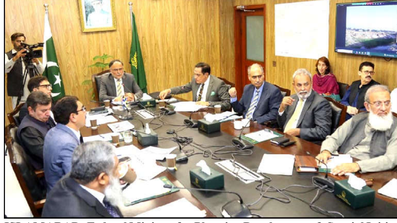
ISLAMABAD: Federal Minister for Planning Development & Special Initiatives Prof. Ahsan Iqbal chairing a meeting to review the progress of Public Sector Development Programme (PSDP) projects in Balochistan.

the nights of August 25 and 26. These incidents included the gory incident of Musa khail which took place at Rad sham area in which 23 innocent and armless citizens were mercilessly martyred after offloading them from the passenger buses and trucks. Some 35 vehicles were also set ablaze by the terrorists. In the resolution it was stated that these gory incidents are being condemned worldwide. The resolution strongly condemned the cowardly, terrorism and barbaric acts of the terrorist organization and the Baloch Yakjehti Committee which blocked the roads in the whole province causing agony to the people of areas. The House paid homage to personnels of security forces and law enforcement agencies on martyr-