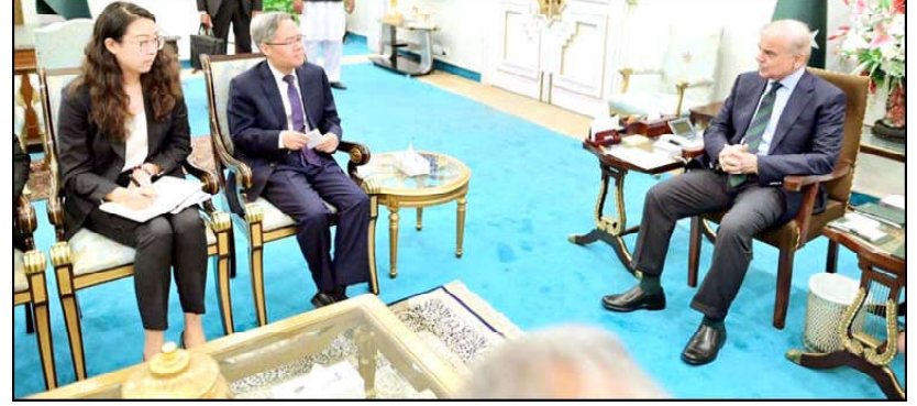
ISLAMABAD: Chinese Ambassador to Pakistan H.E. Jiang Zaidong calls on Prime Minister Muhammad Shehbaz Sharif.