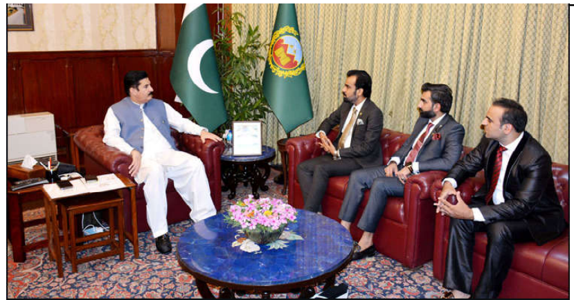
PESHAWAR: Governor Khyber Pakhtunkhwa Faisal Karim Kundi is called on by representative delegation of UK-Pakistan Trade & Investment Board at Governor House.