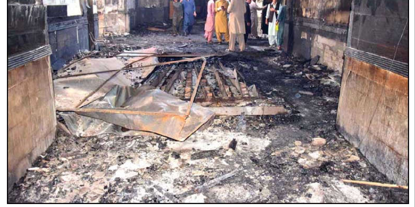
QUETTA: A view of damages due to fire at Science College