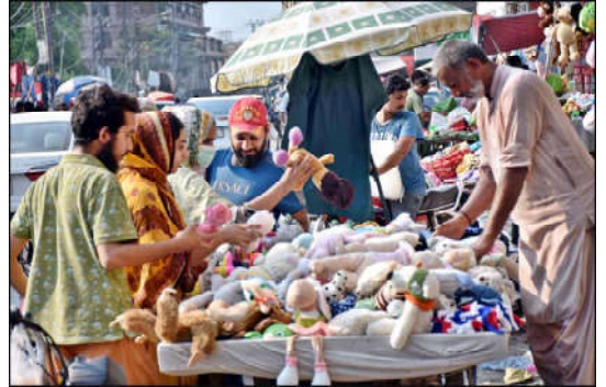
LAHORE: People selecting and purchasing second hand toys from roadside vendor in Provincial Capital.

To ensure a hasslehighlighting its potential to free experience for farmers, bring about a paradigm the authorities have implemented a smooth registration procedure for In a bid to make the the Kissan Card.