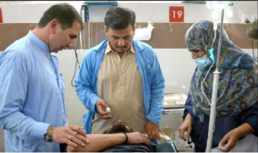
QUETTA: An injured of explosion near a security forces check post at Chaman Phatak being treated at Civil Hospital.

joint deportations. He applications in Austria. Austria's Ministry of the Interior and the Federal Office for Foreign Affairs are actively working to terpart to find solutions for implement deportations to Afghanistan, with ongoing ian nationals. The next discussions involving sevto eral European countries.