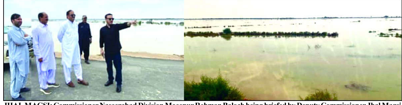
JHAL MAGSI: Commissioner Naseerabad Division Moeenur Rehman Baloch being briefed by Deputy Commissioner Jhal Magsi Syed Rehmatullah Shah about flood affected areas

Properties, including house and lands, of the five Kashmiris were attached and eight Kashmiri Muslim employees were suspended from their government services by the New Delhi-controlled Bharatiya Janata Party regime