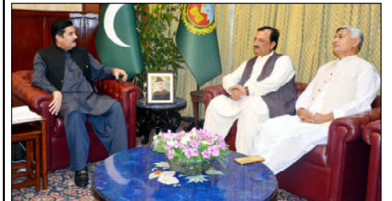
PESHAWAR: Former Federal Minister for State Tasneem Ahmed Qureshi and Former MNA Mehmoond Hayat meeting with Khyber Pakhtunkhwa Governor Faisal Karim Kundi at Governor House.

LAHORE (APP): Nineteen people were killed and 1,353 others injured in 1,302 road accidents in Punjab during the last 24 hours. As many as 570 people with serious injuries were shifted to different hospitals, while 783 with minor injuries were treated at the incident site by the rescue medical teams. The data analysis showed that 756 drivers, 44 underage drivers, 146 pedestrians, and 470 passengers were among the victims of road crashes. The statistics showed that 264 accidents were reported in Lahore, which affected 278 people, placing the provincial capital at top of the list.