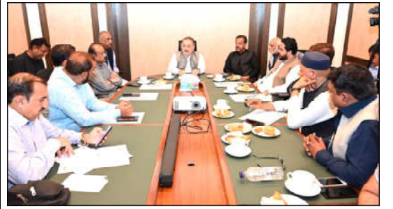
KARACHI: Sindh Senior Minister Sharjeel Inam Memon, in a meeting with a delegation of Khyber Pakhtunkhwa journalists.

"The demand from government whips was that they represent two-thirds, while the opposition is one-third. The opposition must have its voice here in Parliament," Sadiq remarked.