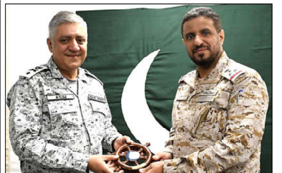
BAHRAIN: Royal Saudi Naval Forces (RSNF) delegation, led RSNF Maritime Component Commander, Commodore Othman Oqab Al Zahrani called on CCTF 150 Commodore Asim Sohail Malik of Pakistan Navy Bahrain.

Highlighting public sector healthcare services in Sindh which according to him were benefiting not only residents of Pakistan but also of other countries, Sharjeel Memon said "In Sindh, no health or identity card is required for treatment—hospitals serve everyone, from all across Pakistan." Millions of people were receiving free treatment at the NICVD, equipped with the CyberKnife technology and Gambat Hospital offers free liver transplants while Sindh government provides a grant of Rs 5 billion to Indus Hospital as well, he added.