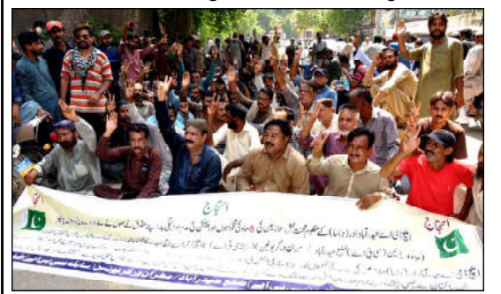
HYDERABAD: Members of HDA Labour Union are holding protest demonstration against non-payment of their salaries, at Hyderabad press club.

ISLAMABAD (APP): European Union's Special Envoy for the Promotion of Religion and Belief Frans van Daele on Wednesday called on Minister for Religious Affairs and Interfaith Harmony, Chaudhry Salik Hussain to discuss the growing global concerns over religious intolerance, terrorism, sectarianism, and the promotion of peace and interfaith harmony. During the meeting, both the dignitaries expressed their commitment to collaborate in combating religious intolerance and fostering a peaceful future. Minister Salik highlighted Pakistan's dedication to protecting the rights of minorities, stating that a comprehensive policy on interfaith harmony had been formulated and submitted to the Federal Cabinet for approval. He emphasized that Pakistan was resolute in promoting religious tolerance. "Over 700 scholars representing various religions and sects have endorsed the Paigham-e-Pakistan document," the minister said, adding that "no individual is permitted to take the law into their hands in the name of religion".