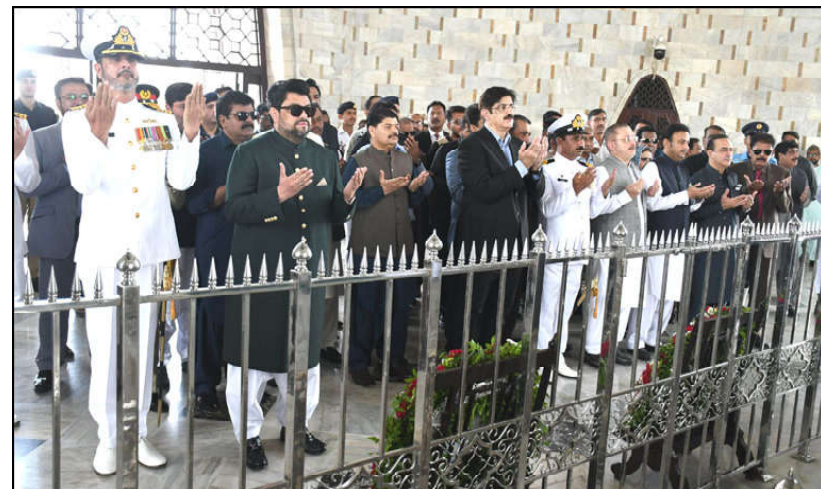
KARACHI: Government officials pray inside the mausoleum of the founder of the nation Quaid-i-Azam Mohammad Ali Jinnah to mark his death anniversary in Karachi, Pakistan. The 76th death anniversary of Quaid-i-Azam Muhammad Ali Jinnah was observed throughout the country with reverence and solemnity.

The floods have swept through southern Pakistan, damaging over 1,300 schools, and fully destroying 228 of them. In addition, more than 450 schools are not operational because they are surrounded by floodwater, according to recent data from Sindh's Education Department. The immediate consequence is that many children are missing out on their education. Sindh is no stranger to such climate-related disruptions. The government has already announced an education emergency, with 26.2 million children out-of-school nationwide.