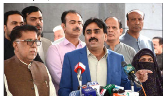
QUETTA: Sindh Irrigation Minister, Jam Khan Shoro along with Balochistan Minister for Irrigation Mir Sadiq Umrani addressing a press conference.

It was decided in the meeting that the committee formed by the Chief Minister would prepare viable proposals after consultation with the Provincial Ministers for Irrigation of Sindh and Balochistan on its final review report.