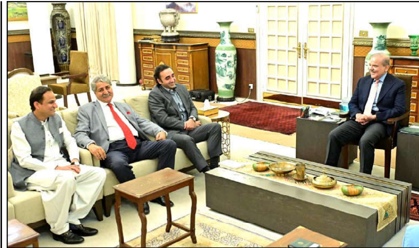
Chairman Pakistan Peoples Party Bilawal Bhutto Zardari calls on Prime Minister Muhammad Shehbaz Sharif, Syed Naveed Qamar and Mayor Karachi Murtaza Wahab were also present in the meeting in Islamabad.

Side by side raising the matter of their imprisoned leaders, the opposition must also take up more pressing issues being faced by the people such as unemployment, inflation, education, health, and terrorism, he added. Their chief minister did no service to the people of his province (Khyber Pakhtunkhwa) by abusing the media persons and opposition, and threatening the Anti-Terrorism Court judges, he added.