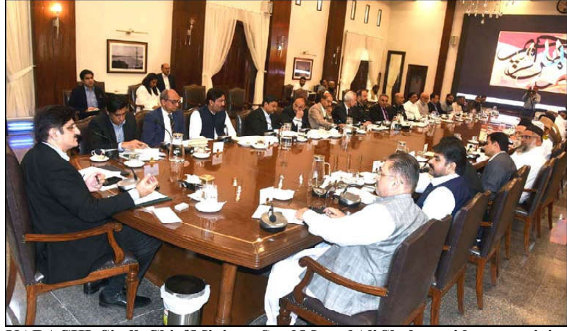
KARACHI: Sindh Chief Minister, Syed Murad Ali Shah presides over a joint meeting of religious leaders and the administration regarding the arrangements of Eid Milad-un-Nabi, held at CM House in Karachi.