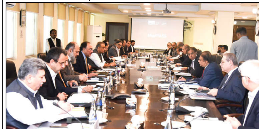
ISLAMABAD: Federal Minister for Finance and Revenue Senator Muhammad Aurangzeb chaired the meeting of the Economic Coordination Committee (ECC) at the Finance Division.

The government was facilitating the private sector to ensure creation of employment opportunities in the province.