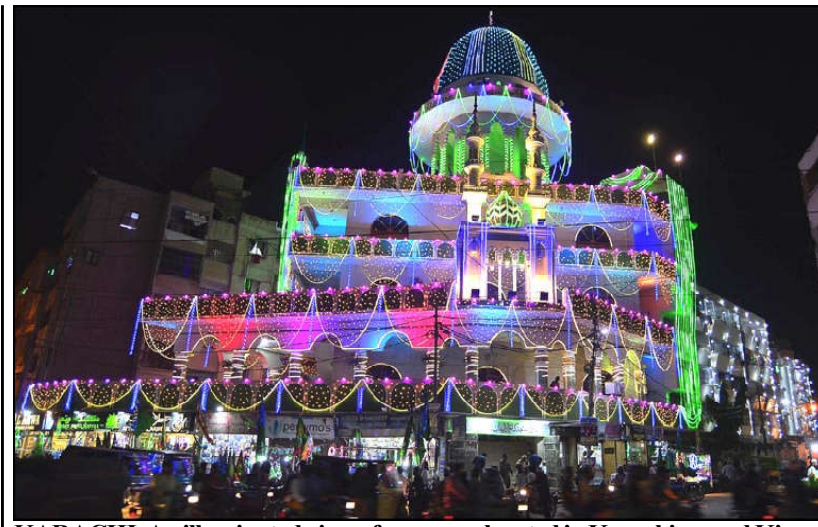
KARACHI: An illuminated view of a mosque located in Karachi named Kinzul Eman, decorated with colorful lights in connection with upcoming Eid-e-Milad-un-Nabi (SAWW) celebrations.