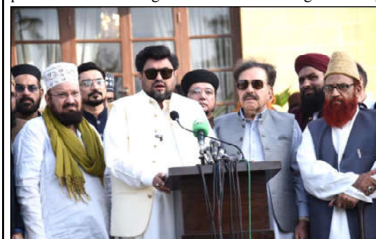
KARACHI: Governor Sindh Kamran Khan Tessori along with Governor Balochistan Sheikh Jaffar Khan Mandokhail and Ulama talking with mediemen about 12th Rabi-ul-Awwal.

The minister, while talking to different delegations who called on him here, said that Sindh government has always stood