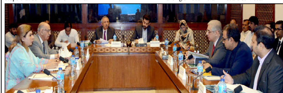
Senator Shahadat Awan presides over a meeting of the Senate Standing Committee on Interior at Parliament House Islamabad.

A water harvesting system will be installed along with a reservoir to promote sustainable water use and management. The retaining walls of the terraces will remain but concrete inside will be removed for plantation. There will also be a small Emergency Response Facility with an area for quick response and first aid services.