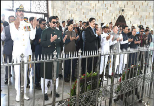
KARACHI: Sindh Chief Minister, Syed Murad Ali Shah along with Governor Sindh, Kamran Khan Iqbal and others paying homage to Quaid-e-Azam Muhammad Ali Jinnah on his death anniversary

ISLAMABAD (APP): A Prime Minister Shehbaz Sharif says Pakistan People's Party is an important ally, which has always supported the government's every step to strengthen national economy. He was talking to a delegation of Pakistan People's Party, which called on him in Islamabad today under the leadership of party Chairman Bilawal Bhutto Zardari. During the meeting, overall political situation of country came under discussion. The Prime Minister appreciated the proposal of "Charter of Parliament" presented by Bilawal Bhutto Zardari in the Parliament saying that it will further strengthen democracy and the Parliament. The PPP delegation commended the economic policies of the government to strengthen the country's economy. The PPP delegation also expressed full confidence in the government's policies and initiatives, which was welcomed by the Prime Minister. Deputy Prime Minister and Foreign Minister Mohammad Ishaq Dar, Minister for Law and Justice Azam Nazeer Tarar, Minister for Information and Broadcasting Attaulah Tarar, PPP leaders Syed Naveed Qamar and Mayor Karachi Murtaza Wahab and Attorney General were also present in the meeting.