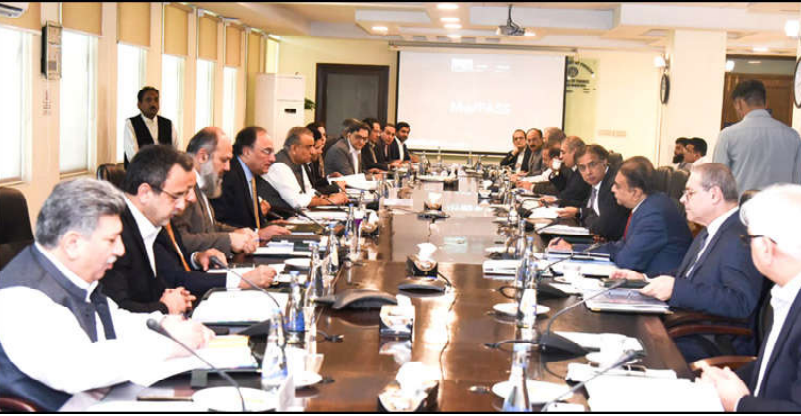
ISLAMABAD: Federal Minister for Finance and Revenue Senator Muhammad Aurangzeb chaired the meeting of the Economic Coordination Committee (ECC) at the Finance Division.