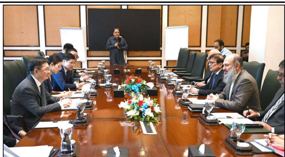
ISLAMABAD: Federal Minister for Commerce, Jam Kamal Khan, in a meeting with Vice Minister of Commerce, People's Republic of China, Ling Ji on sidelines of the SCO Ministerial Conference.

sectors. During the discussion, Senator Aurangzeb outlined Pakistan's positive economic trajectory, citing key indicators such as currency stabilization, reduced inflation, a surge in remittances, prudent management of the current account deficit, and foreign exchange reserves sufficient to cover two months of imports. On the occasion, Nawaf Bin Said Al-Malki commended the government's efforts in implementing structural and institutional reforms.