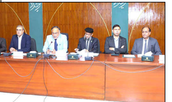
ISLAMABAD: The Federal Minister for Planning, Development, and Reforms, Ahsan Iqbal, presiding over the annual review meeting of the Public Sector Development Programme (PSDP) 2023-24.

ISLAMABAD (APP): Minister for Planning, Development and Special Initiatives Professor Ahsan Iqbal on Wednesday said the incumbent government was making its best possible efforts to create a balance between available resources and existing expenditures aimed at avoiding the debt quagmire. "Without creating this balance, it will be impossible to come out of it, if stuck," the minister said in a televised address during a meeting he chaired on projects executed under the Public Sector Development Program (PSDP). He said if the development budget relied on borrowed money, it was the responsibility of everyone to ensure its transparent utilization, without allowing any leakage or misuse. Ahsan Iqbal directed all Principal Accounting Officers to exercise zero tolerance against any leakage or misuse of the resources allocated for development projects. "Funds must be utilized for their intended purpose," he stressed.