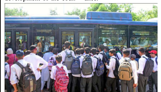
ISLAMABAD: Blue Metro service denied entry of students, causing delays in reaching home.

He said that the state has a responsibility to create opportunities for the younger generation, adding that he personally ensures that his daughter will receive her full share of the inheritance.