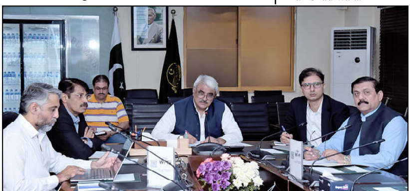
LAHORE: Punjab Minister for Health Khawaja Salman Rafique chairs special meeting at Specialized Healthcare and Medical Education Department.

LAHORE (APP): Nineteen people were killed and 1,353 others injured in 1,302 road accidents in Punjab during the last 24 hours. As many as 570 people with serious injuries were shifted to different hospitals, while 783 with minor injuries were treated at the incident site by the rescue medical teams. The data analysis showed that 756 drivers, 44 underage drivers, 146 pedestrians, and 470 passengers were among the victims of road crashes. The statistics showed that 264 accidents were reported in Lahore, which affected 278 people, placing the provincial capital at top of the list.