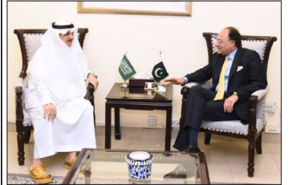
ISLAMABAD: Ambassador of the Kingdom of Saudi Arabia, Nawaf Bin Said Al-Malki, calls on Federal Minister for Finance and Revenue Senator Muhammad Aurangzeb at Finance Division.