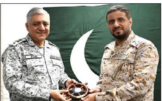
BAHRAIN: Royal Saudi Naval Forces (RSNF) delegation, led RSNF Maritime Component Commander, Commodore Othman Oqab Al Zahrani called on CTF 150 Commander Asim Sohail Malik of Pakistan Navy Bahrain.

ISLAMABAD (APP): The Royal Saudi Naval Forces (RSNF) delegation, led by the newly appointed RSNF Maritime Component Commander, Commodore Othman Oqab Al Zahrani, met with Commodore Asim Sohail Malik, the current Commander of Combined Task Force 150 (CTF 150), in Manama, Bahrain. The discussions focused on CTF 150's ongoing operations aimed at disrupting illicit activities in the Arabian Sea and ensuring maritime security in the region, a Pakistan Navy news release said. During the meeting, both commanders shared their perspectives on regional maritime security challenges and explored potential avenues for collaboration between CTF 150 and the upcoming RSNF Maritime Component Command to maintain security and stability in the region. They also reaffirmed the excellent relationship between the two navies, emphasizing their shared commitment to fostering regional peace. A comprehensive briefing on CTF 150 operations was given on the occasion, the RSNF delegation engaged with the entire Pakistan Navy team currently leading CTF 150 and exchanged views on viable options to counter contemporary maritime security challenges.