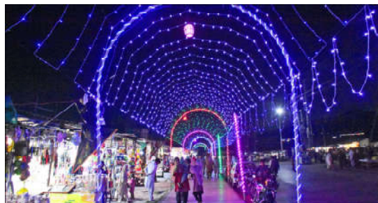
ISLAMABAD: An illuminated view of Bari Imam bazaar decorated with colorful lights in connection with Eid Milad-un-Nabi (SAWW), in the Federal Capital.

He highlighted that the desecration of Parliament affects everyone.