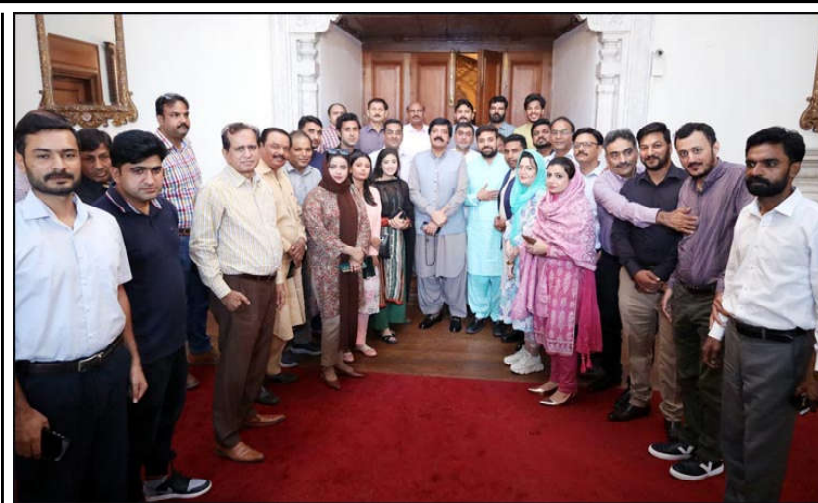
LAHORE: Governor Punjab Sardar Saleem Haider Khan in a group photo with beat reporters from electronic media at Governor House.

abandon the old behavior and adopt a reasonable approach. Governor Punjab praised the participation of the people in the recent celebration of Milad held at the Governor House. Governor Punjab said that collective efforts are needed to improve the country's conditions. He said that the politics of chaos and fighting is not in the national interest. While discussing the reorganization of the People's Party in Punjab, he said that he will meet with the leadership of Central Punjab in the near future to discuss the organizational issues.