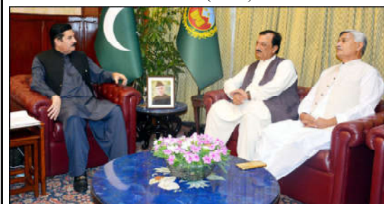
PESHAWAR: Former Federal Minister for State Tasneem Ahmed Qureshi and Former MNA Mehmoond Hayat meeting with Khyber Pakhtunkhwa Governor Faisal Karim Kundi at Governor House.

According to an ANF Headquarters spokesman, in an intelligence-based operation conducted at a courier office in Lahore, ANF recovered 37 kg Ice from a parcel containing ladies' handcrafted footwear booked for Australia.