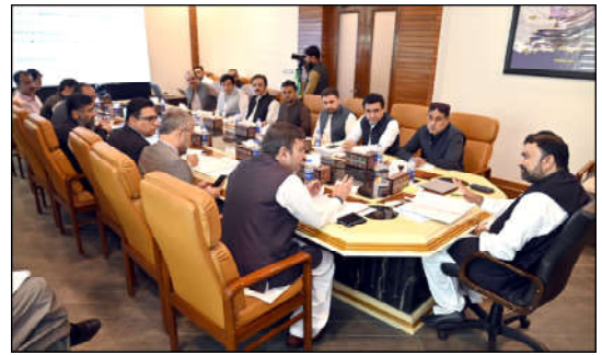
QUETTA: Balochistan Chief Minister Mir Sarfaraz Ahmed Bugti presiding over a meeting regarding Balochistan Institute of Cardiology, construction of new trauma center and other affairs

added. Attaulah Tarar said that Pakistan would host the Shanghai Cooperation Organization (SCO) Summit next month adding that it was imperative to revamp the English Channel. He added that the PTV World would become voice of Pakistan during the ECO Conference. To a question, he said that the government had announced Rs 37000 per month minimum wages during the federal budget. The minimum wage criterion has already been implemented in around 15 attached departments of the Ministry of Information and Broadcasting except PTV, he said.