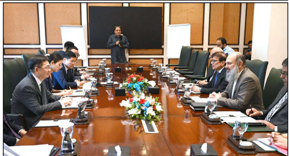
ISLAMABAD: Federal Minister for Commerce, Jam Kamal Khan, in a meeting with Vice Minister of Commerce, People's Republic of China, Ling Ji on sidelines of the SCO Ministerial Conference.

On the occasion, Nawaf Bin Said Al-Malki commended the government's efforts in implementing structural and institutional reforms.