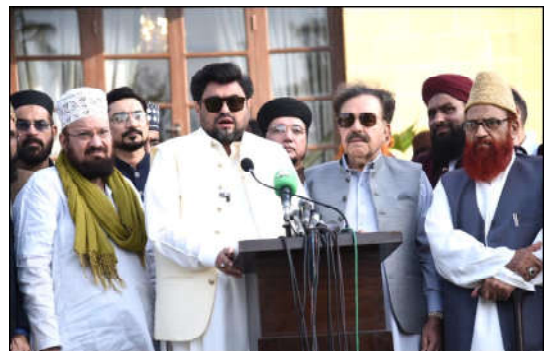
KARACHI: Governor Sindh Kamran Khan Tessori along with Governor Balochistan Sheikh Jaffar Khan Mandokhail and Ulema talking with mediemen about 12th Rabi-ul-Awwal.

These parliamentarians include Sher Afzal Marwat, Amir Dogar, Ahmed Chatta, Zain Qureshi, Zubair Khan, Waqas Akram Sheikh, Owais Haider, Ahad Ali Shah, Naseem Ali Shah, and Yousuf Khan. The orders direct that the detained members be delivered to the Sergeant-at-Arms before the session starts and returned to police custody afterward. PTI Chairman Buxtor Gohar confirmed that all detained MNAs will attend the session.