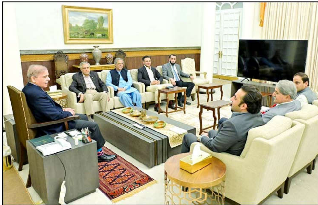
ISLAMABAD: Chairman Pakistan Peoples Party Bilawal Bhutto Zardari calls on Prime Minister Muhammad Shehbaz Sharif, Deputy Prime Minister and Foreign Minister Muhammad Ishaq Dar, Federal Minister for Law and Justice Azam Nazeer Tarar, Minister for Information and Broadcasting Attaulah Tarar, Syed Naveed Qamar and Mayor Karachi Murtaza Wahab and Attorney General were also present in the meeting

further strengthen democracy and the Parliament. The PPP delegation commended the economic policies of the government to strengthen the country's economy. The PPP delegation also expressed full confidence in the government's policies and initiatives, which was welcomed by the Prime Minister. Deputy Prime Minister and Foreign Minister Mohammad Ishaq Dar, Minister for Law and Justice Azam Nazeer Tarar, Minister for Information and Broadcasting Attaulah Tarar, PPP leaders Syed Naveed Qamar and Mayor Karachi Murtaza Wahab and Attorney General were also present in the meeting.