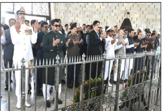
KARACHI: Sindh Chief Minister, Syed Murad Ali Shah along with Governor Sindh, Kamran Khan Tessori and others paying homage to Quaid-e-Azam Muhammad Ali Jinnah on his death anniversary

However, no arrest was reported in the subversive act. No one has claimed the responsibility of the blast till ours going to the press.