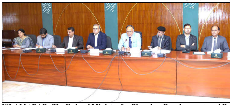
ISLAMABAD: The Federal Minister for Planning, Development, and Reform, Ahsan Iqbal, presiding over the annual review meeting of the Public Sector Development Programme (PSDP) 2023-24.

sources become available. He said that the policies introduced by the PML-N government in its previous tenures continued, the country's development budget would now be around Rs3,000 billion, compared to the existing PSDP size of around Rs1100 billion against Rs29,000 billion demands of the ministries. He criticized that almost 40 percent of the federal government's total PSDP allocations were diverted to street-level projects of provinces during 2018-22, compared to only 14 percent during 2013-18. He pointed out that due to mismanagement and inefficiency, the previous government allowed undue emphasis on street/local level projects.