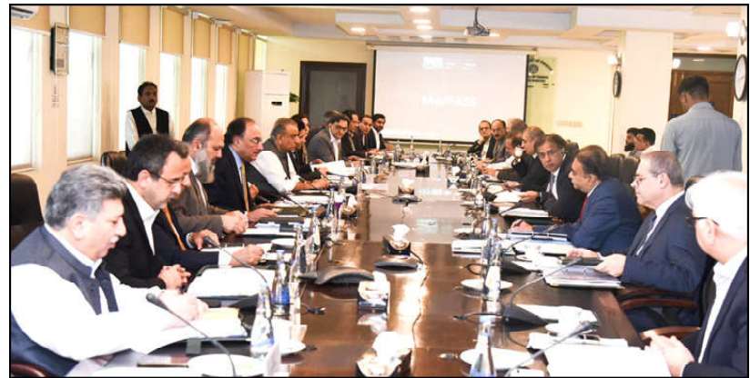
ISLAMABAD: Federal Minister for Finance and Revenue Senator Muhammad Aurangzeb chaired the meeting of the Economic Coordination Committee (ECC) at the Finance Division.