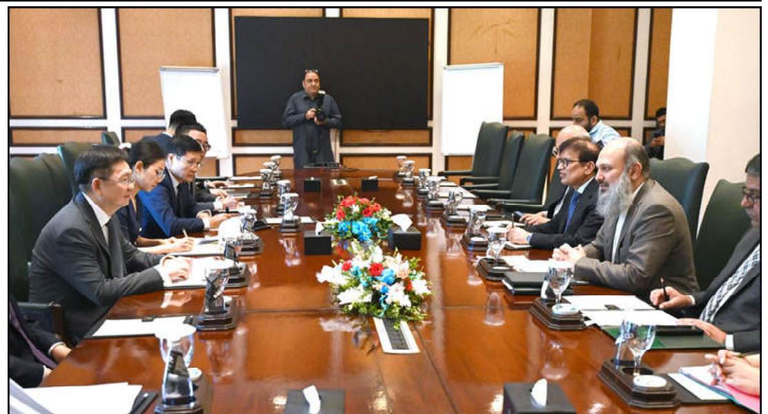
ISLAMABAD: Federal Minister for Commerce, Jam Kamal Khan, in a meeting with Vice Minister of Commerce, People's Republic of China, Ling Ji on sidelines of the SCO Ministerial Conference.

On the occasion, Nawaf Bin Said Al-Malki commended the government's efforts in implementing structural and institutional reforms.