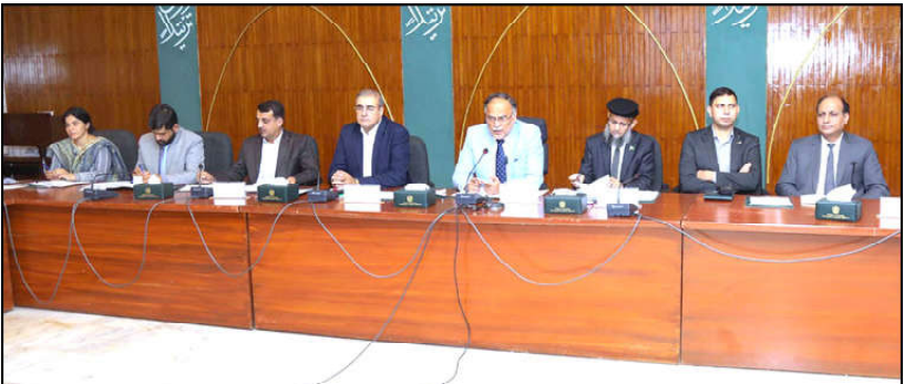
ISLAMABAD: The Federal Minister for Planning, Development, and Reforms, Ahsan Iqbal, presiding over the annual review meeting of the Public Sector Development Programme (PSDP) 2023-24.