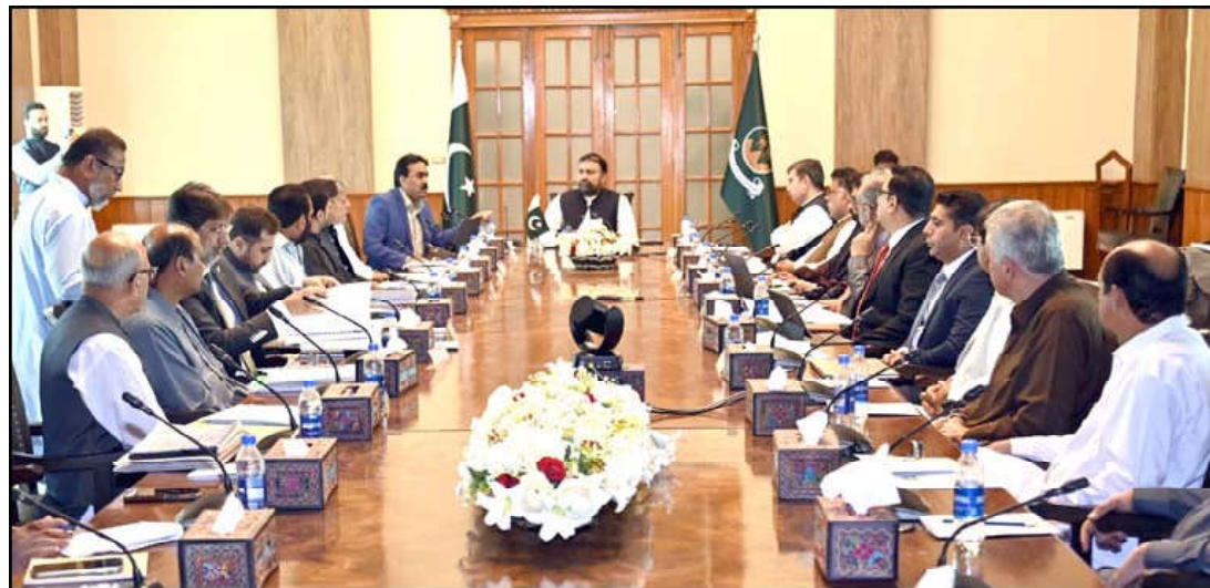
QUETTA: Chief Minister Balochistan Mir Sarfaraz Ahmed Bugti presiding over an inter-provincial meeting of Sindh and Balochistan on the issues of water distribution between the two provinces

During the meeting, both commanders shared their perspectives on regional maritime security challenges and explored potential avenues for collaboration between CTF 150 and the upcoming RSNF Maritime Component Command to maintain security and stability in the region. They also reaffirmed the excellent relationship between the two navies, emphasizing their shared commitment to fostering regional peace.