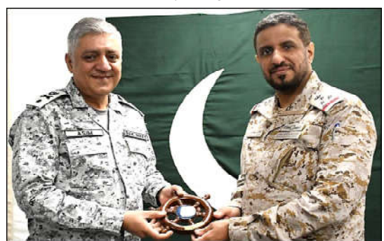
BAHRAIN: Royal Saudi Naval Forces (RSNF) delegation, led by RSNF Maritime Component Commander, Commodore Othman Oqab Al Zahrani called on CCTF 150 Commodore Asim Sohail Malik of Pakistan Navy Bahrain.

He stressed that without establishing the supremacy of Constitution, no institution could function, and for that the members of the House must maintain a working relationship. Bilawal said the government was constantly engaged in firefighting as the opposition continued to make a hue and cry instead of doing their duty of holding the former accountable.