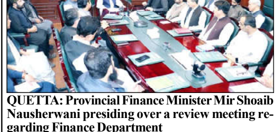
QUETTA: Provincial Finance Minister Mir Shoaib Nausherwani presiding over a review meeting regarding Finance Department

Fazlur Rehman, reaffirming his party's opposition stance, stated, "JUI-F will remain part of the opposition, and no opposition party will support any legislation that undermines the Constitution or democracy."