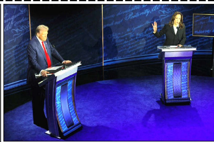
Democratic presidential nominee, US Vice President Kamala Harris speaks during a presidential debate hosted by ABC as Republican presidential nominee, former US President Donald Trump listens, in Philadelphia, Pennsylvania, US.

Trump, who has spent weeks launching personal attacks on Harris including racist and sexist insults, largely avoided that pattern during the debate's early moments but quickly became agitated under Harris' offensive.