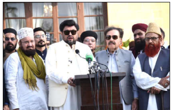
KARACHI: Governor Sindh Kamran Khan Tessori along with Governor Balochistan Sheikh Jaffar Khan Mandokhail and Ulama talking with mediators about 12th Rabi-ul-Awwal.

"In the past, Asad Qaiser was frequently criticized from here. Now, we are providing transparent evidence that no one was taken from within the house," Tarar stated.