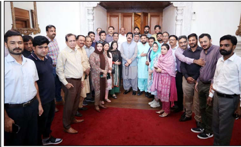
LAHORE: Governor Punjab Sardar Saleem Haider Khan in a group photo with beat reporters from electronic media at Governor House.

abandon the old behavior and adopt a reasonable approach. Governor Punjab praised the participation of the people in the recent celebration of Milad held at the Governor House. Governor Punjab said that collective efforts are needed to improve the country's conditions. He said that the politics of chaos and fighting is not in the national interest. While discussing the reorganization of the People's Party in Punjab, he said that he will meet with the leadership of Central Punjab in the near future to discuss the organizational issues.