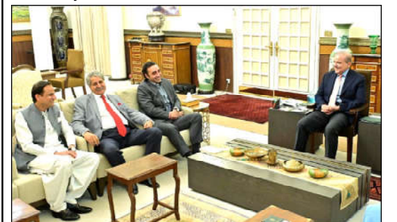
ISLAMABAD: Chairman Pakistan Peoples Party Bilawal Bhutto Zardari calls on Prime Minister Muhammad Shehbaz Sharif, PPP leader Syed Naveed Qamar and Mayor Karachi Murtaza Wahab are also present

It was decided in the meeting that the committee formed by the Chief Minister would prepare viable proposals after consultation with the Provincial Ministers for Irrigation of Sindh and Balochistan on its final review report.