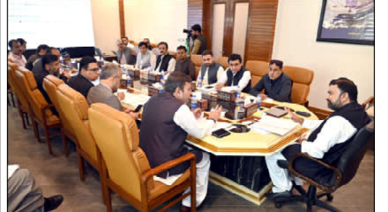
QUETTA: Balochistan Chief Minister Mir Sarfaraz Ahmed Bugti presiding over a meeting regarding Balochistan Institute of Cardiology, construction of new trauma center and other affairs

RAHIM YAR KHAN (INP): Five people were killed in armed clash between two groups over karo-kari dispute in Machaka police station jurisdiction, police said on Wednesday. According to details, armed men of two groups which were in dispute over karo-kari issue traded heavy fire in Daulatabad area of Rahim Yar Khan. The cross firing led to killing of five people and culprits managed to escape from scene. Heavy contingent of police reached the scene and cordoning off the area. The bodies were shifted to hospital for post-mortem. DPO Rahim Yar Khan, Rizwan Umer Gondal took the notice of the incident and directed to arrest the culprits. The police was conducting raids to arrest the culprits involved in fire exchange.