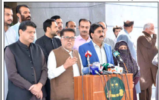
QUETTA: Balochistan Irrigation Minister Sadiq Umrani and Sindh Irrigation minister Jam Khan Shoro addressing a joint press conference at CM Secretariat.

The spokesman said that the team of Bomb Disposal Squad reached the spot of blast and started investigations into it. The nature of explosion is being determined by the investigating team. He said that the persons injured in the blast are being provided necessary medical treatment in the Turbat hospital.