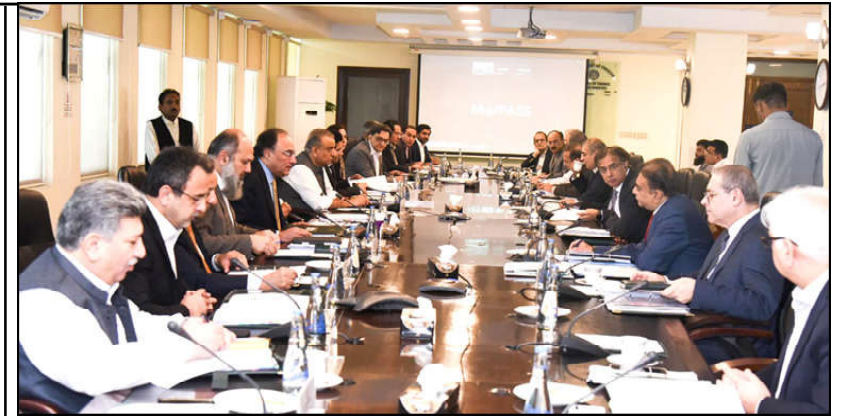
ISLAMABAD: Federal Minister for Finance and Revenue Senator Muhammad Aurangzeb chaired the meeting of the Economic Coordination Committee (ECC) at the Finance Division.