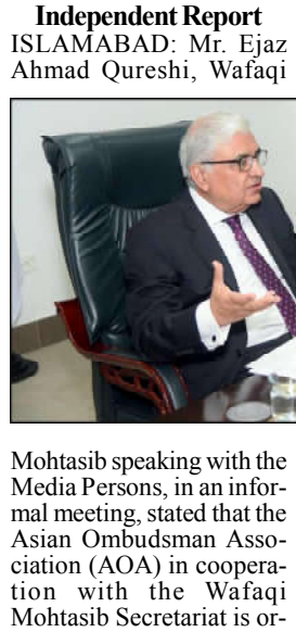
Mohtasib speaking with the Media Persons, in an informal meeting, stated that the Asian Ombudsman Association (AOA) in cooperation with the Wafaqi Mohtasib Secretariat is or-