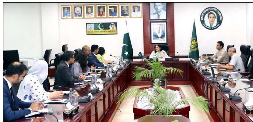
Senator Rubina Khalid, Chairperson of the Benazir Income Support Programme (BISP), met with the delegation of Bill & Melinda Gates Foundation at BISP headquarters Islamabad.

IGP also issued orders to senior police officers to pay special attention to serious crimes, street crime, and crime hotspots. He emphasized that protecting the lives, property, and honor of citizens in Islamabad is the highest priority for the Islamabad Police. All police officers should ensure effective patrolling of the city and counter criminal elements, he added.