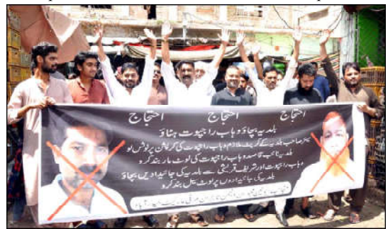
HYDERABAD: Members of Anjuman-e-Tajran Chicken Market are holding protest demonstration for acceptance of their demands, at Tower Market in Hyderabad.

They said a committee within Pakistan Railways observed that the bids submitted in the initial tender process were lacking in both technical and financial aspects, which would have resulted in a lack of competitiveness.