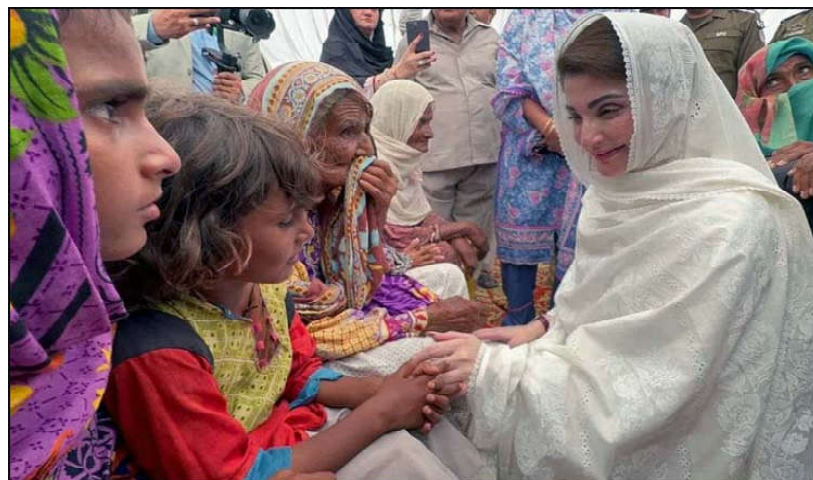
MULTAN: Punjab Chief Minister Maryam Nawaz interacts with flood affected people during her visit to the flood hit areas of Rajanpur, near Multan.