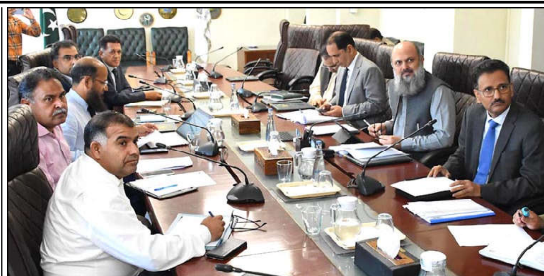
ISLAMABAD: Federal Minister for Commerce Jam Kamal Khan meets with the Sectoral Council, urging comprehensive reforms to boost Pakistan's Gems and Jewelry industry.