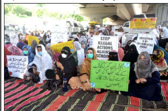
PESHAWAR: Members of Women Teachers Welfare Association Hayatabad are holding protest demonstration for their rights, outside KPK Assembly in Peshawar.

LAHORE: The Punjab Food Authority (PFA) has unearthed a counterfeit ghee manufacturing unit on Jaranwala Road and discarded a huge quantity of unwholesome food including 4,800kg hazardous ghee, 375kg caustic soda, 150 litre loose cooking oil and 125kg bleaching powder. Meanwhile, the PFA enforcement team also seized 1,700 counterfeit cartons of famous edible oil brands, 775kg packing material, four storage tanks and a packing machine during a raid. This was informed by PFA Director General Muhammad Asim Javaid while talking to the media at PFA Headquarters. He said that acting on the tip-off, the PFA raided a unit and caught the adulteration mafia red-handed while an FIR has been registered against the culprits in the respective police station, leading to the arrest of people from the spot. He said that ghee was extracted from the filth and fat of animals. He said that germs-infested ghee was stored in rusty tanks and packed in the counterfeit packaging of popular brands to deceive customers. He further said that FBO had mentioned the wrong addresses on the labelling of ghee packaging. The food business operator also failed to present the necessary records to the raiding team, such as an agreement with a bio-diesel or soap manufacturing company, he said.