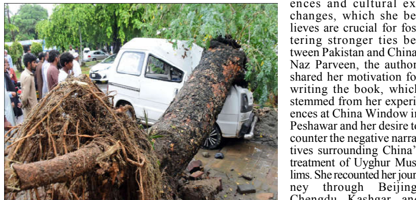
ISLAMABAD: A view of heavy tree fell on a school children pick and drop vehicle at super market due to heavy storm in morning hours in the Federal Capital.

ISLAMABAD (APP): In a decisive move against commission agents exploiting citizens outside government offices, the Islamabad Capital Territory (ICT) administration raided near the Regional Passport Office in G-10 area and arrested nine agents. According to the spokesman of ICT administration, the district administration teams have intensified their efforts to tackle the growing issue of commission agents operating outside government offices. On the directives of Deputy Commissioner (DC) Islamabad, Irfan Nawaz Memon, nine