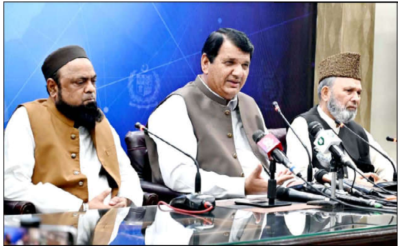
ISLAMABAD: Federal Minister for Kashmir Affairs Engineer Amir Muqam along with All Parties Hurriyat Conference (APHC) leadership addressing a press conference at PID Media Center.