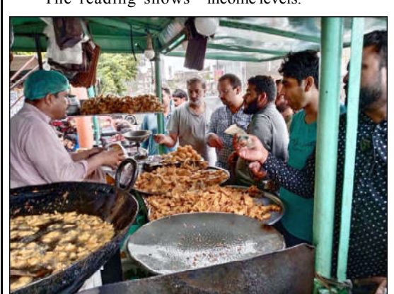
SIALKOT: A large number of people purchasing traditional food item "pakoras" from vendor during heavy in the city.

The reading shows higher inflationary pressures as the monthly index normally stands around 1%. The impact was more pronounced in cities where the new tax measures hit the consumers hard. The monthly food inflation in July came in at 4.5% in urban localities. Chairman Ibrahim APBF Qureshi said that the government has imposed a record Rs1.8 trillion in new taxes in the new budget for winning a $7 billion bailout package from the International Monetary Fund. Taxes have been slapped on the salaried persons and the consumable goods used mostly by all segments of society, irrespective of their income levels.