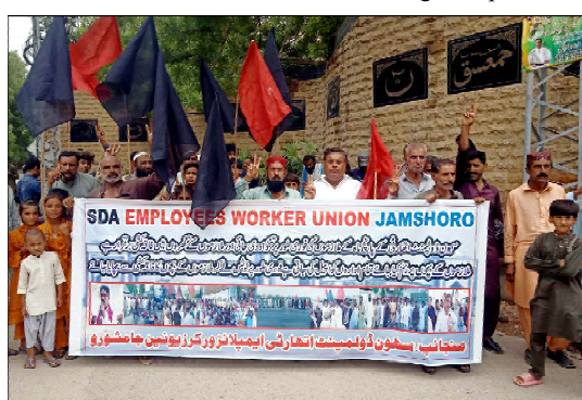
HYDERABAD: Members of Sehwan Development Authority Employees Workers Union are holding protest demonstration against non-payment of their salaries, at Hyderabad press club

the martyrs by offering Fateha, laying floral wreaths, and praying for their elevated ranks. Special prayers were also offered for the country's security, prosperity, and well-being.