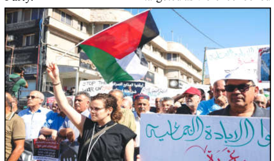
UMMALFAHEM: Arab-Israelis and left-wing activists lift flags of Palestine and placards to protest Israel's aggression in Gaza.

further escalation of conflict in the Middle East and the challenges posed by threats from Iran." The calls came as tensions are running high in the region after Iran vowed "severe punishment" for Israel for the assassination of Hamas' political chief Ismail Haniyeh in the Iranian capital of Tehran. The assassination of Haniyeh was "designed and executed" by Israel with support from the US, using a short-range projectile, Iran's Islamic Revolutionary Guard Corps (IRGC) said on Saturday. The US said on Friday it would deploy additional fighter jets and navy warships to the Middle East. Haniyeh was assassinated early on Wednesday at his residence in Tehran in an attack that Iranian officials blamed on Israel. Haniyeh's bodyguard was also killed.