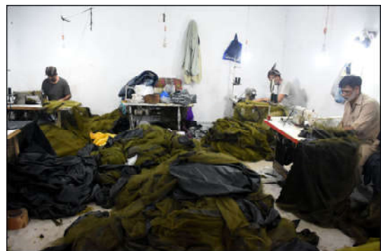
LAHORE: Tailors preparing mosquito nets in a factory to prevent dengue mosquito-borne diseases from the water of monsoon rains.