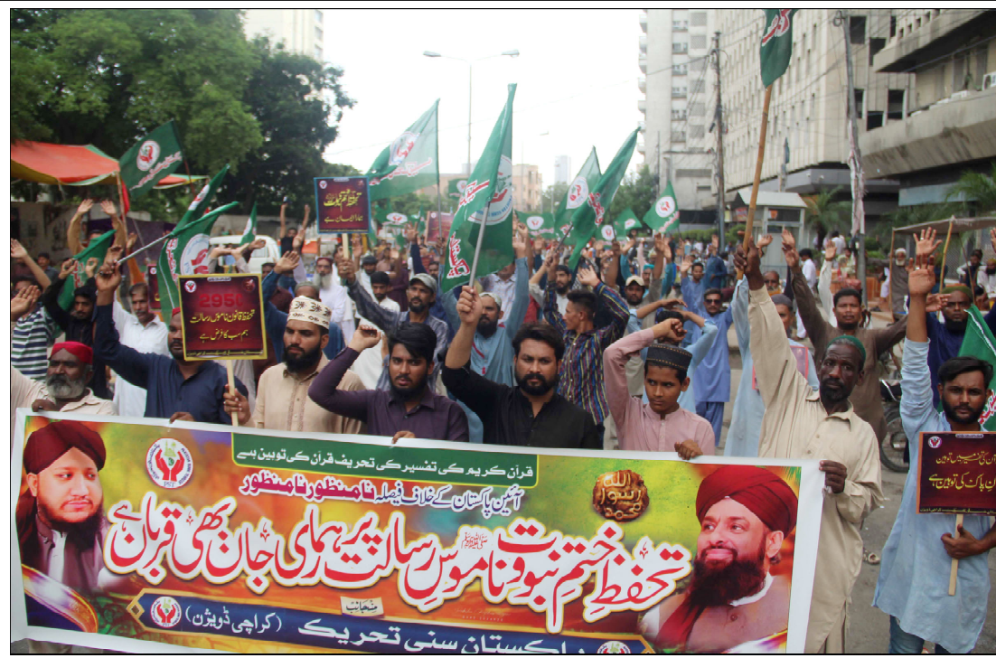
KARACHI: Activists of Pakistan Sunni Tehreek raise slogan outside the Karachi Press Club

Balochistan with over 50 per cent probability. In July 2024, rain was nine percent below average across Pakistan while Sindh received 44 percent less rain in July. 1 July to 4 Aug, over 11pc across Pakistan, over 48pc in Balochistan, over 17pc in Punjab, while, AJK, KP & GB received deficient rains so far. From July 1 to August 4, plus 16 percent in Sindh with Jacobabad 71.7 percent, Shaheed Benazirabad 49.2pc, Rohri 39.2 percent and Sukkur 53.6 percent, he told.