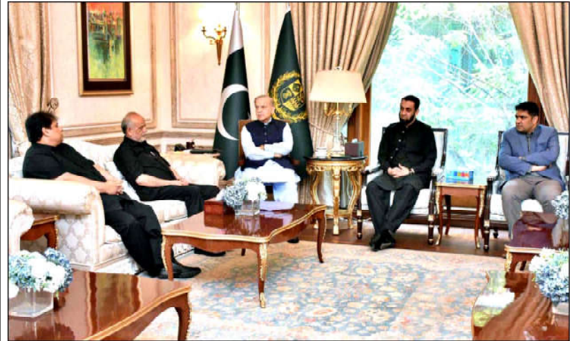
LAHORE: Prime Minister Shehbaz Sharif chairing a review meeting on Track and Trace System

the rule of law in the province. He also expressed that laying down one's life in the line of duty demonstrates the utmost dutifulness and a strong spirit to protect the lives and property of citizens, which cannot be measured by mere words. He added that such admirable individuals etch themselves into the annals of history by sacrificing their lives for the nation's cause.