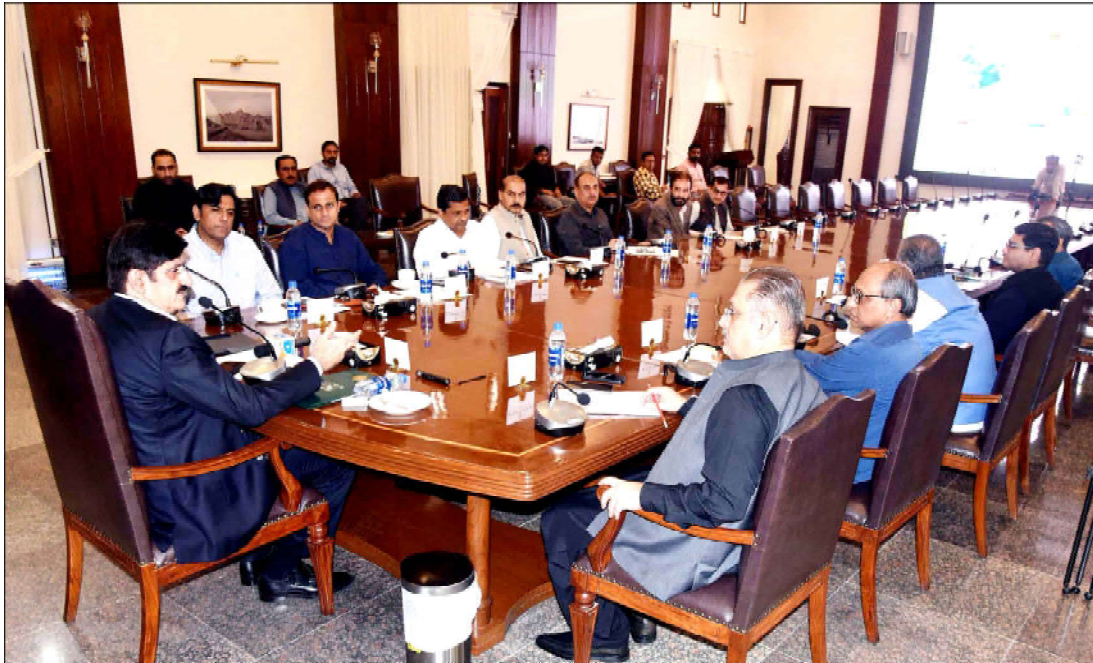
KARACHI: Sindh Chief Minister, Syed Murad Ali Shah presides over a meeting to assess the impact of the recent rains on urban flooding and the river and lake situations, at CM House in Karachi

Ph: 0300-3898091 Vol: 06. No. 170 Muharram 29, 1445 AH Monday August 05, 2024 Pages 04 Price Rs. 12.00