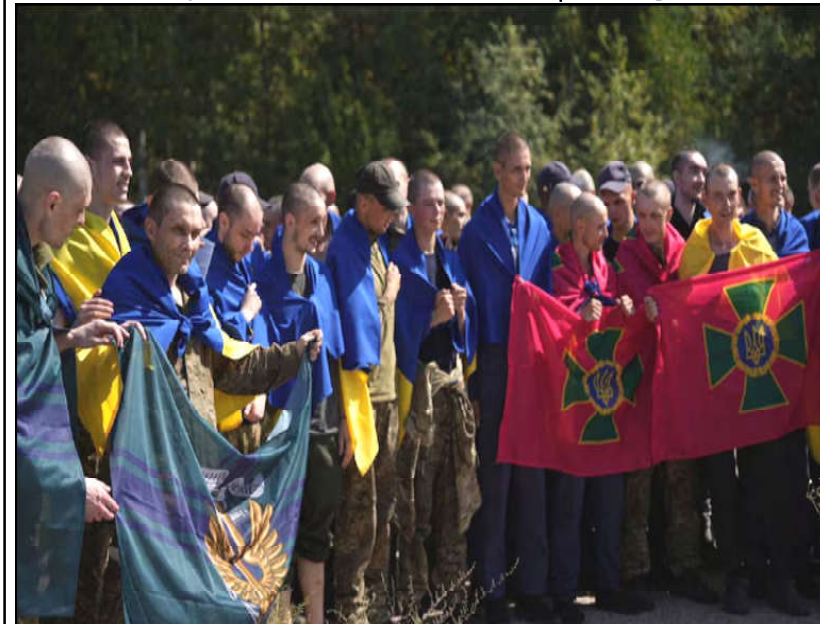
Ukrainian prisoners of war (POWs) gather after a swap, amid Russia's attack on Ukraine, at an unknown location in Ukraine.

Police were hunting for a suspect and the anti-terrorism prosecutor's office was put in charge of the investigation, Attal said.