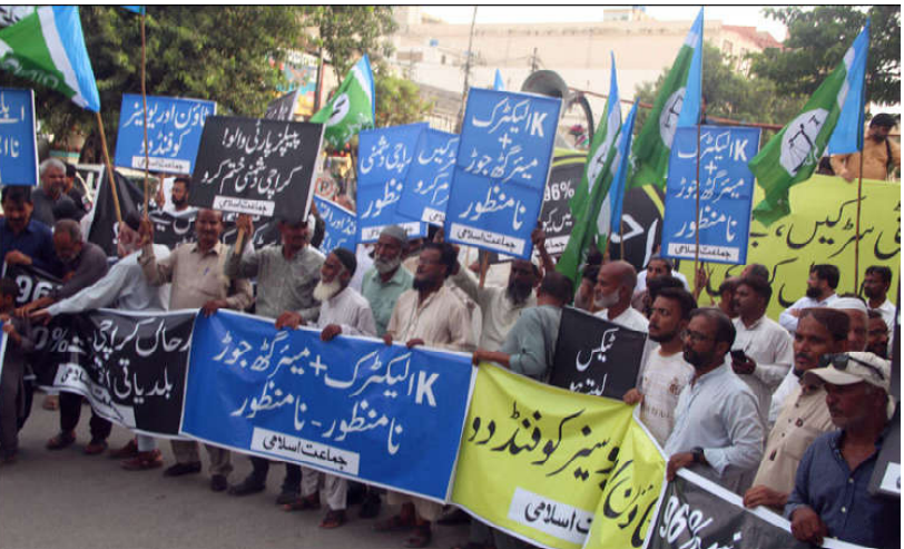
ISLAMABAD: Elected representatives of municipalities under Jamaat-Islami Karachi are protesting in front of the KMC head office against the deterioration of the Provincial Capital.

Educational inequality in Pakistan is a multifaceted issue requiring immediate, focused intervention. Addressing the root causes through targeted policies and community engagement can help build a more inclusive education system.