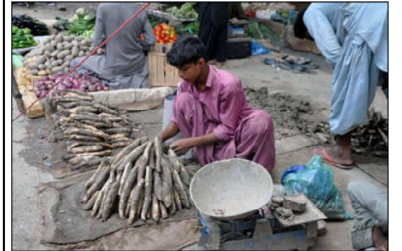
HYDERABAD: Vendors sell vegetables to earn their livelihood as the customers are not willing to buy vegetable due to price hike, at New Vegetable Market in Hyderabad.

To solve this problem, a Raast payment system based on international standards was adopted, he added.