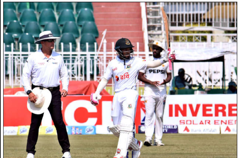
RAWALPINDI: Bangladesh batsman Mushfiqur Rahim celebrates after scoring a half-century during the fourth day of the 1st Test Cricket Match playing between Pakistan and Bangladesh at Pindi Cricket Stadium