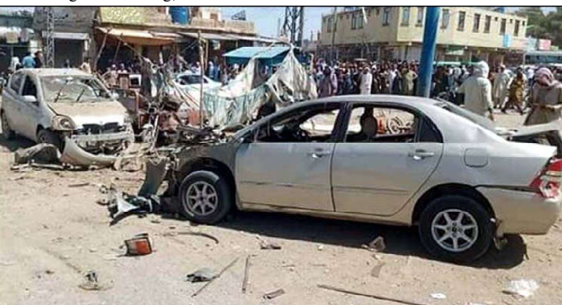
QUETTA: A view of damaged vehicles after a blast occurred at a main market near Surkhab Chowk Pishin District.

The Minister said that anti-state elements don't want development and prosperity of the country. This is why they are wasting innocent and precious lives while working on the enemy country agenda.