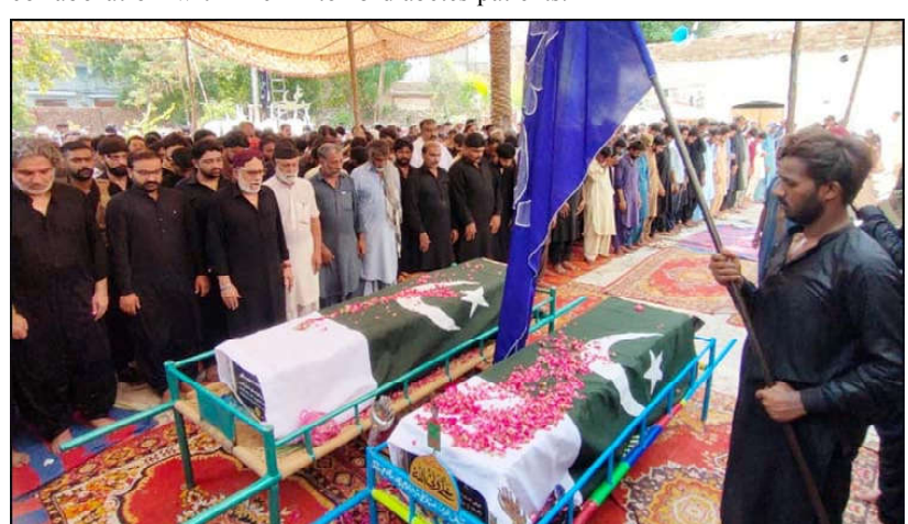
LARKANA: A large number of people attend funeral prayers of Martyred Pakistani Pilgrims of Karbala, who died bus-crashed accident in Iran, held in Larkana.

In such a grim scenario, he said the challenges of food security would be further aggravated for highly populated countries like Pakistan and people would face hunger and starvation.