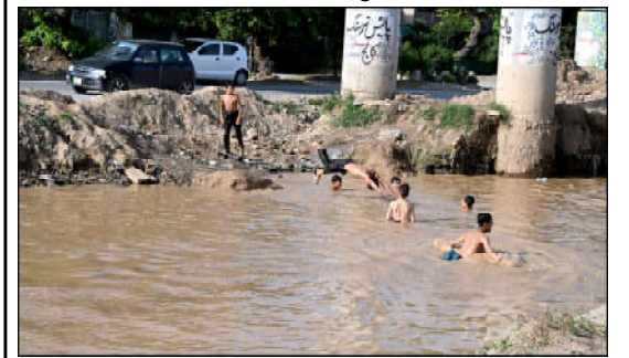
ISLAMABAD: Children enjoying bath in the rain water pond in a hot humid day in the city.

Arrangements for thoroughly checking participants of the procession using metal detectors have been made, while strict vigilance is maintained to ensure that security measures are in place by both the police and peace committees. Pakistan Rangers officials will also assist the Islamabad Police in ensuring elaborate security arrangements.