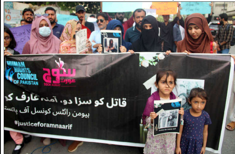
ISLAMABAD: A demonstration being held outside the Karachi Press Club under the Human Rights Council of Pakistan in favor of giving justice to those killed in a car collision.

The conference, organized by the Egyptian Ministry of Endowments, is centered around the theme "The Role of Women in Building Awareness."