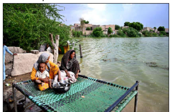
HYDERABAD: Slum area submerged in river water near River Indus.

Later, she met industrialists, traders and representatives of karyana store association Sargodha.