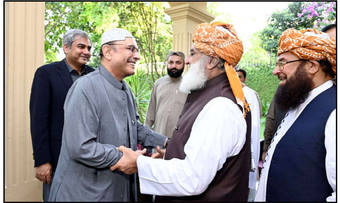
ISLAMABAD: President Asif Ali Zardari along with Federal Interior Minister Mohsin Naqvi has reached the residence of Jamiat Ulema-e-Islam's chief Maulana Fazl-ur-Rehman's house in the Federal Capital.

He reaffirmed his commitment that Pakistan would speed up the delivery of food to Palestinians, especially children.