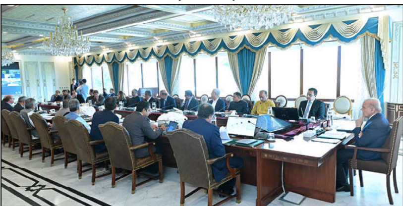
ISLAMABAD: Prime Minister Muhammad Shehbaz Sharif chairs a review meeting regarding Electronic Procurement, e-Pak Acquisition and Disposal System/e-PADS.