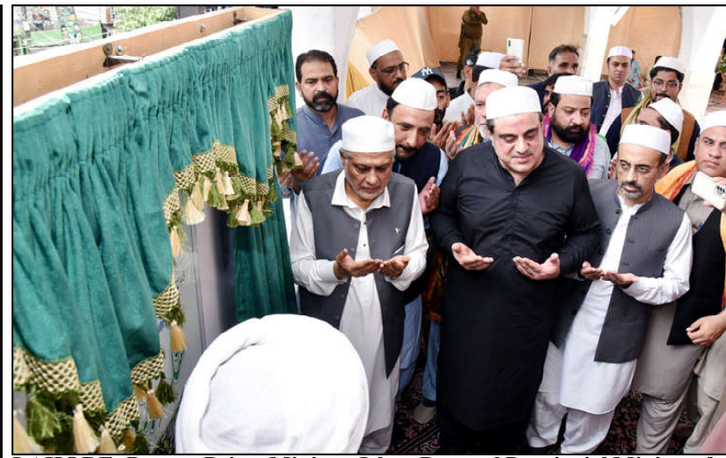
LAHORE: Deputy Prime Minister Ishaq Dar and Provincial Minister for Food Bilal Yaseen offering Dua after inaugurating expansion project of Shrine of Hazrat Data Ganj Bakhsh (RA).

parents have a strong perception of poor quality in the public education system. According to Rafiullah Kakar, a member of the Planning Commission's Social Sector, the "learning domain index" paints a very dire picture, with the entire country appearing "red" on this indicator. He highlighted that the share of education budgets in provincial development budgets is highly inadequate, with up to 90% of current education budgets going towards paying salaries rather than improving learning outcomes. The national average score in the District Education Performance Index is 53.46, placing Pakistan firmly in the "low performance" category for its education system. The assessment was based on five key indicators, with "infrastructure and access" scoring the highest at 58.95, suggesting some progress has been made in expanding educational opportunities, although significant gaps remain. According to the report, the second-highest scoring domain after infrastructure and access is "Inclusion (Equity & Technology)". This suggests some progress has been made in expanding educational opportunities and access, particularly through the use of technology.