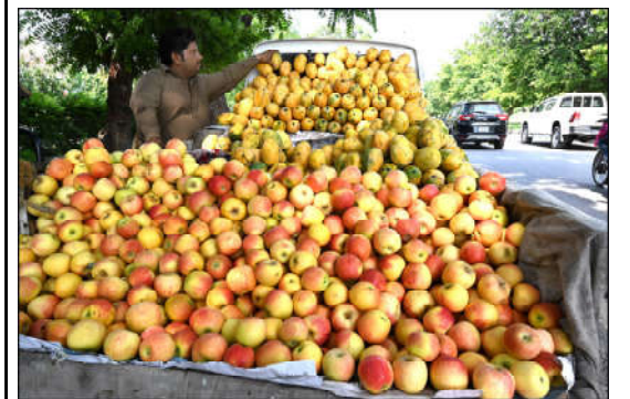
ISLAMABAD: A vendor displays apples along the roadside to attract the customers.

Following the completion of the transaction, the market share of Alfalah Asset Management Limited is anticipated to experience a slight increase, while the market share of Faysal Asset Management Limited will correspondingly decrease. Crucially, the CCP's analysis has determined that this acquisition will not lead to market dominance by Alfalah Asset Management Limited in the relevant market.