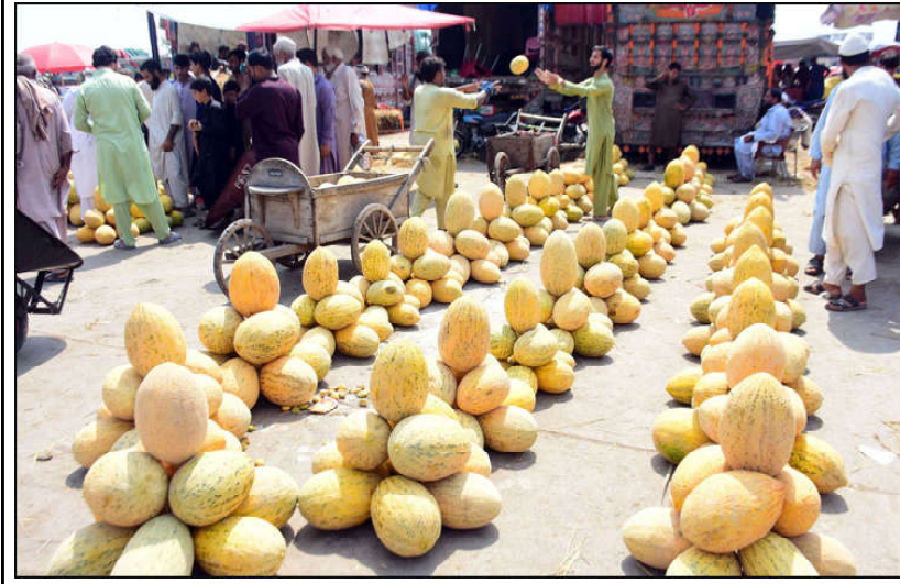
ISLAMABAD: A view of activities at I-II Fruit and Vegetable Sabzi Mandi in the Federal Capital.

The price of per tola and ten gram silver remained unchanged at Rs.2,950 and Rs.2,529.14, respectively.