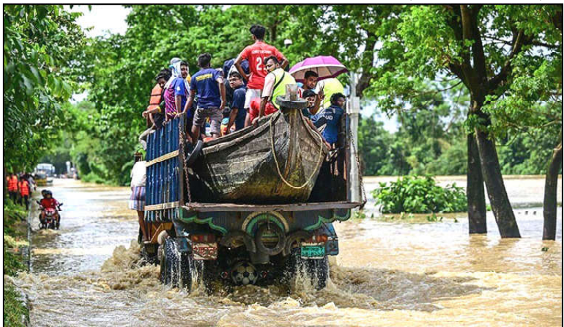
A vehicle carrying a boat and rescue workers move through flood waters in Feni, southeastern Bangladesh.

Temperatures inside the school, designed by US-based architect Diana Kellogg and built by local artisans — many of them parents of pupils — can be as much as 20 per cent lower than those outside. "I love going to the school," said eight-year-old Khushboo Kumari, one of the 170 students. "The air feels as if it is coming from an AC." The school's classrooms are arranged around an open elliptical courtyard resembling a Roman coliseum.