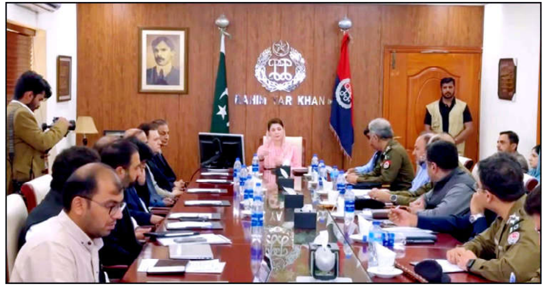
BAHAWALPUR: Punjab Chief Minister Maryam Nawaz Sharif is addressing the briefing session on the attack on the Police at Rayhim Yar Khan by bandits.

officers due to the bandits' attack," Maryam Nawaz said. "As soon as I received the news, Muhammad Nawaz Sharif instructed me to visit the grieving families immediately," she mentioned. "Every life is precious; we will also ensure protection of police officers," emphasised Maryam Nawaz. "We must find a permanent solution to the issue of Katcha area. Construction of checkpoints will be completed soon."