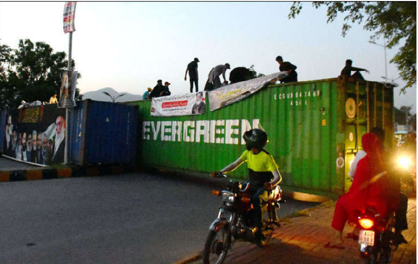
ISLAMABAD: Authorities seal off process routes on the occasion of Jaloos e Chehlum of Imam Hussain RA in the Federal Capital.