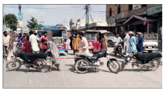
HUB: Shopkeepers and business community members block road as they are holding protest demonstration against the increasing theft incidents and the unrest law and order situation, at Asad Chowk.

The salaries of absent teachers would be deducted