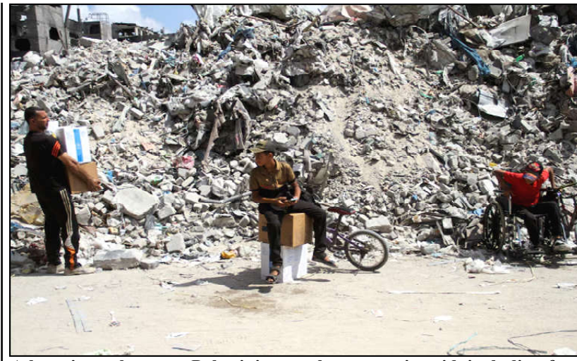
A boy sits on boxes as Palestinians gather to receive aid, including food supplies provided by World Food Program (WFP), outside a United Nations distribution center, amid the Israel-Hamas conflict, in Jabalia in the northern Gaza Strip.

In Israel, Prime Minister Benjamin Netanyahu has locked horns with Israeli ceasefire negotiators over whether Israeli troops must remain all along the border between Gaza and Egypt, a person with knowledge of the talks said.