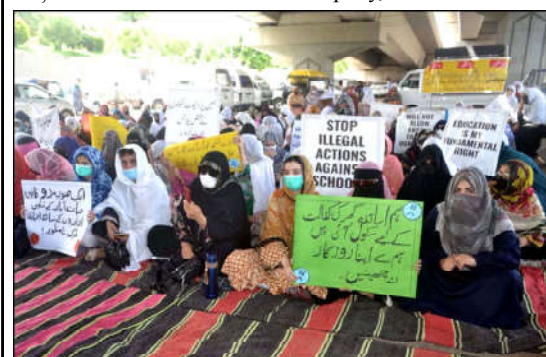
PESHAWAR: Members of Women Teachers Welfare Association Hayatabad are holding protest demonstration for their rights, outside KPK Assembly in Peshawar.

and caught the adulteration mafia red-handed while an FIR has been registered against the culprits in the respective police station, leading to the arrest of people from the spot. He said that ghee was extracted from the filth and fat of animals. He said that germs-infested ghee was stored in rusty tanks and packed in the counterfeit packaging of popular brands to deceive customers. He further said that FBO had mentioned the wrong addresses on the labelling of ghee packaging. The food business operator also failed to present the necessary records to the raiding team, such as an agreement with a bio-diesel or soap manufacturing company, he said.