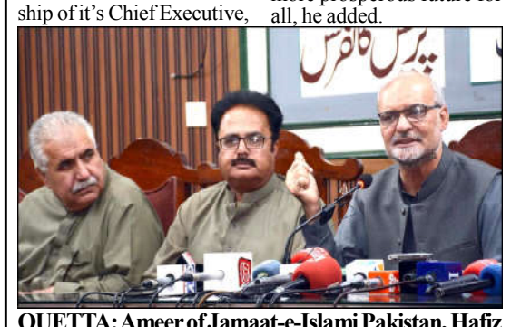
QUETTA: Ameer of Jamaat-e-Islami Pakistan, Hafiz Naqemur Rehman addressing a press conference.