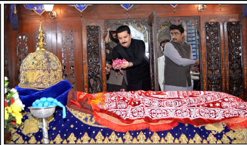
HYDERABAD: Governor KPK Faisal Karim Kundi lays floral wreath on the shrine of Hazrat Shah Abdul Latif Bhitai on the concluding day of 281th urs celebrations.

RAWALPINDI (APP): Anti-Narcotics Force (ANF) while conducting an operation in Sialkot managed to recover over 10 kg drugs, weapons and arrested a drug dealer, said an ANF Headquarters spokesman here on Tuesday. He informed that in a joint operation conducted in Tehsil Daska, Sialkot by ANF and Punjab Police, 10.2 kg drugs, two motorcycles and weapons were recovered.