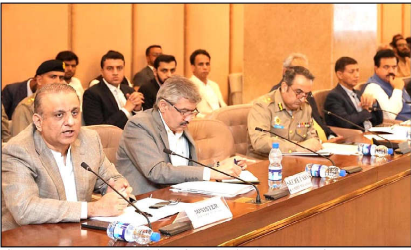
ISLAMABAD: Federal Minister for Privatization, Board of Investment and Communications, Abdul Aleem Khan while speaking at the meeting of the National Assembly's Standing Committee on Communications.