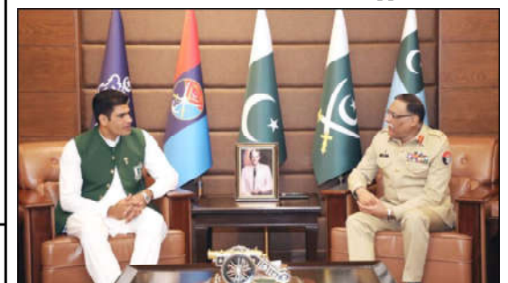
diligence and devotion of Arshad Nadeem in achieving a momentous milestone in Pakistan's sport history and wishing him the very best for his future endeavours.

Independent Report RAWALPINDI: Arshad Nadeem, record-holder Olympian, called on Chairman Joint Chiefs of Staff Committee (CJCSC), General Sahir Shamshad Mirza here on Tuesday at Joint Staff Headquarters. The Chairman JCS lauded Arshad Nadeem's efforts for securing Pakistan's first-ever Gold Medal in a singles' event and setting up of a new Olympic record, an Inter Services Public Relations news release said. General Sahir Shamshad Mirza also appreciated the