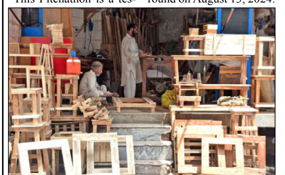
RAWALPINDI: Workers busy in making wooden items on their workplace at Banni chowk area in the city.

On the occasion, Minister of State for IT & Telecommunication Shaza Fatima Khawaja said, "This Pitchathon is a testament to Pakistan's growing capabilities in AI and technological innovation. The government is dedicated to creating an environment that nurtures talent and encourages the development of cutting-edge solutions that address both local and global challenges. Events like these are crucial in our journey to position Pakistan as a leader in the global digital economy."