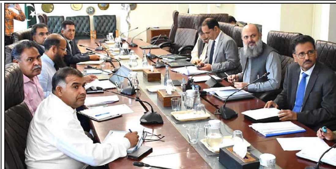
ISLAMABAD: Federal Minister for Commerce Jam Kamal Khan meets with the Sectoral Council, urging comprehensive reforms to boost Pakistan's Gems and Jewelry industry.