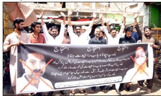
HYDERABAD: Members of Anjuman-e-Tajran Chicken Market are holding protest demonstration for acceptance of their demands, at Tower Market in Hyderabad.

They said a committee within Pakistan Railways observed that the bids submitted in the initial tender process were lacking in both technical and financial aspects, which would have resulted in a lack of competitiveness.