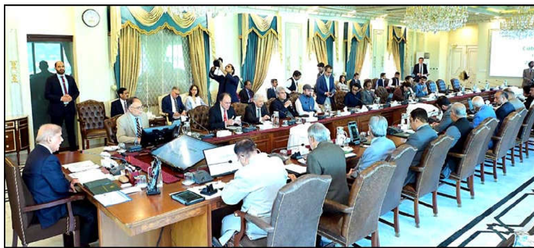
ISLAMABAD: Prime Minister Muhammad Shehbaz Sharif chairs a meeting of the Federal Cabinet.

Independent Report 15, 2024. It was mentioned in the letter that the government of Balochistan is releasing billions of rupees on account of the safety city project. The Provincial Minister has also sought detail of the miscreants and criminals apprehended so far with help of the CCTV cameras installed under the safe city project. It was also asked to submit the details with the location, time and date of each incident of crime and terrorism.