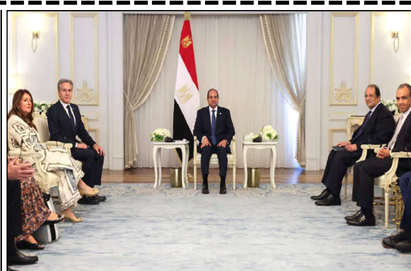
U.S. Secretary of State Antony Blinken meets with Egyptian President Abdel Fattah el-Sisi and Egypt's Foreign Minister Badr Abdelaty, in EL-Alamein, Egypt.

made under this agreement." Despite US expressions of optimism and Netanyahu's office describing the meeting as positive, both Israel and Hamas have signalled that any deal will be difficult. Hamas accused Netanyahu of "thwarting the mediators' efforts" and Turkiye said Hamas envoys had told it that US officials were "painting an overly optimistic picture" despite their clear stance of abiding by the earlier understanding and rejection of the new conditions being set by the US. Ahead of talks in Qatar last week, Hamas had called on mediators, rather than holding more negotiations, to implement a framework outlined in late May by US President Joe Biden. After the Doha meeting, the US submitted what mediators called a "bridging proposal".