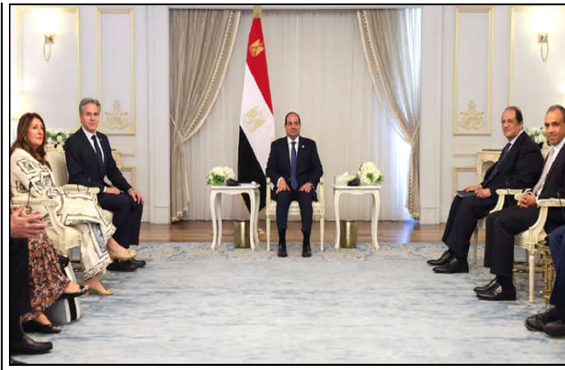
U.S. Secretary of State Antony Blinken meets with Egyptian President Abdel Fattah el-Sisi and Egypt's Foreign Minister Badr Abdelaty, in El-Alamein, Egypt.

Ahead of talks in Qatar last week, Hamas had called on mediators, rather than holding more negotiations, to implement a framework outlined in late May by US President Joe Biden. After the Doha meeting, the US submitted what mediators called a "bridging proposal".