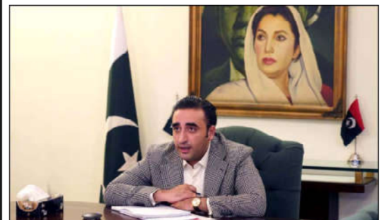
KARACHI: Peoples Party (PPP) Chairman, Bilawal Bhutto Zardari chairs a video link meeting of the irrigation departments of Sindh and Balochistan, held at Bilawal House in Karachi.