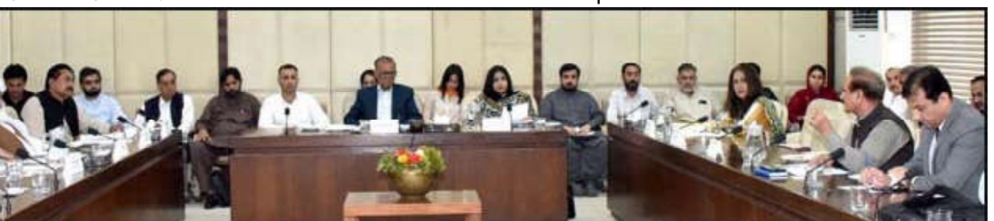
Senator Syed Masroor Ahsan, Chairman Senate Standing Committee on National Food Security and Research presiding over a meeting of the Committee at Parliament House Islamabad.

ISLAMABAD (INP): Pakistan's leading digital microfinance bank, Mobilink Bank, has launched an easy-to-use in-app inheritance calculator made accessible through its Dost app. The cutting-edge financial tool is designed to empower individuals, especially women, by providing clear insights into their inheritance share. The calculator's launch is a testament to the Bank's commitment to promoting financial inclusion.