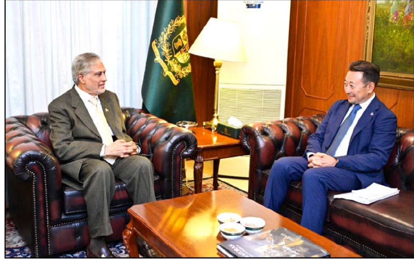
Secretary General of the Conference on Interaction and Confidence Building Measures in Asia (CICA), Ambassador Kairat Sarybay called on Deputy Prime Minister and Foreign Minister Senator Mohammad Ishaq Dar, in Islamabad.

He said that the people are lodging protest in