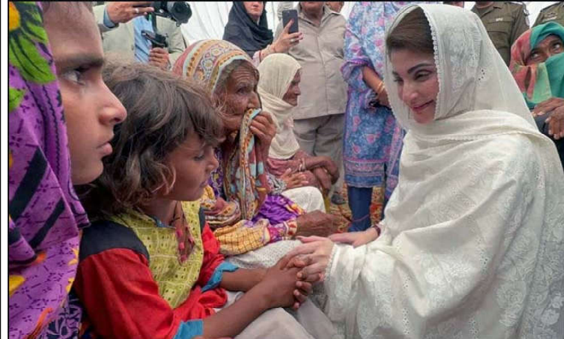
MULTAN: Punjab Chief Minister Maryam Nawaz interacts with flood affected people during her visit to the flood hit areas of Rajanpur, near Multan.

On information, rescue teams and police reached the spot and started investigation. A medical examination of the woman was being carried out to ascertain if she was drunk.