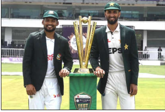
away Test matches are against South Africa, which will be played in December/January.

Pakistan are scheduled to play nine Test matches this season, their busiest Test season since 1998-99. Seven of these Test matches will be played at home, including two against Bangladesh, three against England in October and two against West Indies in January next year. The two