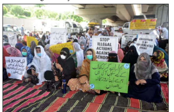
PESHAWAR: Members of Women Teachers Welfare Association Hayatabad are holding protest demonstration for their rights, outside KPK Assembly in Peshawar.

The new legislation will introduce specialized courts for cybercrime cases, complementing the existing federal 'PECA' Act. Under the Act, the provincial government will gain authority to investigate and prosecute a wide range of cybercrimes, including illegal data access, child sexual abuse content, and financial fraud.