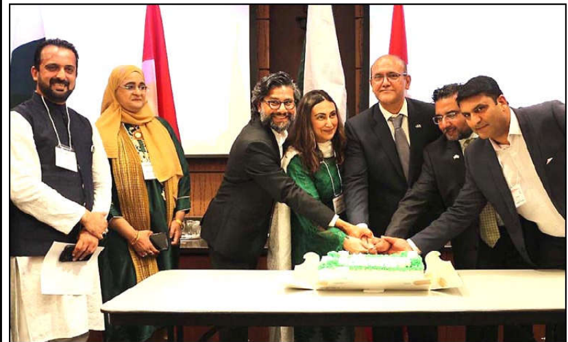
OTTAWA: Acting High Commissioner Shah Faisal Kakar cutting cake with Canada-Pakistan Association in connection with Independence Day celebration held at Ottawa.

In this context, there was a telephonic conversation between the prime minister and the Speaker of the National Assembly. Following this discussion, an additional petition was filed with the Supreme Court on behalf of the government, in accordance with the prime minister's instructions.