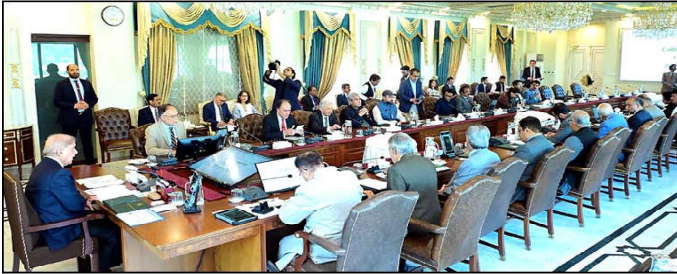
ISLAMABAD: Prime Minister Muhammad Shehbaz Sharif chairs a meeting of the Federal Cabinet.

Ph: 2841470/2841473 REG: No. BC-116 B/ID-445 Vd XXV No. 359, Safar 15, 1446 AH Wednesday August 21, 2024 Pages 08, Price Rs.15