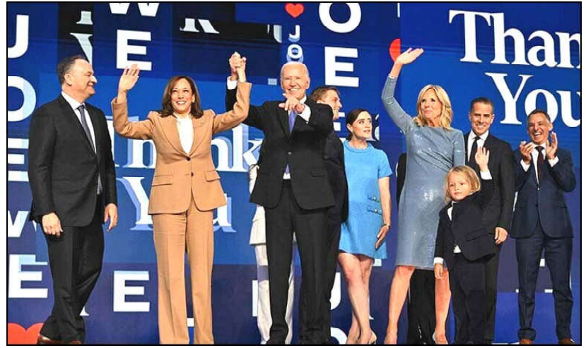
US President Joe Biden raises US Vice President and 2024 Democratic presidential candidate Kamala Harris' hand after delivering the keynote address on the first day of the Democratic National Convention (DNC) in Chicago.