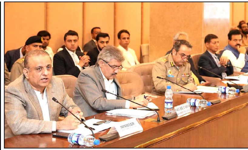
ISLAMABAD: Federal Minister for Privatization, Board of Investment and Communications, Abdul Aleem Khan while speaking at the meeting of the National Assembly's Standing Committee on Communications.