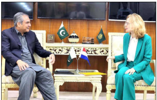
The meeting focused on enhancing bilateral cooperation across various sectors, with a special emphasis on combating human trafficking and strengthening cricket ties between the two nations.

ISLAMABAD (APP): Federal Minister for Interior Mohsin Naqvi welcomed the Ambassador of the Netherlands, Henny de Vries, on Tuesday at the Ministry of Interior to discuss issues of mutual interest.