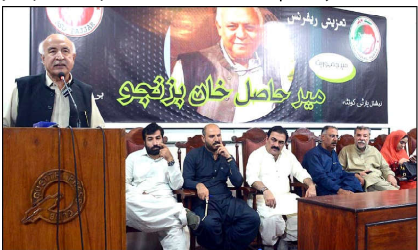
QUETTA: National Party Head & MP Dr. Abdul Malik Baloch addressing on condolence reference of founder of National Party Mir Hasil Khan Bizenjo.

ISLAMABAD (APP): The Election Commission (ECP) has fixed August 26 last date for receipt of applications for postal ballot papers for Bye-Election in NA-171 R.Y. Khan-III. This facility, under the law, has been extended to the persons in Government service, members of Armed Forces, their wives and such of their children as are registered voters and ordinarily reside with them provided they are stationed at a place other than the place in which their constituency is situated.