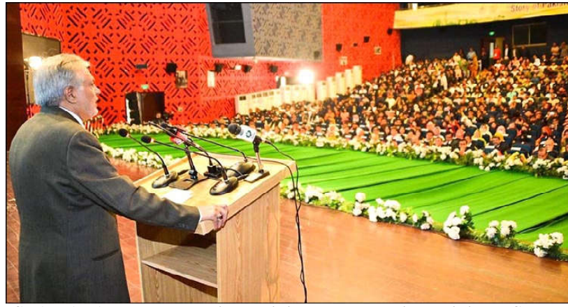
ISLAMABAD: Deputy Prime Minister and Foreign Minister, Senator Muhammad Ishaq Dar delivering remarks as Chief Guest at the Inaugural session of National Youth Convention.

The deputy prime minister said that the government was extending facilities to the youth and Special Investment Facilitation Council was also focusing on their empowerment as they could become a source of investment in education, skill development and technology.