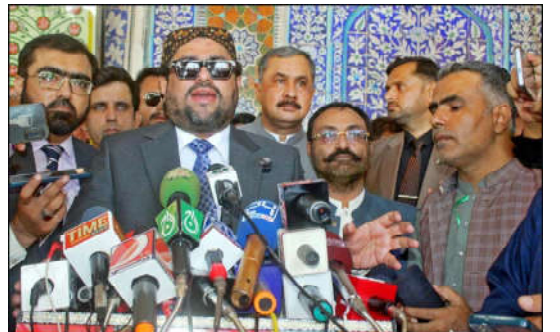
BHITT SHAH: Governor Sindh, Kamran Tessori talking to media persons during his visit to the grave of Shah Abdul Latif Bhittai during 281st Annual Urs of Hazrat Shah Abdul Latif Bhittai festival held in Bhitt Shah.

In the end, the governor writes that he is optimistic that the provincial government will take this step to rescue the people during these tough times. "I am looking forward to a positive response from you," he has written to the CM.