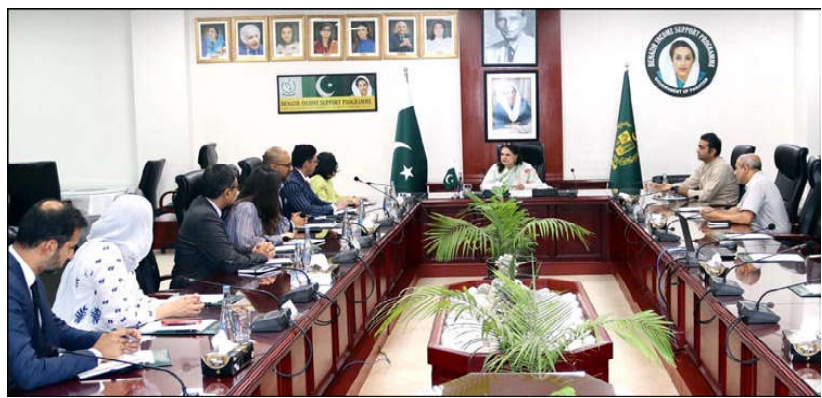
Senator Rubina Khalid, Chairperson of the Benazir Income Support Programme (BISP), met with the delegation of Bill & Melinda Gates Foundation at BISP headquarters Islamabad

The prime minister wished the Palestinian ambassador success in his future endeavors.