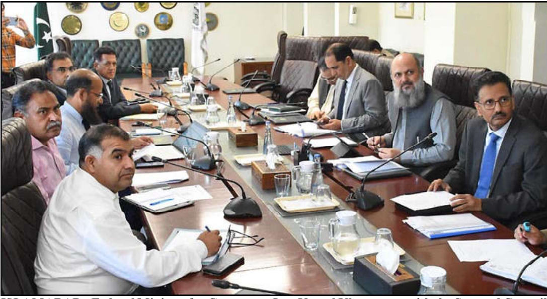
ISLAMABAD: Federal Minister for Commerce Jam Kamal Khan meets with the Sectoral Council, urging comprehensive reforms to boost Pakistan's Gems and Jewelry industry.