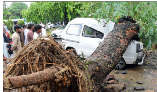
ISLAMABAD: A view of heavy tree fell on a school children pick and drop vehicle at super market due to heavy storm in morning hours in the Federal Capital.

ISLAMABAD (APP): Indus River System Authority (IRSA) on Tuesday released 398,800 cusecs water from various rim stations with inflow of 406,300 cusecs. According to the data released by IRSA, water level in River Indus at Tarbela Dam was 1550.00 feet (maximum conservation level) and was 152.00 feet higher than its dead level of 1,398 feet. Water inflow and outflow in the dam was recorded as 257,100 cusecs and 256,600 cusecs respectively. The water level in River Jhelum at Mangla Dam was 1214.00 feet, which was 166.00 feet higher than its dead level of 1,050 feet.