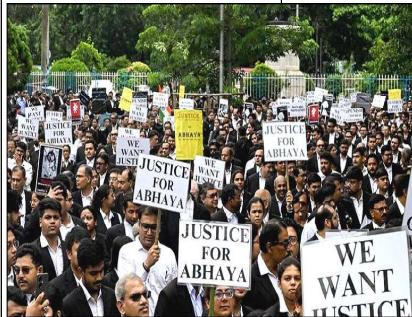
Calcutta High Court advocates hold posters during a protest to condemn the rape and murder of a doctor in Kolkata.

In a statement, the Palestinian health ministry confirmed the first case of polio in the city of Deir el Balah had been detected in a 10-month-old baby who had not been vaccinated.