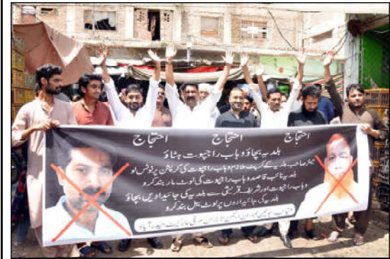
HYDERABAD: Members of Anjuman-e-Tajran Chicken Market are holding protest demonstration for acceptance of their demands, at Tower Market in Hyderabad.

"This Pitchathon is a testament to Pakistan's growing capabilities in AI and technological innovation. The government is dedicated to creating an environment that nurtures talent and encourages the development of cutting-edge solutions that address both local and global challenges. Events like these are crucial in our journey to position Pakistan as a leader in the global digital economy." The competition, which opened on July 19, 2024, attracted 112 submissions, out of which 7 teams were shortlisted by the e27 and Meta officials.