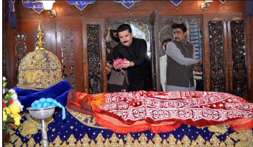
HYDERABAD: Governor KPK Faisal Karim Kundi lays floral wreath on the shrine of Hazrat Shah Abdul Latif Bhittai on the concluding day of 281th urs celebrations.

Furthermore, the analysis showed those 764 drivers, 50 underage drivers, 154 pedestrians, and 486 passengers.