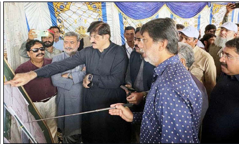
LARKANA: Sindh Chief Minister, Syed Murad Ali Shah being briefed by Secretary Irrigation Department of Sindh during his visits to Moria Loop Bund in Larkana.

He added that the Punjab government has allocated Rs 700 billion for the solar panel scheme, which will help further reduce electricity bills in the future. The relief package includes a relief of Rs 14 per unit for consumers using up to 500 units, which will cost the Punjab government Rs 45 billion.