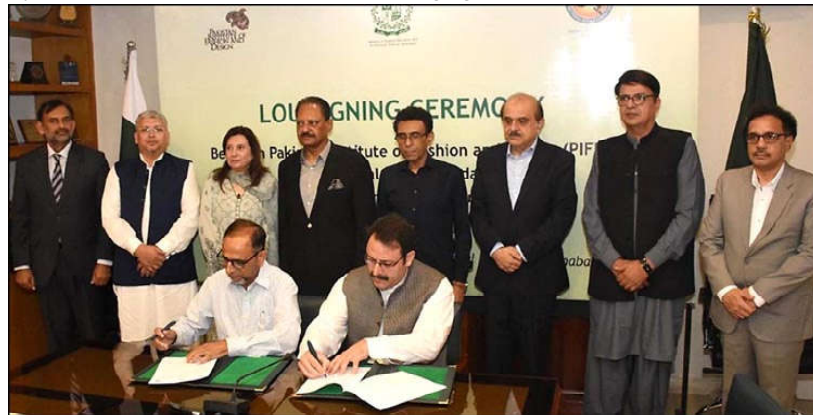
ISLAMABAD: In a significant step towards advancing education and skill development in the fields of design, the Pakistan Institute of Fashion & Design (PIFD) and the National Book Foundation (NBF) have signed a Letter of Understanding (LOU) to establish a new PIFD campus in Karachi in the presence of honourable Federal Minister Dr. Khalid Maqbool Siddiqui.

According to the Official sources from the Education Ministry, this initiative in collaboration with Allah wala Trust aims to combat anemia among students, ensuring they receive the necessary nutrients for optimal health and academic performance.