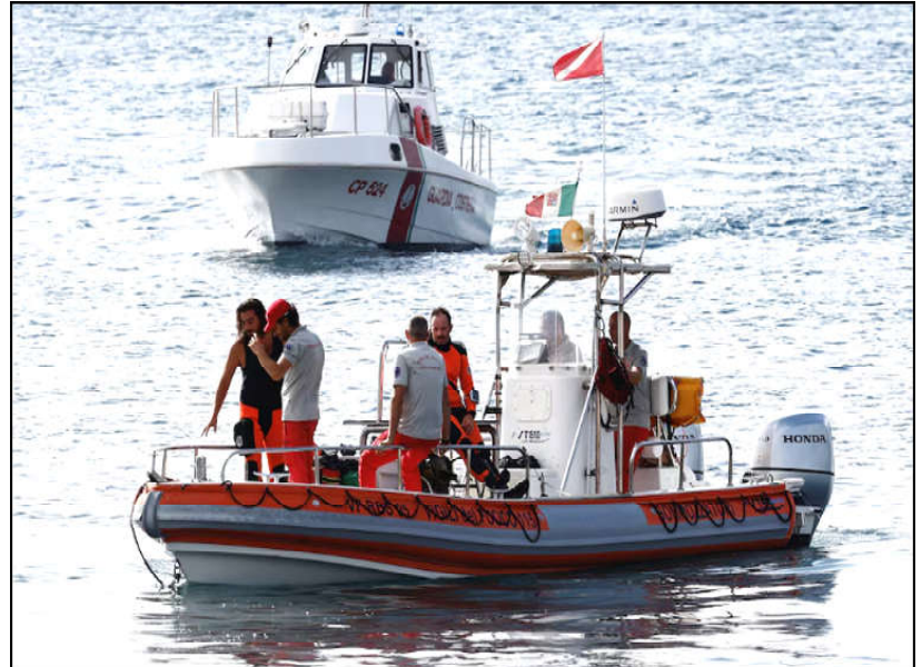
Rescue personnel operate on boats on the sea near the scene where a luxury yacht sank, off the coast of Porticello, near the Sicilian city of Palermo, Italy.

The pandemic may have created a backlog of people wanting to leave for what Kiwis call their "OE" — overseas experience.