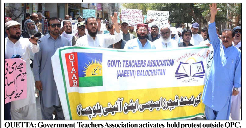
QUETTA: Government Teachers Association activates hold protest outside QPC.