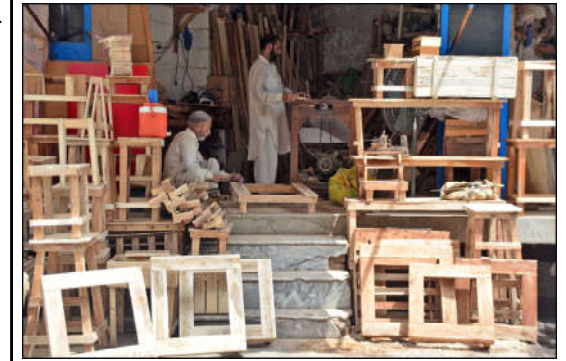
RAWALPINDI: Workers busy in making wooden items on their workplace at Banni chowk area in the city.