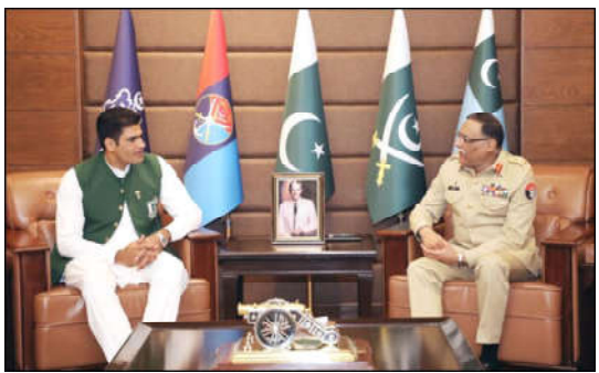
(CJCS), General Sahir Shamshad Mirza here on Tuesday at Joint Staff Headquarters.

RAWALPINDI: Arshad Nadeem, record-holder Olympian, called on Chairman Joint Chiefs of Staff Committee