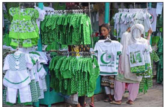
ISLAMABAD: A boy selling clothes at Sasta Bazaar H-9 in the Federal Capital.

huge scarcity of skilled manpower in all sectors and technical colleges and institutes are lacking capacity to enroll required number of students meeting ever increasing demand of industrial sectors. He said, a skilled workforce contributes to higher productivity and quality in manufacturing and services, leading to increased exports and foreign investment. This, in turn, generates job opportunities, reduces unemployment, and improves living standards. He said skilled professionals in manufacturing, engineering, and information technology and other sectors are essential for addressing the country's socio-economic challenges, such as healthcare access and digital transformation. He added that investing in education and training programs that emphasize modern scientific and technical skills is essential for Pakistan's long-term prosperity.