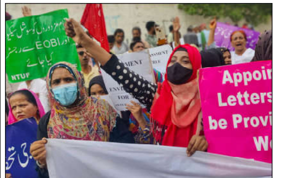
KARACHI: Home Based Women Workers Federation is protesting outside the Press Club of Thekidari Nizam.