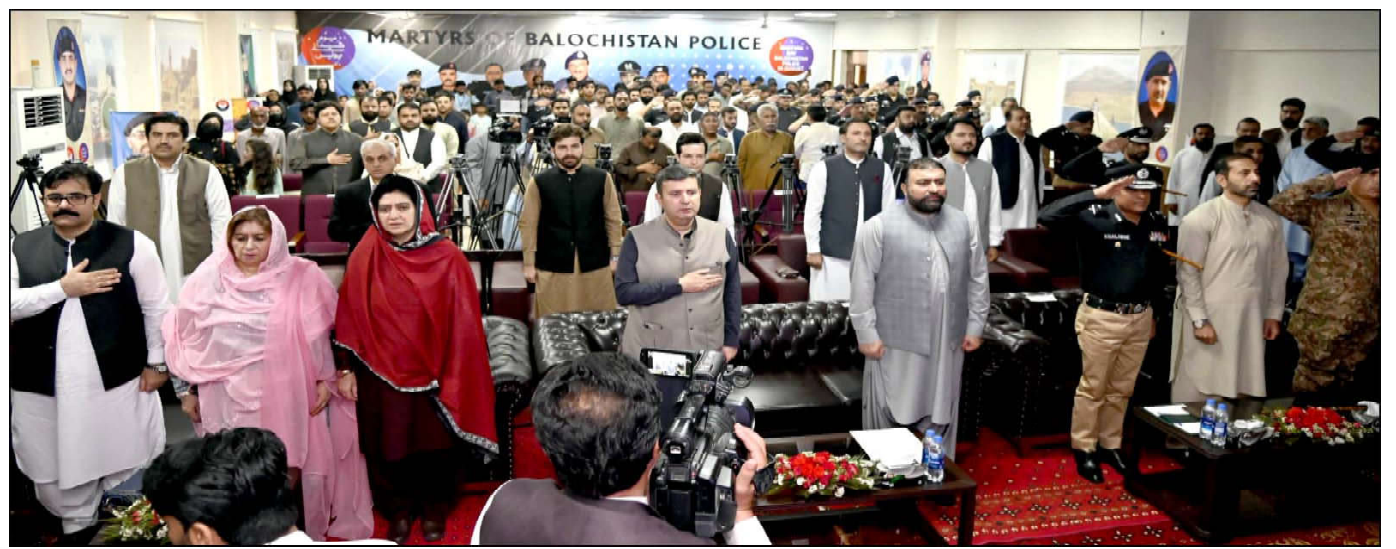
QUETTA: Chief Minister Balochistan Mir Sarfaraz Ahmed Bugti and others standing in respect of National Anthem during a ceremony held in collection with Youm-e-Shuhada-e-Police at Central Police Office