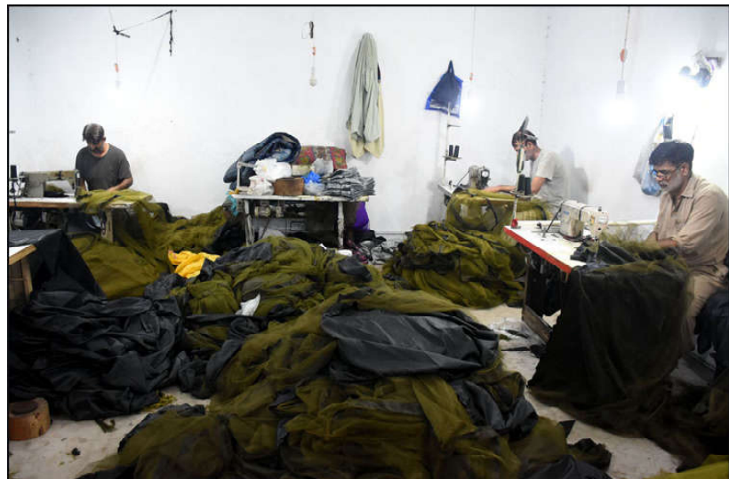
LAHORE: Tailors preparing mosquito nets in a factory to prevent dengue mosquito-borne diseases from the water of monsoon rains.

Pakistani industrialists and think tanks. The discussions covered a broad range of topics, including technology transfer, industrialization, economic policy, industrial development, and sustainable growth. The interaction provided a platform for the exchange of ideas, fostering a collaborative approach to addressing economic challenges. Zaki Aijaz emphasized that Pakistan is poised for a new era of economic growth and regional connectivity through the dynamic framework of the China-Pakistan Economic Corridor (CPEC). He highlighted that with a young, burgeoning population and a rapidly expanding middle class, Pakistan presents a compelling case for significant investment and development.