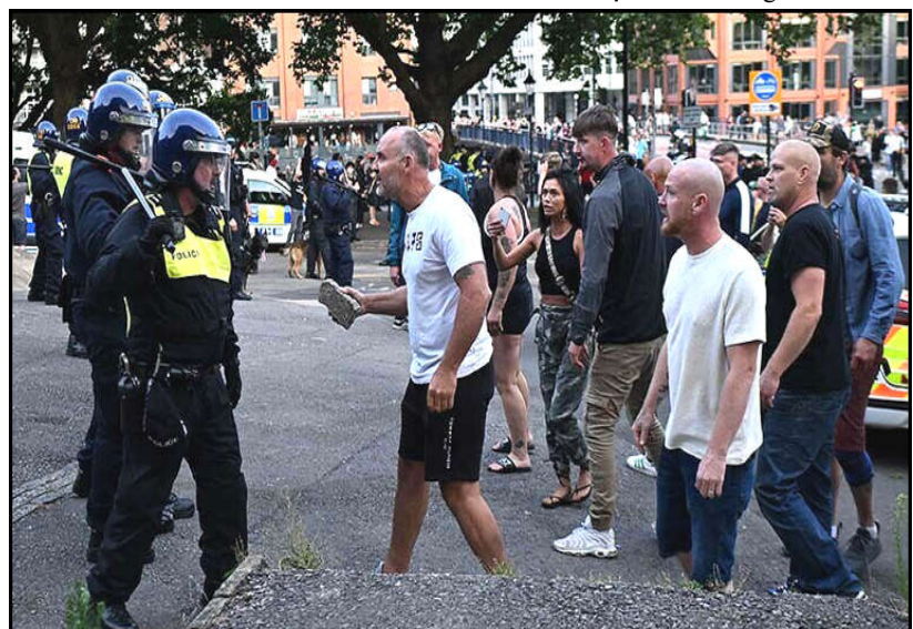
A protester holding a piece of concrete walks towards riot police as clashes erupt in Bristol during the 'Enough is Enough' demonstration.

the Kremlin, dozens of Russians came to mourn the fallen Wagner fighters, a Reuters journalist said. One man, dressed in military clothing and wearing Wagner badges, knelt before pictures of the group's fighters killed in Mali. Beneath flags with the Wagner motto of "Blood, Honor, Motherland, Courage", some lit candles. One woman on knees wept before a picture of a Wagner fighter. Others laid red carnations below pictures of the dead. None of those asked for comment at the makeshift memorial would speak to Reuters. Mali, where military authorities seized power in coups in 2020 and 2021, is battling a years-long Islamist insurgency.