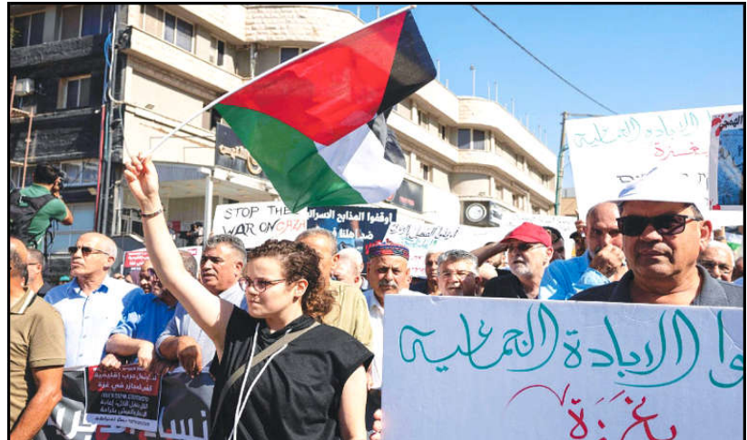
UMMALFAHEM: Arab-Israelis and left-wing activists lift flags of Palestine and placards to protest Israel's aggression in Gaza.

Critics of Hasina, along with human rights groups, have accused her government of using excessive force against protesters, a charge she and her ministers deny. Demonstrators blocked major highways on Sunday as student protesters launched a non-cooperation program to press for the government's resignation, and violence spread nationwide. "Those who are protesting on the streets right now are not students, but terrorists who are out to destabilise the nation," Hasina said after a national security panel meeting, attended by the chiefs of the army, navy, air force, police and other agencies. "I appeal to our countrymen to suppress these terrorists with a strong hand." Police stations and ruling party offices were targeted as violence rocked