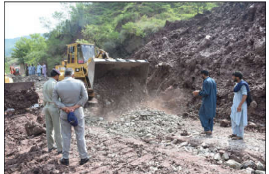
MUZZAFFARABAD: NHA staff restoring the road blocked by the landslide at Kohala Road Dulai area.

Kashmiri brothers and it would continue to support their right to self-determination. Arora appealed to the international community to take notice of human rights violations in Kashmir and put pressure on India to grant Kashmiri people their rights. He added that the struggle for Kashmir's freedom will continue, and we will keep advocating for Kashmir at every forum.