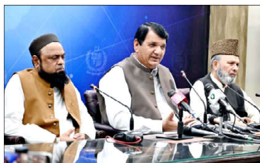
ISLAMABAD: Federal Minister for Kashmir Affairs Engineer Amir Muqam along with All Parties Hurriyat Conference (APHC) leadership addressing a press conference at PID Media Center.

All these measures are in blatant violation of the United Nations Security Council resolutions and international law, including the 4th Geneva Convention, he observed.