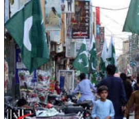
QUETTA: On the occasion of the arrival of Independence Day, candles are being waved on decorated Pakistani candles in the market.