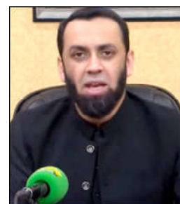
Supreme Court, Justice Aminuddin Khan and Jus

Addressing a press conference here, he said that on the issue of reserved seat a party was provided relief which was not a petitioner. He said that two honourable judges of the