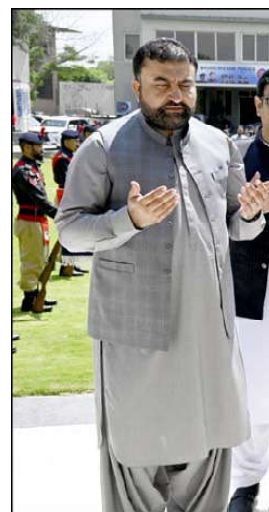
QUETTA: Chief Minister Balochistan Mir Sarfaraz Ahmed Bugti offering Dua after laying floral wreath at Yadgar-e-Shuhada at Central Police Office Quetta

Meanwhile Speaker National Assembly Sardar Ayaz Sadiq Sunday said that the resolution of the Kashmir dispute is essential for achieving lasting peace in the region.