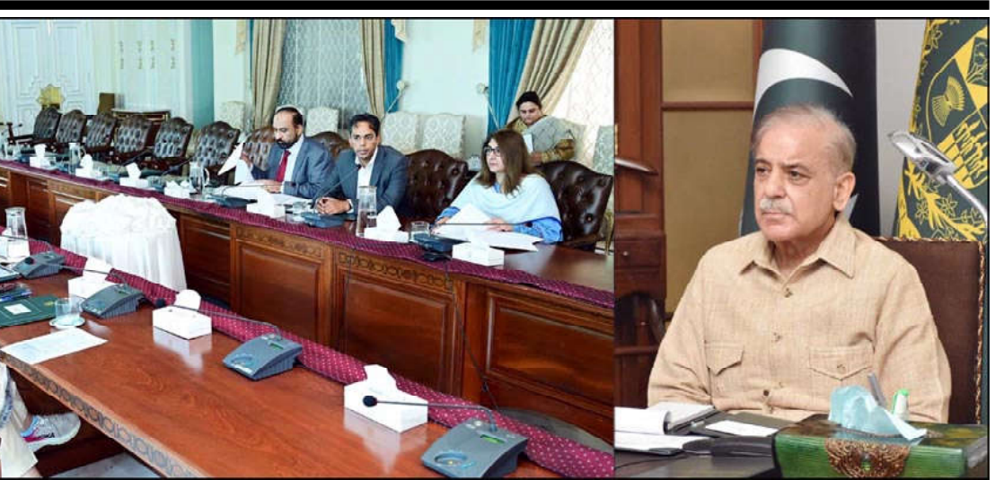
LAHORE: Prime Minister Muhammad Shehbaz Sharif chairs a review meeting regarding FBR Track & Trace System and FBR Transformation.

ISLAMABAD (APP): Chairman Senate Syed Yousaf Raza Gilani stated on Sunday that August 5, 2019, will be remembered as a dark day in history when the Indian government unlawfully annulled the special status of Occupied Jammu and Kashmir.