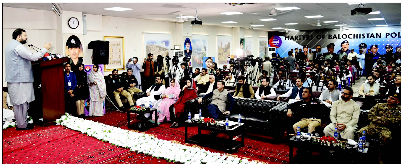
QUETTA: Chief Minister Balochistan Mir Sarfaraz Ahmed Bugti addressing a ceremony held in collection with Youm-e-Shuhada-e-Police at Central Police Office

Ph: 2841470/2841473 REG: No. BC-116 B/ID-445 Vd: XXV No. 343, Muharram 29, 1446 AH Monday August 05, 2024 Pages 08, Price Rs.15