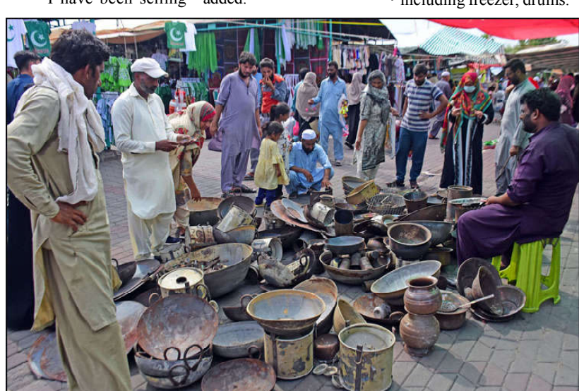
ISLAMABAD: A vendor selling burned items at Sasta Bazaar H-9 in the Federal Capital.