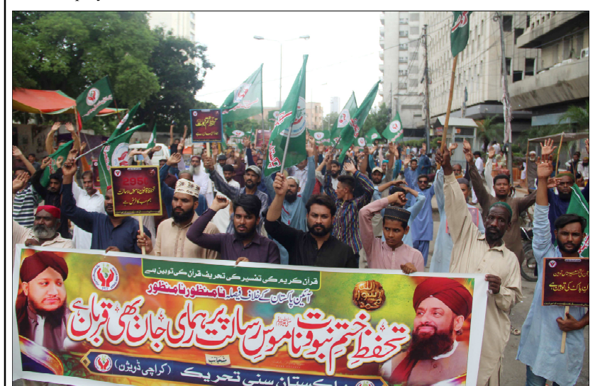
KARACHI: Activists of Pakistan Sunni Tehreek raise slogan outside the Karachi Press Club

"People-centric development cannot be realized without the timely provision of disaggregated public data, which is crucial for developing nuanced and well-informed policies," emphasizing the media's pivotal role in advocating for voluntary family planning.