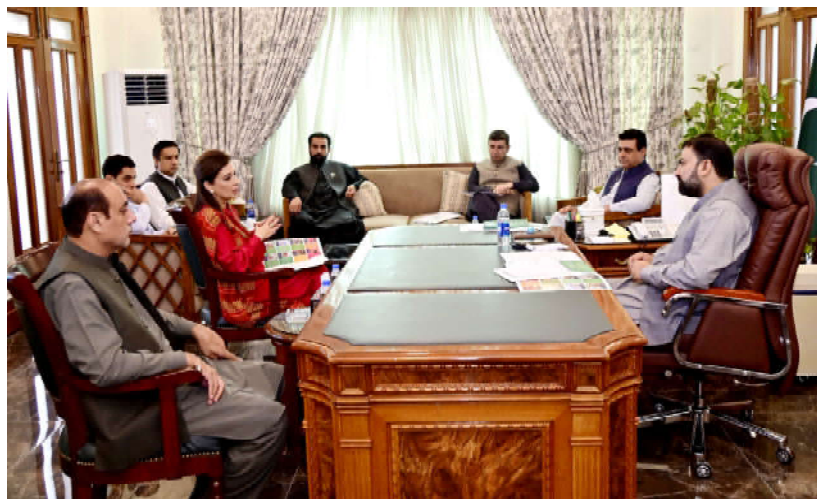
QUETTA: Focal Persons of PM for Anti Polio Ayesha Raza meeting with Chief Minister Balochistan Mir Sarfaraz Ahmed Bugti. Provincial Ministers are also present