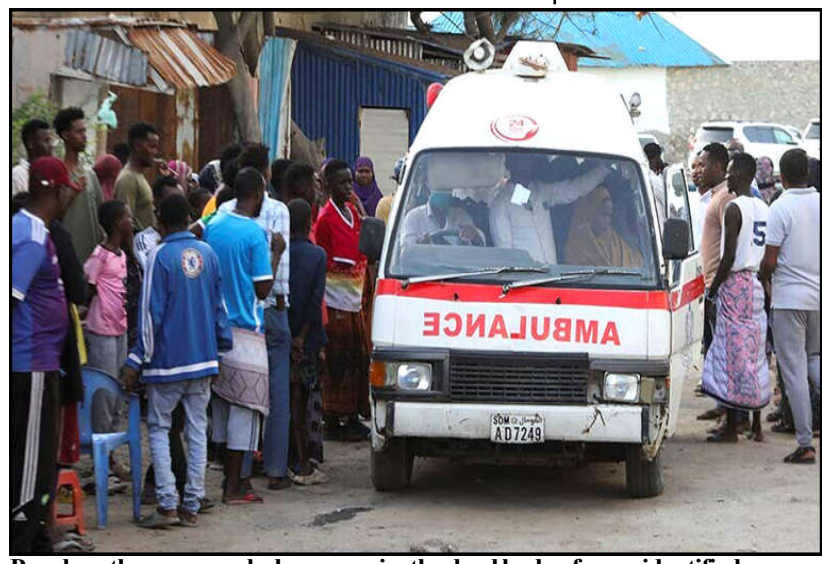
People gather as an ambulance carries the dead body of an unidentified woman killed in an explosion that occurred while revellers were swimming at the Lido beach in Mogadishu.

Monitoring Desk BEIJING: Swaths of eastern China baked under a scorching heat wave on Saturday, with temperatures in some areas reaching record highs, weather authorities said. China is enduring a summer of extreme weather, with unseasonable heat searing parts of the north and east while torrential rains have triggered floods and landslides in central and southern regions. The country is the world's largest emitter of the greenhouse gases that scientists say drive global warming and make extreme weather more frequent and intense.