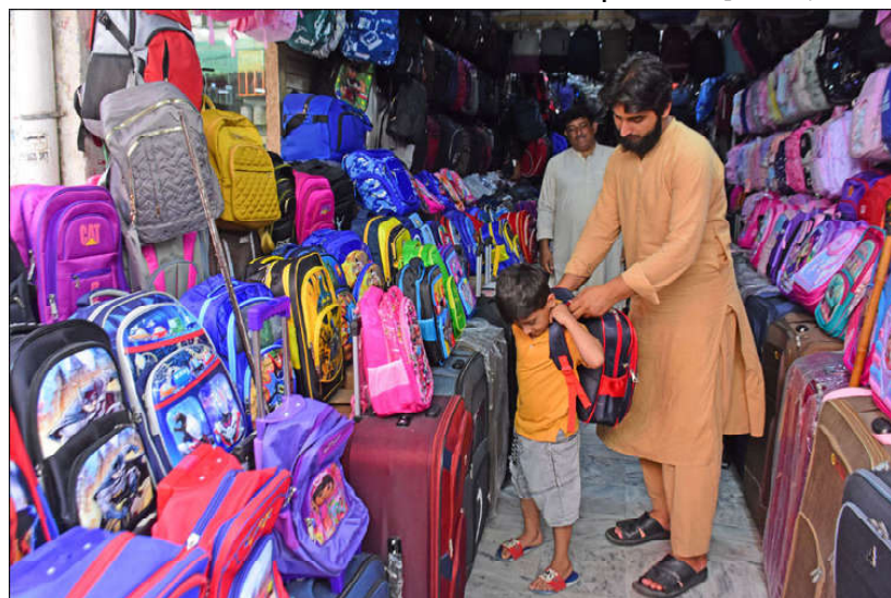
ISLAMABAD: Summer vacations are over, students getting ready for school, purchasing new bags and books.