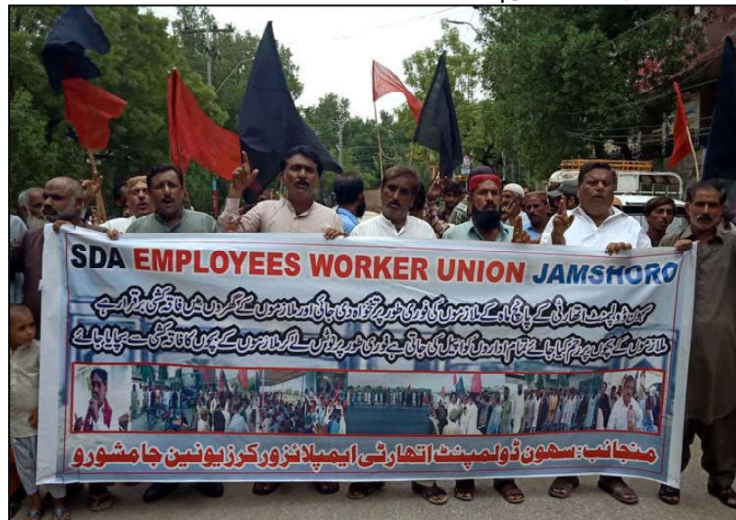
HYDERABAD: Members of Schwan Development Authority Employees Workers Union are holding protest demonstration against non-payment of their salaries, at Hyderabad press club