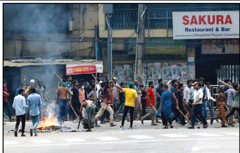
Objects set on fire burn as demonstrators with sticks occupy the street during a protest demanding the stepping down of Bangladeshi Prime Minister Sheikh Hasina, following quota reform protests by students, in Dhaka, Bangladesh.