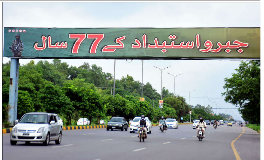
ISLAMABAD: Posters and flags displayed on different roads of the Federal Capital, urge people to mark the Youm-e-Istehsal (Exploitation Day), Jammu Kashmir falling on 5th August.

sities unable to manage payments within their current financial resources. The VCs have made continuous efforts to resolve the financial issues, including meetings with the President of AJK/Chancellor of the universities and the Chairman of the Higher Education Commission. As a result, the President expressed concerns in a letter to the Prime Minister of AJK on June 7, 2024, warning that the absence of financial support from the AJK government could lead to potential unemployment of faculty and staff and affect over 30,000 students enrolled in higher education programs.