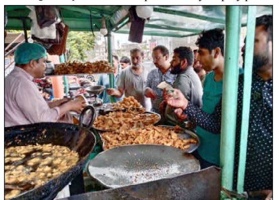
SIALKOT: A large number of people purchasing traditional food item "pakoras" from vendor during heavy in the city.

magistrates visited 42,607 shops, vendors, and business centers throughout the district to check the pricing of food items. During these inspections, a total fine of Rs 5,221,000 was imposed for violations of price regulations. Additionally, two cases were registered against violators at local police stations, three shops were sealed, and 307 merchants were apprehended at the scene. The Deputy Commissioner of Bahawalpur has instructed shopkeepers to prominently display price.