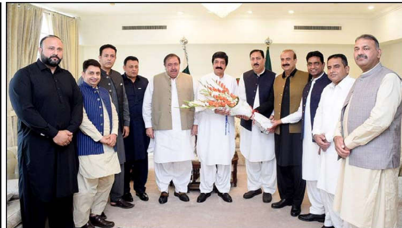
LAHORE: Punjab Governor, Sardar Saleem Haider Khan in a group photo with delegation of overseas Pakistanis led by the leader of Pakistan People's Party and Chairman Pakistan Sweet Home, Zamard Khan (Hilal Imtiaz).

LAHORE (APP): At least seven people were killed and 1,240 others injured in 1,184 road accidents in Punjab during the last 24 hours. As many as 550 people with serious injuries were shifted to different hospitals, while 690 with minor injuries were treated at the incident site by rescue medical teams. The data analysis showed that 711 drivers, 15 underage drivers, 125 pedestrians, and 411 passengers were among the victims of road crashes. The statistics showed that 258 accidents were reported in Lahore, which affected 279 people, placing the provincial capital at top of the list, followed by Faisalabad with 93 accidents and 103 victims, and at third Gujranwala with 66 accidents and 58 victims. According to the data, 1,080 motorbikes, 79 auto-rickshaws, 103 motorcars, 24 vans, six passenger buses, 27 truck and 110 other types of vehicles and slow-moving carts were involved in the road accidents.