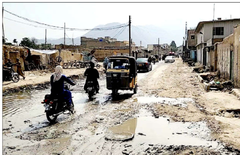
QUETTA: Commuters are facing problem in transportation due to wreckage and worst condition of road, creating problems for commuters and they demand to concerned department to construction of road as soon as possible, in Quetta

He said that it is necessary for success of the polio immunization campaign to create awareness among general public. In this regard, there is a key role of religious leaders, mass media and civil society so as to eradicate polio fully, adding he stressed.