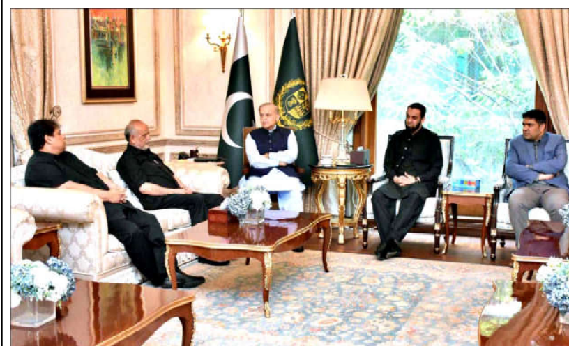
LAHORE: Prime Minister Shehbaz Sharif chairing a review meeting on Track and Trace System