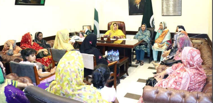
OUETTA: President PPP Women Wing Balochistan and Deputy Speaker Balochistan Assembly Ghazala Gola in a meeting with office bearers of the women wing