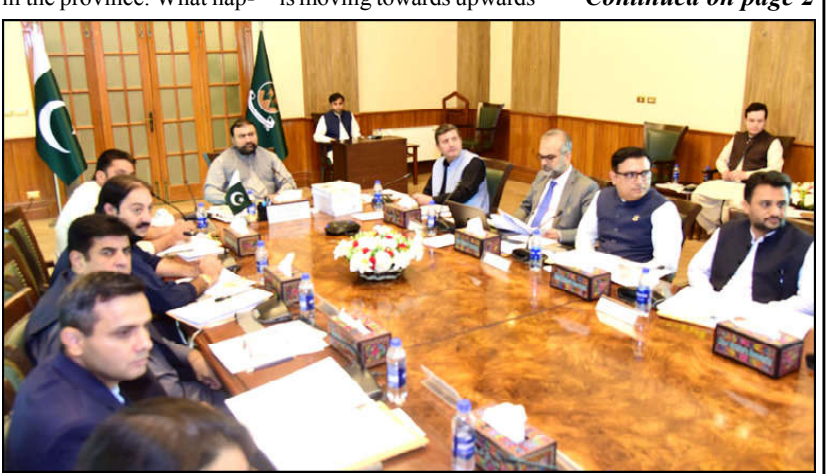
QUETTA: Chief Minister Balochistan Mir Sarfaraz Ahmed Bugti presiding over meeting of Disaster Management Commission