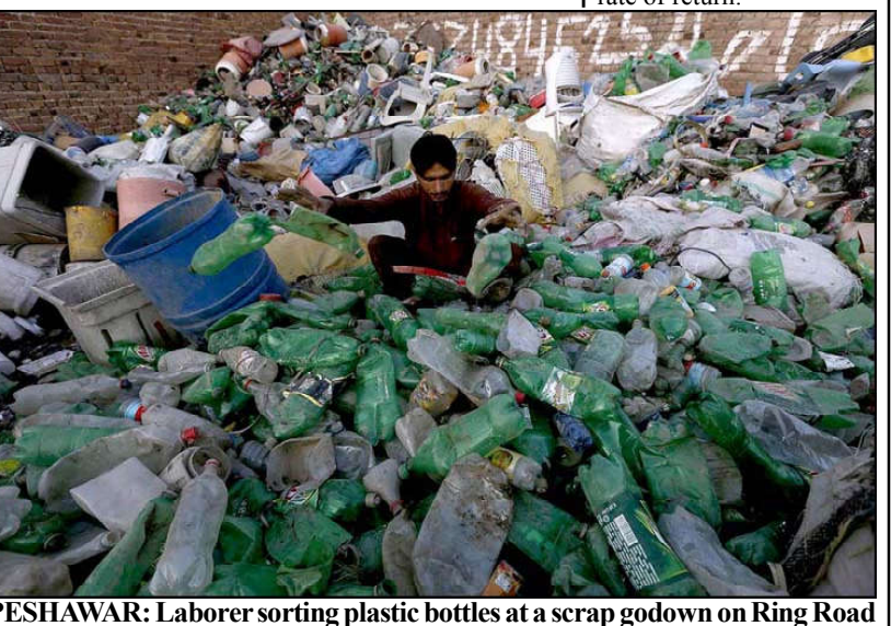
PESHAWAR: Laborer sorting plastic bottles at a scrap godown on Ring Road for recycling purposes.