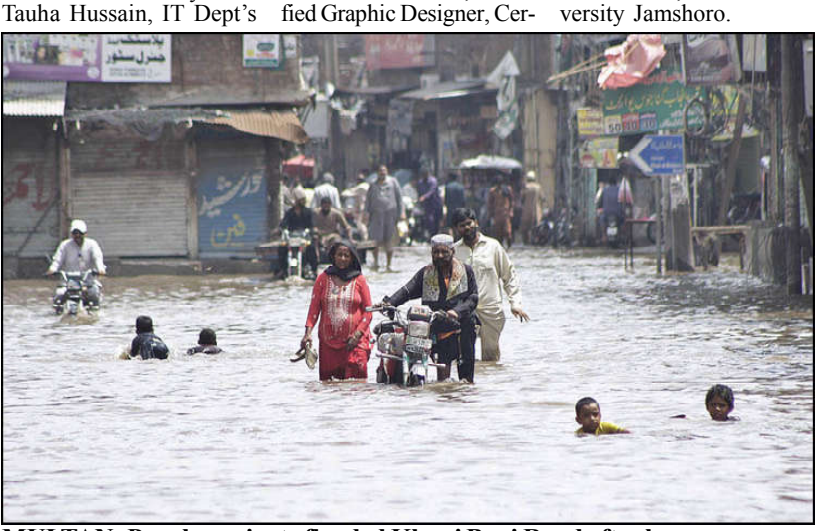
MULTAN: People navigate flooded Khuni Burj Road after heavy monsoon

At the conclusion, an MoU was signed by the Sindh IT Secretary with NED University Karachi, IBA Sukkur, Mehran University Jamshoro.