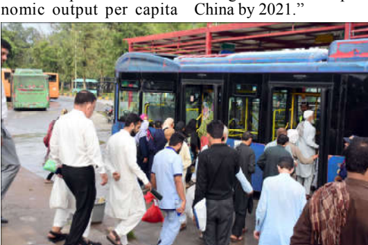
ISLAMABAD: Passengers stand in line to board Blue Line bus in front of PIMS hospital, in the

Cultural exchanges, including festivals and educational programs, further enhance China's soft power, with over 400,000 international students benefiting from scholarships in China by 2021."