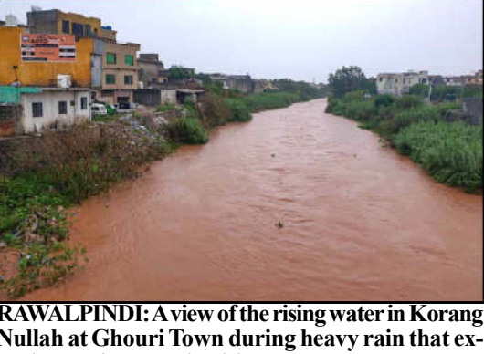
Nullah at Ghouri Town during heavy rain that experienced in the twin cities.