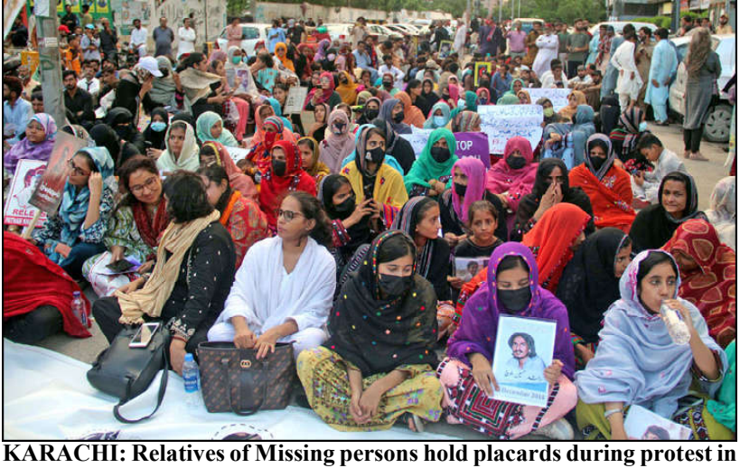
favor of their demands outside press club, in the Provincial Capital.