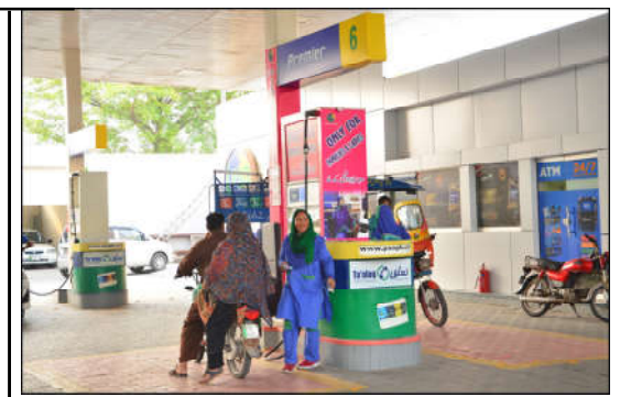
FAISALABAD: A girl filling petrol at a petrol pump at Jail Road.

She stressed the monitoring of the bidding process and instructed that the rate list should be issued in the morning and delivered to all shops and vendors. She said that shopkeepers should sell food items at fixed rates so that there is no need of action in the markets and bazaars.