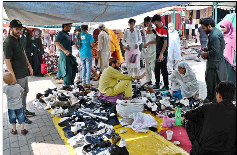
ISLAMABAD: People busy in selecting and purchasing second hand shoes from vendor at Weekly Bazaar Peshawar Mor in Federal Capital.