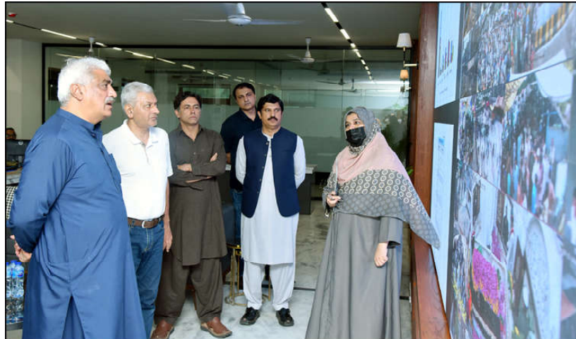
LAHORE: Provincial Minister for Health and Chairman Cabinet Committee for Law and Order Khawaja Salman Rafique inspecting the arrangement regarding Chehlum route during his visit to Central Control Room.