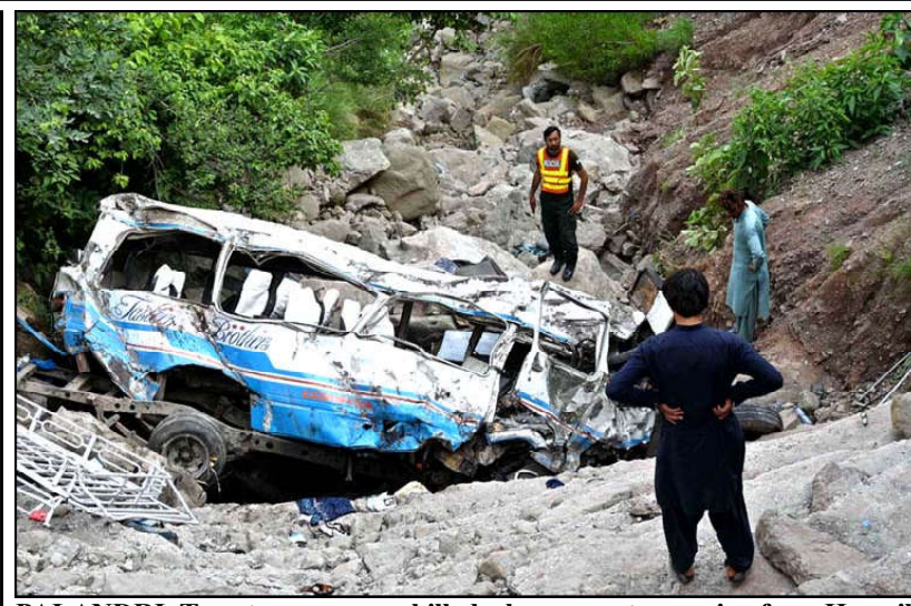
PALANDRI: Twenty passengers killed when a coaster coming from Hawaii Kahuta to Rawalpindi fell into a ditch near Azad Pattan.