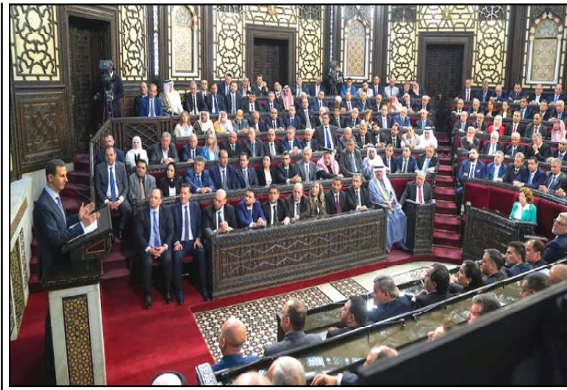
Syria's President Bashar al-Assad speaks to the Syrian parliament in Damascus, Syria.