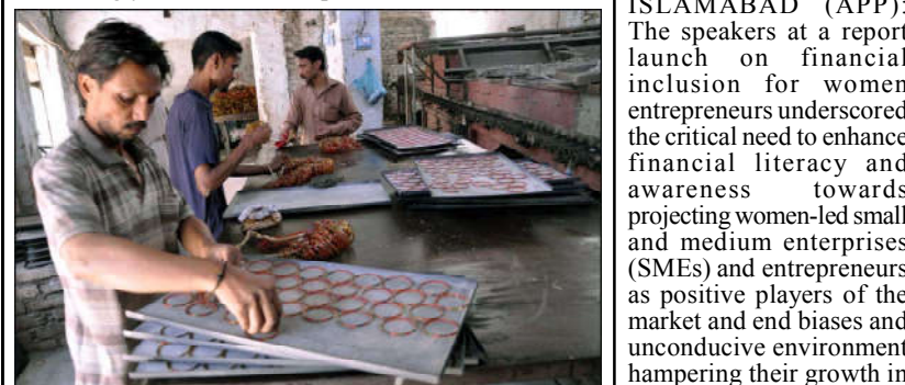
HYDERABAD: Laborers are packing bangles for selling at a workshop, during the hot weather of summer season, in Hyderabad.

The surge in beggars is linked to high foot traffic at commercial hubs like Dean's Trade Centre and various bustling bazaars of Peshawar. Both professional and amateur beggars are employing a range of tactics to solicit donations, targeting shoppers and drivers at key intersections and near public facilities.