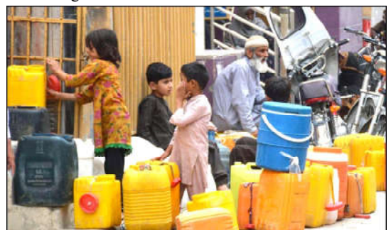
QUETTA: Children filling their canes with clean water at Rehmat Colony Sakri road due to shortage of clean drinking water in the city.

Nascerabad, Kalat, Lasbela, and Loralai. Additionally, scattered thunderstorms and heavy rainfall are also expected in Harnai, Ziarat, Kachi, Sibi, Jhal Magsi, and Khuzdar. The heavy rainfall may pose a risk of flash flooding in these areas. The Regional Meteorological Center has warned of a high risk of flooding in districts including Awaran, Lasbela, Hub, Khuzdar, Kohlu, Dera Bugti, Loralai, Barkhan, Musakhel.