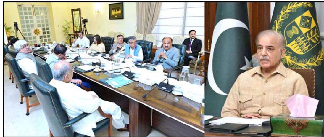
LAHORE: Prime Minister Muhammad Shehbaz Sharif chairs a meeting regarding the closing down of the Public Works Department.