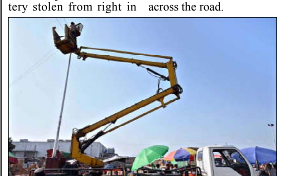
ISLAMABAD: IESCO worker busy in repairing street light at Fruit and Vegetable Market in the Federal Capital.