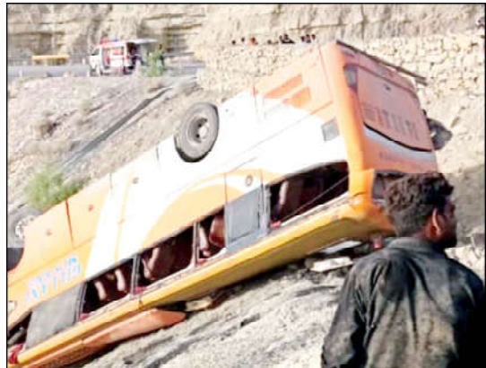
HUB: View of passenger bus fell into ditch after traffic accident due to over speeding and brake failed, at Makran Coastal Highway at Bazi Lak near Hub.