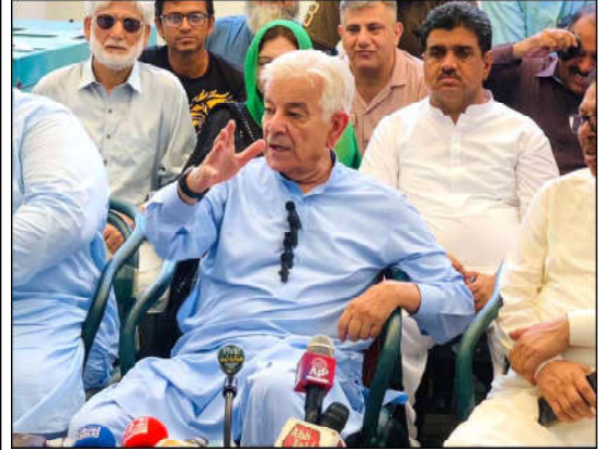
SIALKOT: Defense Minister Khawaja Muhammad Asif addressing to media persons at his residence.

The Governor made it clear that we can get guarantee of the economic and political stability after increasing the public rights and authority.