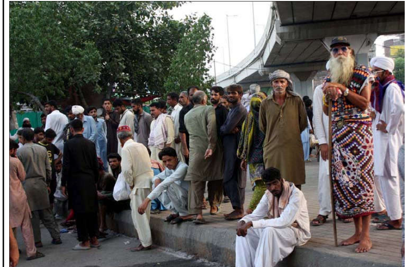
LAHORE: A huge number of devotees of Hazrat Ali Bin Usman Hajveri, popularly known as Data Ganj Bakhsh (RA) are gathered to attend 981th Annual Urs celebrations held at his shrine in Lahore.