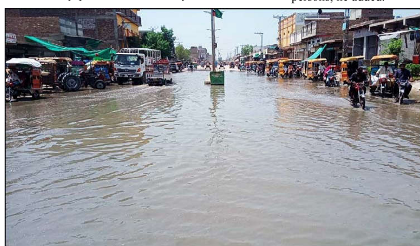
LARKANA: View of stagnant sewage water creating problems for residents and commuters due to the worst sewerage system showing negligence of Municipal Corporation at Miro Khan Chowk in Larkana.

evaporation rates. Yields of wheat and rice are expected to decline subject to water availability. Mortality due to extreme heat waves may increase. Urban drainage systems may be further stressed by high rainfall and flash floods. While talking to APP, Ahmad Zeb Khan the climate expert associated with Serve organisation suggested that to achieve the goal of sustained economic development, we have to work on these objectives. First, To pursue sustained economic growth by appropriately addressing the challenges of climate change. Second, To focus on pro-poor gender-sensitive adaptation, while also promoting mitigation to the extent possible in a cost-effective manner. Third, To ensure water security, food security and energy security of the area in the face of the challenges posed by climate change. Fourth, To minimize the risks arising from the expected increase in frequency and intensity of extreme weather events such as floods, droughts, and tropical storms. and Fifth, To establish a proper mechanism of early warning system to minimize damages and loss of life, he added. In 2022, the 233 villages of five Tehsils of District DIKhan were hit by hill torrents due to climate change, at almost mid night. The flood entered the houses and damaged them totally or partially. The main reason was choking of flood drains