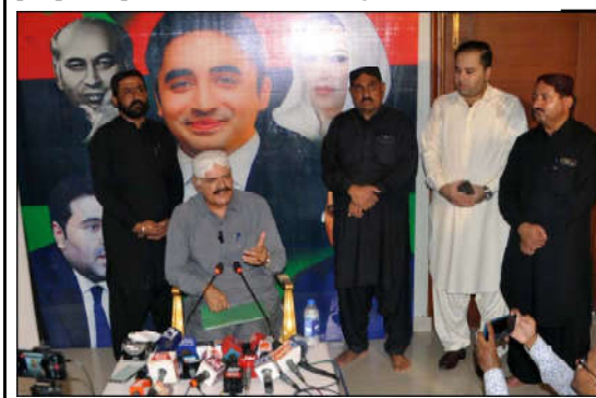
HYDERABAD: Sarwari Jamaat Head and Peoples Party (PPP) MPA, Makhdoom Jameel-uz-Zaman addresses to media persons during press conference held at Hyderabad press club.

LAHORE (APP): Punjab Food Minister Bilal Yaseen Sunday checked the quality of milk at 'Sabeel' points, set up at Data Darbar and in its surroundings in connection with the ongoing annual urs celebrations of Hazrat Data Ganj Bakhsh. According to official sources, the minister directed the dairy safety teams to check quality of milk at entrance points of the provincial capital besides checking the milk quality in old city of Lahore. Bilal Yaseen said that food safety teams of the Punjab Food Authority would remain deputed in surroundings of the Darbar till the last day of urs. He said that supervision of food items would also be carried out at food preparing centres in the surroundings of the Data Darbar and added that poor quality of food items would not be tolerated at all.