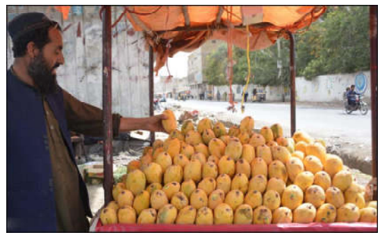
QUETTA: A vendor displaying mangoes to attract the customers.

They said the Railways Police Help Desks had been established at all the major railway stations across the country.