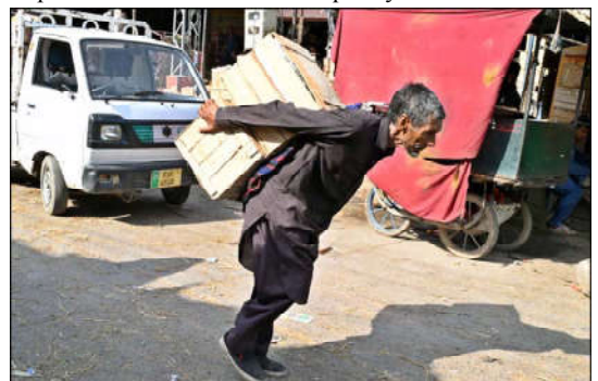
ISLAMABAD: A labourer shifting wooden fruit boxes at Fruit and Vegetable Market in the Federal Capital.