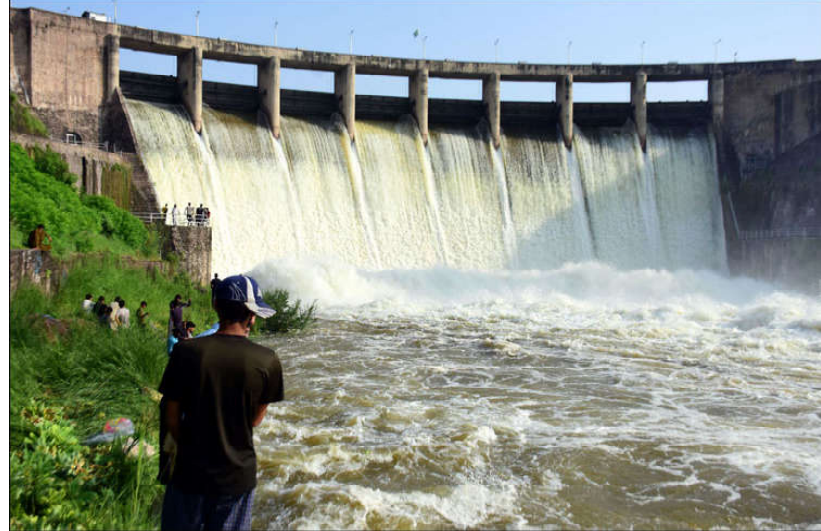
ISLAMABAD: District administration opened the spillways of Rawal Dam on August 25 at 6 am, and is actively monitoring the situation at rivers and bridges and has completed preparations for potential flood scenarios.