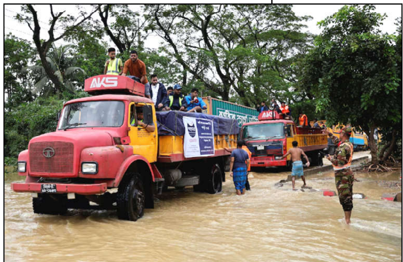
A member of the Bangladesh army directs trucks carrying relief supplies for flood-affected people in Feni, Bangladesh.

Monitoring Desk SAN FRANCISCO: Meta said on Friday it had warned US presidential campaigns to be wary after it claimed discovering an Iran-linked hacking attempt using the WhatsApp messaging service. The statement is the latest from a tech giant of hacking threats ahead of the November election between Vice President Kamala Harris and former president Donald Trump, after Google and Microsoft earlier claimed uncovering similar attempts attributed to Iran. WhatsApp accounts linked to an Iranian "threat actor" sent messages pretending to be technical support for AOL, Google, Yahoo or Microsoft, according to Meta. "This malicious activity originated in Iran and attempted to target individuals in Israel, Palestine, Iran, the United States and the UK," Meta said in a post. "This effort appeared to have focused on political and diplomatic officials, and other public figures, including some associated with administrations of President Joe Biden and former president Donald Trump." Accounts involved in what appeared to be "social engineering" — duping people into providing access to networks or vital data — were blocked, according to Meta. An investigation linked the attempts to the same hacking group responsible for similar attacks aimed at political, military, diplomatic and other officials reported by Microsoft and Google, Meta said.