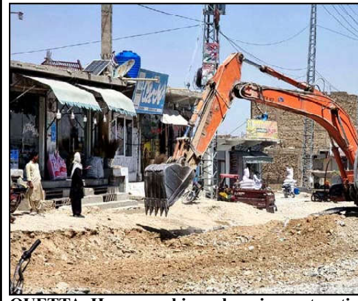
QUETTA: Heavy machinery busy in construction works of road carpeting, at Western Bypass road in Quetta.

Meanwhile, the Bangladesh A team also engaged in batting, bowling, and fielding practice, preparing themselves for the upcoming matches.