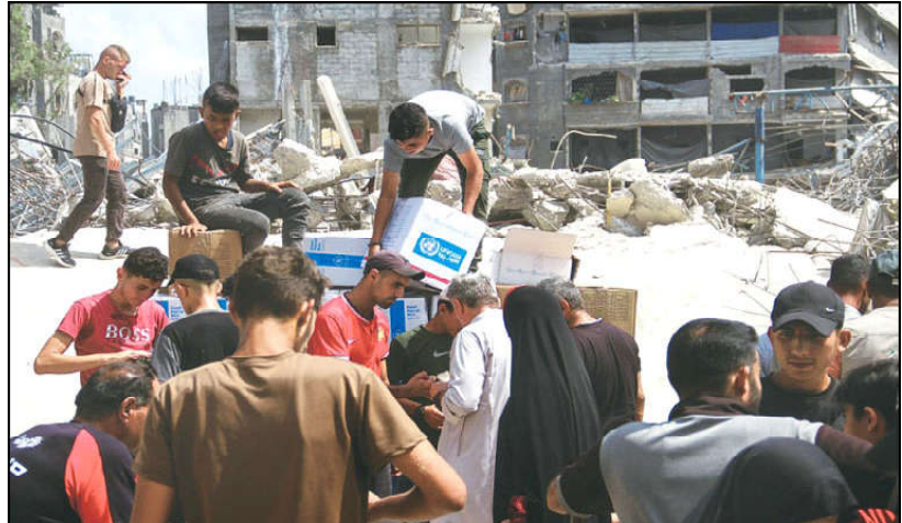
Palestinians gather to receive aid outside a UN distribution centre at Jabalia in the northern Gaza Strip.