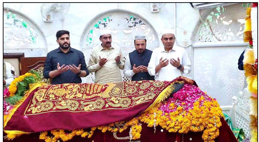
LAHORE: Interior Minister Mohsin Naqvi offering Fataha at the shrine of Hazrat Ali bin Usman Data Ganj Bakhsh Hijveri (RA).