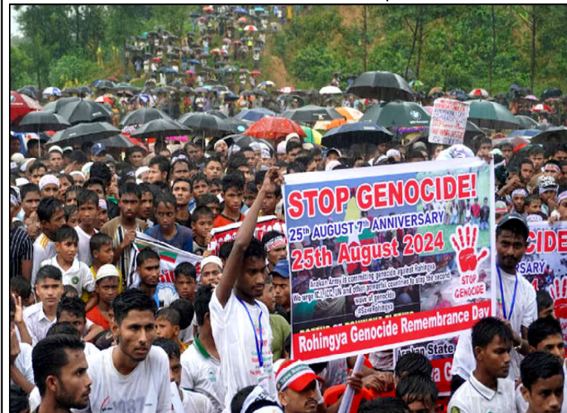
Rohingya refugees gather to mark the seventh anniversary of their fleeing from neighbouring Myanmar to escape a military crackdown in 2017, during heavy monsoon rains in Cox's Bazar, Bangladesh.