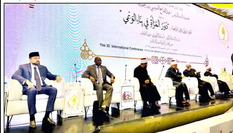
CAIRO: Federal Minister for Religious Affairs and Interfaith Harmony Chaudhry Salik Hussain attending an International Conference on role of women in building awareness.