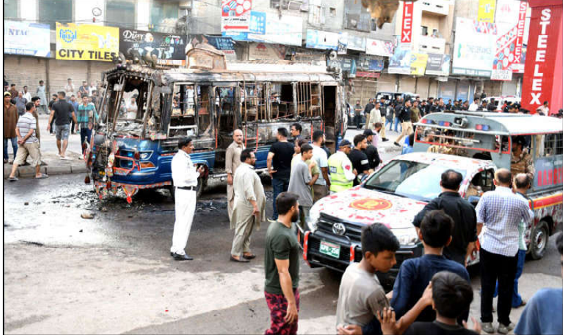
KARACHI: A view of burnt vehicals after two religious groups clash in Karachi.