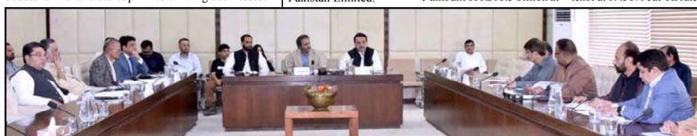
ISLAMABAD: Senator Aon Abbas, Chairman Senate Standing Committee on Industries and Production presiding over a meeting of the committee at Parliament House.

ecosystem. However, despite this potential, 70% of startups face scaling challenges. In 2023, Pakistani startups secured $81.116 million in venture capital across 39 deals, highlighting a significant funding gap compared to regional counterparts. Telenor Pakistan and i2i are determined to address these challenges by creating a robust ecosystem that supports entrepreneurship at every stage. Through this collaboration, Telenor Pakistan will offer i2i's portfolio companies an array of invaluable resources. From tapping into Telenor Pakistan's vast customer base of 44 million to gaining access to cutting-edge technology platforms, startups will receive the support needed to transform their ideas into thriving businesses.