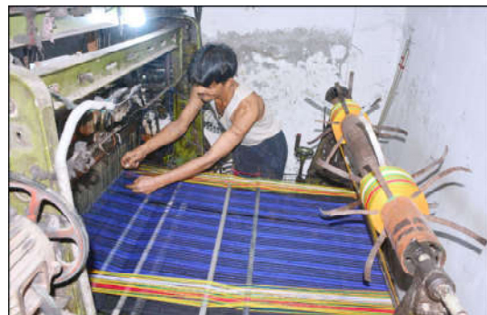
HYDERABAD: A worker is busy operating a power loom to prepare cloth in a local factory.

consulting the traders and addressing their apprehensions. He said that the government was suggested to collect tax on biannual basis where the traders could also enjoy refund facility in their tax return file. He assured the traders that no notice would be issued by the FBR till final amendment in Tajir Dost Scheme. However, he requested the traders to avoid from protest and keep them away from indulging in any kind of negative activities. He said that no advance tax would be levied through Tajir Dost Scheme. This scheme is totally about registration for income tax which has no connection with sales tax. He said that tax would be levied fairly and those would be exempted from advance tax who would provide services of different kinds.