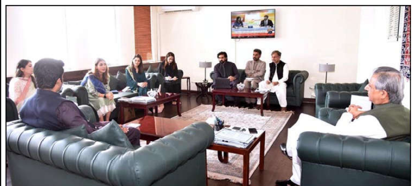
ISLAMABAD: A delegation from Legal Aid Society had a meeting with Federal Minister for Law and Justice Senator Azam Nazeer Tarar in Federal Capital.