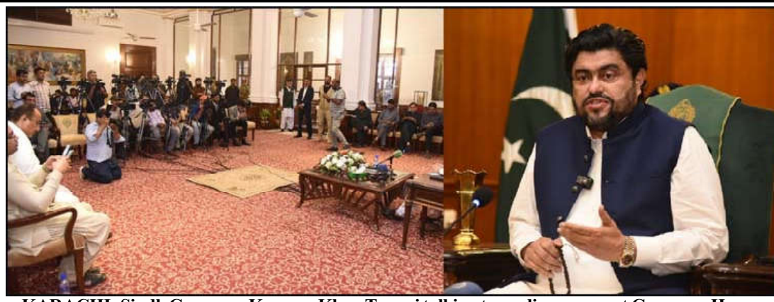
KARACHI: Sindh Governor Kamran Khan Tessori talking to media persons at Governor House.