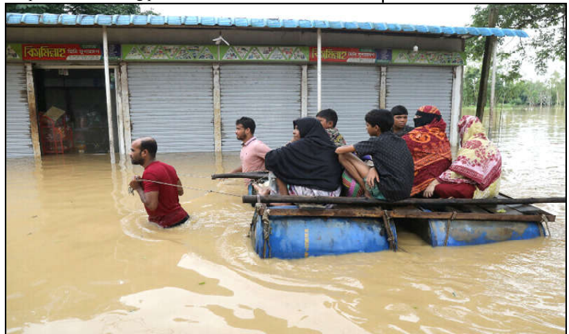
A man moves his cow to a safe place after several districts flooded, at Chhagalnaiya in Feni, Bangladesh.

The war triggered by Hamas's unprecedented October 7 attack on Israel has devastated Gaza, displaced nearly all its population at least once and triggered a humanitarian crisis in the besieged Palestinian territory. Diplomatic efforts have intensified to try to avert a wider war following the high-profile killings of two Iran-backed militants that sparked threats of reprisals from Tehran and its allies, which blamed Israel.