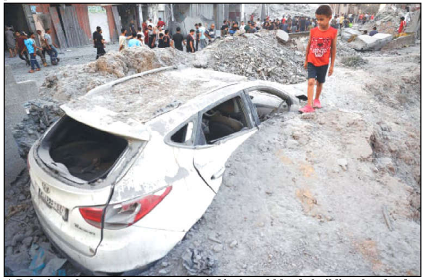
A Palestinian boy stands near a car buried in the rubble of a building shortly after it was levelled by Israeli bombing on the Nuseirat refugee camp, in Gaza Strip.

"We know what a second Trump term would look like," she said, referring to a right-wing think tank's blueprint for a future Republican government. "It's all laid out in 'Project 2025,' written by his closest advisors, and its sum total is to pull our country back to the past."