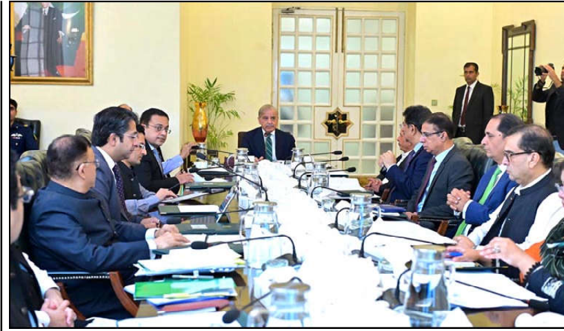
ISLAMABAD: Prime Minister Muhammad Shehbaz Sharif chairs a meeting on matters related to Small and Medium Enterprises Development Authority.