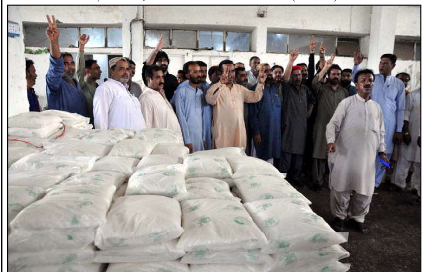
HYDERABAD: Employees of Utility Stores are holding protest demonstration against closure of utility stores, at Qasimabad in Hyderabad.

centres and 51 essential items for all expenditure groups. Likewise, SPI for the lowest consumption group of up to Rs 17,732, witnessed decrease of 0.24 per cent and went down to 310.29 points from last week's 311.04 points. The SPI for the consumption groups of Rs 17,732-22,888; Rs 22,889-29,517; Rs 29,518-44,175 and above Rs 44,175 decreased by 0.22 percent, 0.15; 0.12 percent and 0.05 percent respectively. During the week, out of 51 items, 9 (17.64%) items decreased and 21 (41.18%) items remained stable. The items, which recorded major decrease in their average prices on a week-on-week basis included tomatoes (21.96%)