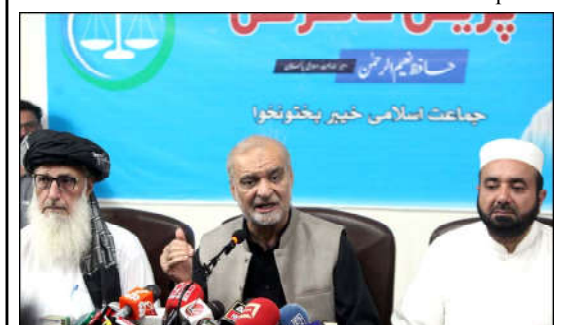
PESHAWAR: Jamat-e-Islami (JI) Chief, Hafiz Naeem-ur-Rehman along with others addresses to media persons during press conference, at Markaz-e-Islami in Peshawar.

pital. The MS briefed the AC about the provision of the health facilities to the patients in the hospital and other issues of it. He informed that the work of restoring the solar system of the hospital has also been started. He said that these medicines would help in timely first medical aid in casualty section of the hospital. The MS thanked the AC and the Otsuka Company for provision of the medicines to the hospital.