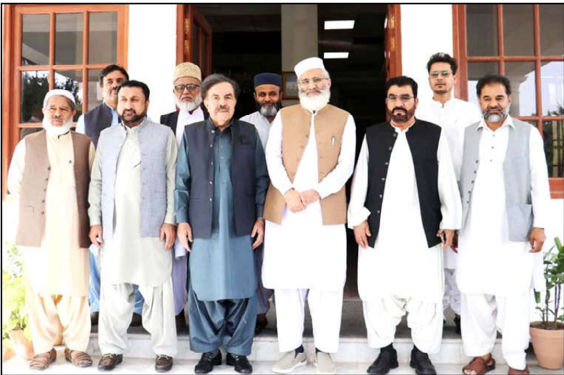
QUETTA: A delegation led by former Ameer Jamaat-e-Islami Sirajul Haq in a group photo with Governor Balochistan Sheikh Jaffar Khan Mandokhail