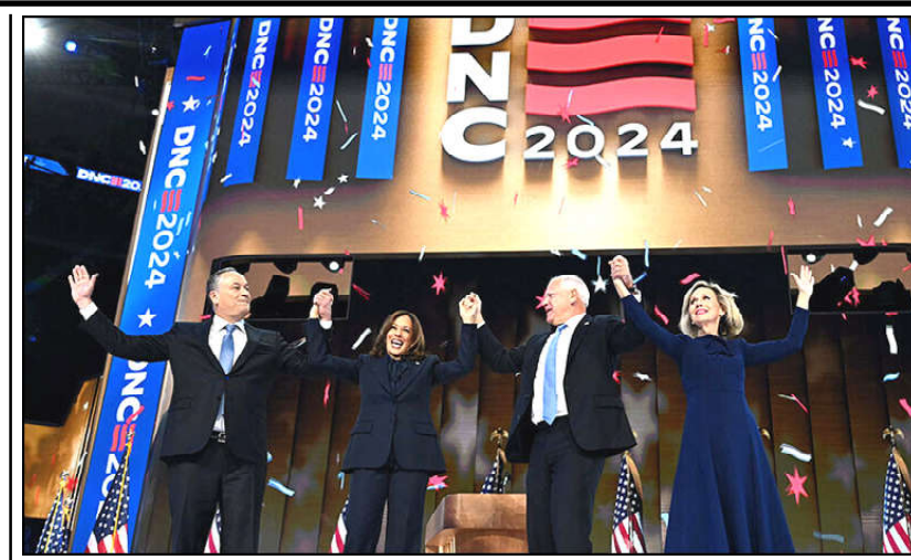
US Second Gentleman Douglas Emhoff, US 2024 Democratic presidential candidate Kamala Harris, Minnesota Governor and 2024 Democratic vice presidential candidate Tim Walz and Tim Walz's wife Gwen Walz hold hands at the end of the fourth and last day of the DNC at the United Center in Chicago, Illinois.

For all the latest headlines follow our Google News channel online or via the app.