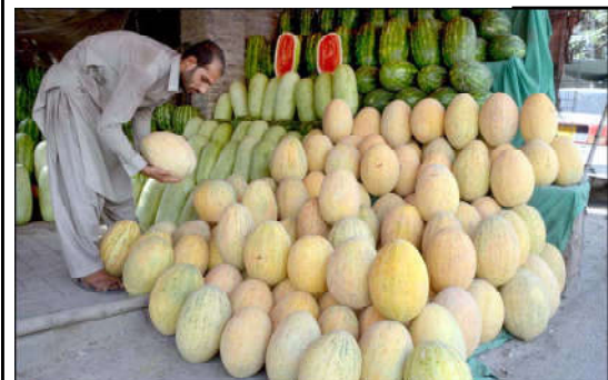
QUETTA: A vendor displaying fresh Melon (Garma) at Joint Road Quetta to attract customers to experience the sweet, juicy flavor of locally grown fruit.