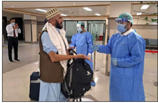
PESHAWAR: Passengers are being screened for M-pox at Bacha Khan International Airport in Peshawar.