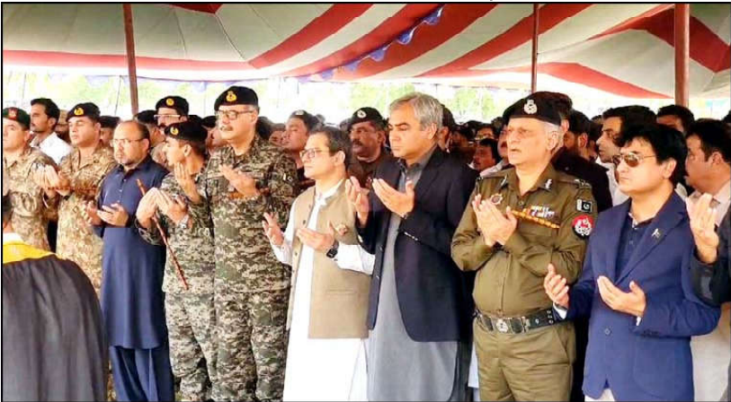
RAHIM YAR KHAN: Federal Minister for Interior, Mohsin Naqvi attending funeral prayer of martyred police personnel in Rahim Yar Khan.