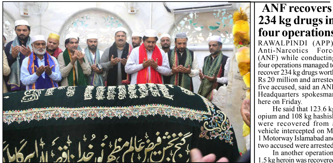
LAHORE: Acting Governor Punjab Malik Ahmad Khan is praying at the Shrine of Data Darbar after placing the Charad.