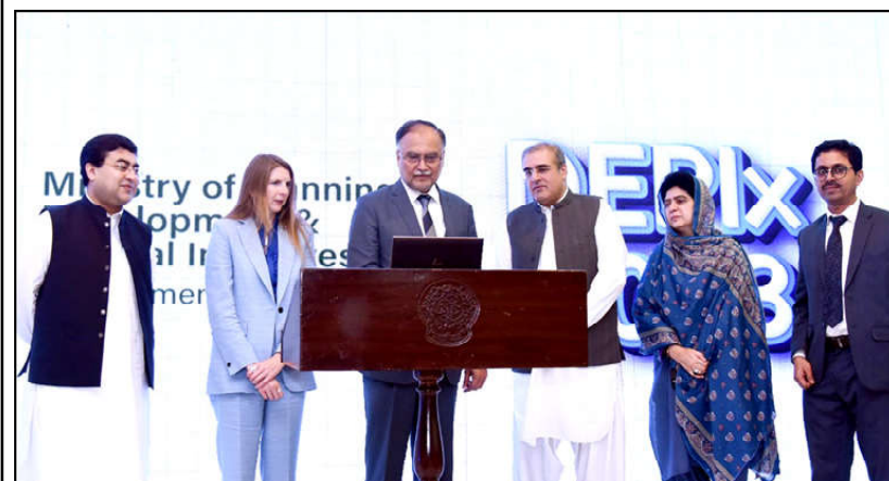
ISLAMABAD: Federal Minister for Planning, Development & Special Initiatives, Ahsan Iqbal, and British High Commissioner to Pakistan, Ms. Jane Marriott, jointly launched the "District Education Performance Index" in Federal Capital.

The Governor exhorted to the ruling elite as well as the political elders, religious scholars and intellectuals to play wholehearted role in finding peaceful solution to the present tense situation.