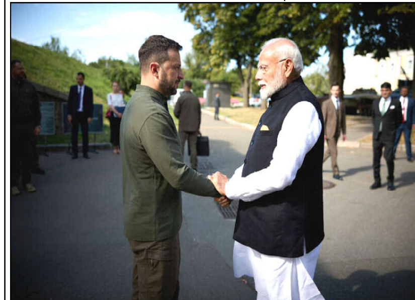
India's Prime Minister Narendra Modi and Ukraine's President Volodymyr Zelenskyy shake hands before commemorating children killed during Russia's attack on Ukraine, in Kyiv, Ukraine.

Rescuers pulled 22 people from the rain-swollen waters of the Marsyangdi river in the Tanahun district, about 118 kilometres from Kathmandu, of which 12 were seriously injured and airlifted to the capital. Police and army teams climbed down long metal ladders to reach the river, using ropes to pull out the injured and dead.