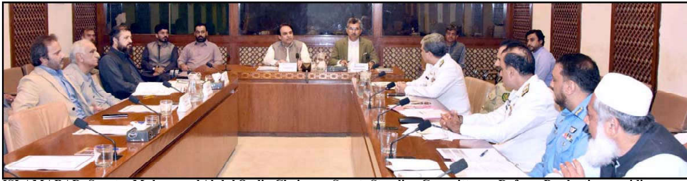
ISLAMABAD: Senator Muhammad Abdul Qadir, Chairman Senate Standing Committee on Defence Production presiding over a meeting of the committee at Parliament House.