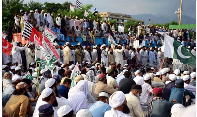
ISLAMABAD: Activists of Aalimi Majlis Tahaffuz Khatm-e-Nubuwwat hold a protest in favor of their demands in front of Parliament house.