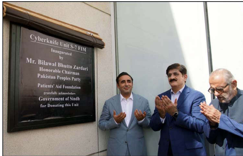
KARACHI: Peoples Party (PPP) Chairman, Bilawal Bhutto Zardari inaugurates new facilities during inauguration ceremony held at Jinnah Hospital in Karachi. Sindh Chief Minister Murad Ali Shah is also present.