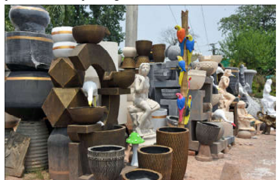
ISLAMABAD: A vendor is displaying decorative sculptures and fancy plant pots attraction for customers at his local nursery along a road in the Federal Capital.

arriving from abroad. After the inspection, the DC directed health officials to speed up the screening process, ensuring that no passenger goes unchecked. On the occasion, the DC expressed his satisfaction with health department staff who were actively screening every passenger coming from foreign countries. He directed that if any symptoms of monkeypox were detected, the patient would be immediately isolated and transferred to PIMS Hospital for further care.