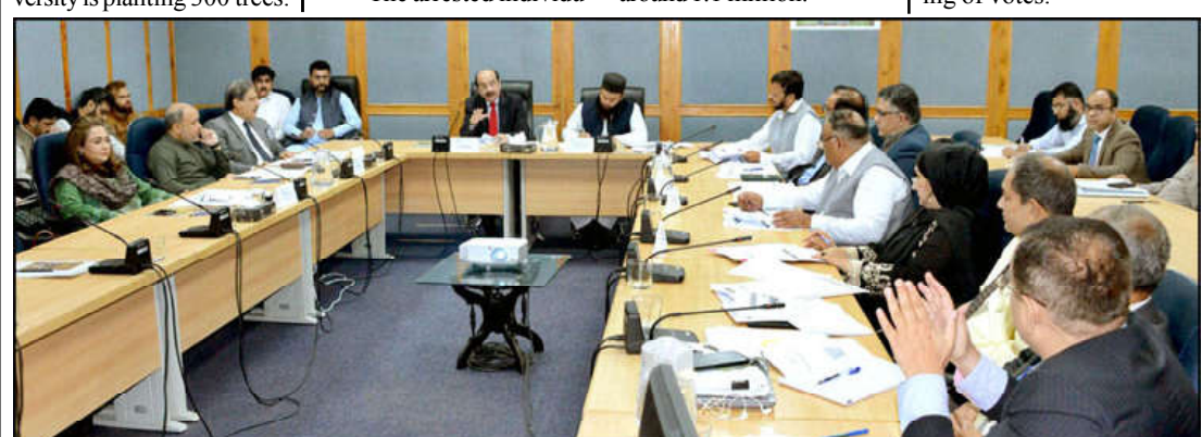
ISLAMABAD: Senator Kamil Ali Agha, Chairman Senate Standing Committee on Science and Technology presiding over a meeting of the committee at Parliament Lodges.

tions and twenty-eight chapters, this book is being regarded as a significant advancement in the field of research. It is the first book of its kind written by local authors in Pakistan, incorporating local examples to make data analysis more accessible and understandable. The book covers a wide range of topics, from selecting research designs, choosing appropriate scales, preparing code books, data entry, data editing, data screening, and evaluating scales' reliability and validity.