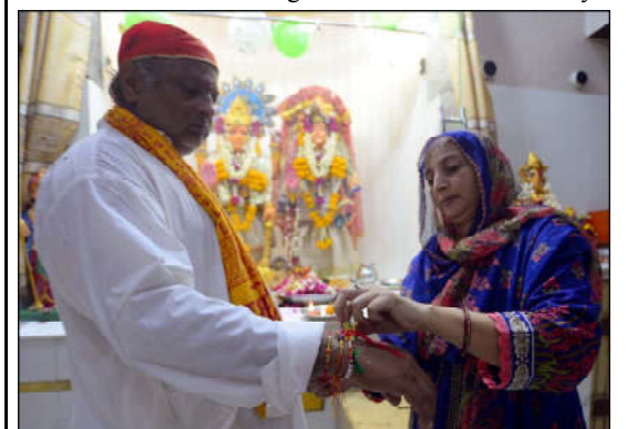
KARACHI: Hindu woman ties "Rakhi" on wrist of his brother as they celebrate "Raksha Bandhan" (in which Hindu Girls tie a piece of thread on the wrist of their brothers) during a special ceremony held at Native Jetty Temple in Karachi.