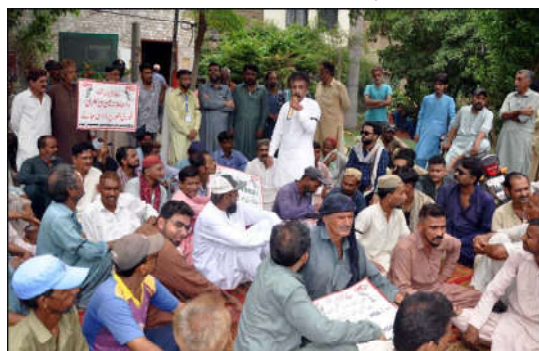
HYDERABAD: Members of HDA Labour Union are holding protest demonstration against non-payment of their salaries, at Tulsi Das Pumping Station in Hyderabad.