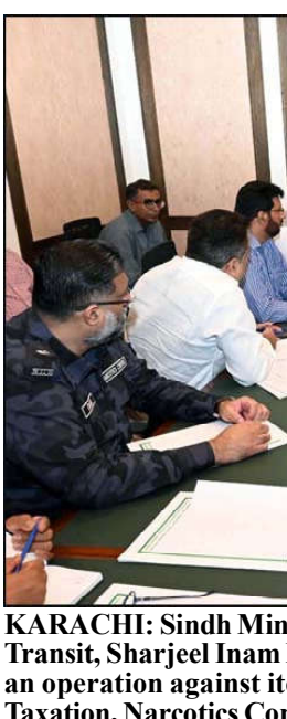
KARACHI: Sindh Minister for Excise and Taxation, Transport, and Mass Transit, Sharjeel Inam Memon presided over the meeting regarding order an operation against items used for smoking or inhaling drugs to Excise, Taxation, Narcotics Control Department, held in Karachi.

about using name of Azam Swati as code word for making contact with Faiz Hameed or Atta Bandal is only presumption. The day Imran Khan was arrested he did not ask me to contact Faiz Hameed at all. She indicated the journalist evolved presumption that PTI founder Imran Khan made me call and asked me to contact Azam Swati. In code word Azam Swati meant Justice (Retd) Bandal or Gen (Retd) Faiz Hameed. On that day I would have contacted any one with whom Imran Khan asked me to contact because that was most trying time.