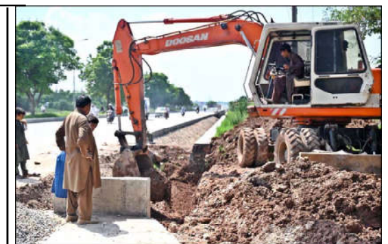
ISLAMABAD: During the expansion work of Club Road, heavy machinery is being utilized to carry out the construction and development tasks.

ISLAMABAD (APP): Legendary producer, director and actor Shaukat Hussain Rizvi was remembered on his death anniversary on Monday. Born in India in 1914, Rizvi is widely regarded as a pioneer of local cinema, having produced some of the earliest super hits in the sub-continental region. Shaukat Hussain Rizvi was born in Azamgarh, British India, in 1914. He was widely regarded as a pioneer of local cinema, he produced some of the earliest super hits in the sub-continental region. He directed his first film, Khandan, in 1942, which went on to become a super-hit at the time.