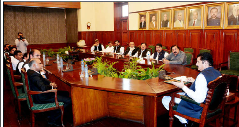
PESHAWAR: Governor Khyber Pakhtunkhwa Faisal Karim Kundi is called on by people Lawyers Forum delegation at Governor House.

SP Dolphin Shah Mir Khalid said that during patrolling, 60 hardened criminals, 28 absconders, including 42 criminals were arrested. Liquor, heroin, hashish, ice were recovered from the drug dealers. Also, 196 suspicious vehicles and motorcycles were impounded at police.