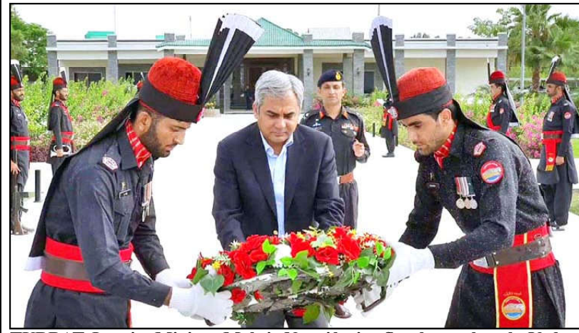
TURBAT: Interior Minister Mohsin Naqvi laying floral wreath at the Yadgar-e-Shuhada in Frontier Corps Balochistan (South) Headquarters.