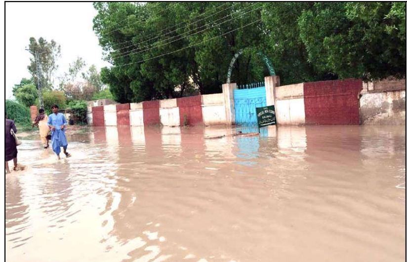
NASEERABAD: View of stagnant rainwater due to poor sewerage system after heavy downpour of monsoon season, showing the negligence of concerned department, at different areas of Dera Murad Jamali.