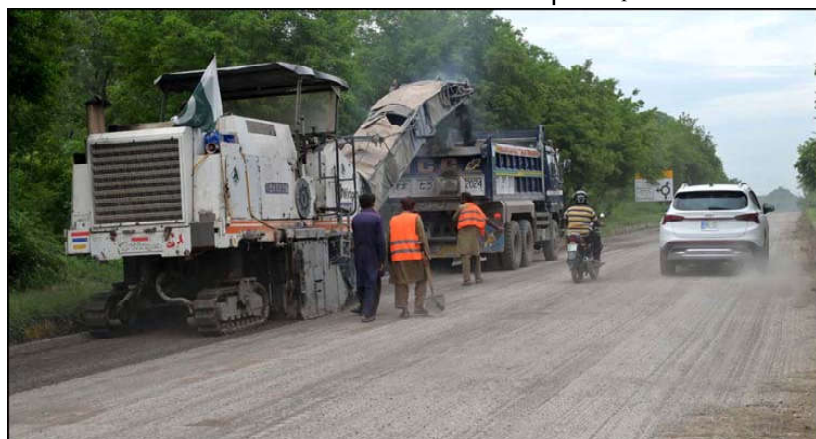
ISLAMABAD: Labourers busy repairing Bari Imam Road during repairing and development work in Federal Capital.

Their condition is reported to be stable but further updates are awaited.