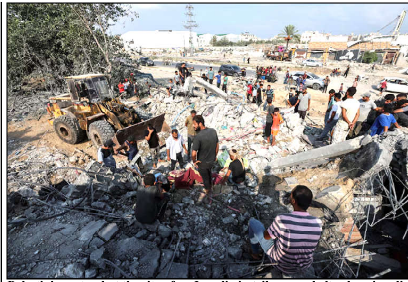
Palestinians stand at the site of an Israeli airstrike on a shelter housing displaced people, amid the conflict between Israel and Hamas, in central Gaza Strip.

He said militants were firing rockets from those locations and that the military was preparing to act against them.