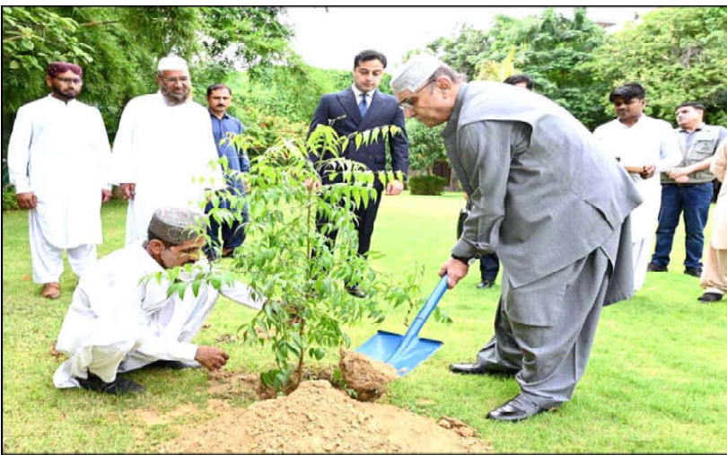
KARACHI: President Asif Ali Zardari planting a "Neem" sapling at Bilawal House as part of the Monsoon Tree Plantation Campaign.