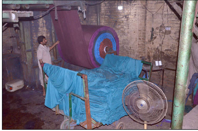
FAISALABAD: A worker is busy in his work at a local factory in the city.