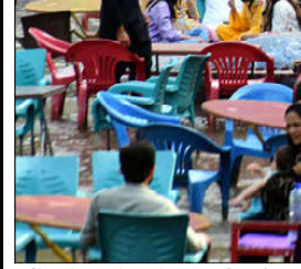
ISLAMABAD: Picnickers are enjoying Sunday Holiday at Shahdra picnic point, in the Federal Capital.

He said the PDMA and the local administration are on alert due to the flood situation in the hill torrents.