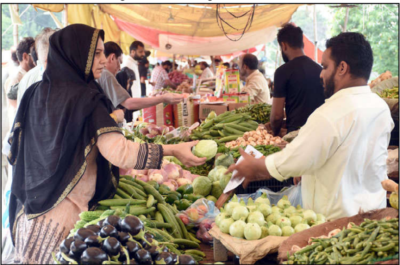
LAHORE: People are buying vegetables in Sunday weekly bazaar at Shadman area in the Provincial Capital.