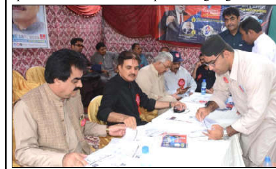
QUETTA: A view of Pakistan Engineering Council election.

She said that thousands of innocent Palestinian Muslims have been martyred, including many innocent children. On the ongoing persecution of Kashmiris in India, other major organizations, including the United Nations Security Council, have not raised a strong voice against the ongoing oppression in Palestine, she added. She said that Israel is stubbornly not willing to stop the self-inflicted war against the innocent Palestinians and this process is going on.