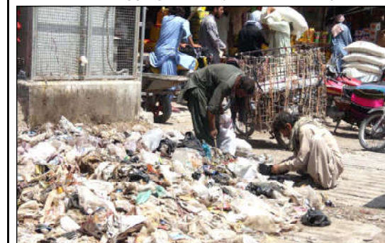
QUETTA: Garbage collectors are searching for useful things for sale by which they can earn their livelihood for support of their families, at a roadside garbage dump located on New Adda area in Quetta.

place. Raja, who had lost his election from NA-128 Lahore, said that the election tribunals in Punjab, appointed by the LHC chief justice, were not allowed to function. However, he added, the election tribunals in other provinces functioned as per the list provided by the respective chief justices. "They [the government] fear the most in Punjab," he said, claiming that "many bridges" will collapse if the tribunals — appointed by the LHC chief justice.