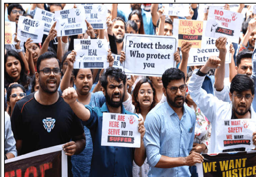
Medical staff shout slogans while holding placards during a protest at a hospital in Mumbai, after a nationwide strike was declared by the Indian Medical Association to protest the rape and murder of a trainee medic at a government-run hospital in Kolkata, India.

The US handed "astronomical" sums of lethal weapons to Ukraine's President Volodymyr Zelenskyy, the report said.