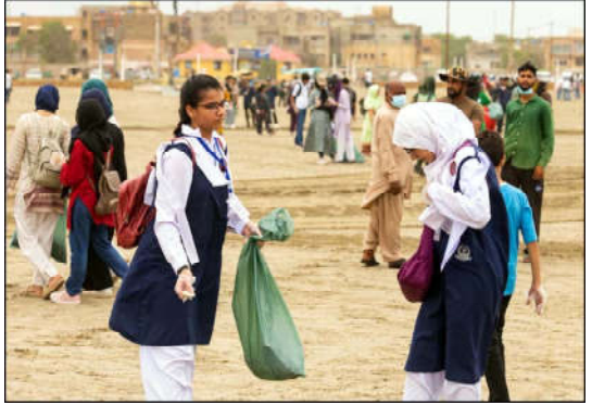
KARACHI: Students of schools and universities are picking up plastic bottles and other garbage from the Seaview Beach during cleanliness drive organized by Jaanisar Organization with support of Pakistan Navy in Karachi.

He said that in the modern era, there is a growing trend to endure and evaluate different tourist places in the world without travelling to these places through virtual tourism, which includes technologies such as VR (Virtual Reality), AR (Augmented Reality) and 360-degree videos.