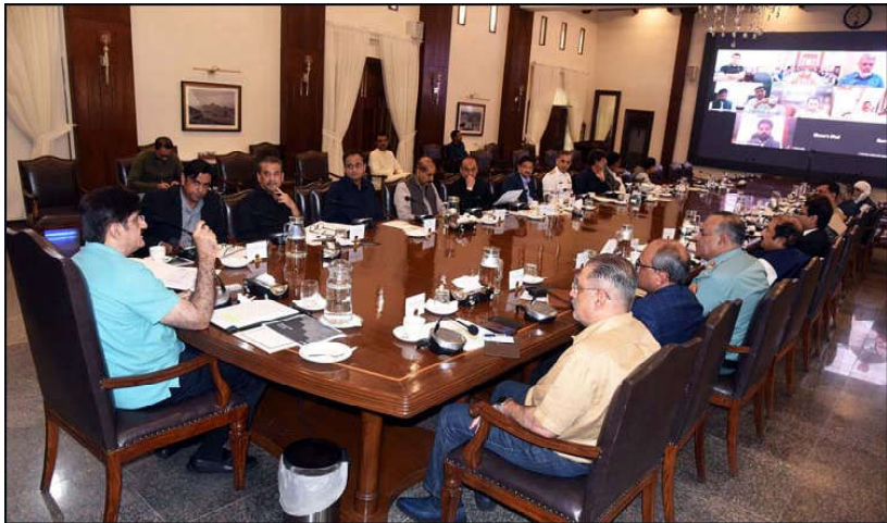
KARACHI: Sindh Chief Minister, Syed Murad Ali Shah presides over a high level rain emergency meeting held at CM House in Karachi.