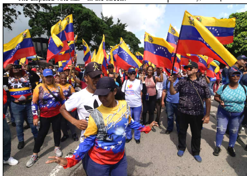
Supporters of Venezuelan President Nicolas Maduro dance as others hold Venezuelan flags during a march amid the disputed presidential election, in Caracas, Venezuela.

At least 225 informal waste disposal sites and landfills have cropped up around Gaza - many close to where families are sheltering, according to a report released in July by PAX, a Netherlands-based nonprofit that used satellite imagery to track the sites.