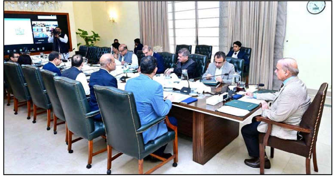
ISLAMABAD: Prime Minister Muhammad Shehbaz Sharif chairs a meeting on the matters related to Power Division, Ministry of Energy.

The meeting was informed that the Standard Operating Procedures (SOPs) regarding the transfer of agricultural tube wells in Balochistan to solar energy had been notified to the Steering Committee. The meeting was further informed that a package was being prepared regarding the acknowledgement of officers who had shown good performance.