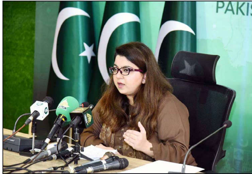
ISLAMABAD: Minister of State for IT and Telecommunication Ms. Shaza Fatima Khawaja addressing press conference.

MULTAN (APP): Seed Cotton (Phutti) equivalent to over one million (10,75,028) bales have reached ginning factories across Pakistan till August 15, 2024. According to a fortnightly report of Pakistan Cotton Ginners Association (PCGA) issued to media on Sunday, Punjab ginning factories recorded cotton arrival figures of 3,92,736 bales while arrivals to ginneries in Sindh recorded at 6,82,292 bales including 5,12,203 reaching ginneries in Sanghar district alone. Arrivals in Baluchistan were recorded at 26,100 bales. Out of the total arrivals, seed cotton converted into bales was recorded at 10,34,675.