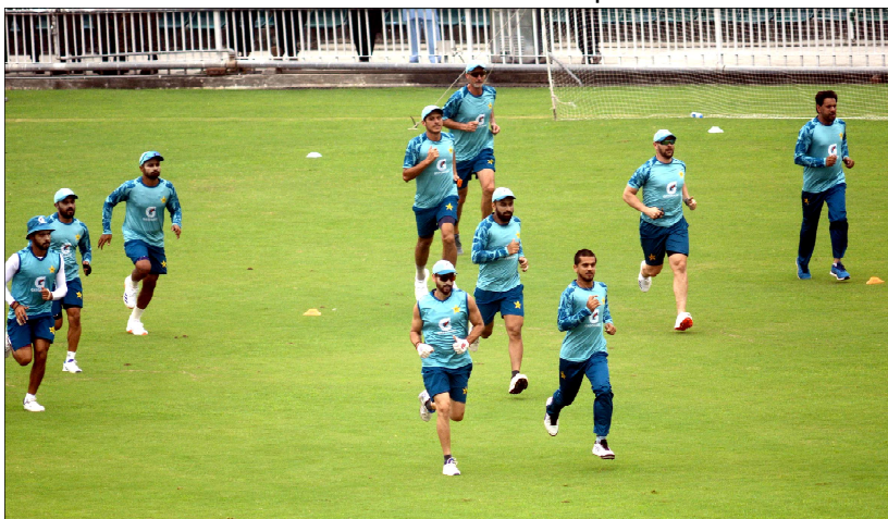
RAWALPINDI: Players of national men's cricket team taking part in training session at Rawalpindi Cricket Stadium. The first Test between Pakistan and Bangladesh will be played at Rawalpindi Cricket Stadium on August 21.

He paid rich tributes to the sacrifices of martyrs of FC south.