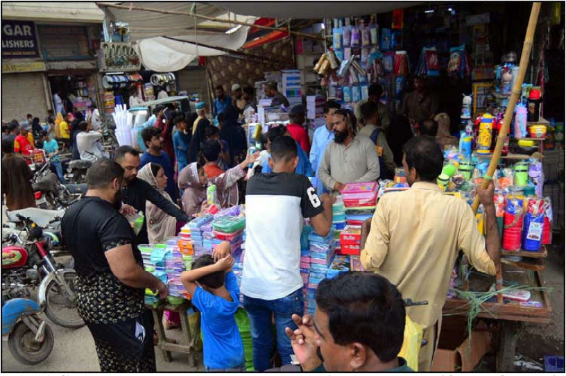
KARACHI: People buy school bags, stationary and uniforms for their children as educational institutes have been reopened after summer vacations, at Urdu Bazar in Karachi.