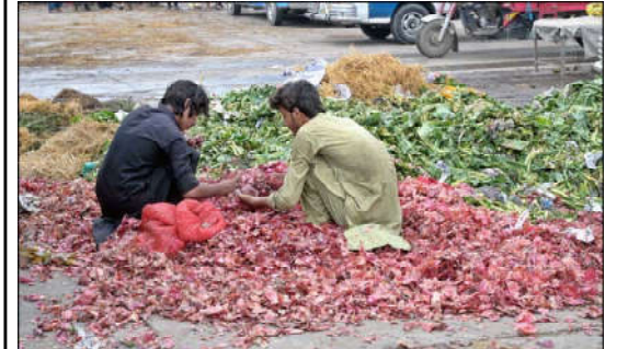
ISLAMABAD: Gypsy persons are searching and collecting onions from discarded by vendors at the Fruit and Vegetables Market.

Recalling the PML-N government led by Nawaz Sharif, he said, "at that time livelihood of the common man was stable, the stock exchange was thriving, the dollar was under control, and inflation was at its lowest." However, he lamented that certain decisions led to a surge in protest politics, causing significant harm to the national economy.