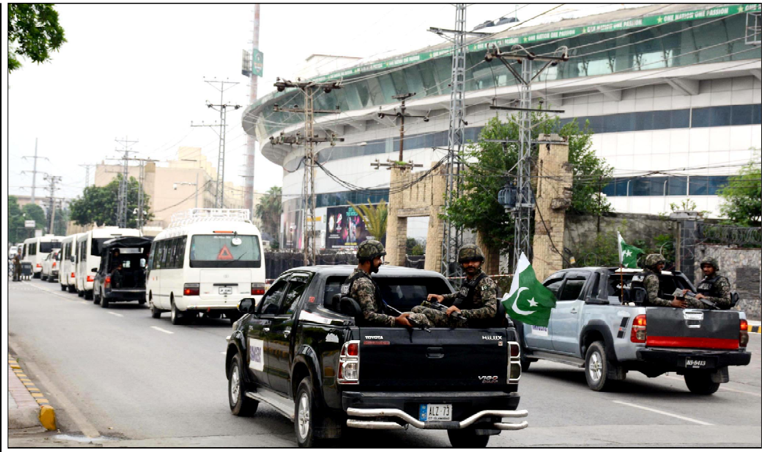
RAWALPINDI: Pakistan and Bangladesh men's cricket teams are being brought for a practice session at Rawalpindi Cricket Stadium. The first Test between Pakistan and Bangladesh will be played at Rawalpindi Cricket Stadium on August 21.