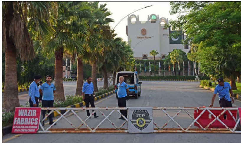
ISLAMABAD: Police personals stands alert in front of a local hotel due to security reason during Pakistan's and Bangladesh cricket team players living in hotel, As the first Test cricket match between Pakistan and Bangladesh on 21 August, at Rawalpindi Cricket Stadium.

He also pointed out that isolated incidents of suicide and increasing rates of immigration are tragic consequences of the economic strain.