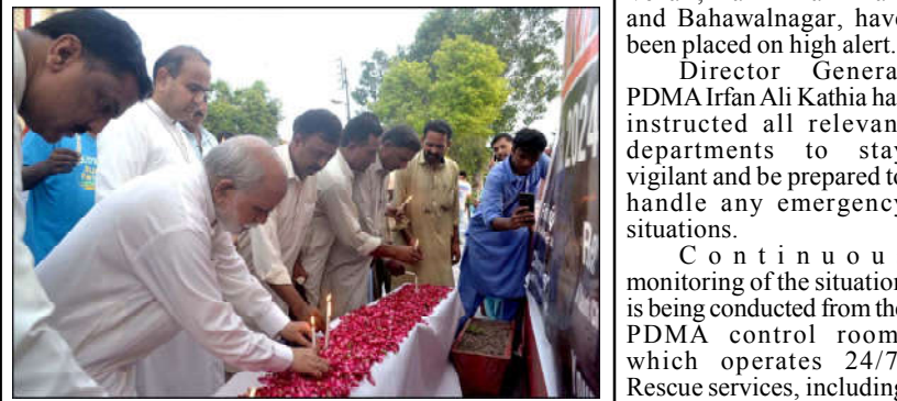
PESHAWAR: Members of Christian Community are enlightened candles as they are marking 1st anniversary of Jaranwala Incident, in Peshawar.

The provincial minister described the decision to provide relief on electricity bills as a gift to the people of Punjab and announced that the Punjab government would soon launch solar panel and housing projects. Arora also mentioned that scholarships for students from religious minorities.