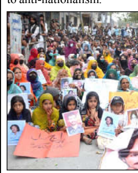
QUETTA: Relatives of missing persons hold a protest outside Quetta Press Club.