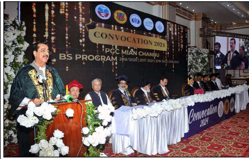
KHANEWAL: Chairman Senate Syed Yusuf Raza Gilani addressing during the Convocation of the Punjab College Mian Channu.

40.8 kg hashish and 2.4 kg opium were recovered in two different operations conducted near M-1 Islamabad while two accused were rounded up. 14.4 kg hashish was recovered from the possession of two suspects netted near Shahrah Wali, Karachi and 8.4 kg hashish was recovered from a motorcyclist intercepted in Sato Katla village near Lahore. Six kg hashish and 1.2 kg opium were recovered from an accused held in Sector G-15, Islamabad. 2.2 kg hashish was recovered from the possession of an accused arrested in Sialkot. Cases under the Anti-Narcotics Act have been registered against all arrested accused and further investigations are under process.