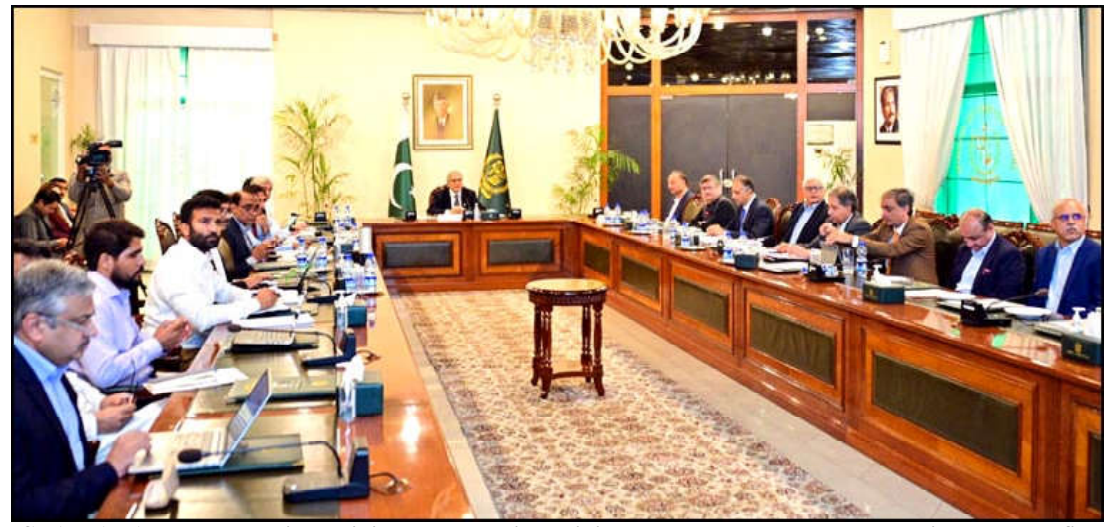
ISLAMABAD: Deputy Prime Minister and Foreign Minister Mohammad Ishaq Dar presides over the first meeting of a committee, formed to consider the issues faced by the petroleum sector's E&P companies.

the Petroleum Division to work closely with the industry and other stakeholders. The forum also directed the Petroleum Division to suggest appropriate amendments to the Ogra Ordinance to introduce a mechanism for the adjustment of gas rates on a monthly or quarterly basis. On security issues, the Forum directed the Interior Division to work closely with E&P companies and other stakeholders.