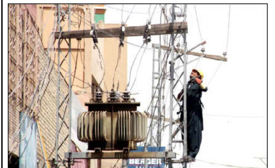
QUETTA: Wapda technician is installing electric wires on an electric pole after damages, at Sarki road in Quetta.

He stressed the need to continue process of work of rehabilitation directing the staff of department to take wholehearted part along with the district administration and provincial disaster management authority rescue and operation teams.