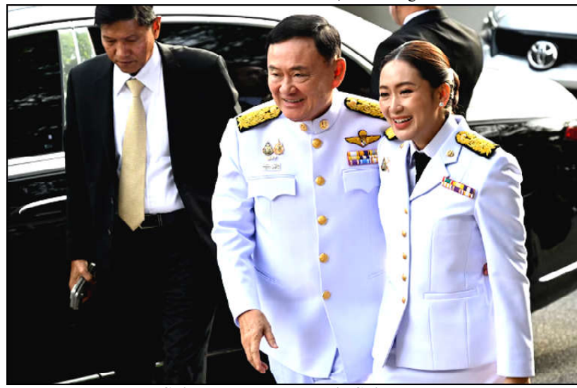
Paetongtarn Shinawatra and Thaksin Shinawatra, Bangkok.

have ever been." Biden spoke after two days of talks in Qatar where Washington tried to bridge differences between Israel and Hamas. The two sides have been at conflict for more than 10 months in the Gaza Strip. Previous optimism during months of on-off truce talks has so far proven futile. But the stakes have significantly risen since the killings in quick succession in late July of Fuad Shukur, a top operations chief of Lebanon's Hezbollah movement, and Hamas political chief Ismail Haniyeh.