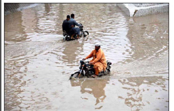
LARKANA: Motorcyclists passing through rain water accumulated on the road after heavy rain in the city.

He directed the Rawalpindi region to improve its performance in investigation, recovery, prosecution and resolution of complaints on 1787.