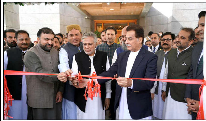
QUETTA: Deputy Prime Minister Ishaq Dar and Chief Minister Balochistan Mir Sarfraz Ahmed Bugti inaugurating Quetta Solid Waste Management project. Speaker National Assembly Sardar Ayaz Sadiq, Federal Minister Jam Kamal Khan, Speaker Balochistan Assembly Abdul Khaliq Achakzai, Provincial Ministers and high officials are also present