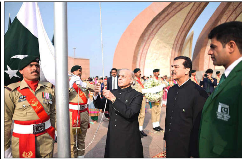
ISLAMABAD: Prime Minister Muhammad Shehbaz Sharif hoists the national flag at the Pakistan Monument on the 78th Independence Day.

According to sources environmental centre for public welfare will be built on the gifted land wherein several activities for students and tourists will be carried out. Exhibition hall, tourist centre and seminar hall will also be set up in environmental centre. The gifted 31680 square feet land lies adjacent to the Quaid-e-Azam's Residency at Ziarat.