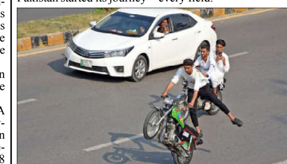
ISLAMABAD: A youngster is busy in dangerous and risky stunt at Islamabad Highway during Independence Day celebrations, in the Federal Capital.