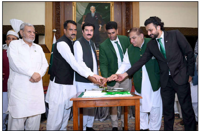
PESHAWAR: Governor Khyber Pakhtunkhwa Faisal Karim Kundi and Olympics Gold Medalist Arshad Nadeem along with other officials cutting the cake of Independence Day at Governor House.