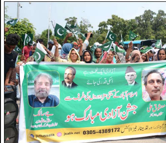
ISLAMABAD: World Minorities Alliance along with former Minister Christian Labor participated in 77 Independence Day celebration rally.

ISLAMABAD (APP): Indus River System Authority (IRSA) on Wednesday released 386,200 cusecs water from various rim stations with inflow of 427,500 cusecs. According to the data released by IRSA, water level in River Indus at Tarbela Dam was 1547.00 feet and was 149.00 feet higher than its dead level of 1,398 feet. Water inflow and outflow in the dam was recorded as 280,700 cusecs and 251,700 cusecs respectively. The water level in River Jhelum at Mangla Dam was 1210.90 feet, which was 162.90 feet higher than its dead level of 1,050 feet.