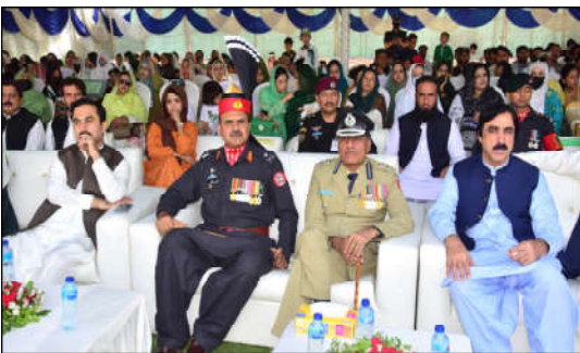
QUETTA: Inspector General Frontier Corps, Inspector General of Police Balochistan and Provincial Ministers attending Independence Day Ceremony