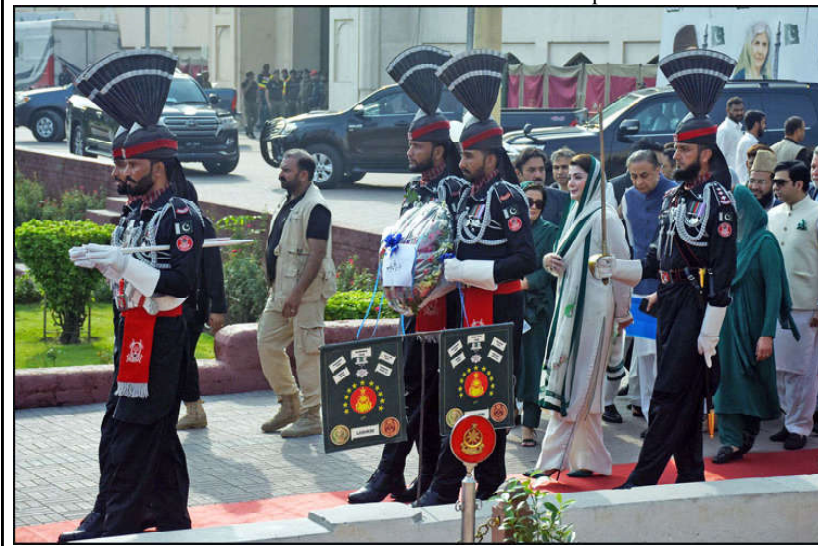
LAHORE: Chief Minister of Punjab Maryam Nawaz Sharif arriving for offering Fateha on the grave of Poet of Nation Dr. Allama Mohammad Iqbal at Mazar-e-Iqbal during Independence Day celebrations, in the Provincial Capital.