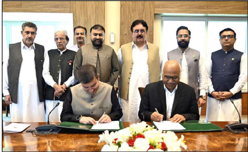
QUETTA: Memorandum of Understanding (MoU) is being signed between Government of Balochistan and Akhuwat Foundation. Chief Minister Balochistan Mir Sarfraz Ahmed Bugti is also present

Speaking on the occasion Minister for Health and Population Sindh Dr. Azra Fazal Pechuho said that this assistance has been pivotal in improving Pakistan's health system's capacity to respond to public health emergencies and ensure continuity of essential health services.