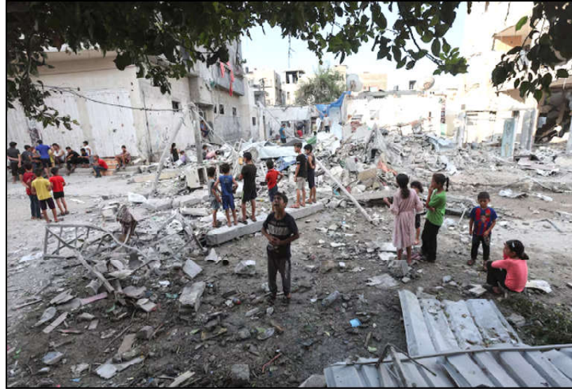
Palestinian children stand at the site of an Israeli strike on a house, amid the Israel-Hamas conflict, in Maghazi refugee camp in the central Gaza Strip.

Monitoring Desk MEXICO CITY: Mexican President Andres Manuel Lopez Obrador told a morning press conference on Wednesday that he would send a diplomatic note to the United States over what he called interference regarding US donations to opposition civil organizations. The president cited US funding for Mexicanos Contra la Corrupcion y la Impunidad, an anti-graft NGO which has investigated possible corruption in his administration as well as that of his predecessors. "We have dealt with it here several times, it has been made public but now we are going to handle it in the appropriate way through the letter I am going to send President Biden," Lopez Obrador said.