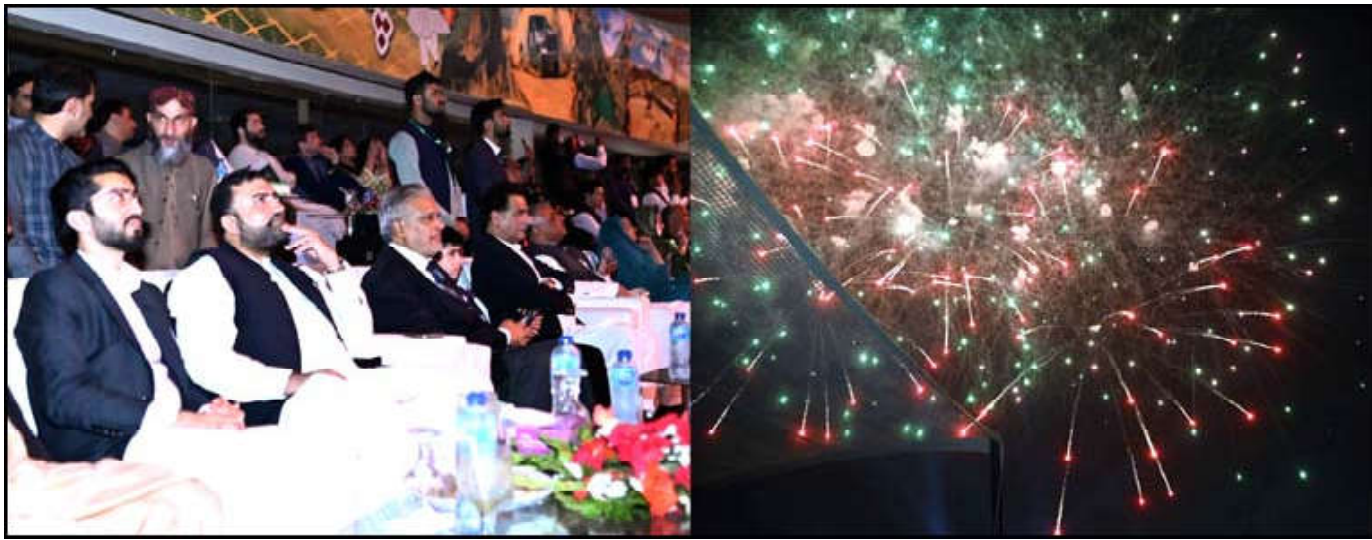
QUETTA: Deputy Prime Minister and Foreign Minister, Senator Mohammad Ishaq Dar along with Mir Sarfaraz Ahmed Bugti, Chief Minister Balochistan, Ayaz Sadiq, Speaker National Assembly and others watching fireworks during ceremony on the occasion of 77th Independence Day of Pakistan