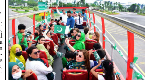
ISLAMABAD: Special Children enjoying Independence Day along with their teachers visiting Federal Capital on Sightseeing Twin Cities Double Decker Bus.

ISLAMABAD (APP): Minister for Industries, Production and National Food Security Rana Tanveer Hussain on Wednesday urged for collective efforts towards achieving a prosperous, peaceful and united Pakistan. Felicitating the nation on the country's Independence Day, he emphasized the crucial role of the youth in driving Pakistan's progress, urging them to harness their potential and contribute to the country's growth through their tireless efforts and unwavering commitment.