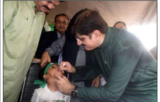
KARACHI: Sindh Chief Minister Syed Murad Ali Shah launches a 10-day polio eradication campaign by administering polio drops to children at Khalid Jameel Dispensary, Garden East.

LAHORE (APP): Punjab Chief Minister Maryam Nawaz Sharif hoisted the national flag at the Alamgiri Gate of Lahore Fort on the occasion of Independence Day. National anthem was presented on the occasion. The Chief Minister participated in a special ceremony being held at the Hazuri Bagh. The CM paid a visit to the Mazar-e-Iqbal, laid a floral wreath and offered Fateha at the Mazar-e-Iqbal. She prayed for the integrity, progress, prosperity and stability of the country and paid homage to the Poet of the East Allama Muhammad Iqbal in glowing words. CM Maryam Nawaz Sharif was presented a salute by the smartly turned out contingent of scouts standing on the stairs of Badshahi Mosque