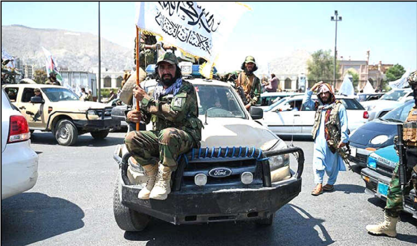
Taliban security personnel ride in a convoy to celebrate the third anniversary of the Taliban takeover of Afghanistan in Kabul.

The Ukrainian assault into Russian territory has dramatically changed the narrative around the two-and-a-half-year-old war. Russia had been advancing in eastern Ukraine since the failure of Kyiv's 2023 counter-offensive to make any major gains against Russian forces.