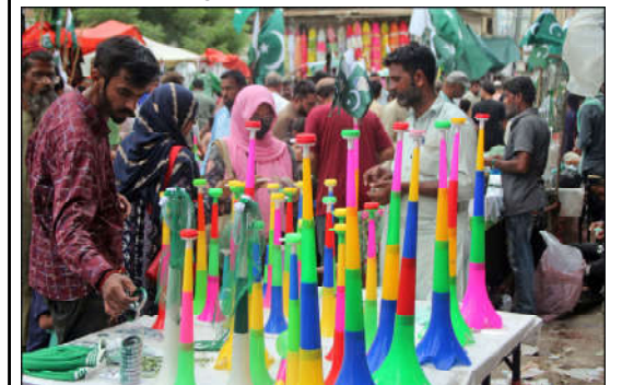
KARACHI: Vendors sell Pakistan's national flags at a roadside stall on the eve of the country's Independence Day, in the Provincial Capital.