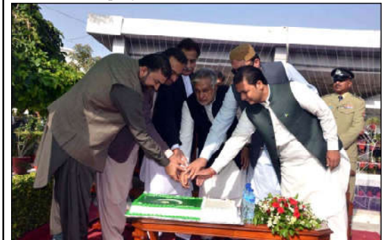
QUETTA: Deputy Prime Minister Ishaq Dar cuts cake during the flag hoisting ceremony at the lawn of Balochistan Assembly to mark the Independence Day, CM Balochistan Mir Sarfraz Bugti, Speaker National Assembly Sardar Ayaz Sadiq and federal commerce minister Jam Kamal are also present.

QUETTA: The Deputy Prime Minister, Muhammad Ishaq Dar has reiterated the federal government's resolve to make Pakistan economic power after becoming atomic power. "We have to achieve what Allah Almighty has written in our destiny. It is desire of the Prime Minister Muhammad Shehbaz Sharif to improve economy and GDP of the country. Pakistan would have to emerge shining star in future and we would see Pakistan becoming developed and including in G20", stated the Deputy Prime Minister while addressing the flag hoisting ceremony at the Provincial Assembly's law on Wednesday. The Deputy Prime Minister extended greetings of the Independence Day to the people of Balochistan on his as well as behalf of the President and Prime Minister. The flag hoisting ceremony was attended by the Speaker National Assembly, Sardar Ayaz Sadiq, Chief Minister Balochistan, Mir Sarfraz Ahmed Bugti, Speaker Provincial Assembly, Abdul Khaliq Achakzai, Federal Minister for Commerce and including in G20", stated the Deputy Prime Minister.