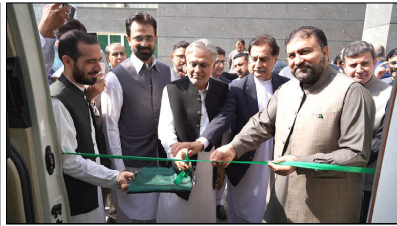
QUETTA: Deputy Prime Minister Ishaq Dar and Chief Minister Balochistan Mir Sarfraz Ahmed Bugti inaugurating new Registration Centers of NADRA. Speaker National Assembly Sardar Ayaz Sadiq, Provincial Ministers and high officials are also present

However, the timely completion of the federal development projects is conditional with timely release of the funds.