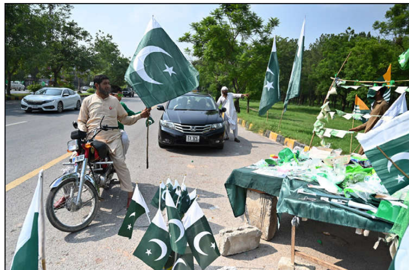
ISLAMABAD: Commuters purchasing national flag displayed by the roadside vendors as the nation celebrates the Independence Day of Pakistan.

Participants were divided into four groups, each presenting on different aspects of nutrition and the roles of various government departments.