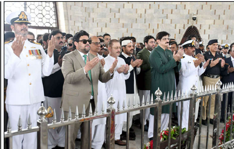
KARACHI: Governor of Sindh, Muhammad Kamran Khan Tessori, Chief Minister of Pakistan's Sindh province Syed Murad Ali Shah and others offers prayers at the mausoleum of founding father Quaid-e-Azam Mohammad Ali Jinnah during Independence Day.

Wednesday, the Chief Minister highlighted the importance of following the principles of Quaid-e-Azam Muhammad Ali Jinnah to steer the country out of its crisis. During the media briefing, Shah congratulated the nation on the upcoming Independence Day, acknowledging the resilience of Pakistan's youth and citizens. He cited the response to the 2022 floods as evidence of the province's determination, noting that despite expectations of prolonged flooding, the people quickly drained the water, prepared their lands, and cultivated wheat. Reflecting on Pakistan's history, Shah expressed confidence that the nation would overcome its current challenges, just as it has in the past. He stressed the importance of unity in achieving economic growth, development, and improvements in education and healthcare.