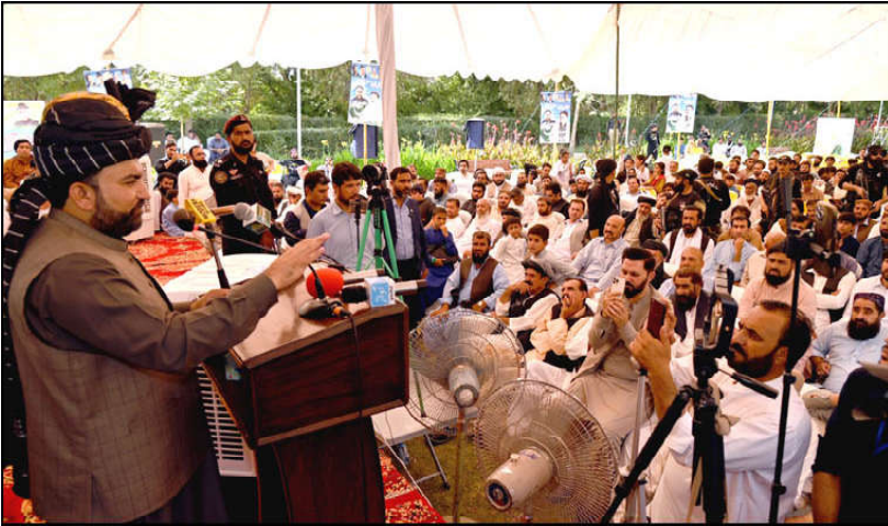
PISHIN: Chief Minister Balochistan Mir Sarfraz Ahmed Bugti addressing a ceremony held in connection with Independence Day