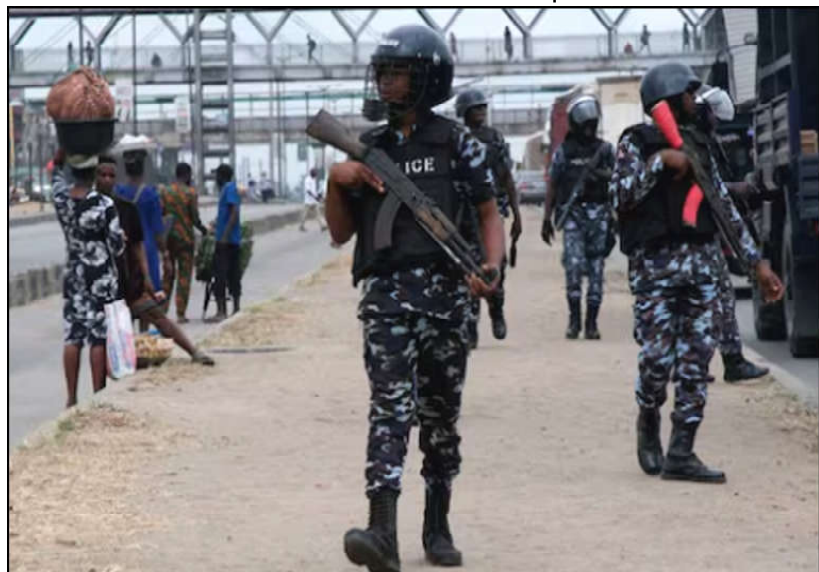
Nigerian police personnel restrict protesters from convening for the sixth day of anti-government demonstrations against bad governance and economic hardship, in Lagos, Nigeria.

Many have been swiftly jailed, with some receiving long sentences. The National Police Chiefs' Council said in its latest update that 1,024 had been arrested and 575