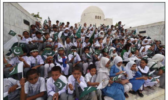
KARACHI: Students hold national flag during 77th independence day celebration on 14 August at Mazar e Quaid.

LAHORE (APP): Punjab Chief Minister Maryam Nawaz Sharif made a surprise visit to the CBD Walton project on Wednesday, closely inspecting the ongoing work on the Walton Road 47 project, which connects Kalma Chowk to Walton. During her visit, the Chief Minister reviewed the progress of the construction activities and assessed the development of the Walton Road drain. The CM emphasized the importance of quality construction and directed that the project be completed as soon as possible. "We are fully aware of the difficulties being faced by the people due to the ongoing construction of Walton Road," she stated, highlighting the government's commitment to minimizing public inconvenience. In line with her directives, the three-lane carriageway of Walton Road is set to be opened for traffic in September. Additionally, the dual carriageway is expected to be completed by October, with construction work continuing around the clock to meet these deadlines.