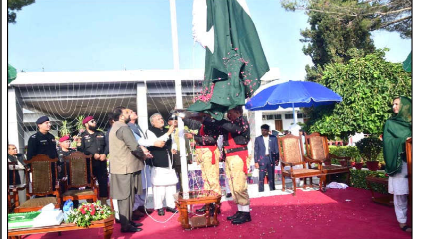
QUETTA: Deputy Prime Minister and Foreign Minister, Senator Mohammad Ishaq Dar along with Mir Sarfaraz Bugti, Chief Minister Balochistan, Ayaz Sadiq, Speaker National Assembly and others are hoisting National Flag during Flag hoisting ceremony on the occasion of 77th Independence Day of Pakistan, in Quetta.

Independent Report KHYBER: The Young Labor Union organized an Independence Day celebration at the Pak-Afghan Torkham border, with the aim of conveying a message of loyalty to Pakistan to the world. The event included a rally and cake-cutting ceremony, where participants chanted slogans like "Long live Pakistan" and expressed solidarity with the Pakistani Army. Correspondent added Abdul Rahman Shinwari, President of the Young Labor Union, said that the purpose of celebrating Independence Day at the border was to send a message of devotion to Pakistan to the world. He added that on this day, they pay tribute to the heroes of the nation and are willing to sacrifice their lives for Pakistan.