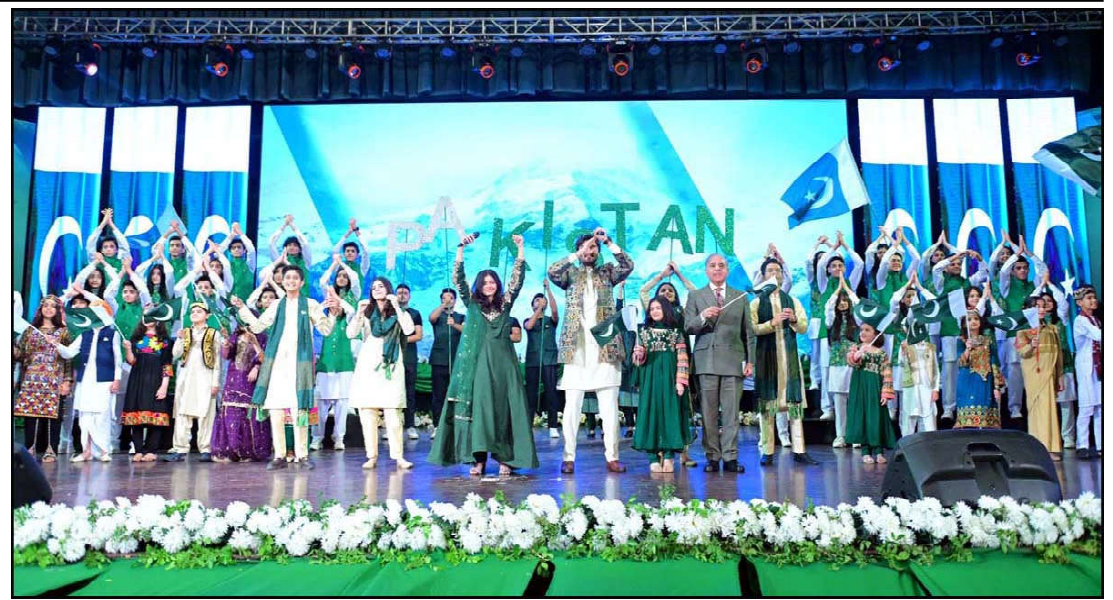
ISLAMABAD: Prime Minister Muhammad Shehbaz Sharif with the singers and students who performed at the Independence Day event.

faith, making significant sacrifices. The minister pointed out the persistent internal, regional and global challenges. Among these, he identified stabilizing the economy and achieving development goals as the most pressing. He lamented that political instability, inconsistent policies, disruptions in the democratic process, extremism and terrorism had hindered development progress in the past. He noted that countries that gained independence after Pakistan have advanced significantly in development.