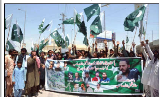
QUETTA: Balochistan Youth ittehad hold rally to mark independence day.

In addition to this, Ishaq Dar also inaugurated the Quetta solid waste management project along with the Chief Minister and Speaker National Assembly in Quetta.