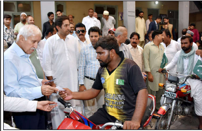
CHINIOT: Federal Minister for Maritime Affairs, Qaiser Ahmad Sheikh distributing the free coupon of 5 Liter Petrol to Ten Thousand bikers.

The Governor elaborated that the improvement in macroeconomic indicators is the result of measures taken by both the Government and the SBP, leading to a better economic outlook. Banks have developed their plans to issue more loans to the agriculture and SME sectors compared to last year, to harness the potential in these areas. He emphasized the SBP's efforts to ensure access to financial services for the general public, including initiatives such as the National Financial Inclusion Strategy, the National Financial Literacy Program, and Banking on Equality. He also highlighted 'Raast,' Pakistan's first instant payment system, which enables end-to-end digital payments among individuals, businesses,