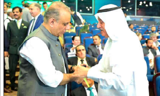
ISLAMABAD: Ambassador of Kuwait to Pakistan, Abdul Rehman Jay. Al-Mutairi with Federal Minister for Privatization, Board of Investment and Communications Abdul Aleem Khan in Independence Day function.