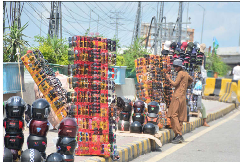
RAWALPINDI: A roadside stall holder decorates glasses to attract customers, on footpath on Murree Road in the city.

Cake cutting ceremonies are a wonderful way to boost morale and foster a sense of unity among our team members, said a government employee. Cake cutting ceremonies remind us of the sacrifices made by our forefathers and the importance of protecting our nation's freedom, said a teacher.