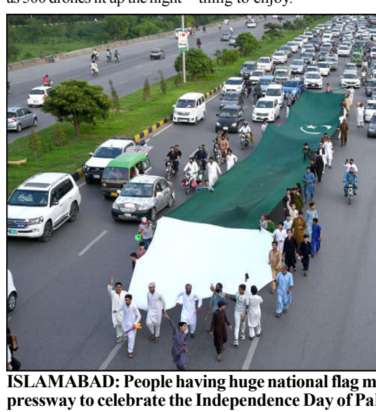
ISLAMABAD: People having huge national flag marching on Islamabad Expressway to celebrate the Independence Day of Pakistan.

ISLAMABAD (APP): Islamabad's F-9 Park became the heart of Pakistan's Independence Day celebrations, where a historic event brought together families, renowned artists, and the country's first-ever drone show, created unforgettable memories last night. The Islamabad Capital Territory (ICT) administration organized an Independence Festival at F-9 Park, marking a significant celebration in the federal capital. The event was highlighted by Pakistan's first-ever drone show, a spectacle that captivated the audience as 500 drones lit up the night sky, forming the Pakistani flag and other mesmerizing patterns. Adding to the patriotic spirit, javelin thrower Arshad Nadeem's recent gold medal victory at the Paris Olympics was also celebrated, further boosting national pride during the festivities. The festival offered free entry to citizens, allowing families to participate in the wide array of activities planned, especially for children. Various food stalls were set up, catering to the tastes of food lovers, ensuring that everyone had something to enjoy.