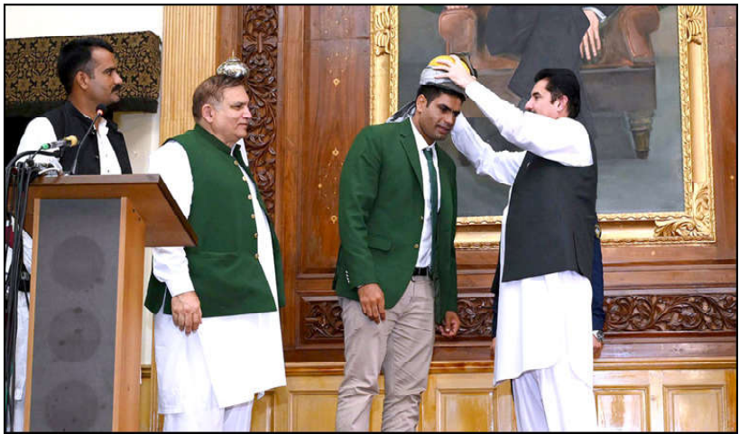
PESHAWAR: Governor Khyber Pakhtunkhwa Faisal Karim Kundi presents a traditional turban to Olympics Gold Medalist Arshad Nadeem during his visit to Governor House.