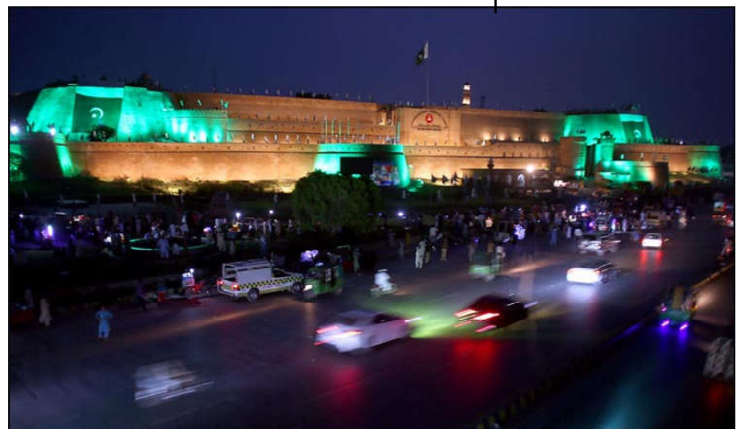
PESHAWAR: A view of Bala Hisar decorated with lights during 77th Independence Day celebration on 14 August.

saplings to celebrate Independence Day. She highlighted that over 3 million trees are being planted across Punjab as part of the campaign. The Senior Minister also introduced a unique plantation experiment involving the use of seed balls, emphasizing that tree plantation is not only a virtuous act but also a national necessity. Secretary of Environmental Protection Raja Jahangir, DG Wildlife Mudassar Riaz Malik, DG PHA Tahir Wattoo, and other dignitaries were present at the event.