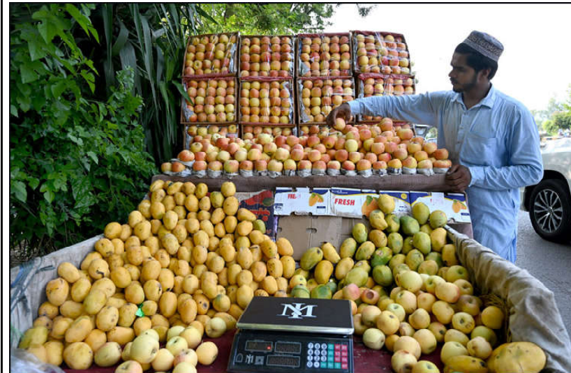
ISLAMABAD: A vendor displays fruits on his roadside setup to attract the customers at F-10 area.