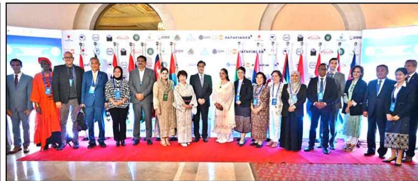
ISLAMABAD: Speaker National Assembly, Sardar Ayaz Sadiq in a group photograph with other guests at the inaugural session of the Asian Forum of Parliamentarians on Population and Development on 'Gender Empowerment and Green Economy'.