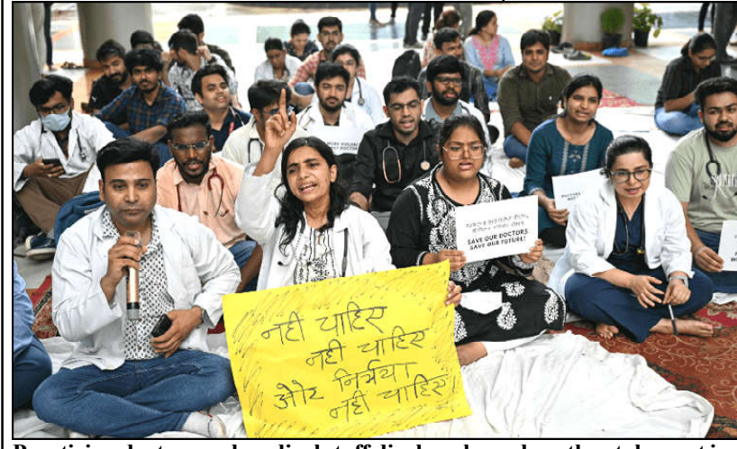
Practicing doctors and medical staff display placards as they take part in a protest against the incident of rape and murder of a young medic in Kolkata, during a demonstration held at a government hospital in New Delhi.

Lam, who is also the state president of the Southeast Asian nation, is planning to arrive in China on Aug 18.