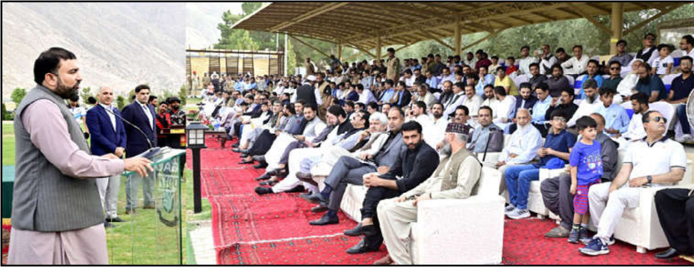
QUETTA: Chief Minister Balochistan Mir Sarfraz Ahmed Bugti addressing concluding ceremony of horse riding gala held in connection Jashn-e-Azadi

Ph: 2841470/2841473 REG: No. BC-116 B/ID-445 Vd XXV No. 351, Safar 07, 1446 AH Tuesday August 13, 2024 Pages 08, Price Rs.15