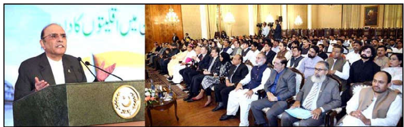
ISLAMABAD: President Asif Ali Zardari addressing a ceremony in connection with Minorities' Day in Pakistan, at Aiwan-e-Sadr.