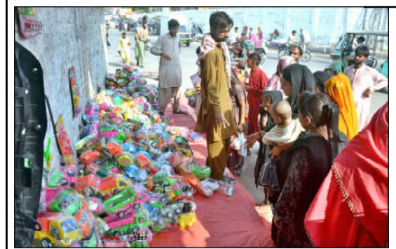
MULTAN: Women along with children are purchasing toys from a roadside vendor.

Yaris cars sales also increased by 3.65 percent as it went up to 1,106 units from 1,067 units in July of the previous year. Suzuki Swift's sales also surged by 101.60 percent as its sale increased to 502 units from 249 units last year. Sale of Suzuki Cultus decreased to 96 units during the first month of the current year, whereas during the same month last year, the sale was recorded at 177 units while the sale of Suzuki WagonR also decreased to 139 units from 245 units last year. Suzuki Alto's sales also witnessed an increase of 99.23 percent from 1,440 units to 2,869 units during the current year.