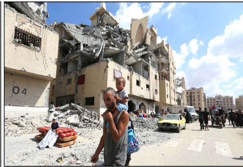
Displaced Palestinians make their way as they flee Hamad City following an Israeli evacuation order, in Khan Yunis in the southern Gaza Strip.

"The people of Gaza are trapped and have nowhere to go."