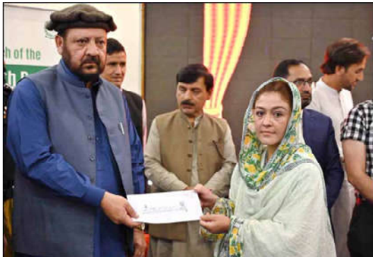
GILGIT: Chief Minister Gilgit-Baltistan Haji Gulbar Khan giving away cheque under CM Youth Loan Scheme during launch the GB Youth Policy 2024 to mark International Youth Day 2024.

Balochistan, both of which were heavily impacted by the catastrophic floods of 2022, he added. Since 2022, he said the US has provided nearly $100 million in assistance to address acute malnutrition in Pakistan, with $15 million specifically allocated for treating severely malnourished children. He said this support also includes emergency food and health care services, benefiting over 317,000 Pakistani mothers and children. He said the US assistance has further bolstered Pakistan's health infrastructure, enhancing screening and treatment for malnourished children under five, and providing support to women who are pregnant or breastfeeding. Ambassador Blome said the US has also trained more than 779,000 frontline health workers.