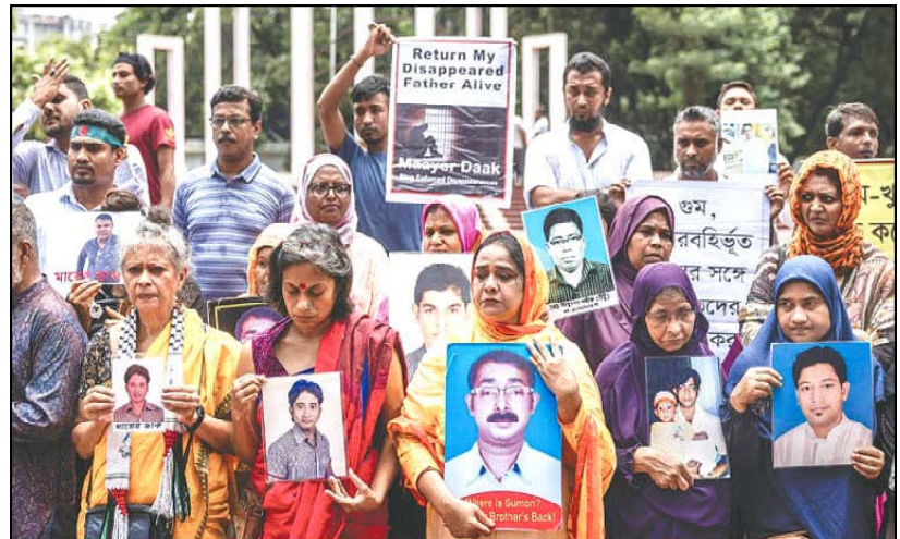
DHAKA: Holding banners and portraits of their 'missing' relatives, family members of those allegedly 'disappeared' by security agencies during Awami League rule, gather at the Shaheed Minar.