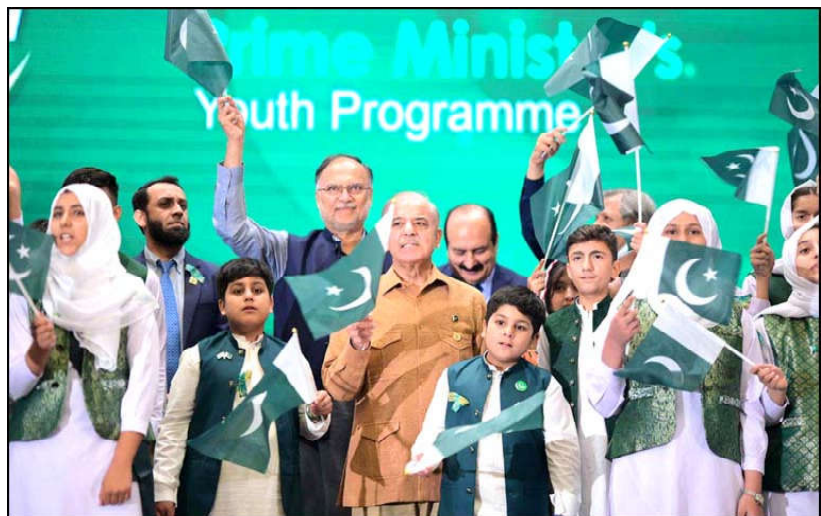
ISLAMABAD: Prime Minister Muhammad Shehbaz Sharif in a group photo with students on the International Youth Day ceremony.

The Governor stressed the need to dispose of the complaints of the consumers about electricity.