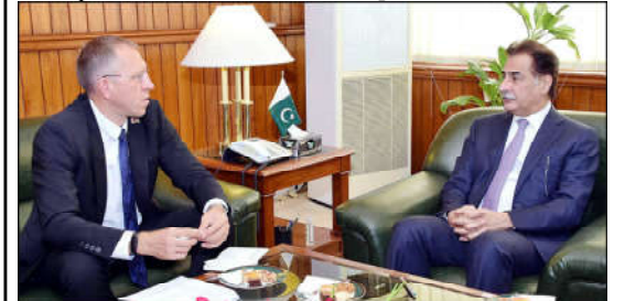
ISLAMABAD: Ambassador of Belarus Mr. Andrei Metelitsa called on Speaker National Assembly Sardar Ayaz Sadiq at Parliament House.

plishments of our young people. He urged every young Pakistani to seize the opportunities available to them, to dream big, and to work tirelessly for the betterment of the country. Prime Minister Shehbaz Sharif, in his message, said Pakistan's over sixty percent of population is under the age of thirty. Shehbaz Sharif said young people can become agent for positive change in their communities through education, entrepreneurship and social activism. The Prime Minister said the Youth Loan and Agricultural Scheme, which was introduced in 2013, is yielding significant results and approximately one hundred eighty-six billion rupees have been distributed to over two hundred and eighty thousand young entrepreneurs.