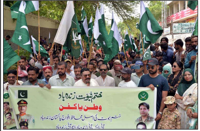
HYDERABAD: Members of Civil Society are holding rally in favor of Pakistan Armed Forces, at Hyderabad press club.