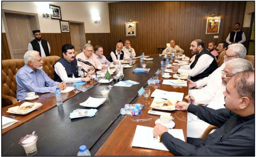
PESHAWAR: Governor KP Faisal Karim Kundi addressing during his visit to Khyber Eye Foundation.

individuals in various skills. On International Youth Day, the Minister emphasized the vision of PPP Chairman Bilawal Bhutto Zardari to ensure that every young person in Sindh acquires the skills necessary for economic independence. "The Sindh government is committed to overcoming the challenges faced by our youth and views them as a critical asset to our society," Mehar stated. The provincial government is also focused on generating new employment opportunities for young individuals across different sectors each year.