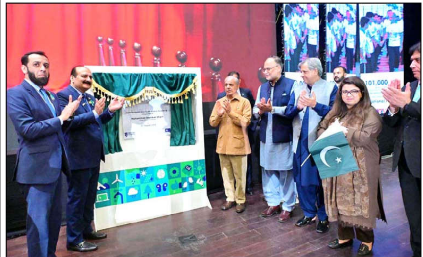
ISLAMABAD: Prime Minister Muhammad Shehbaz Sharif inaugurates the Commonwealth Asia Youth Alliance Secretariat, at the International Youth Day ceremony.