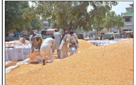
FAISALABAD: Labourers packing freshly harvested maize into sacks for transport to factories and market in the city.

KARACHI (APP): Shipping activity was reported at the port where eight ships namely, Maersk Durban, MSC Elsa 3, Kouros Queen, Rhine, Golden Denise, Lusail, Jag Padma and Chang Han Run Hai scheduled to load/offload containers, Cement, Palm oil, Chemicals, LNG, Mogas and Coal, berthed at Qasim Container Terminal, Multi-Purpose Terminals, Liquid Terminal, Engro Terminal, Elengy Terminal, Oil Terminal and Bulk Terminal respectively during last 24 hours. (.) Meanwhile another edible oil carrier Silver Orla also arrived at Outer Anchorage of Port Qasim during the same period. (.) A total of ten ships were engaged at PQA berths during the last 24 hours, out of them a container vessel MSC.