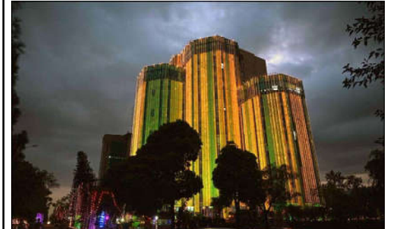
ISLAMABAD: An illuminated view of the OGDCL building decorated with colorful lights in connection with the Independence Day celebration.

ISLAMABAD (APP): The Pakistan Institute of Fashion Design (PIFD) announced to establish its sub-campus in Karachi, as directed by the Minister of Federal Education and Professional Training, Khalid Maqbool Siddiqui. This new sub-campus will provide students with access to world-class education in fashion design, technology, and management, said a press release on Monday. The campus will offer a range of associate and undergraduate degrees designed to equip students with the skills and knowledge needed to succeed in the fashion industry. The establishment of the sub-campus is a significant milestone in PIFD's expansion plans after GB and demonstrates the government's commitment to promoting education.