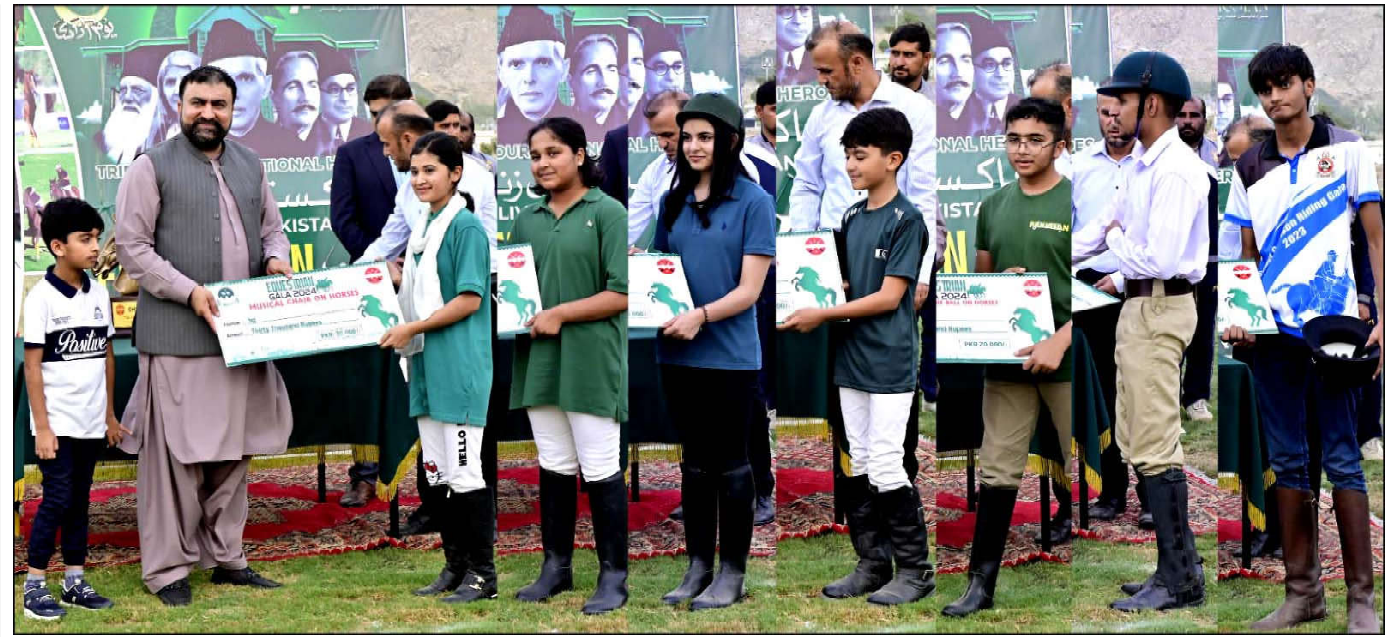
QUETTA: Chief Minister Balochistan Mir Sarfraz Ahmed Bugti giving away prizes among students participated in horse riding gala held in connection Jashn-e-Azadi

ditions without worrying about our livelihood. Their contribution to the development of sports in Pakistan is immense, and I am proud to be associated with them," he mentioned. Arshad Nadeem's eyes also lit up with gratitude as he spoke about his mother's encouragement and family support. "My mother has been my biggest inspiration and strength," he said, adding, she always encouraged me to pursue my passion for javelin throw, even when I faced setbacks and injuries. Her unwavering belief in me and my abilities kept me going, and I am forever grateful to her." Arshad also praised his family's support, saying, "My family has been my rock throughout my journey. They have made countless sacrifices to help me achieve my dreams, and I am thankful to each and every one of them, he added. Arshad Nadeem, basking in the glory of his historic gold medal win, also used the opportunity to urge the government to promote athletes' talent and provide more facilities.