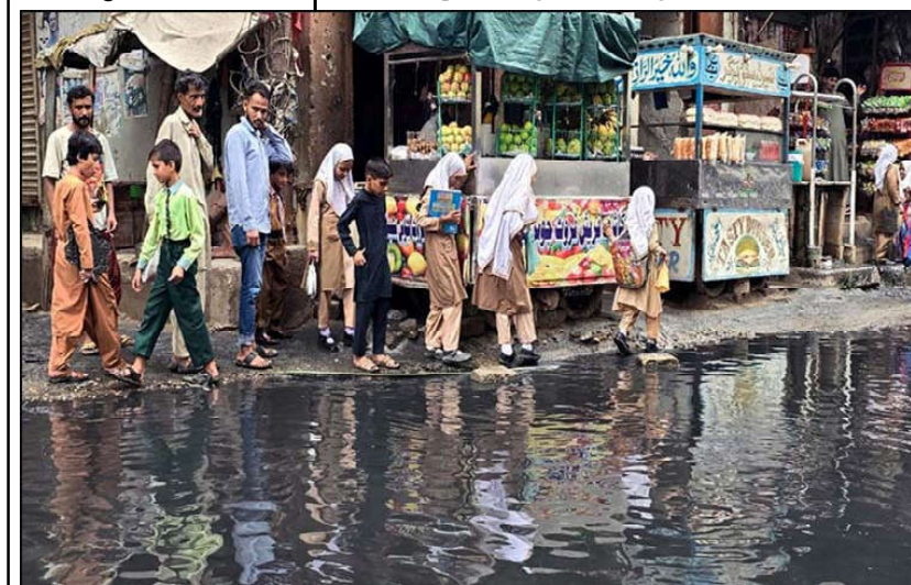
KARACHI: Hectic street full of garbage, sewerage water, causing unhygienic atmosphere and creating problems for commuters and residents, due to poor sewerage system, showing negligence of concerned authorities, located on Shershah area in Karachi

the meeting about the programs planned in their respective districts. On this occasion, the Chief Secretary stated that, as like previous years, this year's Independence Day would be celebrated with great enthusiasm and zeal. He instructed that national flags be hoisted on all government buildings and that they be illuminated with decorative lights. Flag hoisting ceremonies, rallies, and special walks should be organized at divisional headquarters and districts. Similarly, educational institutions should organize events in connection with Independence Day, including awareness speeches and sports competitions.