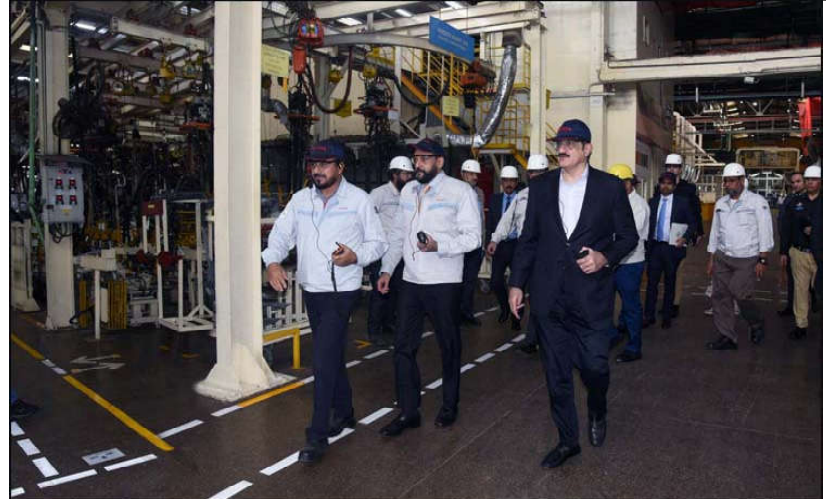
KARACHI: Sindh Chief Minister, Syed Murad Ali Shah visits the production plant during his visit to Indus Motors, in Karachi.