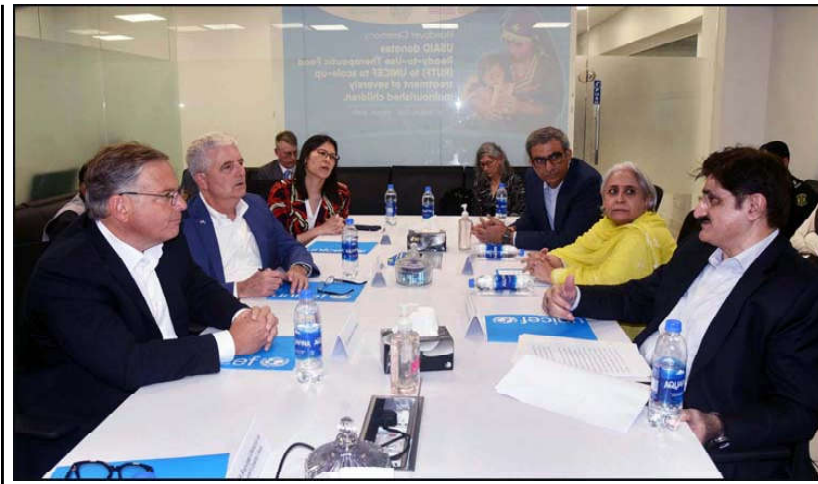
KARACHI: Sindh Chief Minister, Syed Murad Ali Shah exchanges views with US Ambassador, Donald Blome during meeting held at the UNICEF Warehouse Port Qasim in Karachi.