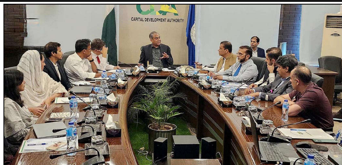
ISLAMABAD: Federal Minister for Interior Mohsin Naqvi chairing a meeting regarding establishment of Safari Park.

dums of understanding were signed. He said that signing free training of Pakistani youth in the top eight streams of Artificial Intelligence in collaboration with Commonwealth Forum and Intel Corporation would create numerous jobs and earning opportunities for Pakistan which would be formally launched by Prime Minister Shehbaz Sharif on International Day of Youth on August 12.