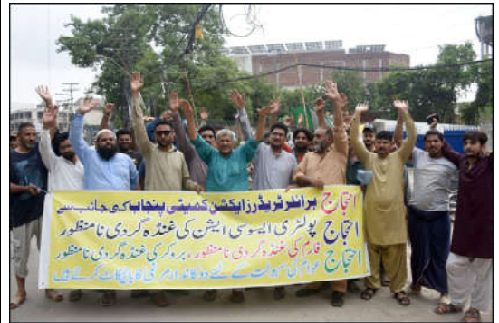
LAHORE: Members of Broilers trader's action committee hold a banner during protest in favor of their demands outside press club.