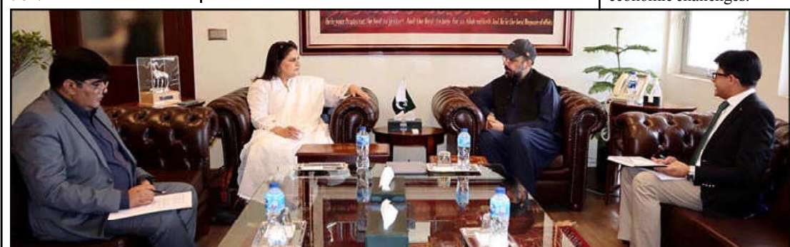
ISLAMABAD: Senator Rubina Khalid, Chairperson BISP, meets Chaudhry Salik Hussain, Federal Minister for Overseas Pakistanis & Human Resource Development.

Corporation Islamabad (MCI) also working diligently. They used dewatering pumps to clear water from different areas. On the occasion, Deputy Commissioner (DC) Islamabad, Irfan Nawaz Memon, emphasized the strict monitoring of all drains to prevent any flooding. The ICT administration teams reached all low-lying areas, ensuring proper drainage. The DC informed that despite ongoing highway construction, the traffic flow had remained unaffected.