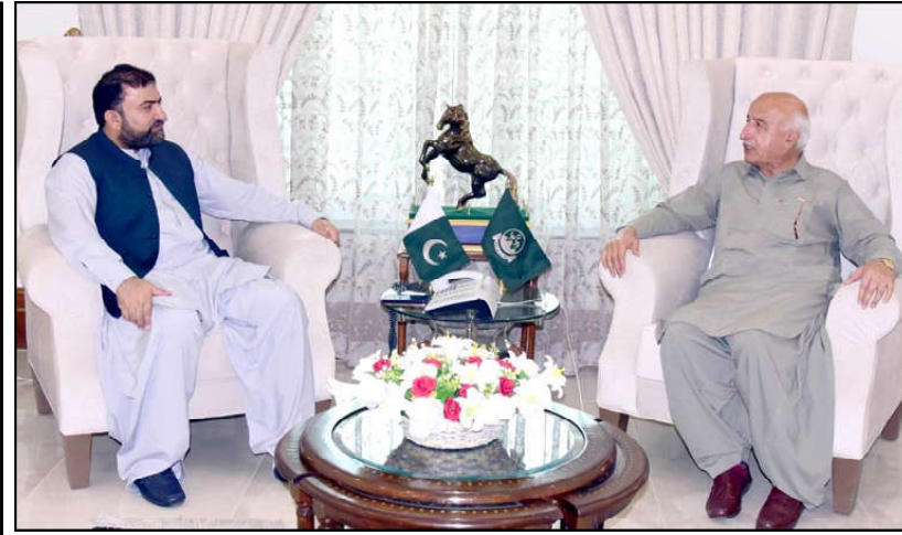
QUETTA: President National Party Dr. Abdul Malik Baloch meeting with Chief Minister Balochistan Mir Saifur Khan Bugti.

According to a notification issued by the Establishment Division, the BPS-21 officer "is transferred and posted as Chairman, Federal Board of Revenue, under Section 10 of the Civil Servants Act, 1973, with immediate effect."