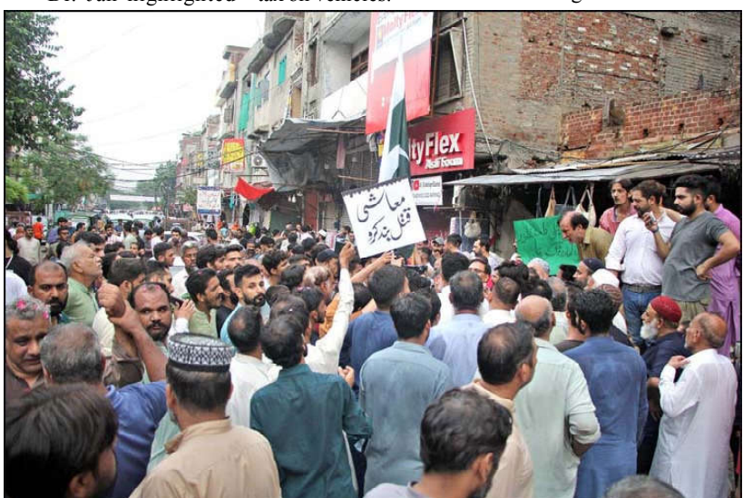
LAHORE: Members of Anjuman-e-Tajran Lahore are holding protest demonstration against withholding taxes and high inflated electricity bills, at Saddar Cantt in Lahore.