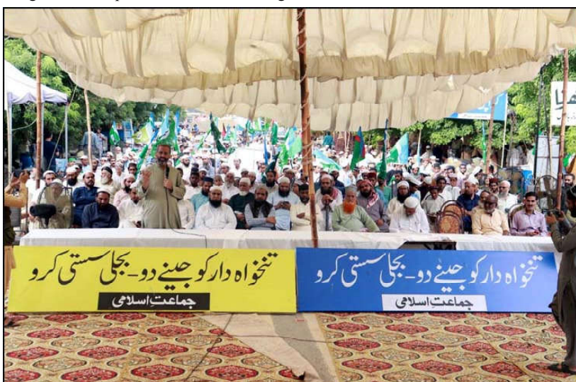
KARACHI: Leaders and activists of Jamat-e-Islami (JI) are holding protest demonstration against massive unemployment, increasing price of daily use products and inflation price hiking of electricity and petrol, nearby Governor House building in Karachi.

During his visit to the district's government hospitals, the minister addressed the media, highlighting the critical issues of medicine shortages, inadequate staffing, and lack of facilities in the hospitals. He committed to coordinating with the Health Minister and the Health Department to ensure prompt provision of essential health services.