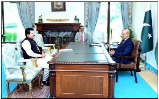
ISLAMABAD: Former Chairman Senate and Member of Balochistan Assembly Sadiq Sanjrani calls on Prime Minister Muhammad Shehbaz Sharif.