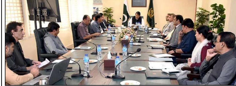
ISLAMABAD: Federal Minister for Kashmir Affairs & Gilgit Baltistan Engr Amir Muqam chairing a meeting regarding Gilgit Baltistan.