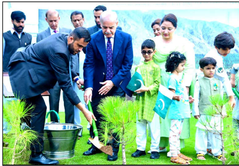
ISLAMABAD: Prime Minister Shehbaz Sharif planting a sapling to launch Monsoon Tree Plantation campaign.

party to display its candidates lists for both women and minority seats. He said one fails to fathom the logic and stance of the PTI leadership that they should not hold intra-party elections without any legal action or punishment on that account. About the situation in Bangladesh, he said that the government and people of Pakistan stood with the people of that country. He appreciated the determination and resilience of the Bangladeshi people for standing up against the regime marred by corruption. Tarar said in Pakistan, the PTI founder chairman had compared himself with Sheikh Mujeeb eulogizing his stance in 1971 which Pakistanis considered as against national interests. PTI leaders during television talk shows claimed that their leader was like Sheikh Mujeeb, he added.