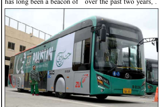
PESHAWAR: A view of BRT bus decorated with national flag for the celebrations of 77 Independence Day at Trans Peshawar Terminal.

The spokesman Rescue 1122, Muhammad Usman informed APP that search and rescue operations were initiated in both areas immediately.