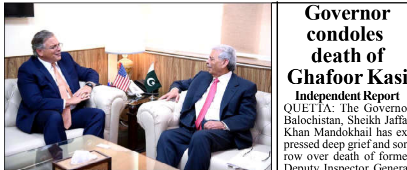
ISLAMABAD: H.E. Donald Armin Blome, Ambassador of the United States of America to Pakistan calls on Federal Minister for National Food Security and Research Rana Tanveer Hussain.