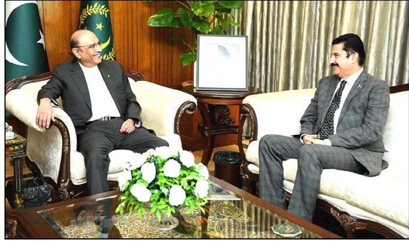
ISLAMABAD: Governor Khyber Pakhtunkhwa, Mr Faisal Karim Kundi, called on President Asif Ali Zardari, at Aiwan-e-Sadr.