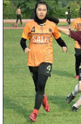
ISLAMABAD: Female football players of Highlanders WFC vs Hazara Quetta WFC teams in action during the National Women's Football Club Championship 2024 Final Round at Sports Complex.

Kakar emphasized that planting trees is a national duty and social responsibility, urging citizens to actively participate in the campaign and take care of the trees. He stressed the importance of collective efforts to make the plantation drive a success.