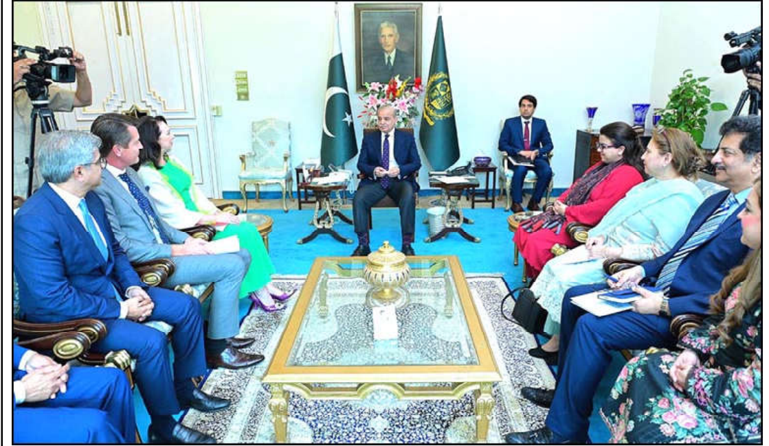
ISLAMABAD: A delegation of GSM Association calls on Prime Minister Muhammad Shehbaz Sharif.

Commenting on the tragic assassination of Hamas leader Ismail Haniyeh in Tehran, Ishaq Dar said that no amount of words is enough to condemn this horrendous act.