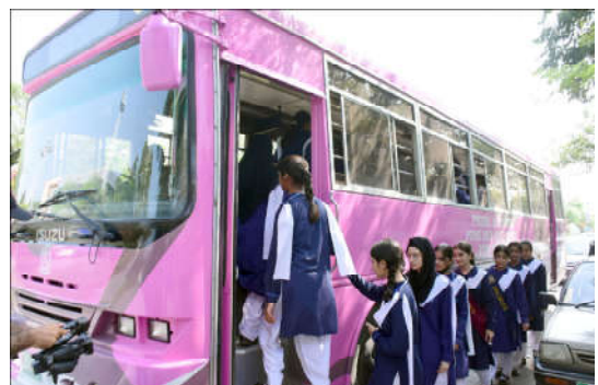
ISLAMABAD: Students boarding pink bus on her way at a road in the Federal Capital, Ministry of Federal Education and Professional Training notified 10 routes for the 'Pink Bus Service' - a fleet of 20 buses to facilitate female students, teachers and other women commuting from rural to urban areas.