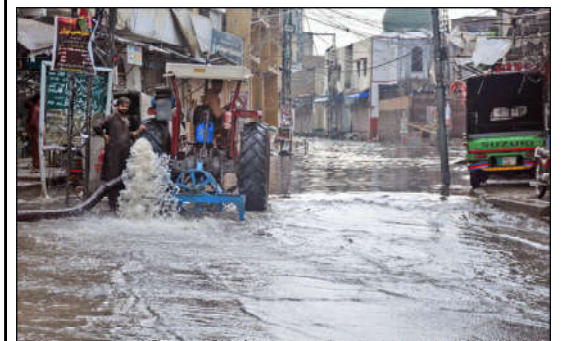
RAWALPINDI: Workers are busy in draining accumulated rain water after heavy rain in Imam Bara road area, in morning hours in the city.

Safe City Free Wi-Fi service is available for public at 10 locations in Kasur including DHQ Hospital, Women's College, New Bus Terminal, Railway Station, Model Bazar, DC Office, National Bank Chowk and other places, she said and directed the relevant authorities to start the service at 20 more points in Kasur. Chief Minister Maryam Nawaz Sharif said that Safe Cities will soon be functional in Rawalpindi, Faisalabad and Gujranwala, adding that by the end of this year, Safe City Authority will be established in 18 cities. Women and students will also be able to get help in emergency situations from CM Maryam Nawaz Free Wi-Fi service, she mentioned.