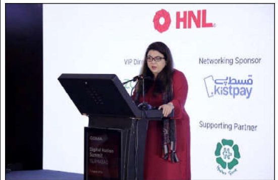
ISLAMABAD: Minister of State for IT and Telecommunication Ms. Shaza Fatima Khawaja addressing Digital Nation Summit.