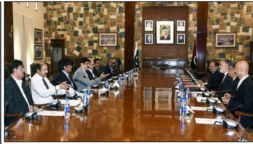
KARACHI: Sindh Chief Minister, Syed Murad Ali Shah in meeting with National Accountability Bureau (NAB) Chairman, Lt. Gen. (Retd) Nazir Ahmed discuss the progress of ongoing inquiries and investigations within the province, at CM House in Karachi.

It was pointed out that the Technical Evaluation has been shared with the WB. The firm is planned to be on board by August 30, 2024.