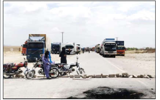
NUSHKI: A view of road which is closed due on 5th consecutive day due to protest of Baloch Yekjehti Committee at Qalam Kitab Chowk.

He stressed the importance of continuing the democratic journey, acknowledging that while democracy has its shortcomings, these are present even in developed democracies like the UK and the US.