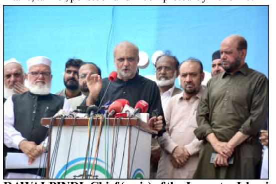
RAWALPINDI: Chief (emir) of the Jamaat-e-Islami Pakistan (JI) Hafiz Naem ur Rehman talking with media persons during sit-in protest outside Liaqat Bagh at Murree road in the city.