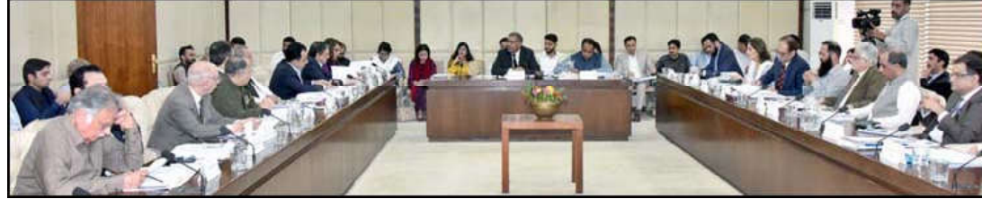
ISLAMABAD: Senator Syed Ali Zafar, chairman senate standing committee on information and broadcasting presiding over a meeting of the committee at Parliament House.

He mentioned that some 86 coalmines in Darra Adam Khel had brought a decline in illicit arms sales which was the mainstay of that community to only a 10% share of the total income of that area that helped extend complete livelihood opportunities to the local populace and curbed any possibility of terrorism resurgence.