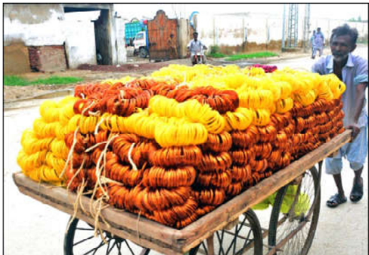
HYDERABAD: A labourer pushing hand cart loaded with bangles at Hali Road to deliver on shop in a local market.

at improving the local agriculture and livestock sectors. The minister highlighted that the government had launched various programs to support farming communities and noted the need to enhance farmers' capacities for modern crops. Speaking at the meeting, FAO's Country Representative in Pakistan, Florence Rolle, affirmed the organization's commitment to advancing the agricultural sector in Pakistan. She stated that the FAO will work together with stakeholders to build the capacity of farmers and researchers. Efforts are also underway to mitigate the impacts of climate change on agriculture, with the FAO determined to support Pakistan in developing its livestock sector to boost rural economies.