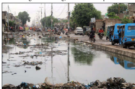
KARACHI: A view of accumulated sewerage water on a road at north Karachi area after the monsoon rains, in the Provincial Capital.