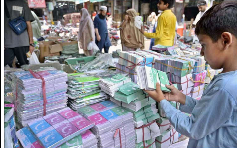
SARGODHA: A youngster purchasing national flags and other items from vendor in a local market in connection with upcoming Independence Day celebration.

ISLAMABAD (APP): The 100-index of the Pakistan Stock Exchange (PSX) turned around to bullish trend on Tuesday, gaining 106.85 points, a positive change of 0.14 percent, closing at 77,191.34 points against 77,084.49 points on the last working day. A total of 600,896,301 shares were traded during the day as compared to 501,191,841 shares the previous day, whereas the price of shares stood at Rs 17,127 billion against Rs 21,057 billion on the last trading day. As many as 443 companies transacted their shares in the stock market.