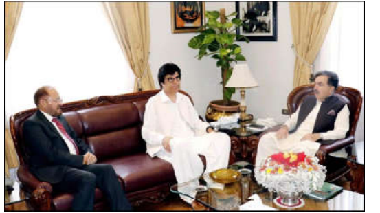
QUETTA: Former Vice Chancellor BUITEMS and Brigadier (retd) Saba Khan meeting with Balochistan Governor Jaffar Khan Mandokhail.

ISLAMABAD (APP): The Senate Standing Committee on Finance and Revenue on Tuesday sought updates on the budget recommendations made by the Senate finance Committee. The committee was briefed in detail about number of recommendations fully implemented, partially implemented and rejected. The Senate Standing Committee on Finance and Revenue convened at the Parliament House, chaired by Senator Saleem Mandiwala. Federal Minister for Finance and Revenue, Muhammad Aurangzeb also attended the meeting. The meeting addressed several agenda items including budget recommendations, FBR Policy board nomination, and status of Officer on Special Duty (OSD), tax exemptions for institutions and import of hydrocarbon solvent. The chairman expressed concerns over lists of officers reportedly being sent to OSD by the Prime Minister's office, stressing that such actions require evidence. The FBR reiterated that officers are not sent to OSD without substantiated evidence or disciplinary proceedings. The chairman noted that the FBR chairman has decided to take early retirement and suspended several officers, and an in-camera meeting will be arranged to address grievances. The committee resolved to dispose of several government bills, including "The Deposit Protection Corporation (Amendment) Bill, 2024."