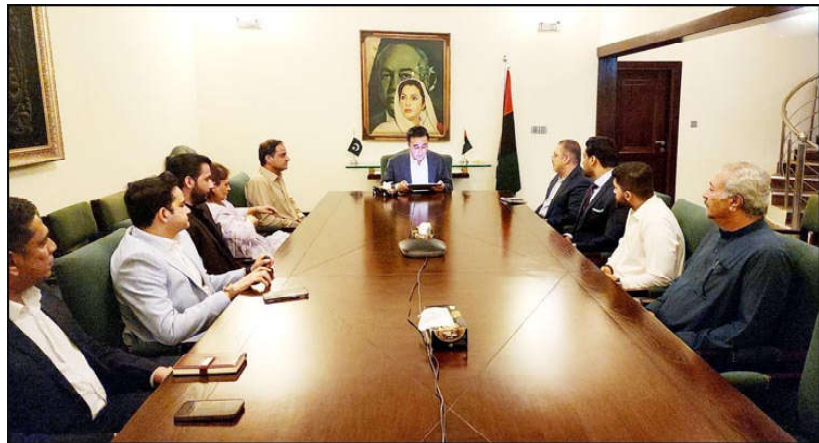
KARACHI: Chairman PPP Bilawal Bhutto presides over the meeting of spokesmen of Sindh Government.