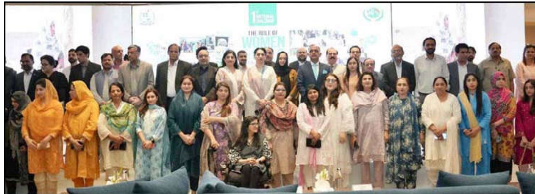
ISLAMABAD: NDMA Held One-Day National Dialogue on Role of Women & Girls in Disaster Risk Reduction. APP/TZD/FHA

A significant number of Palestinian students are expected to arrive in Pakistan in the near future under this program.