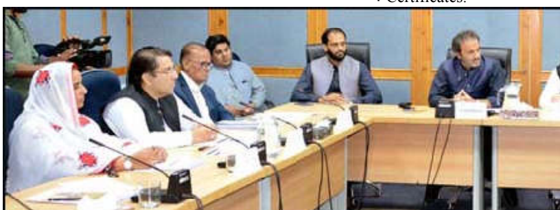
ISLAMABAD: Senator Aon Abbas, chairman senate standing committee on industries and production presiding over a meeting of the committee at Parliament Lodges.

any circular for the stoppage of sugarcane cultivation in specific areas. He said that the crop of sugarcane is in surplus therefore no one should panic about scarcity of sugar. He said that the agriculture sector in Pakistan is actively engaged in various projects aimed at enhancing water conservation and efficiency in water usage. He said that the "National Water Policy 2018" and "National Climate Change Policy 2021" advocate for the promotion of less water-intensive varieties of major crops as part of efforts to conserve water.