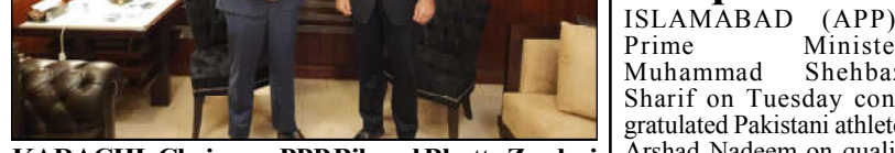
KARACHI: Chairman PPP Bilawal Bhutto Zardari in a group photo with Sindh Chief Minister after meeting at Bilawal House.

ISLAMABAD (APP): Prime Minister Muhammad Shehbaz Sharif on Tuesday congratulated Pakistani athlete Arshad Nadeem on qualifying for the final round of the javelin throw events at the 2024 Olympics. He lauded Arshad Nadeem's outstanding performance, stating he has won the admiration of the entire nation through his exceptional work and relentless dedication. The prime minister wished Arshad Nadeem success in the 2024 Olympics and praised his contributions for promoting the javelin throw. He highlighted that Arshad Nadeem's hard work and dedication served as an inspiration for the youth and recalled the meeting with Arshad Nadeem at the PM House in March 2024.