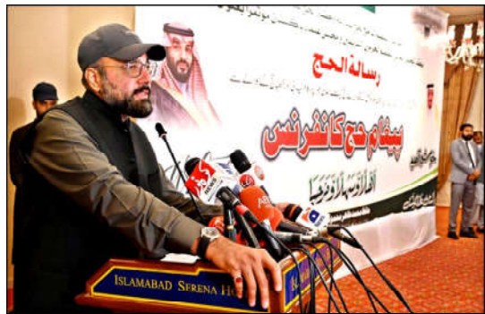
ISLAMABAD: Federal Minister for Religious Affairs Chaudhry Salik Hussain addressing to the Paigham-e-Hajj Conference organized by Pakistan Ulama Council and International Organization of Harmin Sharifain.