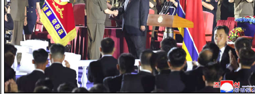
North Korean leader Kim Jong Un attends a ceremonial event to mark the delivery of new tactical ballistic missiles to his country's troops at an undisclosed location in North Korea.

As an Israeli air strike hit a hospital in central Gaza, health officials said at least 44 Palestinians were killed on Sunday. The Palestinian official news agency Wafa and Hamas media said dozens were wounded in addition to the 25 fatalities in the schools of Hassan Salama and Al-Nasser, which housed Palestinian displaced families. They said the strike destroyed several structures inside the facilities. The Israeli military accused Hamas of operating from within civilian property, though Hamas denies using civilian institutions for military purposes. Earlier in the day, an Israeli strike inside the Al-Aqsa Hospital compound started a fire, and wounded at least 18 people as well as killing five, medical au-