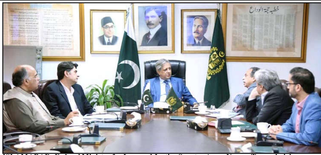
ISLAMABAD: Federal Minister for Law and Justice Senator Azam Nazeer Tarar chairing second meeting of the Committee to give recommendations for Independent Drug Pricing Body.

Speaking to the interns, he said that they are now part of the NUST family, and put an accent on warmly greeting them again.