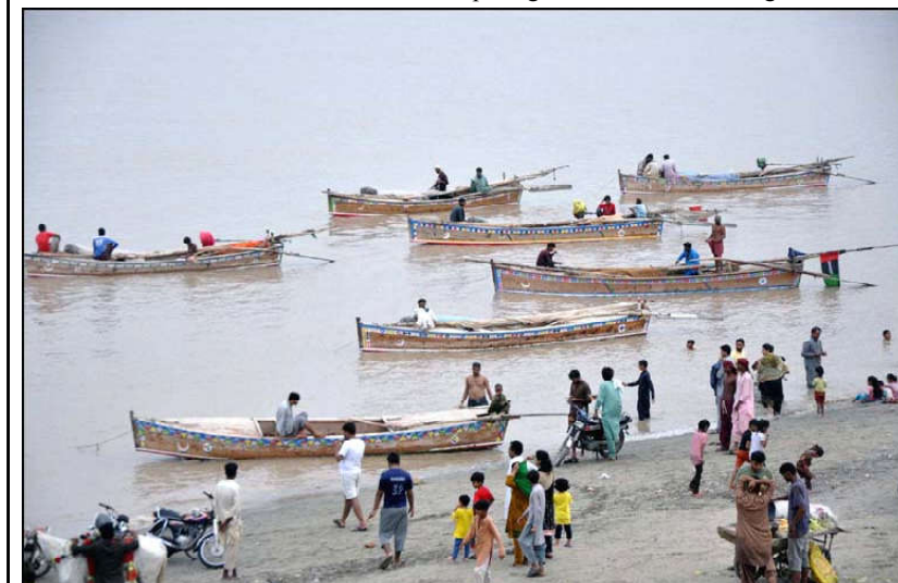
HYDERABAD: A large numbers of people are enjoying bath to beat the heat of scorching sun during a hot day of summer season and prolong electricity load shedding, at Indus River in Hyderabad.

He said the amendment in the law will be for the future. "If the law flouts the constitution, it could be challenged in the court", he said. It is pertinent to mention here that the legislation was done after the decision of the Supreme Court's decision declaring the Pakistan Tehreek-e-Insaf (PTI) eligible for reserved seats. A 13-member bench of the top court, headed by Chief Justice Qazi Faez Isa, ruled that the PTI is eligible for the allocation of reserved seats, dealing a major setback to Prime Minister Shehbaz Sharif's ruling coalition.