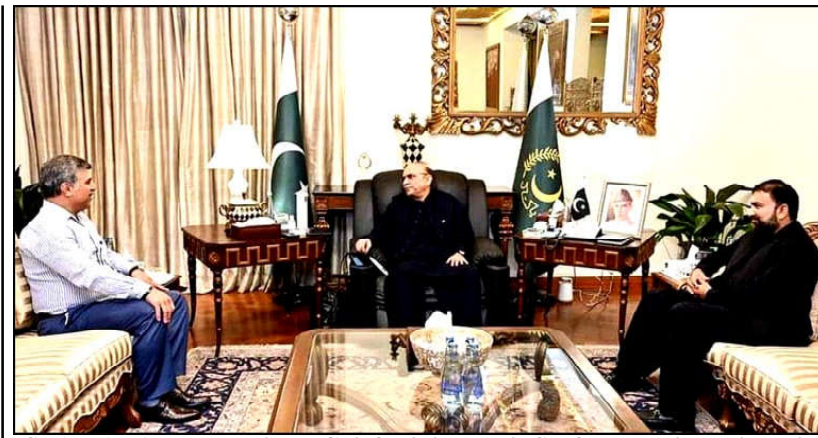
ISLAMABAD: Balochistan Chief Minister Mir Sarfraz Bugti meeting with President Asif Ali Zardari. Deputy Speaker National Assembly Ghulam Mustafa Shah is also present.

The letter has also been sent to the chief secretaries of all four provinces of the country.