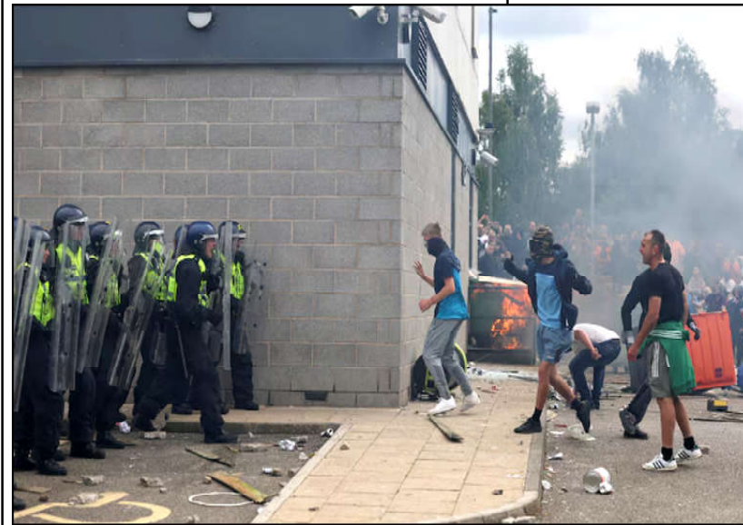
Demonstrators clash with police officers during an anti-immigration protest, in Rotherham, Britain.