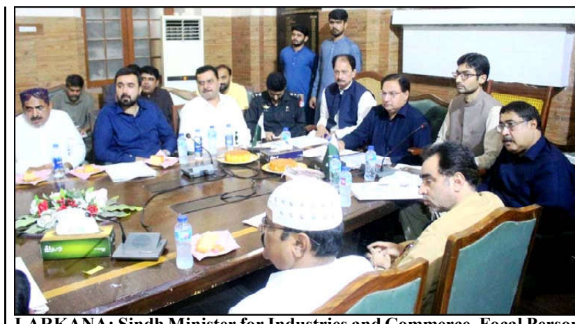
LARKANA: Sindh Minister for Industries and Commerce, Focal Person Rain Emergency for Larkana, Jam Ikramullah Dharejo presides over the meeting regarding rains of monsoon season, at Deputy Commissioner office in Larkana.

Today, the entire nation, the scholars of Pakistan, are standing by the side of their brave armed forces for the development