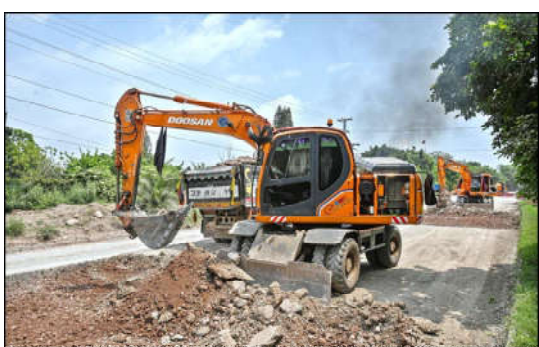
ISLAMABAD: Heavy machinery is being used for the construction of a new road at Chak Shahzad during development work in the Federal Capital.