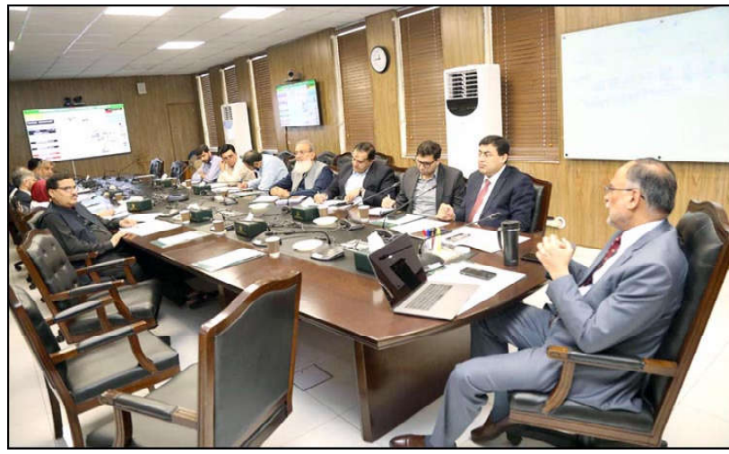
ISLAMABAD: Federal Minister for Planning Development & Special Initiatives, Ahsan Iqbal chairing a meeting to review the road and rail connectivity plans with Central Asian States and Europe.

ISLAMABAD (APP): Minister for Planning, Development and Special Initiatives Ahsan Iqbal on Tuesday chaired a review meeting of the projects related to road and rail connectivity with Central Asian and European countries. Among others, the meeting was attended by the Additional Secretary of the Ministry of Planning, members of the Planning Commission, and senior officials from the Ministry of Communications and the Ministry of Railways. During the meeting, officials from the Ministry of Railways and the Ministry of Communications presented their strategic connectivity plans. The minister underscored the importance of establishing a comprehensive roadmap for collaboration with Central Asian states. "Pakistan is located at a strategic location & can become a hub of regional connectivity following a multi-model transparent strategy. We must provide efficient and reliable trade corridors for taking full advantage of our location," he said. Ahsan Iqbal directed the ministries concerned to finalize their plans, addressing any missing links in the connectivity with Central Asian states. He stressed that all proposals should be feasible and thoroughly prepared, adding "We need to ensure that our proposals are actionable and ready for implementation." The meeting concluded with a consensus on expediting the finalization of the connectivity plans to enhance regional cooperation and economic integration with Central Asia.