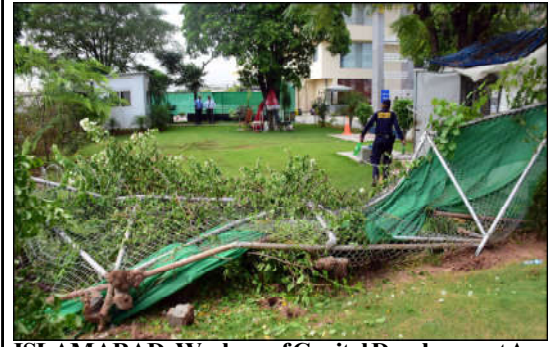
ISLAMABAD: Workers of Capital Development Authority (CDA) busy in demolishing illegal occupied area on a green belt from a local hotel during Anti-encroachment operation in the Federal Capital.

He stated that the widespread use of plastic bags contributes significantly to environmental pollution. Deputy Commissioner urged residents to support the district administration's efforts in this crackdown on plastic bags.