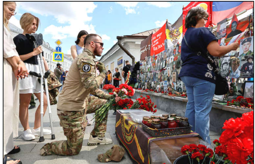
People gather in front of a makeshift memorial, which was erected following head of Russia's Wagner mercenary group Yevgeny Prigozhin and group commander Dmitry Utkin's death in 2023, during a commemoration ceremony held to pay tribute to Wagner fighters, who were recently killed in Mali by northern Tuareg rebels, in central Moscow, Russia.

population — in urgent need of humanitarian aid. Aid agency Médecins Sans Frontières (MSF) said earlier this year that a child died every two hours in the camp, which holds half a million people. On Sunday it said in a post on X: "Our teams only have enough therapeutic food to treat malnourished children in Zamzam camp, Sudan, for another two weeks." But Sudan's Federal Humanitarian Aid Commission, a governmental body, said on Sunday that talk of famine was inaccurate and conditions were "not consistent" with those that must be met to declare famine. The Sudanese government blamed the RSF for imposing what it said was a blockade on al-Fashir, capital of North Darfur, that led to shortages in food and aid. Al-Fashir is the only significant holdout from the RSF across Darfur. The RSF on Friday declared "full solidarity" with victims of the famine and repeated an offer to work with the United Nations to facilitate delivery of aid.