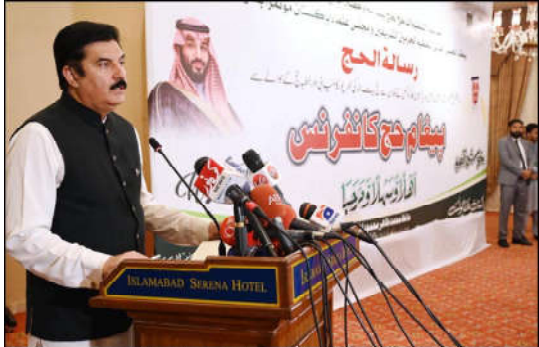
ISLAMABAD: Governor of Khyber Pakhtunkhwa Faisal Karim Kundi addressing to the Paigham e Hajj Conference organized by Pakistan Ulama Council and International Organization of Harmain Sharifain.

He said, "We all together will write the destiny of Pakistan with the power of education". The federal minister said that due to technological advancements, one billion people in different jobs will become irrelevant in the future.