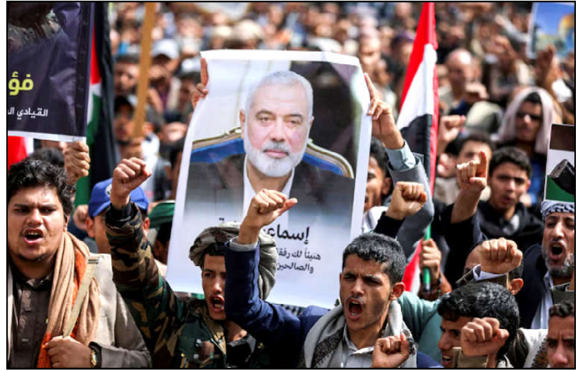
A demonstrator holds up a poster of assassinated Hamas chief Ismail Haniyeh during a protest to show solidarity with Palestinian prisoners, outside the United Nations offices in Sanaa, Yemen.

blamed the strike on Israel, which has declined to comment. ISNA news agency said Safadi "met and held consultations with" acting foreign minister Ali Bagheri after landing in Tehran. Jordan's top diplomat then met Pezeshkian, who said Haniyeh's killing was a "grave" and "brazen" act by Israel and vowed anew to avenge his death, the official news agency IRNA reported. Earlier, IRNA said Safadi would "exchange views with Iranian officials on regional and international issues" during his visit.