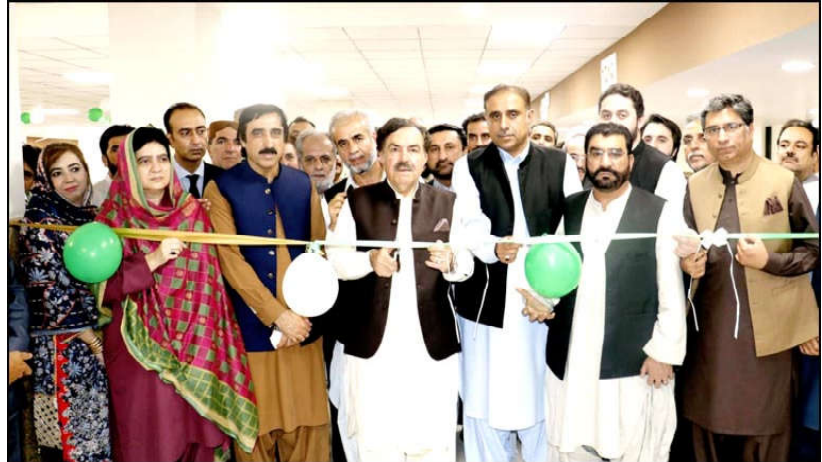
QUETTA: Balochistan Governor Jaffar Khan Mandokhail, Provincial Ministers, MPAs and other high ups inaugurate Quetta to Jeddah special Umrh Flight.