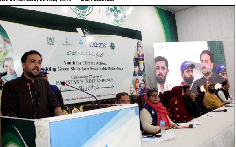
QUETTA: Balochistan Adviser Labour and Manpower, Baba Ghulam Rasool Imrani addresses to participants during seminar on Youth for Climate Action organized by Pakistan Poverty Alleviation Fund (PPAF), held in Quetta.