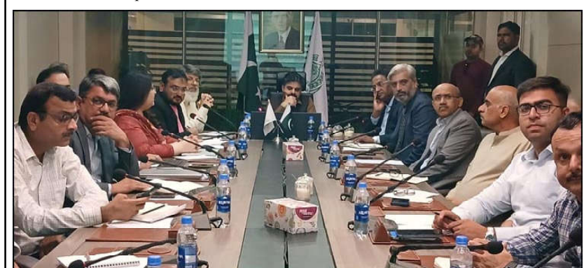
KARACHI: Sindh Energy Minister Syed Nasir Hussain Shah presides over the meeting.