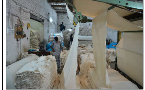
FAISALABAD: A labourer working in a local industry in the city.