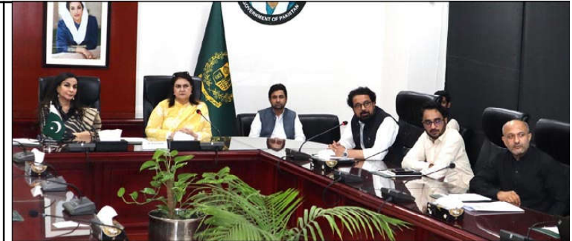
Senator Sherry Rehman, Chairperson of the Standing Committee Senate on Climate Change and Environmental Coordination, visited the Benazir Income Support Programme (BISP) Headquarters Islamabad

The interior minister emphasized that there is no justification for parking such a large number of motorcycles in the police station. The motorcycles belong to citizens and must be returned to them.