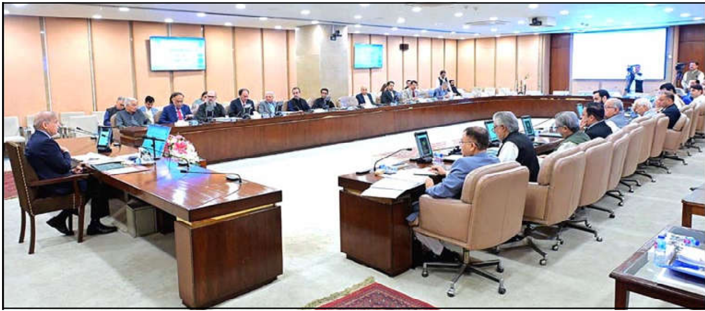
ISLAMABAD: Prime Minister Muhammad Shehbaz Sharif chairs a meeting of the Federal Cabinet.