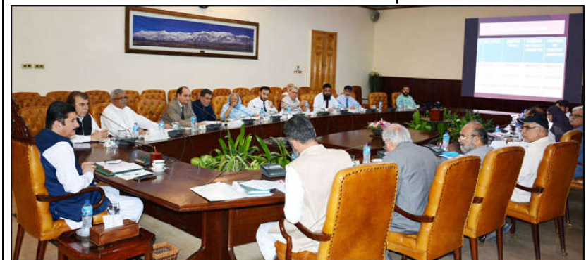
PESHAWAR: Governor Khyber Pakhtunkhwa Faisal Karim Kundi presides over the BoGs meeting of Edwards college at Governor House.

PESHAWAR (APP): Governor Khyber Pakhtunkhwa, Faisal Karim Kundi on Friday strongly condemned the firing incident on judges' vehicles in Tank District. In a statement, the governor expressed profound sorrow over the loss of two policemen who were providing security to the judges. He conveyed his heartfelt condolences and sympathy to the families of the slain officers. Governor Kundi also offered prayers for the elevation of the martyrs' ranks and patience for their bereaved families. He extended his best wishes for the early recovery of those injured in the attack.