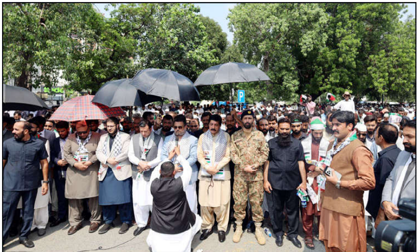
LAHORE: Governor Punjab Sardar Salim Haider and a large congregation offer absentia funeral prayers for Ismail Haniyeh at Masjid Shahada.

PESHAWAR (APP): Chief Minister Khyber Pakhtunkhwa Sardar Ali Amin Gandapur on Friday met with parliamentarians and party leaders from all four regions of the province. The meetings focused on resolving public issues, public welfare projects and rehabilitation of infrastructure affected by monsoon rains. The chief minister announced that over 600 development projects nearing completion across the province, would be finished by December this year. He emphasized the importance of prioritizing ongoing development projects and devolving project authorities to the local level. He directed the elected representatives to propose projects based on local needs and priorities, ensuring wise use of public taxes. He also announced that these development projects would only be inaugurated when they were fully completed and providing public services. The chief minister said that he was working to strengthen local government institutions to resolve public issues locally. Funds have been allocated for the rehabilitation of infrastructure affected by monsoon rains, and relief activities will be initiated on a priority basis, he said. The meetings also discussed to make successful the August 5 rally in Swabi by ensuring maximum participation from the Party workers and the public.