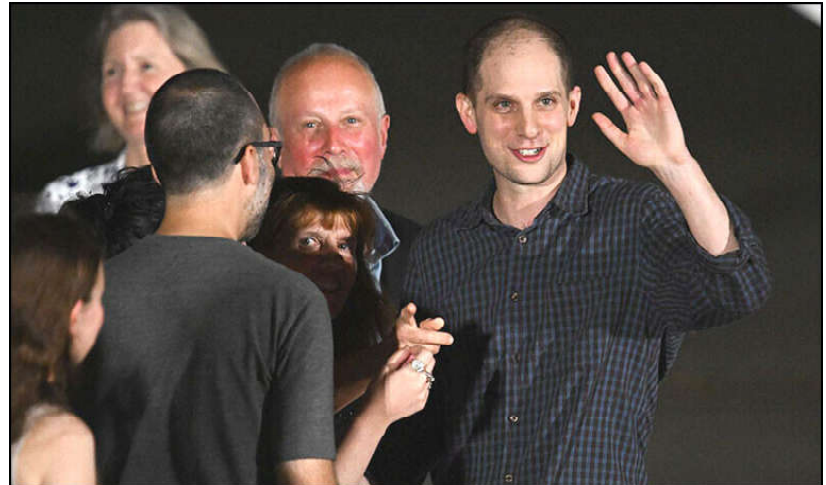
Former prisoner held by Russia US journalist Evan Gershkovich waves as he arrives at Joint Base Andrews in Maryland.