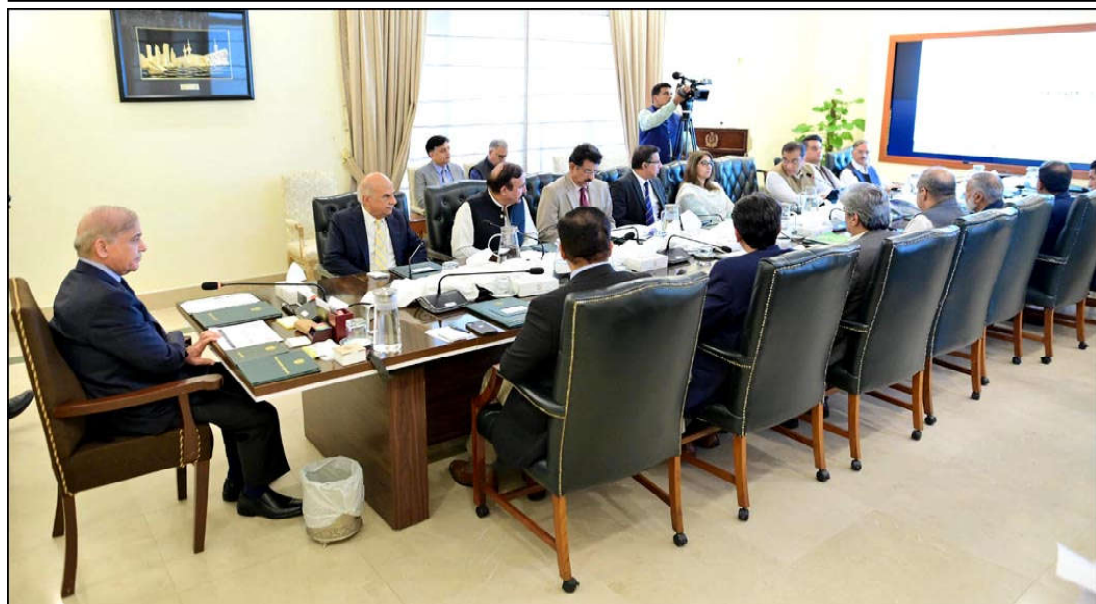
Prime Minister Muhammad Shehbaz Sharif chairs a review meeting regarding Jinnah Medical Complex in Islamabad