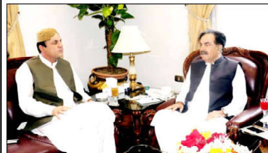
QUETTA: Speaker Balochistan Assembly Captain (Retd) Abdul Khaliq Achakzai meeting with Governor Balochistan Sheikh Jaffar Khan Mandokhail

from the roads," the deputy commissioner added. "The arrested people would be released after the protesters disperse peacefully," it added. The ministry has also vowed to reopen all roads for traffic and remove obstacles, ensuring the smooth movement of vehicles. Additionally, the deputy commissioner has assured that arrested individuals will be released once the protesters disperse peacefully. The sit-in began when protesters were prevented from attending the BYC's meeting in Gwadar, resulting in the dispersal of convoys and injuries to 14 people in Mastung.