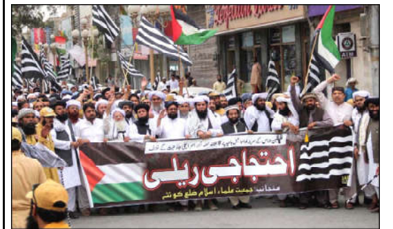
QUETTA: Activists of Jamiat Ulema-e-Islam (JUI-F) are holding protest rally against assassination of Hamas Leader Ismail Haniyeh, at Mannan Chowk.