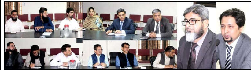
QUETTA: Director General NAB and DD FIA interacting with NAB officers during a training session arranged at NAB (Balochistan) regarding Blockchain and Cyber Security