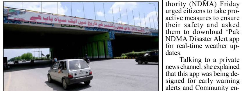
ISLAMABAD: A large banner hangs over the Zero Point Bridge in Federal Capital, observing a commemorating 5 August 2019 as a Black Day in the history of Jammu and Kashmir.

She introduced the Hybrid Social Protection Scheme, designed to promote savings culture among beneficiaries, ensuring they are better prepared for unforeseen climatic events.