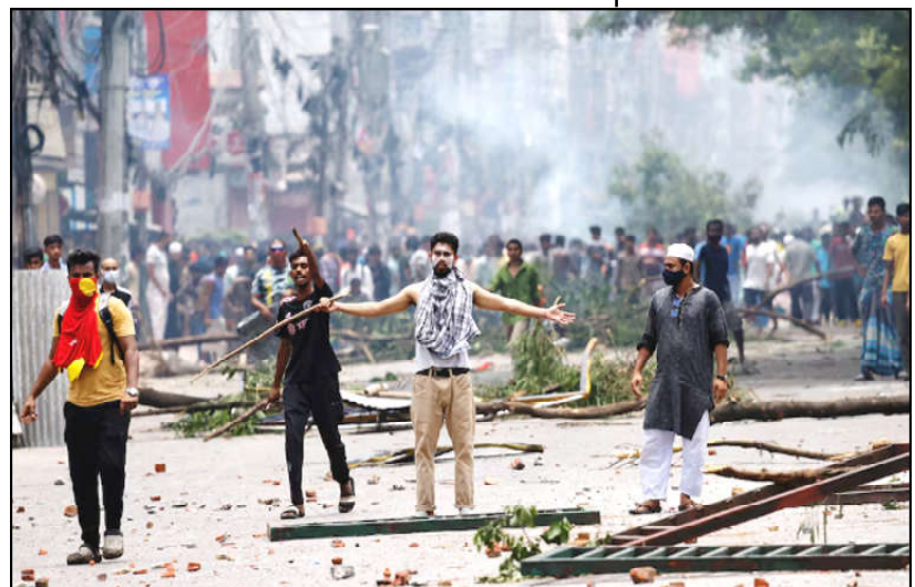
A demonstrator gestures as protesters clash with Border Guard Bangladesh (BGB) and the police outside the state-owned Bangladesh Television as violence erupts across the country protests by students, in Dhaka.

"The analysis of the adopted act shows that the provisions of the act raise doubts as to the violation of constitutionally protected values," Duda said in his submission to the Tribunal.