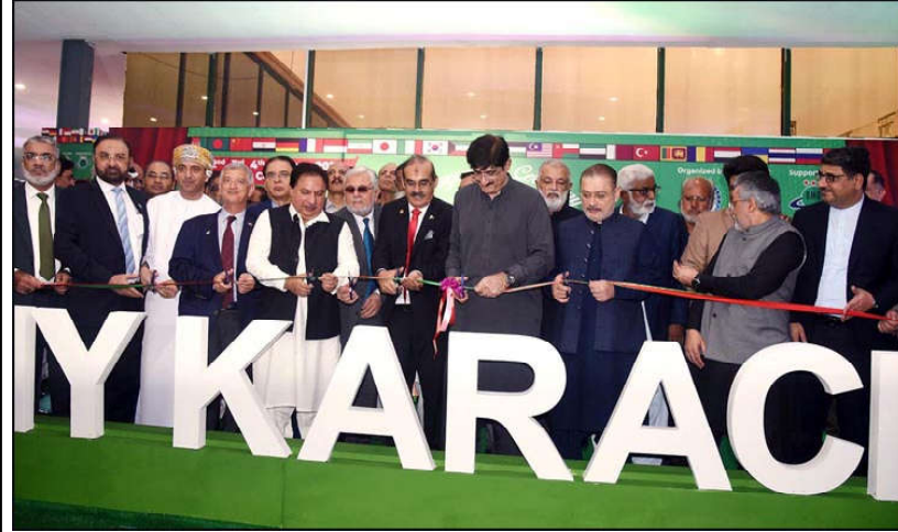
KARACHI: Sindh Chief Minister, Syed Murad Ali Shah cut the ribbon to inaugurate "My Karachi - Oasis of Harmony" Exhibition 2024 at the Expo Center.

ISLAMABAD (APP): The price of per tola of 24 karat gold increased by Rs.2,400 and was sold at Rs. 257,300 on Friday against its sale at Rs. 254,900 on last trading day. The price of 10 grams of 24 karat gold also increased by Rs. 2,057 to Rs. 220,593 from Rs. 218,536 whereas that of 10 gram 22 karat gold went up to Rs. 202,210 from Rs. 200,324, the All Sindh Sarafa Jewellers Association reported. The price of per tola and ten gram silver remained stagnant.