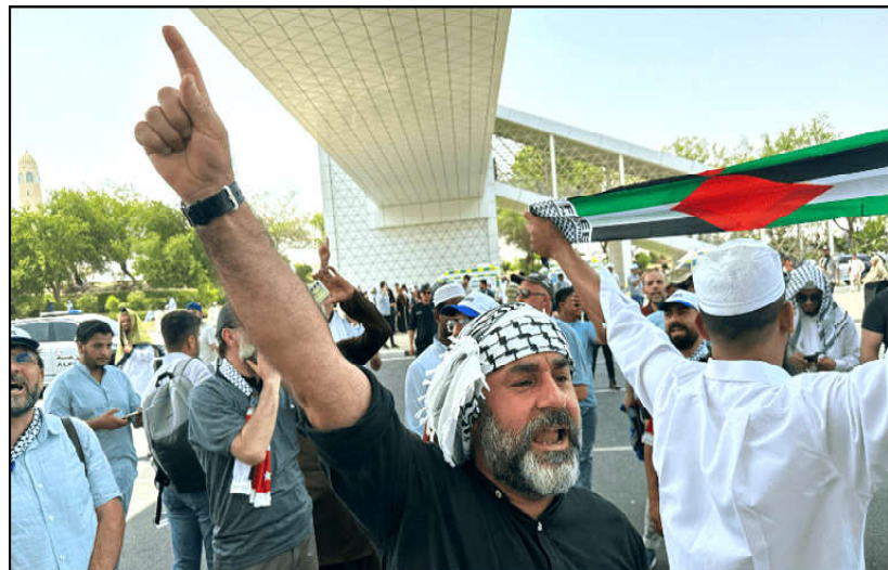
Mourners shout slogans in the grounds close to the Imam Muhammad bin Abdul Wahhab Mosque during the final prayers for Hamas leader Ismail Haniyeh during his funeral in the Qatari capital Doha.

Whelan and Vladimir Kara-Murza, a Russian-British dissident, both jailed in Russia.