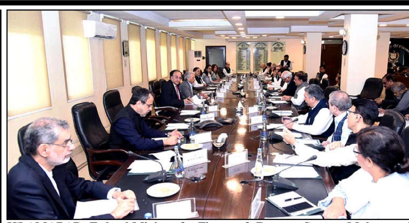
ISLAMABAD: Federal Minister for Finance & Revenue Senator Muhammad Aurangzeb presiding over a meeting of Economic Coordination Committee (ECC).

ISLAMABAD (APP): The Election Commission of Pakistan (ECP) on Friday reminded all the heads of Political Parties to submit their consolidated statements of accounts (Form-D) for financial year 2023-24 on or before August 29. "In terms of section 210 of the Elections Act, 2017 read with section 204 of the Act and rule 159 & 160 of the Election Rules, 2017, thereof, that the political parties are required to file with Election Commission their Consolidated Statement of Accounts on (Form-D) for financial year, 2023-24 ended on 30th June, 2024 on or before 29th August, 2024," said a press release issued here. It may be recalled that Section 210 of the Elections Act, 2017 provides that a Political Party shall, in such a manner as may be prescribed, submit to the Commission, within sixty days from the close of a financial year, a consolidated statement of its accounts audited by a Chartered Accountant on Form-D containing, annual income and expenses, sources of its funds and assets and liabilities.