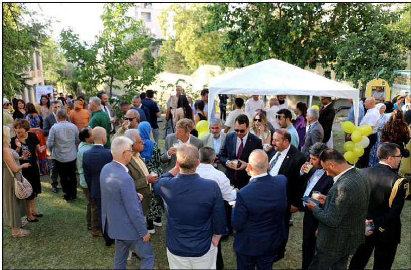
ANKARA: Guests enjoying Pakistani mangoes at a mango festival organized by the embassy in Ankara.