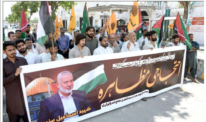
ISLAMABAD: Activists of Majlis Wahdat-e-Muslimeen hold a banner during protest in the Federal Capital, to condemn the assassination of Hamas political chief Ismail Haniyeh.

On the progress of the anti-encroachment drive, he instructed the installation of fencing on recovered land to prevent future encroachments. He also directed the ICT Administration to release weekly data comparing fruit and vegetable prices in Islamabad.