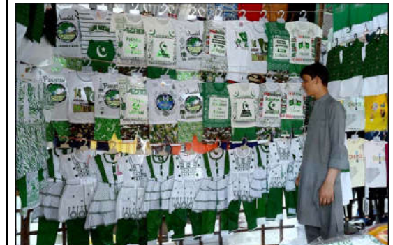
ISLAMABAD: A garment vendor selling a beautiful collection of children for upcoming Independence Day, 14th August, with each piece radiating patriotic spirit to captivate and attract customers.

On the other hand, the export of services during the fiscal year 2023-24 increased by 2.7 percent by going up to $7.806 billion from $7.595 billion last year. The services imports also increased from $8.638 billion last year to $10.119 billion this year, showing growth of 17.14 percent. Based on the figures, the services trade deficit was recorded at $2.313 billion in July-June (2023-24) against the deficit of $1.043 billion in July-June (2022-23), showing an increase of 121.76 percent.