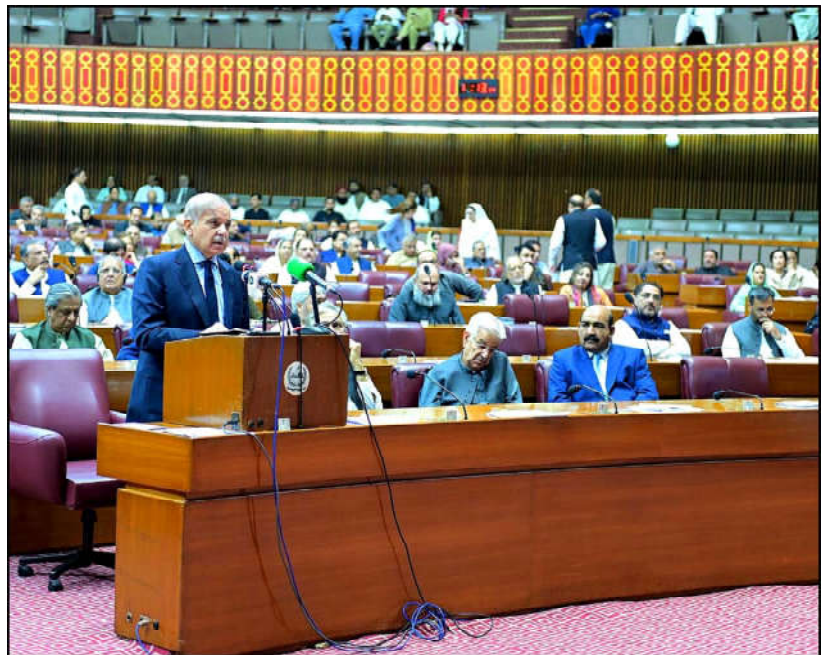
ISLAMABAD: Prime Minister Muhammad Shehbaz Sharif addressing National Assembly Session on situation in Palestine.

Ph: 2841470/2841473 REG: No. BC-116 B/ID-445 Vol XXV No 341, Muharram 27, 1446 AH Saturday August 03, 2024 Pages 08, Price Rs.15