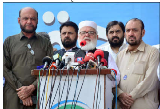
RAWALPINDI: Leader of Jamaat-e-Islami Liaqat Baloch addressing a press conference during sit-in protest Dharna at Murree road in the city.