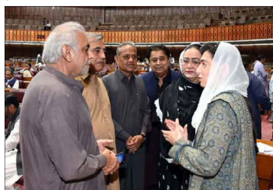
ISLAMABAD: Asifa Bhutto Zardari talking to MNAs during national assembly session at parliament house.

He also appealed the United Nations, Islamic countries and all human rights organizations to play their role in ending the growing Indian oppression in Kashmir.