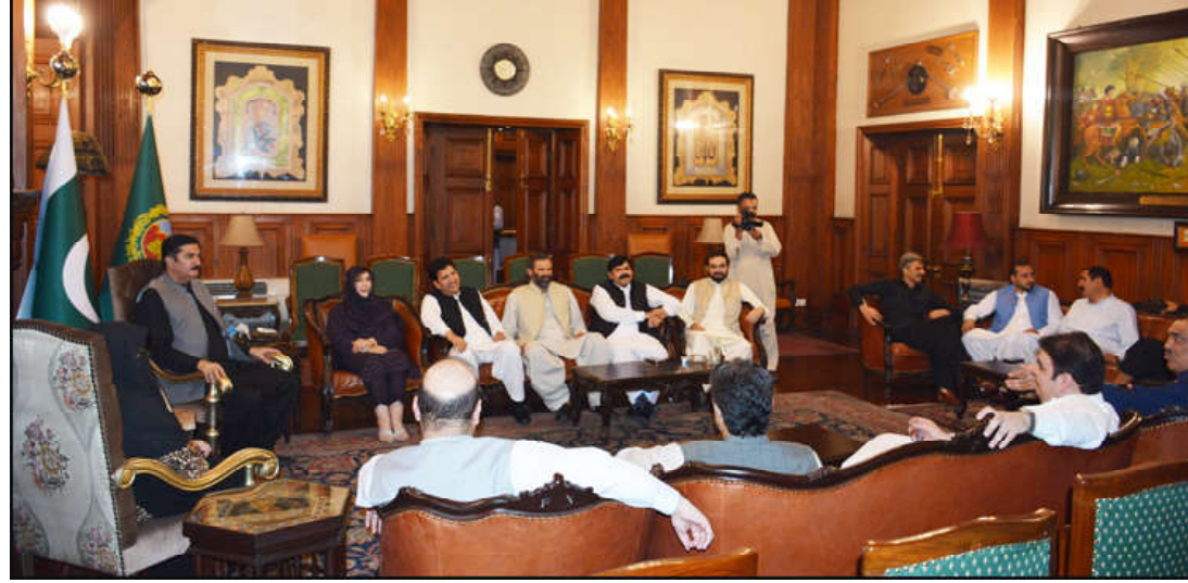
PESHAWAR: Opposition members and MPAs KPAssembly are participating in the dinner hosted by Khyber Pakhtunkhawa Governor Faisal Karim Kundi at Governor House.