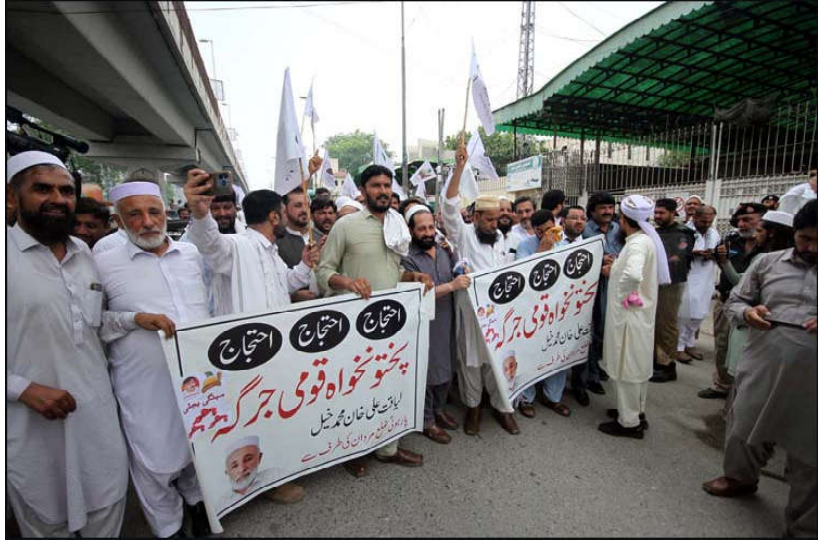
PESHAWAR: Members of Pakhtunkhwa Qaumi Jirga are holding protest demonstration for acceptance of their demands, outside High Court building in Peshawar.

Over the past six years, under LMKT's Pakistan.LMKT is a leading management, NIC Karachi offering innovative solutions has become Pakistan's in smart cities, smart largest tech incubator and buildings, integrated startup accelerator. The security, e-governance, centre has supported 299 clean technology, agri-tech startups, who have created 1 million jobs and raised a strong commitment to Rs. 9.1 billion.