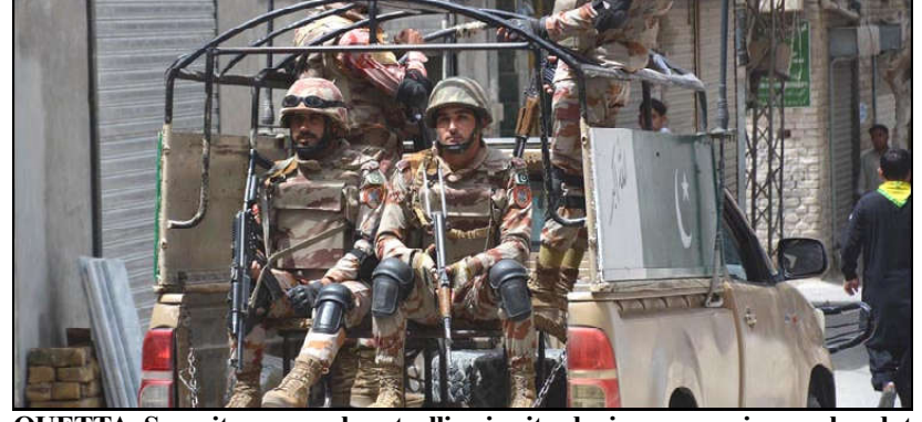
QUETTA: Security personals patrolling in city during procession on shaadat of Hazrat Imam Zain Ul Abidin.

The petition urged the court to initiate contempt of court proceedings against