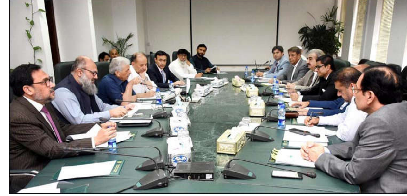
ISLAMABAD: The joint meeting of the Sugar Advisory Board and Cabinet Committee on Monitoring Sugar Export was presided over by Federal Minister for Industries and Production, Rana Tanveer Hussain.

energy project is a huge excessive fares. No one 2030, KE initiated a milestone for KE as well would ever be allowed to competitive bidding as for Pakistan. It process for multiple represents local. charge more than the fixed fare from the public.