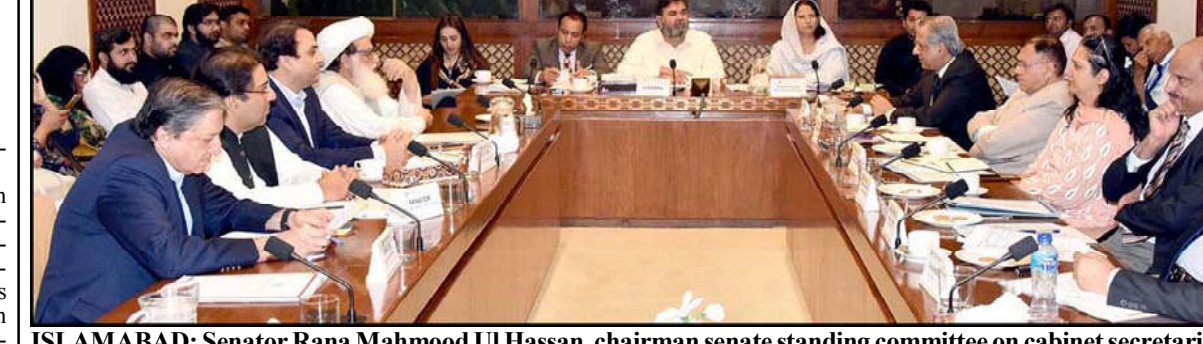
ISLAMABAD: Senator Rana Mahmood Ul Hassan, chairman senate standing committee on cabinet secretariat presiding over a meeting of the committee at Parliament House.