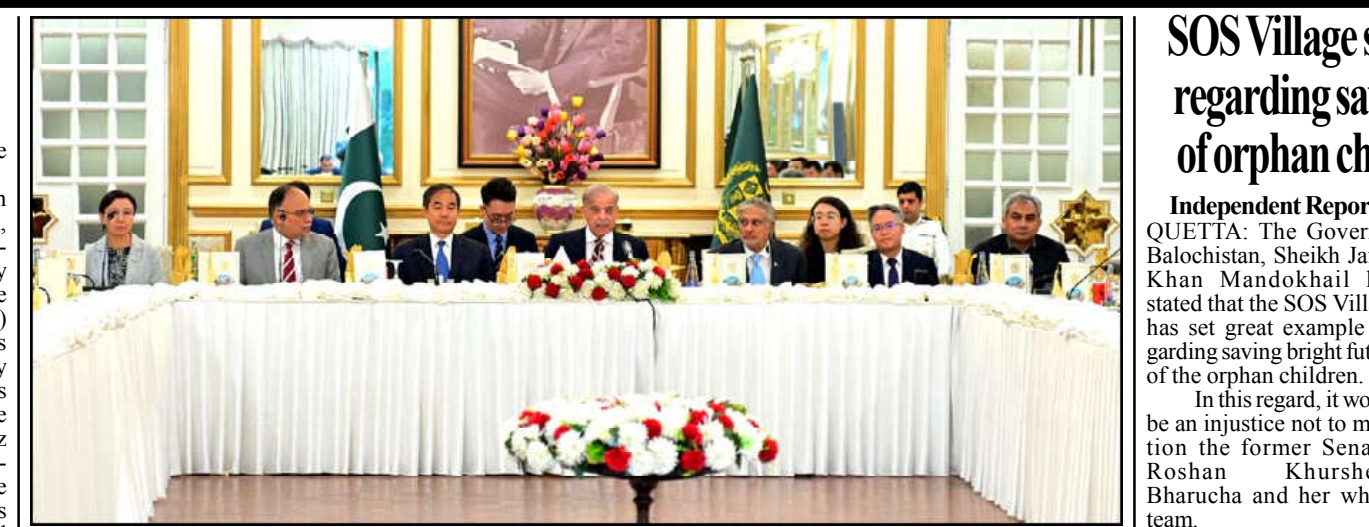
A high level delegation of Chinese experts calls on Prime Minister Muhammad Shehbaz Sharif in of a student from the SOS Islamabad.

public sector will be handed over the private sector. He said, there was no reason whatsoever the government holds on to those entities or their functions. Even the strategic functions would be done by private sector he said adding the government would be there