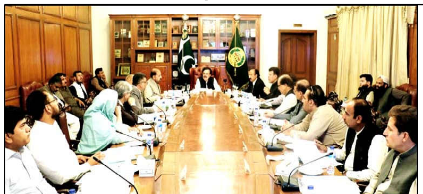
QUETTA: Balochistan Governor Jaffar Khan Mandokhail presides over the 10th Senate session of University of Balochistan.

Continued on page 2 | Parties regarding deteriorating situation in Palestine. Fateha offered for LEAs personnel killed in Gwadar and Pishin: