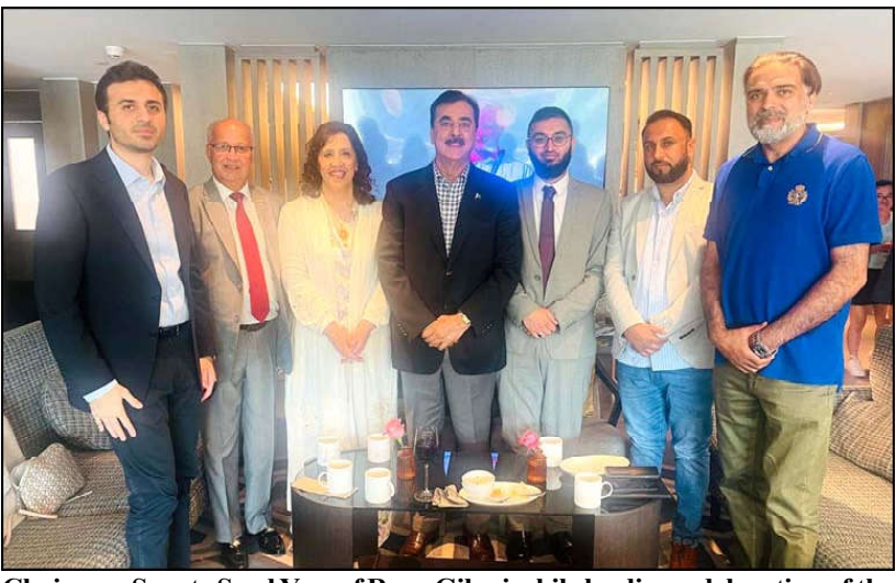
Chairman Senate Syed Yousaf Raza Gilani while leading a delegation of the members of Senate held a meeting with UK based representatives of Jammu & Kashmir self-determination movement, International Lobby on Kashmir and International Students society based in UK London.