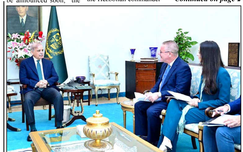
ISLAMABAD: A delegation of Asia Internet Coalition calls on Prime Minister Muhammad Shehbaz Sharif.