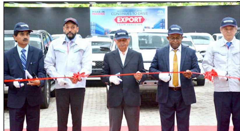
KARACHI: Federal Minister for Industries and Production, Mr. Rana Tanveer Hussain, is cutting the ribbon to inaugurate the vehicle export section at Toyota Indus Motors Company in Karachi.