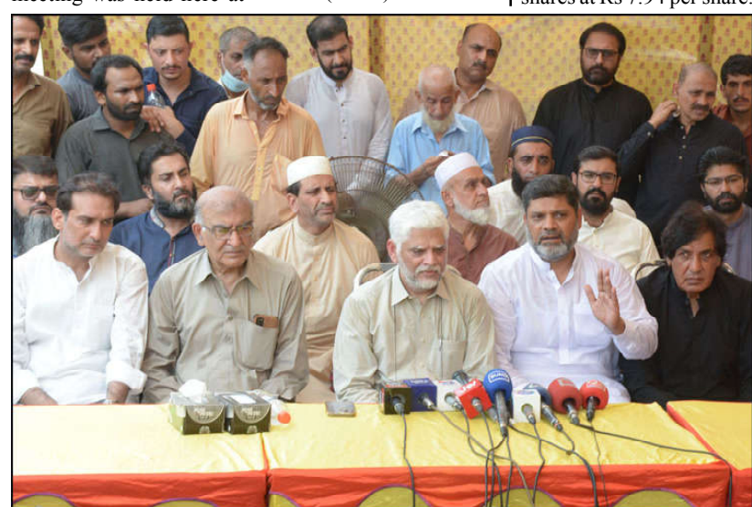
LAHORE: General Secretary, Akbari Mandi Traders, holding a press conference against the government's illegal withholding tax on food items in the provincial capital.

As many as 442 companies transacted their shares in the stock market, 118 of them recorded gains and 254 sustained losses, whereas the share price of 70 companies remained unchanged. The three top trading companies were WorldCall Telecom with 81,162,958 shares at Rs 1.25 per share, Kohinoor Spinning with 24,698,541 shares at Rs 4.08 per share and TLP Properties with 19,693,668 shares at Rs 7.94 per share.