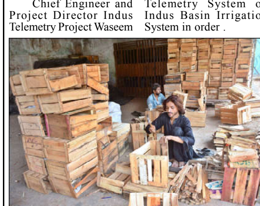
HYDERABAD: Labourers busy in preparing the wooden boxes at his workplace.