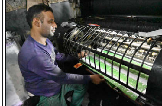
LAHORE: Paper flags of Pakistan are being printed at the printing press in preparation for Independence Day celebrations.

Chief Secretary, who outlined the issues faced by the GB government. Some of these issues were related to insufficient fund allocations and delays in PSDP projects which lead to employee related and other liabilities. The Chief Secretary advocated for solar power projects designed to address the region's growing energy needs. He also proposed initiatives for the digitization of land records and the expansion of airports to enhance tourism potential. These proposals aim to modernize GB's infrastructure and capitalize.