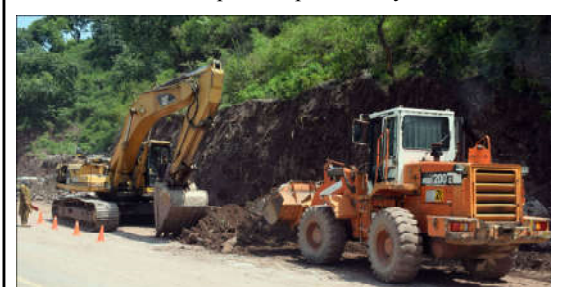
MUZAFFRABAD: Labourers are busy in construction work with the help of heavy machinery alongside a road in the city.