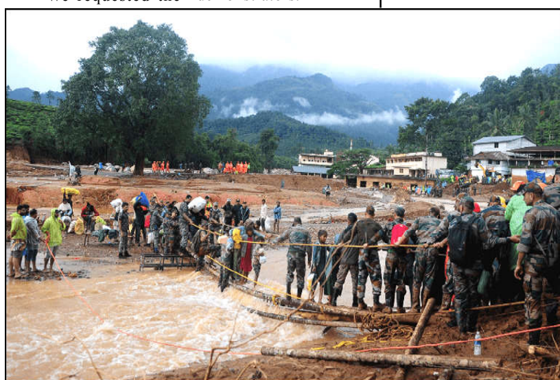
Army soldiers help trapped people to cross a temporary bridge at a landslide site after multiple landslides in the hills in Wayanad district, in the southern state of Kerala, India.

The committee has also suggested India to form a mechanism to identify the human rights violators.