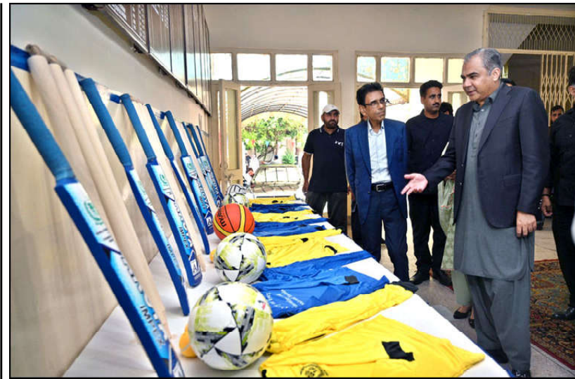
ISLAMABAD: Interior Minister and Chairman PCB Syed Mohsin Raza Naqvi and Federal Minister for Education and Professional Training, Dr. Khalid Maqbool Siddiqui viewing Sports Kits and Track Suits during distribution ceremony at Islamabad Model College for Girls (IMCG), F-6/2.