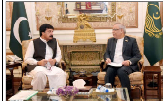
LAHORE: Iran Consul General in Lahore Mehran Movahed Far meeting with Punjab Governor Sardar Saleem Haider Khan.