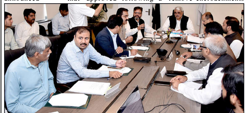
Management Authority (PDMA) on Wednesday. In the meeting, he emphasized the importance of river erosion prevention schemes which will be approved following a detailed model study. This study will include an assessment of the affected population, agricultural land, and the economic situation in the regions at risk. He highlighted the proactive measures taken by the administration of Dera Ghazi Khan which provided a briefing on preparations for possible flooding in hill torrents. The minister directed district administrations to remove encroachments from river basins and channels and to educate citizens about the risks of rains and floods. He stressed the importance of using mosques and other local resources to disseminate information, urging district revenue.