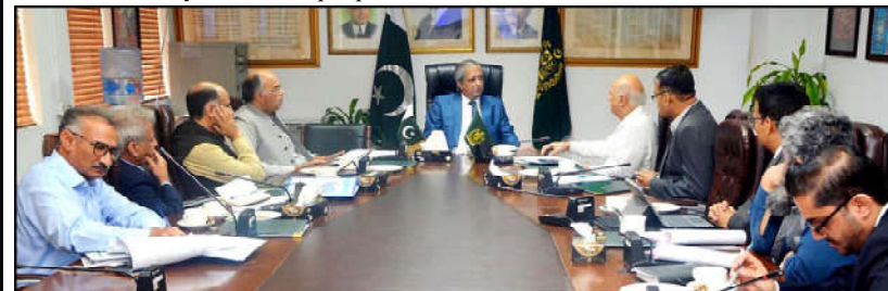
ISLAMABAD: Federal Minister for Law and Justice, Senator Azam Nazeer Tarar chaired first meeting of the Committee to give recommendations for independent Drug Pricing Body.

A vigorous campaign of Islamabad Traffic police had been launched as per the directions of Inspector General of Police (IGP) Islamabad Syed Ali Nasir Rizvi, in order to create awareness among citizens about the traffic rules.