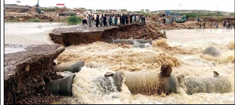
HUB: View of destruction at Hub River Causeway road once again due to floods causing of poor sewerage system creating problems for commuters and residents, after heavy rainwater flowed in area due to heavy downpour of monsoon season, showing negligence of concerned authorities, in Hub.

the District Education Group. Answers have also been sought from the employees including deduction of salaries, he said. He said that in case of non-satisfactory response, the concerned absentee employees would be subject to other departmental action including dismissal. He said that the functioning of all educational institutions across the district was the first priority for interest of students' future saying that in this context, with the support of the Deputy Commissioner and the district administration, the education department was taking vigorous steps to activate all the inactive schools and continue the education. On the other hand, departmental actions have also been intensified against the absent teaching staff, he noted.