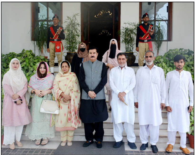
PESHAWAR: Governor Khyber Pakhtunkhwa Faisal Karim Kundi in a group photo with the faculty and students of the Department of Arts & Design, University at Governor House.