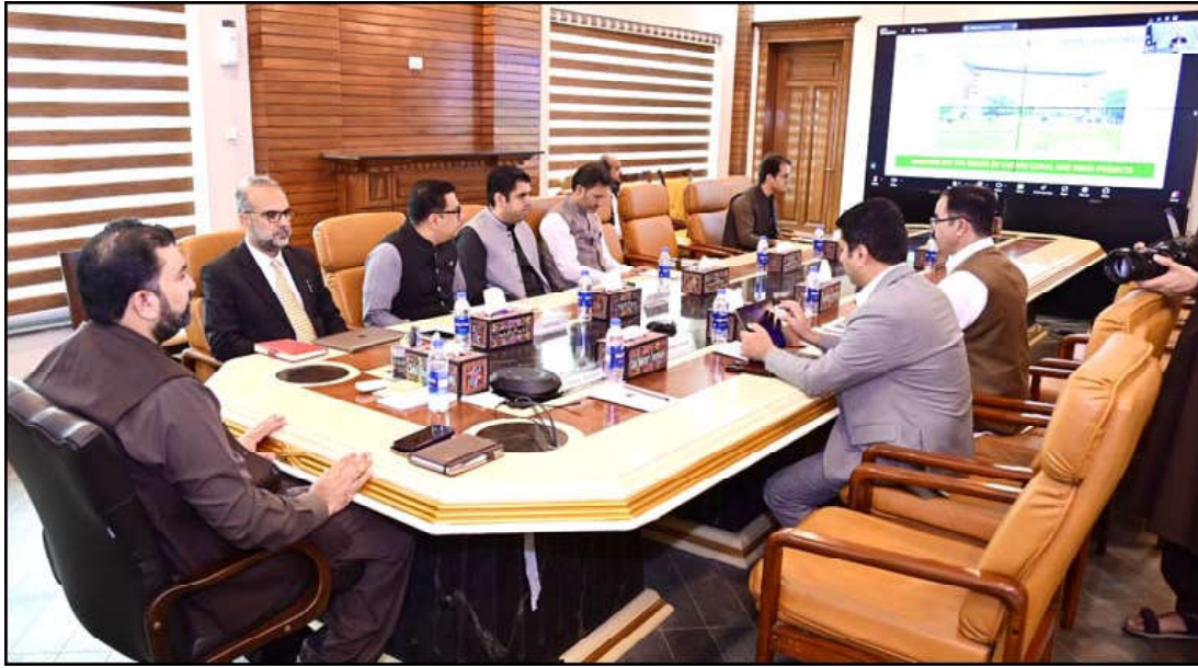
QUETTA: Chief Minister Balochistan Mir Sarfaraz Ahmed Bugti participating in a meeting through video chaired by Federal Minister Musaddiq Malik to review progress on Kachhi canal

Ph: 2841470/2841473 REG: No. BC-116 B/ID-445 Vol XXV No. 339, Muharram 25, 1446 AH Thursday August 01, 2024 Pages 08, Price Rs.15