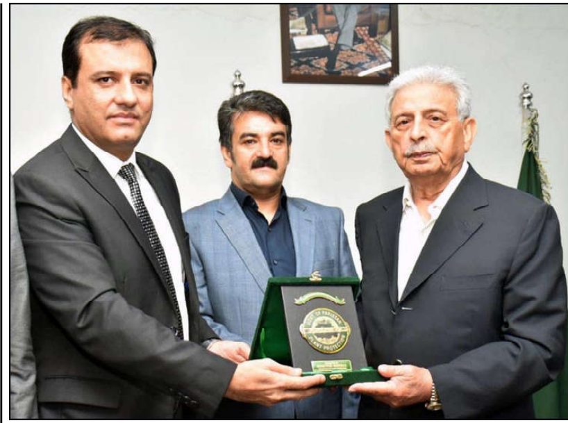
KARACHI: Federal Minister for National Food Security and Research Mr. Rana Tanveer Hussain Presented a Memento by the Director General of Department of Plant Protection.