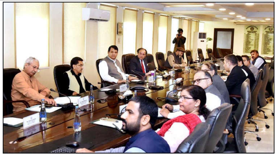
ISLAMABAD: Federal Minister for Finance & Revenue Senator Muhammad Aurangzeb chairing a meeting of the Committee on the issues of Gilgit-Baltistan.

significance of contributory efforts for building a resilient economic framework and paving the way for future progress and prosperity, he said "Such contributions are crucial in supporting our economy, fostering sustainable growth, and enhancing the quality of life for our citizens." The minister stressed the need of adopting a proactive approach to address environmental challenges by embracing eco-friendly technologies and lauded the IMC's initiative of introducing Hybrid Electric.