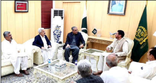
ISLAMABAD: Federal Minister for Interior Mohsin Naqvi in a meeting with a delegation from Kurram led by MNA Hamid Hussain.

ISLAMABAD (INP) – The federal government on Wednesday announced a significant decrease in petroleum prices for the first fortnight of August 2024. The prices were reduced after getting an approval from Prime Minister Shehbaz Sharif, said a notification issued by the Ministry of Finance. The new prices will come into effect from August 1, 2024. The petrol price was decreased by Rs6.17 per litre as new price has been fixed at Rs269.43. The price of high speed diesel was reduced by Rs10.86 to Rs272.77. Similarly, the price of light speed diesel was reduced by Rs5.72 to Rs160.53 per litre. Similarly, the price of kerosene oil dipped by Rs6.32 to Rs177.39 per litre for first half of August.