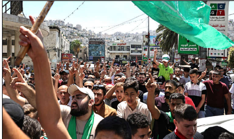
Palestinians attend a protest in Nablus in the Israeli-occupied West Bank following the assassination of the chief of the Palestinian Hamas group.

Generally they were held in secret, without being given a reason for their detention or access to a lawyer, the report said.