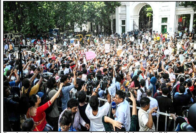
People take part in a protest march outside the high court building demanding justice for the victims arrested and killed in the recent nationwide violence in Dhaka, Bangladesh.

"It is obvious that the organisers of this political assassination were aware of the dangerous consequences this action is fraught with for the entire region."