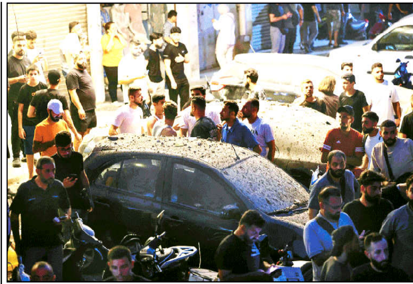
Bystanders surround vehicles covered in debris near the site of an Israeli strike on Beirut's southern suburbs.

Thousands of people have been ordered to evacuate their homes, most of them previously displaced several times already.