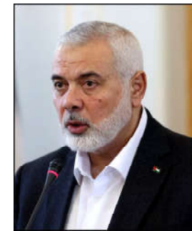
Revolutionary Guards said. There was no immediate comment from Israeli authorities. The news, which came less than 24 hours after Israel claimed to have killed the Hezbollah commander

Haniyeh, hours after he attended a swearing in ceremony for the country's new president, and said it was investigating. "Early this morning, the residence of Ismail Haniyeh in Tehran was struck, resulting in his and one of his body guards' martyrdom. The cause is under investigation and will be announced soon," the