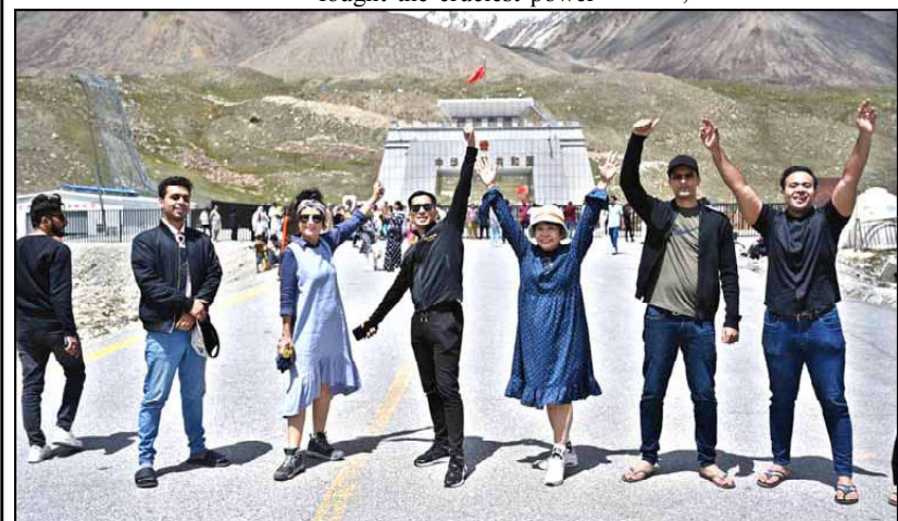
KHUNJURA: International tourist enjoying their trip and posing for Picture at Pak-China Boarder Khunjra Pass.