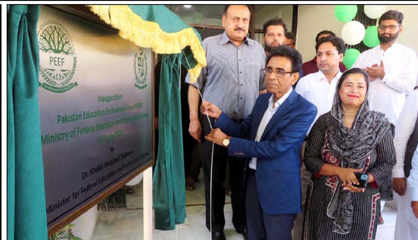
ISLAMABAD: Federal Minister for Education and Professional Training, Dr. Khalid Maqbool Siddiqui inaugurated a new building for the Pakistan Education Endowment Fund (PEEF).

Under the Prime Minister's Youth Loan and Agricultural Scheme, started in 2013, as many as 186 billion had been distributed among more than two lakh eighty thousand young entrepreneurs, creating countless employment opportunities across the nation.