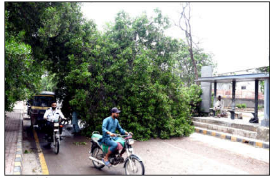
KARACHI: Weakened steam tree fall down on ground during at Abdullah Shah Ghazi Mazar road during heavy storm, in the city.

RAWALPINDI (Online): Security forces have killed five terrorists and three others injured during three intelligence based operations in Kech, Panjgur and Zhob districts of Balochistan. According to ISPR, sanitization operations will continue until all perpetrators, facilitators and abettors of cowardly acts of 26 th August are brought to justice. Security forces of Pakistan, in step with the nation, remain determined to thwart attempts at sabotaging peace, stability and progress of Balochistan. Prime Minister Shehbaz Sharif has appreciated the soldiers and officers of the Pakistan Army for sending five Khwarji to hell and arresting three after injuring them in Panjgur, Kech and Zhob districts of Balochistan. In a statement today, the Prime Minister reiterated the resolve to continue the war against terrorism until its complete eradication from the country. The Prime Minister said those who are trying to spread chaos in the country will not be spared. Federal Interior Minister Mohsin Naqvi paid tribute to the security forces for the successful intelligence-based operation in Panjgur and Zhob on Friday.