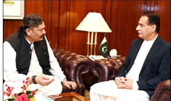
ISLAMABAD: Speaker National Assembly Sardar Ayaz Sadiq in a meeting with chairman special committee on Kashmir Rana Muhammad Qasim Noon, at Parliament House, in the Federal Capital.

ISLAMABAD (APP): The prime minister on Friday approved starting negotiations on the Financial Commitment Agreement between China and Pakistan Railways for the up gradation of the ML-1 project, a crucial component of the China-Pakistan Economic Corridor (CPEC). The cabinet meeting, chaired by Prime Minister Shehbaz Sharif, instructed that the final agreement (on ML-1) be brought back to the cabinet for approval. The prime minister briefed the cabinet on his recent visit to Quetta, highlighting ongoing efforts to strengthen the capacity of law enforcement agencies, such as the police and levies, in Balochistan. The prime minister stated that the entire nation was committed to eliminate terrorism and setting an example by dealing firmly with terrorists. He also praised the Balochistan provincial government for its commendable efforts to integrate Baloch youth into the national mainstream, aiming for their development and prosperity. The prime minister stated that the federal government will fully support the Balochistan government in offering world-class education and equal development opportunities to Baloch youth. The Cabinet also approved the decisions made by the Economic Coordination Committee on August 29, 2024.