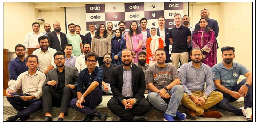
Team ONIC comes together for a group photo to mark the First anniversary of digital Telco.

11.1 percent on Year-on-Year basis in July 2024 as compared to 12.6 percent in previous month, and 28.3 percent in July 2023. On a month-on-month (M-o-M) basis, it increased by 2.1 percent in July 2024 compared to an increase of 0.5 percent in the previous month. The government managed to reduce the fiscal deficit to 6.8% of GDP in FY2024, down from 7.8% last year. The primary balance showed a surplus of 0.9% of GDP, in contrast to a deficit of 1.0% of GDP in FY2023.