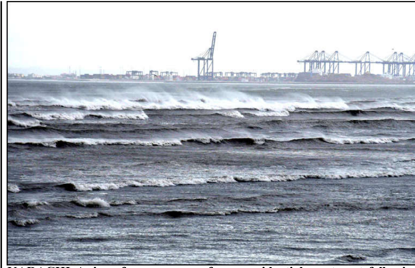
KARACHI: A view of sea waves seen from a residential apartment, following reports from the Pakistan Meteorological Department of a potential cyclonic storm that could develop over the Arabian Sea, at Clifton Beach, in the city.

Sarfaraz earlier said if the storm materialised it would be the first cyclone in the Arabian Sea in August since 1976 and would get the name 'Asna' suggested by Pakistan. He added that regional cyclones were assigned names according to a list prepared by a 13-country panel, including Pakistan.