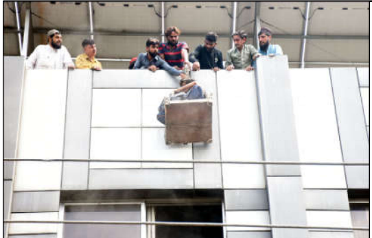
LAHORE: Employees of a local hotel rescue customer during fire in hotel at Australia Chowk in the Provincial Capital.