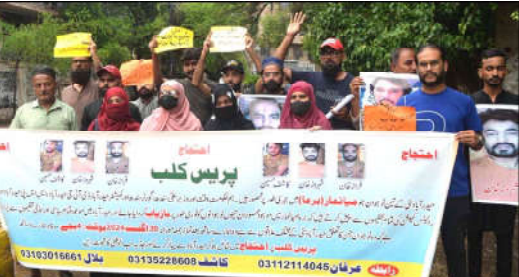
HYDERABAD: Relatives hold a protest for recovery of their 3 children, who can forcibly besieged in Myanmar, at HPC.

ISLAMABAD (APP): Prime Minister Shehbaz Sharif on Friday held a telephone conversation with Chief Adviser of Bangladesh government Professor Muhammad Yunus wherein two leaders agreed that there was a need to work closely for the progress and prosperity of the people of both countries. During the conversation, both leaders also agreed that greater regional cooperation could play a vital role in uplifting the lives of the people of South Asia, a PM Office press release said. Prime Minister Shehbaz Sharif congratulated Professor Muhammad Yunus on assuming the office of Chief Adviser and lauded his contribution to the socio-economic development of Bangladesh. He expressed sympathies over the devastation caused by the recent floods in Bangladesh. The prime minister underscored the importance of revitalizing bilateral relations through enhanced cooperation in different domains. Noting the historical, religious and cultural bonds between Pakistan and Bangladesh, he expressed a keen desire to boost commercial relations, cultural exchanges and people-to-people contacts.