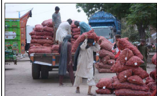
FAISALABAD: Daily wages laborers unload sacks of potatoes from a delivery truck at a bustling vegetable market.

A cornerstone of this partnership is the establishment of a dedicated PSQCA Information Desk at LCCI. This desk will serve as a one-stop resource center where businesses, entrepreneurs and traders can seek guidance on standards, regulations and best practices. The Information Desk will be staffed by nominated officials from PSQCA to provide expert advice and assistance. Kashif Anwar highlighted the importance of this initiative stating that this MoU is more than just a formal agreement; it is a strategic alliance aimed at empowering our members with the knowledge and resources they need to meet global standards.