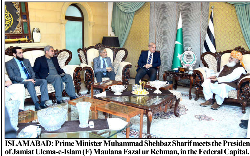
ISLAMABAD: Prime Minister Muhammad Shehbaz Sharif meets the President of Jamiat Ulema-e-Islam (F) Maulana Fazal ur Rehman, in the Federal Capital.