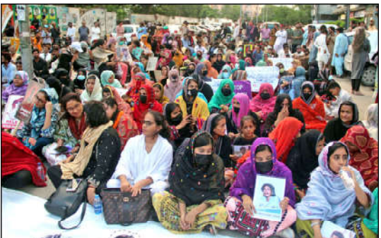
KARACHI: Relatives of Missing persons hold placards during protest in favor of their demands outside press club, in the Provincial Capital.

Sharing the data, he said that the highest rainfall in Sindh had been recorded in Badin district. Shaheed Fazil Rahu of Badin recorded the highest rainfall of 190 mm, 168 mm in Badin, 164 mm in Matli, 190 mm in Shaheed Fazil Raho, 118 mm in Talhar. 101 mm in Hyderabad city and 96 mm in rural areas of Hyderabad.