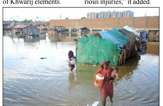
HYDERABAD: A woman displaced by flood, carry her children as they wade through floodwaters after heavy monsoon rains at near M-9 motorway Qasimabad.

RAWALPINDI: At least 12 Khwarji terrorists were killed in ongoing intelligence-based operations (IBOs) by security forces in Khyber district's Tirah Valley on August 28 and 29, according to a statement from the military on Friday. The Inter-Services Public Relations (ISPR) stated that extensive IBOs have been underway in the region since 20 August, targeting the reported presence of Khwarji elements. "On 28 & 29 August, our troops effectively engaged Khwarji locations, where, after intense fire exchanges, twelve Khwarji of Fitna - A-I-Khwarji [Tehreek-e-Taliban Pakistan (TTP)] were sent to hell," the statement said. The ISPR noted that these operations have dealt a major setback to Fitna-Al-Khwarji and its affiliates. "So far, 37 terrorists have been sent to hell, while 14 terrorists have suffered serious injuries," it added.