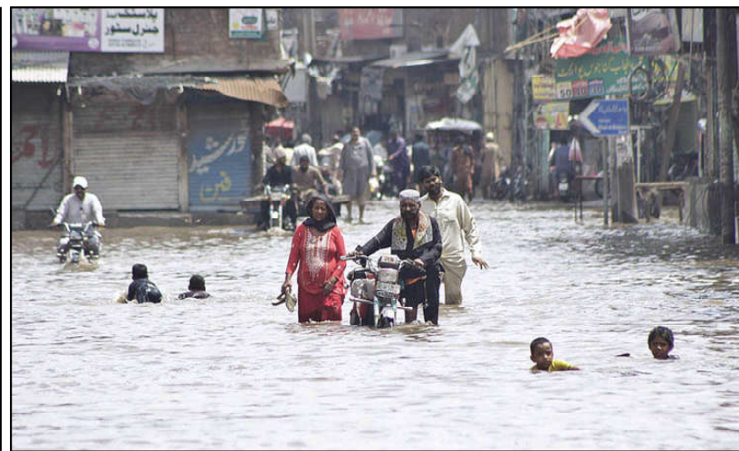
MULTAN: People navigate flooded Khuni Burj Road after heavy monsoon rain in the city.

Out of these, 407 people with serious injuries were shifted to different hospitals, while 580 victims with minor injuries were treated at the incident site by Rescue Medical Teams thus reducing the burden of hospitals.