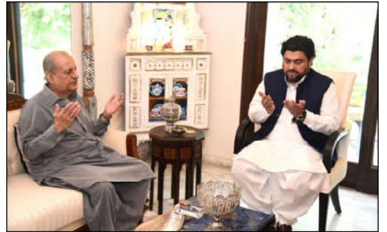
KARACHI: Governor Sindh Kamran Khan Tessori offering Fateha after condoling with Senator Raza Rabbani on sad demise of his sister.

Senator Tatar explained that the Thalian Interchange, located between Chakri and Islamabad Toll Plaza, provides reasonable access to the airport and nearby villages, including Thalian. He dismissed allegations of provincial discrimination, emphasizing that the federal government aims to facilitate all travelers without political motives.