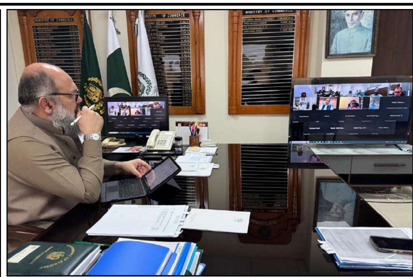
Federal Minister for Commerce Jam Kamal Khan holding a virtual meeting with the Sectoral Council for Engineering, highlighting the need for strategic reforms and government support to elevate Pakistan's engineering industry to compete globally Islamabad.

ISLAMABAD (APP): The Federal Minister for Commerce Jam Kamal Khan holding a virtual meeting with the Sectoral Council for Engineering, highlighting the need for strategic reforms and government support to elevate Pakistan's engineering industry to compete globally Islamabad.