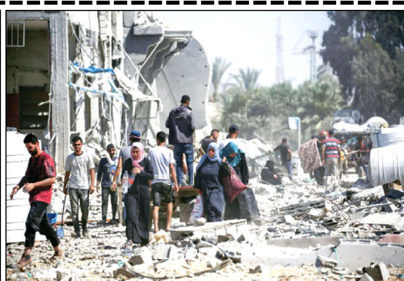
Palestinians carry their belongings salvaged from the debris following Israeli strikes in eastern Deir Al Balah, central Gaza Strip.

He said the campaign would start in central Gaza with a three-day pause in fighting, then move to southern Gaza, where there would be another three-day pause, followed by northern Gaza.