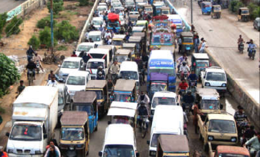
KARACHI: A view of traffic jam in evening hours at Liaqatabad area, in the Provincial Capital.

KARACHI (INP): Due to bad weather, the departure of several international and domestic flights was badly affected and many flights from Karachi Airport have been cancelled on Friday. According to schedule, flight IF-334 from Karachi to Najaf and to Baghdad has been cancelled. SereneAir flight ER-504 from Karachi to Islamabad has been cancelled while AirBlue flight PA-402 from Karachi to Quetta has also been cancelled. Moreover, SereneAir flight ER-524,522 from Karachi to Lahore has been cancelled and AirBlue flight PE-807 was also cancelled. AirSial flight PF-145, 143 from Karachi to Lahore has been cancelled and PIA flight PK-310 from Karachi to Quetta was also cancelled.