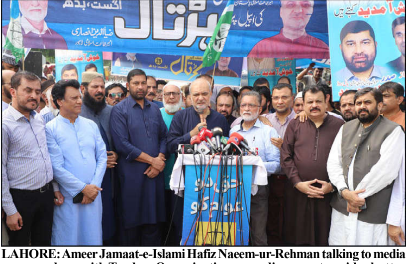
persons along with Traders Organization regarding countrywide shutter down strike during his visit to protest camp.

MULTAN (APP): Two persons of the same family were killed and three others sustained injuries in a traffic accident that occurred near Kheera Chowk area of Multan, tv channels quoting Rescue sources reported on Tuesday. According to details, a rashly driven bus hit the two wheeler near Kheera chowk area.