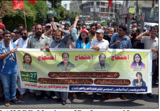
LAHORE: Members of Professors and Lecturers Association are holding protest demonstration for acceptance of their demands, at Lahore press club.

He emphasized the need for community cooperation in timely payments of electricity and water bills and called for actions