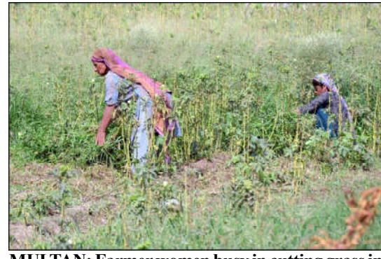
MULTAN: Farmer women busy in cutting grass in the field for their animals.