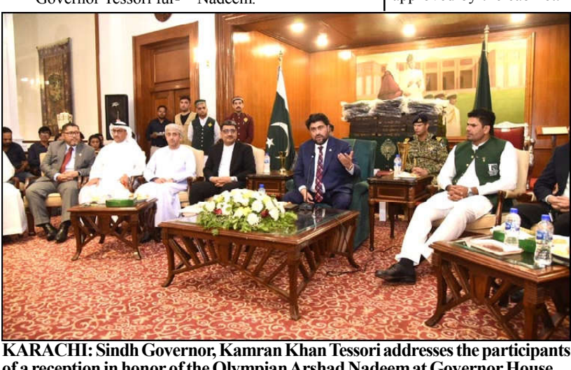
of a reception in honor of the Olympian Arshad Nadeem at Governor House.

Decisions made in recent ECC meeting were also approved by the cabinet.