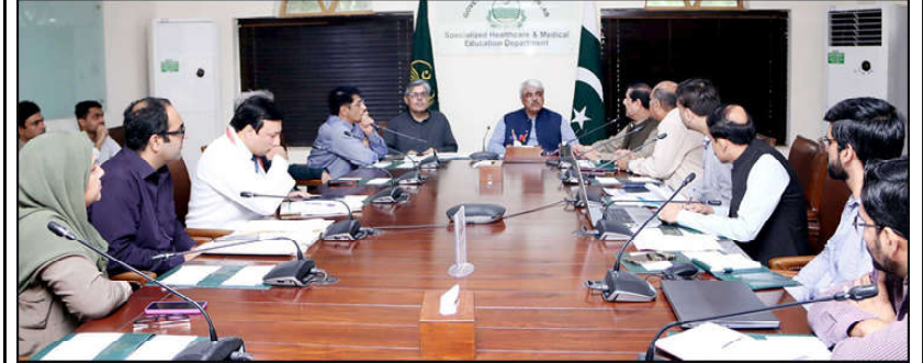
LAHORE: Punjab Minister for Health and Secretary Health Azmat Mehmood chaired meeting to review revamping in Government Hospital at Specialized Healthcare and Medical Education Department.

for Sept 2 KARACHI (APP): The sitting of the Provincial Assembly (PA) of Sindh poor state of cleanliness has been re-scheduled for September 2, Monday. The Speaker Sindh Assembly Syed Awais Qadir Shah in exercise of powers conferred upon him has adjourned the setting, which was scheduled to be held on August 27 and now it would be held on September 2.