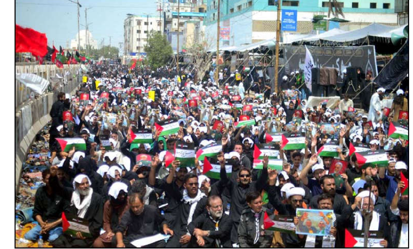
KARACHI: Shiite Muslims chanting slogans against USA, Israel after Zohrain prayer during mourning processions in connection of 40th day Chehlum-e-Hazrat Imam Hussain (RĂ), grandson of Prophet Mohammad (PBUH), at M.A Jinnah road in Karachi.