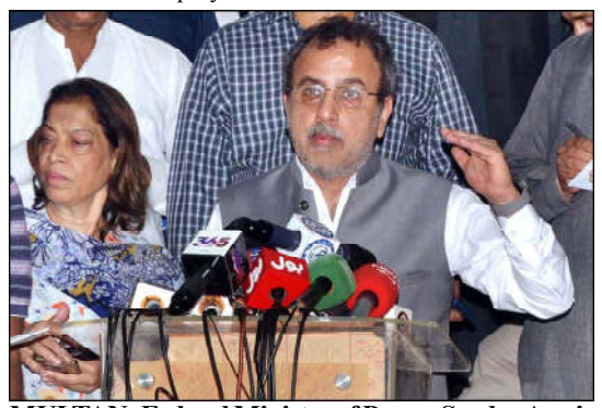
MULTAN: Federal Minister of Power Sardar Awais Ahmad Khan Leghari talking to media persons at MEPCO Headquarters.

Assistant Commissioners and Mukhtiarkars in the talukas to issue duty rosters for their respective areas. The Deputy Commissioner directed assistant commissioners to visit pumping stations during the rains and ensure the availability of fuel and operational readiness at celled and no employee will all stations.