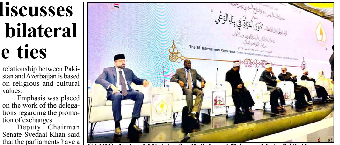
CAIRO: Federal Minister for Religious Affairs and Interfaith Harmony Chaudhry Salik Hussain attending an International Conference on role of

He said that Pakistan, especially Baluchistan province is rich in mineral wealth and will prove to be important in changing the destiny of this region. Pakistan will prove to be the economic and trade hub of He said that the whole the region and Investors and businessmen from all over the world should take ad-