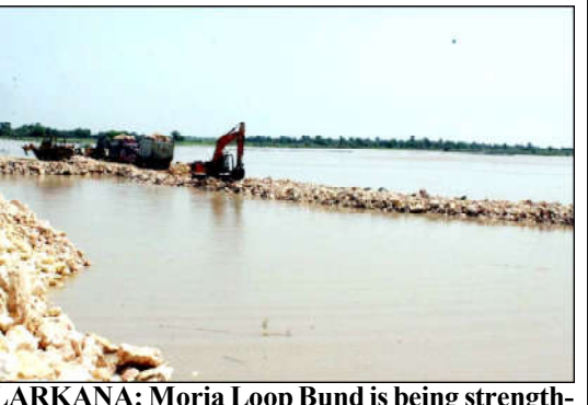
LARKANA: Moria Loop Bund is being strengthening by the bank of River Indus, in perception of arrival of flood water in the Indus Rive, pressure of water increased day by day on the embankment, near Larkana.

ties, it said and advised the public to stay informed and download 'Pak NDMA Disaster Alert' mobile app for timely alerts and closely monitor weather reports.