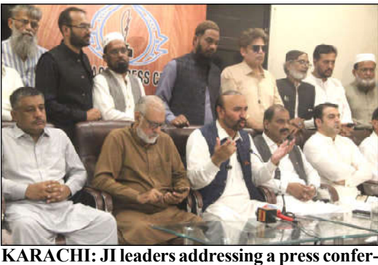
ence at Press Club in the Port City.

They criticized the police for registering cases against those seeking justice for the slain journalist instead of taking action against the actual perpetrators.