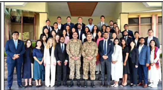
RAWALPINDI: Chief of Army Staff (COAS), General Asim Munir in a group photo along with a delegation of 44 students from Harvard Business School (HBS), at General Headquarters (GHO) in Rawalpindi.

RAHIM YAR KHAN (INP): At least 11 policemen were martyred and seven others injured in an attack on police mobile vehicles by dacoits of Kacha near Machka police camp II in Rahim Yar Khan. A group of dacoits launched the attack when one of the vehicles in the convoy broke down. Some of the policemen were also missing after the incident.