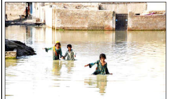
LARKANA: Children crossing flooded streets where rainwater has accumulated in front of houses at Qutb Colony.