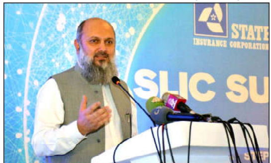
KARACHI: Federal Minister for Commerce Jam Kamal Khan addresses the State Life Insurance Corporation Summit 2024, at a local hotel.

KARACHI (APP): Federal Minister for Commerce, Jam Kamal Khan, emphasized the significant impact of State Life Insurance policies on families across the country during his address at the State Life Insurance Corporation (SLIC) Summit 2024. The event, held at a local hotel, celebrated SLIC's achievements and highlighted the contributions of its leadership and team. Jam Kamal acknowledged the longstanding support that State Life Insurance has provided, helping numerous families sustain themselves over the years. "State Life Insurance policies have been a lifeline for many, enabling families to survive and thrive," he stated. The minister commended the SLIC team, especially the executives, chairman, and board members, for their dedication to the corporation's success. He also addressed criticisms regarding the healthcare program managed by State Life, noting concerns over financial management and resource allocation. "There has been criticism about the costs and management, but overall, the services provided to the private sector and citizens are substantial. The program's scale and reach are something we often underestimate," he remarked. Reflecting on his tenure as Chief Minister of Balochistan, Jam Kamal actively pursued the federal-level healthcare initiative, integrating it into the provincial budget despite reservations regarding costs and auditing challenges.