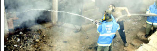
KARACHI: Women firefighters struggle to control a fire which broke out at a garment factory in Orangi Town, in the Provincial Capital.