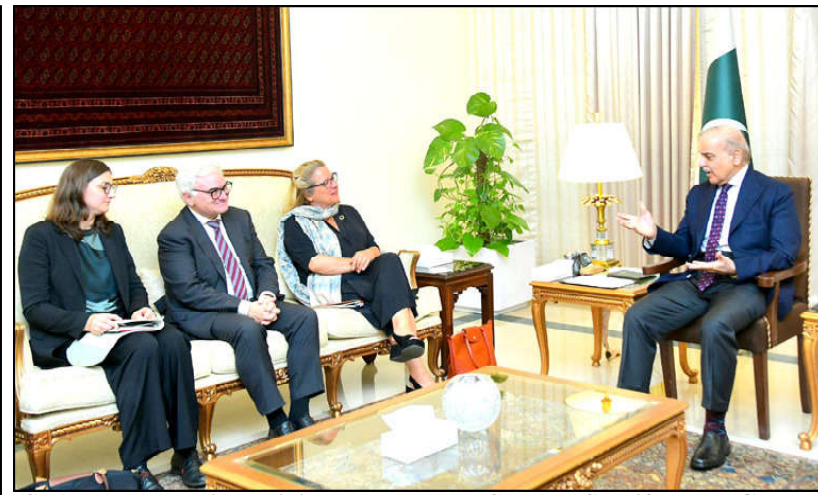
ISLAMABAD: Prime Minister Muhammad Shehbaz Sharif met the German Federal Minister for Economic Cooperation and Development, Ms. Svenja Schulze, at the Prime Minister's House, in the Federal Capital.

Among others, the meeting was attended by Minister for Industries & Production, Rana Tanveer Hussain; Minister for Commerce, Jam Kamal Khan; Minister for Privatization, Abdul Aleem Khan; Minister for Planning, Development and Special Initiatives, Ahsan Iqbal Chaudhry; Minister for Economic Affairs, Ahmad Khan Cheema; Minister for Petroleum, Mussadiq Masood Malik; Minister for Power, Sardar Awaiz Khan Leghari; Dy Chairman Planning Commission, Federal Secretaries, and other senior officials of the relevant ministries.