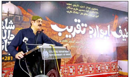
BHITSHAH: CM Sindh Syed Murad Ali Shah addressing on Latif Award ceremony at Latif Auditorium during Hazrat Shah Abdul Latif Bhitai on occasion of the 281st Urs celebration.

"There is no magic band. It is all about hard work, sacrifice, blood and sweat. Our nation is robust and strong. Our people are full of hope and energy. Let us put our work together. Let us not waste time on debates as we had done in the past. Let us now use this time for actual implementation on the ground. Insha Allah, you will see we will have dividends and will find our place in the comity of nations through hard work, hard work and hard work," he said.