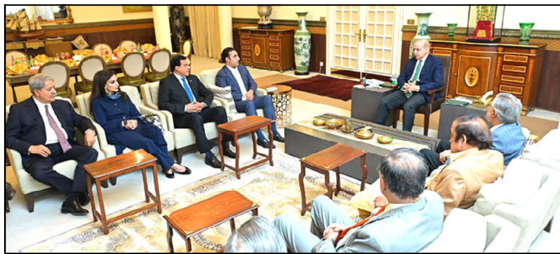
ISLAMABAD: Chairman Pakistan Peoples Party Bilawal Bhutto Zardari meeting with Prime Minister Muhammad Shabbaz Sharif.