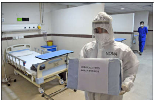
KARACHI: Paramedical staff prepare an isolation ward set up as a preventative measure at a hospital, following Pakistan's health ministry has confirmed a case of m.pox in the Khyber Pakhtunkhwa province, in the Provincial Capital.