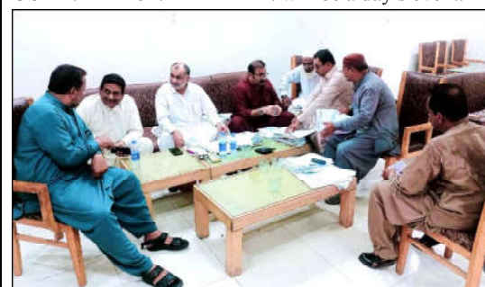
LARKANA: Federal Ombudsman Sukkur Regional Head, Syed Mahmood Ali Shah listening the problems of citizens during open court program held in Larkana.

TDAP also arranged 6500 sector-specific B2B meetings of foreign buyers with local exhibitors leading to an expected business generation of USD 1.2 Billion.