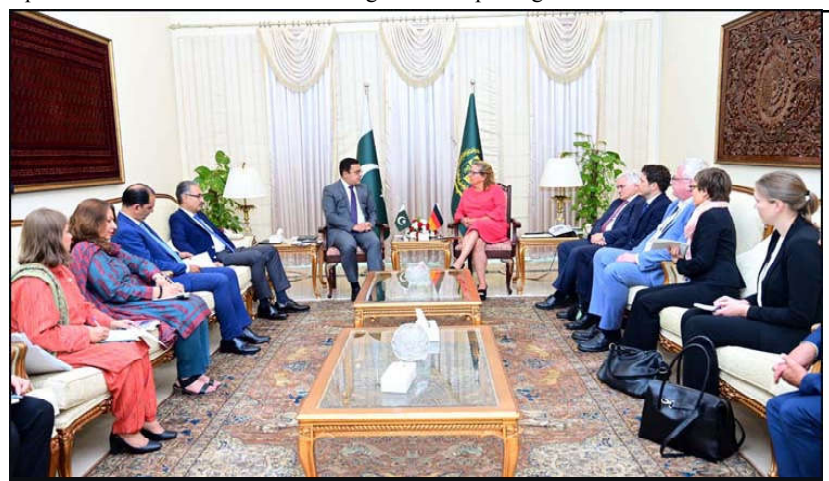
ISLAMABAD: Federal Minister for Economic Affairs, Ahad Khan Cheema exchanging views with Svenja Schulze, German Federal Minister for Economic Cooperation and Development during meeting held in Islamabad.