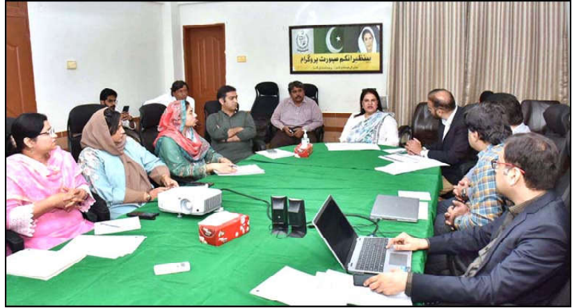
KARACHI: Senator Rubina Khalid, Chairperson of the Benazir Income Support Programme (BISP) chairing a meeting at the office of BISP Director General Sindh.