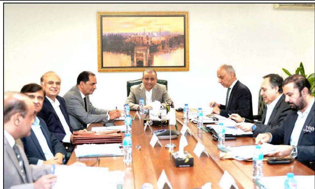
ISLAMABAD: Federal Minister for Privatization, Board of Investment & Communications Abdul Aleem Khan presided 222nd meeting of Privatization Commission Board.

The Minister highlighted revenue generation, export-led growth, increased agriculture modality, information technology, and human resource development as key priority areas for driving the economic agenda of the Government. He further emphasized that the reforms are being undertaken within the framework agreed with the IMF.