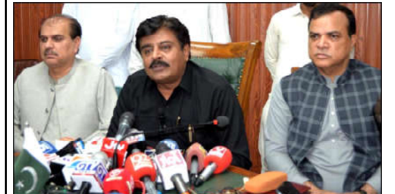
HYDERABAD: Sindh Education Minister Syed Sardar Shah a press conference.

Minister directed to complete projects of Schools and other buildings at earliest. Minister stressed the need for preparing effective strategy for rehabilitation of flood affected Schools and submits progress report on daily basis and share pictures of projects expedited through digitalized media. Minister directed to complete for preparing effective strategy for rehabilitation of flood.