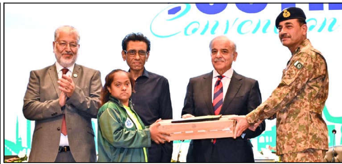
Prime Minister Muhammad Shehbaz Sharif and Chief of Army Staff General Syed Asim Munir distributing laptops among the high achievers during National Youth Convention held in Islamabad.

During the occasion, Syed Riaz Hussain Shah Shirazi emphasized that Sindh is a land of saints, and the poetry of Hazrat Shah Abdul Latif Bhattai provides profound guidance for living a meaningful life.