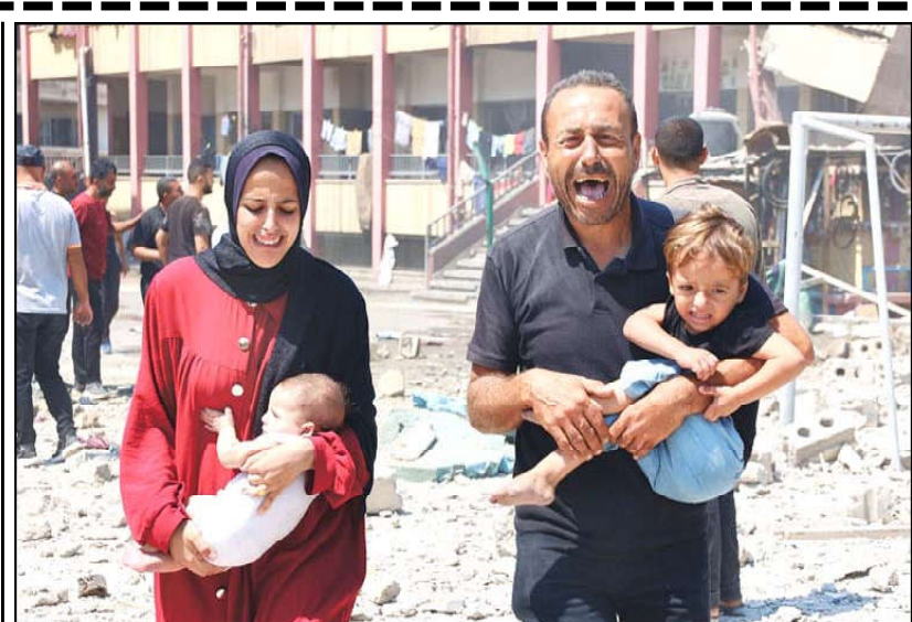
Palestinians carry their children as they flee after an Israeli strike on a school housing displaced people, in the Rimal neighbourhood of central Gaza City.

children, fleeing the site after the strike. In recent weeks, the Israeli military has struck several schools across Gaza, primarily in Gaza City, accusing them of housing Hamas command centres, which the Palestinian group denies. Earlier this month, the military had struck the Al-Tabieen School in Gaza City, which according to the civil defence agency killed 93 Palestinians, while the military said 31 fighters died. Tens of thousands of displaced people have taken refuge in schools since the war broke out on October 7 after Hamas attacked southern Israel. Israel's retaliatory military offensive has killed at least 40,173 people in Gaza, according to the territory's health ministry. Most of the dead in Gaza are women and children, according to the UN human rights office. The Israeli military said on Tuesday it retrieved