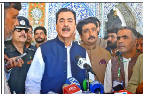
BHITSHAH: Chairman Senate Syed Yusuf Raza Gilani addressing to media persons after laying wreath on the grave of Hazrat Shah Abdul Latif Bhattai on the occasion of his 281st Urs celebration.