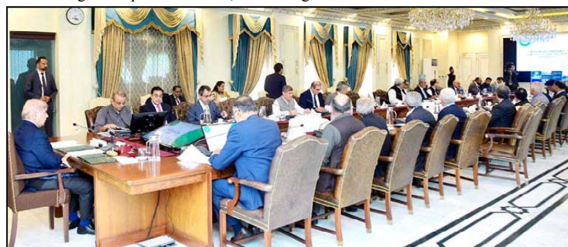
ISLAMABAD: Prime Minister Muhammad Shehbaz Sharif chairs a review meeting on Chinese investment in Pakistan.

When asked by a journalist you have always defended Gen (Retd) Faiz and now when he has been arrested why you fear he will become approver against you, he said I don't worry if he gives any evidence against me.