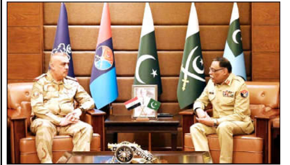
Lt Gen Ahmed Dawood Salman, Secretary Defence of Iraq meeting with General Sahir Shamshad Mirza, Chairman Joint Chiefs of Staff Committee, at Joint Staff Headquarters, Rawalpindi.

The visiting dignitary commended the professionalism of Pakistan Armed Forces and acknowledged the sacrifices rendered by people and Armed Forces of Pakistan in the war against terrorism.