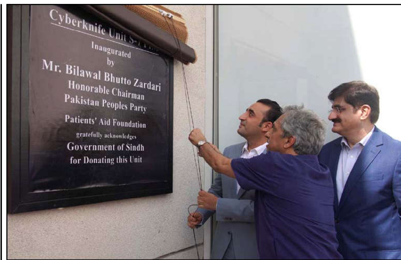
KARACHI: Peoples Party (PPP) Chairman, Bilawal Bhutto Zardari inaugurates new facilities during inauguration ceremony held at Jinnah Hospital in Karachi.

He said this showed that how effectively the province had managed its institutions in the post-18th Constitutional Amendment.