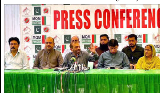
KARACHI: Muttahida Qaumi Movement (MQM-P) Leaders, Farooq Sattar along with others addressing to media persons during press conference held at Pakistan House in Karachi.

The press conference underscored the growing discontent among Karachi's citizens and the pressing need for policy interventions to alleviate their financial burdens amid rising utility costs.