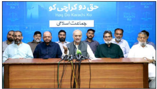
KARACHI: Jamat-e-Islami (JI) Chief, Hafiz Naeem-ur-Rehman along with others addresses to media persons during press conference, at Idara-e-Noor-ul-Haq in Karachi.