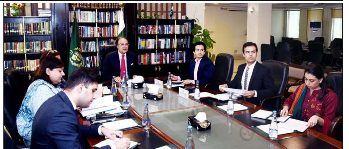
ISLAMABAD: Federal Minister for Finance and Revenue, Senator Muhammad Aurangzeb in a virtual meeting with Mr. Ahmed Abdelaal, President / GCEO of Mashreq Bank to discuss the economic outlook and explore investment opportunities in Pakistan.

significant potential of Pakistan's IT and Agriculture sectors, calling for increased investment from both local and international stakeholders to drive economic growth. He expressed appreciation for Mashreq Bank's interest in Pakistan's financial landscape and expressed keen interest of the government to re-engage with Mashreq Bank. The Minister provided an overview of the economic outlook of the country and mentioned the recent improvements in the macroeconomic indicators and stability of the currency and financial markets. He also mentioned the economic policies and initiatives of the government, emphasizing the ongoing efforts to stabilize the macroeconomic environment and enhance investor's confidence.