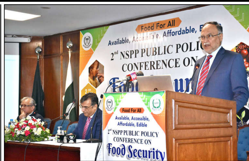
LAHORE: Federal Minister for Planning and Development Ahsan Iqbal addressing the conference on food security SPP (National School of Public Policy) during the opening ceremony.

"we have to adopt modern technology". He informed that under the special initiative by the Prime Minister Muhammad Shahbaz Sharif, Pakistan will be sending 1,000 agricultural scientists to China in the coming months, who will learn modern techniques aimed at increasing average yield in agriculture and livestock productivity. He assured the government's all-out support to implement the recommendations of this conference. The objective of the conference was Food for All: Available, Accessible, Affordable, Edible. The Planning Minister said that incumbent government will soon unveiling 2024-2029 five years plan aimed at steering the country out of the economical crises. The two days national conference was also addressed by Dr Ejaz Muneer Rector of the NSPP, researchers and agri experts. The scholars presented their research papers and suggested possible solution to the issues of food security.