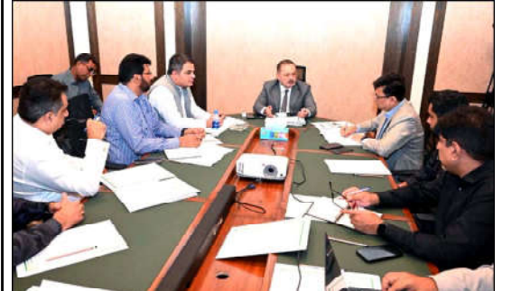
KARACHI: Sindh Minister for Excise and Taxation, Transport, and Mass Transit, Sharjeel Inam Memon presided over the meeting regarding ordering an operation against items used for smoking or inhaling drugs to Excise, Taxation, Narcotics Control Department, held in Karachi.

He emphasized that shopkeepers should cooperate with the Excise Narcotics Control Wing and refrain from selling items used for smoking or inhaling drugs. Sindh Senior Minister Sharjeel Inam Memon clarified that action will be taken if there are any reports of drug sales at private locations, including houses, hotels, or restaurants.