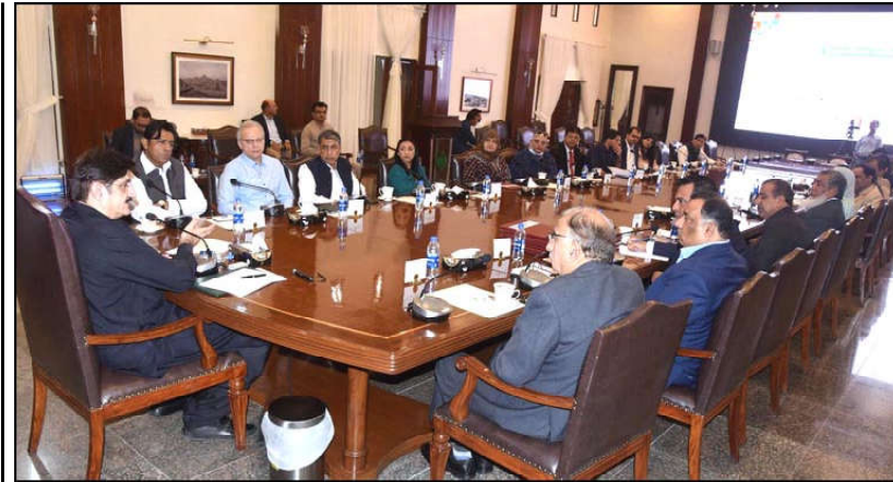
KARACHI: Sindh Chief Minister Syed Murad Ali Shah presides over a meeting of 10 public sector universities and Tech Valley to allocate 1000 scholarships in Google Career Certificates at CM House.

pared to the other students. An MoU signed between the Universities & Boards Department and Tech Valley will enable the distribution of 1,000 Google Career Certificates scholarships among 10 public sector universities in Sindh. Half of these scholarships are allocated to female students. The universities participating in the program include, NED University of Engineering and Technology, Dawood University of Engineering and Technology, Sindh Madressatul Islam University, Allah Bux Soomro University of Art, Jamshoro, Government College University Hyderabad, Sindh Agriculture University, Tando Jam, Quaid-e-Awam University of Engineering, Science & Technology, Nawabshah, Begum Nusrat Bhutto Women University, Sukkur, Aror University of Art, Architecture, Design & Heritage, Rohri, Shaheed Benazir Bhutto University, Larkana.