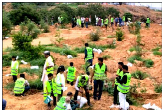
KARACHI: Volunteers are planting a sapling during Monsoon Tree Plantation Drive under the supervision of Muttahida Qaumi Movement (MQM-P) Burns Road Town, at Kidney Hill Park in Karachi.