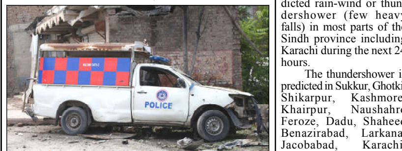
PESHAWAR: A view of damage police seen at blast site. At least five people, including two police personnel, have been injured in an explosion at the Warsak Road in the Pir Bala area.