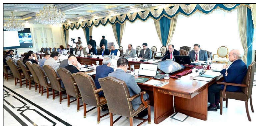
ISLAMABAD: Prime Minister Muhammad Shehbaz Sharif chairs a meeting on Rightsizing of Government Size.