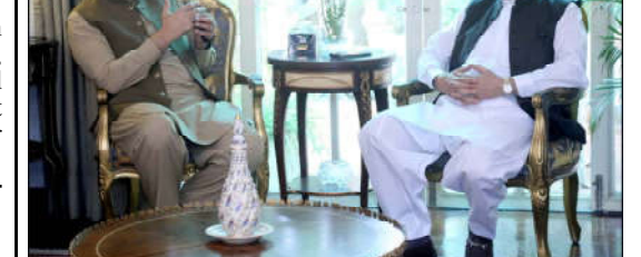
LAHORE: Punjab Governor, Sardar Saleem Haider Khan during his visit to residence of Speaker National Assembly Sardar Ayaz Sadiq discussed the parliamentary affairs and the current situation of the country.

Punjab said that the coalition government should run successfully to bring political stability in the country, adding that political stability is vital to the economic development of the country. He expressed his determination to strengthen the relation between the federation and Punjab and play every possible role for the improvement of the province. On this occasion, the Governor of Punjab appreciated the role of Speaker National Assembly for conducting the proceedings of the House impartially and smoothly.