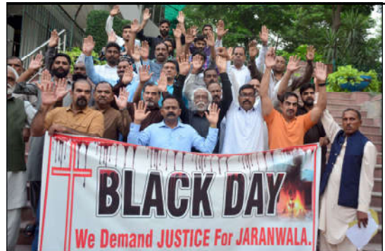
RAWALPINDI: Members of the Christian community held a protest demonstration outside the Press Club against the Jaranwala incident.

The discussions centered on IP-related challenges, including Pakistan's accession to international agreements, amendments to IP laws, and fee structures. The Chairperson emphasized the crucial role of the private sector in advancing the IP system.