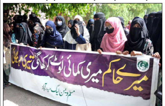
HYDERABAD: Activists of Markazi Muslim League (PMML) are holding protest demonstration against massive unemployment, increasing price of daily use products and high inflated bills of electricity, at Hyderabad press club.

ISLAMABAD (Online): Declaring the arrest of Gen (Retd) Faiz Hamed a miracle, deputy Prime Minister (PM) Ishaq Dar has said such thing have happened for the first time. I was also among the affectees of Gen (Retd) Faiz Hamed. Gen (Retd) Faiaz had apologized to me in the mid of October, he said this while talking to journalists in Parliament house Friday. The dirty politics