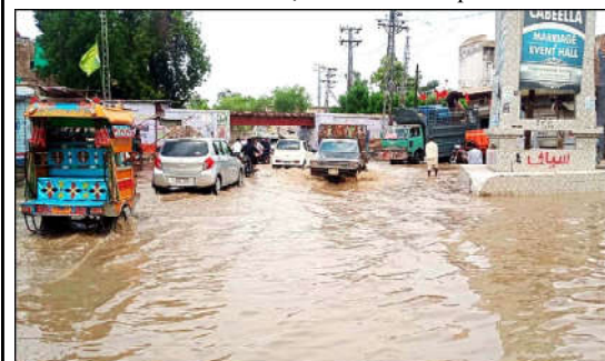
LARKANA: Commuters are facing difficulties in transportation due to stagnant rainwater due to poor sewerage system caused by heavy downpour of monsoon season, in Larkana.