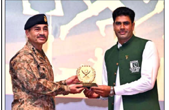
RAWALPINDI: Chief of Army Staff (COAS), General Asim Munir presenting a shield to Arshad Nadeem, Javelin Throw Olympian Gold Medalist during a ceremony in his honor held at Army Auditorium General Headquarters (GHQ) in Rawalpindi.

RAWALPINDI (APP): Chief of Army Staff (COAS), General Syed Asim Munir on Friday appreciated Arshad Nadeem's remarkable achievement of winning Pakistan's first-ever gold medal in a singles' event and setting a new Olympic record in javelin throw, attributing it to his commitment, perseverance, and passion for excellence. The Army Chief hosted a ceremony at Army Auditorium GHQ to honour Olympian Arshad Nadeem's historic achievement in Paris Olympics 2024 here, an Inter Services Public Relations (ISPR) news release said. The COAS highlighted Arshad's inspirational journey from humble beginnings to achieving greatness, emphasizing the importance of hard work and determination. The Army Chief recognized Arshad Nadeem's achievement as a national pride and highlighted that he has been honoured by the complete nation befitting his achievement. The COAS reaffirmed the commitment to support and empower not only sportsmen, but the entire wealth of Pakistani youth to achieve excellence towards a prosperous Pakistan. The COAS highlighted the need for Youth Engagement, Development and Entertainment as essential cardinal points of a healthy and prosperous society.