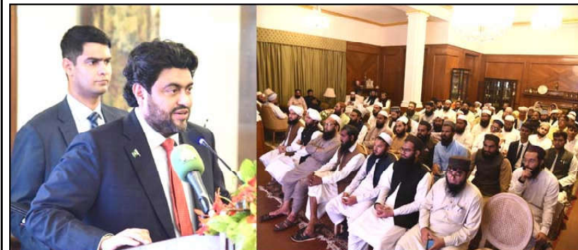
KARACHI: Governor Sindh Kamran Khan Tessori addressing International Inter-Faith Peace Conference.

RAWALPINDI (INP): Security forces have killed three terrorists during an intelligence-based operation in Khyber Pakhtunkhwa's (KP) area of Razmak, the Inter-Services Public Relations (ISPR) said on Friday. "On 16 August 2024, security forces conducted an intelligence-based operation in the general area of Razmak, District North Waziristan, on the reported presence of Khawarij," the army's media wing said in a statement. "During the conduct of the operation, intense fire exchange took place between the troops and khawarij, as a result of which, three Khawarij of Fitna al Khawarij were sent to hell, while one Kharij got injured."