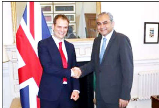
Interior Minister Mohsin Naqvi meeting with British Parliamentary Under-Secretary of State Hamish Falconer in London.

When Arshad Nadeem arrived at the CM House, the provincial cabinet session was in progress and the CM temporarily stopped to personally welcome the Gold Medalist. Sindh Chief Minister (CM) Murad Ali Shah on Thursday handed over Rs50m cheque, the traditional souvenir of Ajrak and Topi to javelin thrower Arshad Nadeem for winning gold medal at the Paris Olympics. Nadeem won the javelin throw event in Paris with an Olympic Games record of 92.97 metres, pushing India's Neeraj Chopra to second spot.