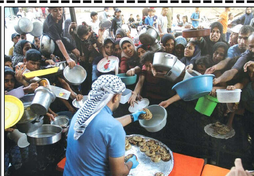
A charity kitchen worker hands out food to Palestinians, amid a hunger crisis in the northern Gaza Strip.