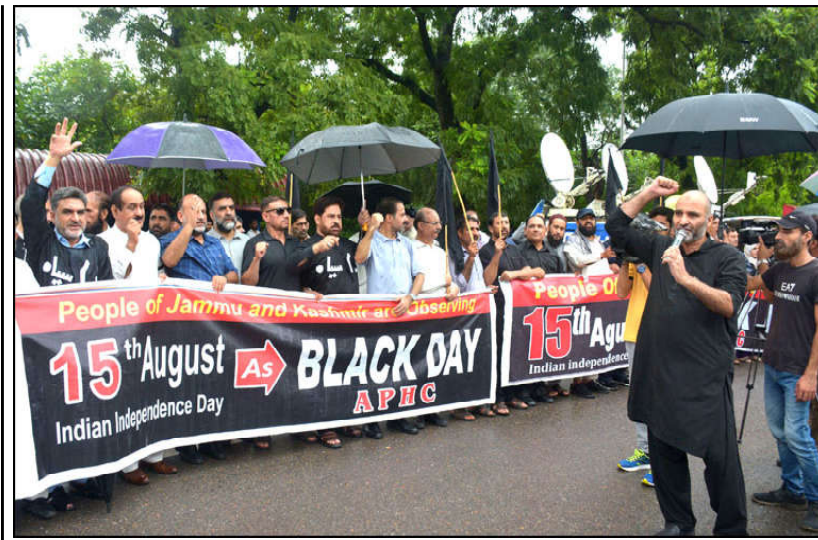
ISLAMABAD: People of Jammu and Kashmir observed Black day on the occasion of Indian Independence day in the Federal Capital.

These changes reflect the Foreign Office's commitment to preventing the misuse of diplomatic privileges and ensuring that visa processes are not exploited for political asylum purposes.