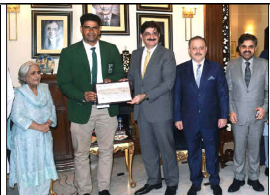
KARACHI: Sindh Chief Minister, Syed Murad Ali Shah presents a Fifty Million Rupees Cheque to Javelin Thrower Olympian, Arshad Nadeem during meeting held at CM House in Karachi.

Information Minister said government is striving to achieve economic and political stability in the country. He said government will provide relief to the people in electricity bills. Attaullah Tarar welcomed the process of self-accountability by institutions, stating that it should be adopted by every institution.