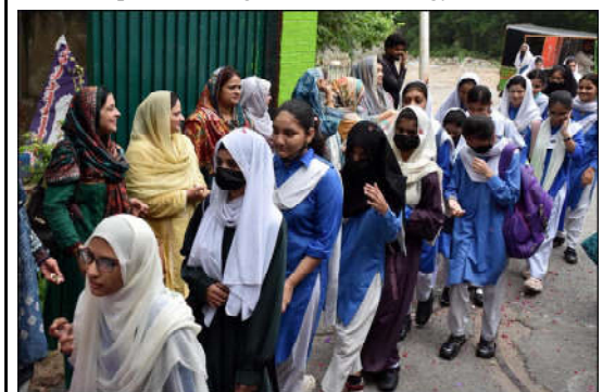
LAHORE: School teachers welcome the students on the opening day after Summer Vacation as Students arrive to attend their first day of school.

PESHAWAR (APP): Chief Minister Khyber Pakhtunkhwa, Sardar Ali Amin Khan Gandapur inaugurated the Model Design and Online Application System for the Chief Minister Khyber Pakhtunkhwa Solarization Scheme on Thursday. In addition to the initial plans, the Chief Minister announced an expansion of the scheme to 130,000 households, with 30,000 exclusively from the Merged Districts. This ambitious project will provide complete 2kV solar systems to underprivileged households across the province, significantly enhancing energy access for those most in need. The solarization scheme is part of the provincial government's broader efforts to address energy needs in communities where access to electricity remains a challenge, particularly in backward and remote areas. By prioritizing the most vulnerable populations, the scheme aims to reduce the energy burden on families, enhance living standards, and promote the use of clean energy solutions.