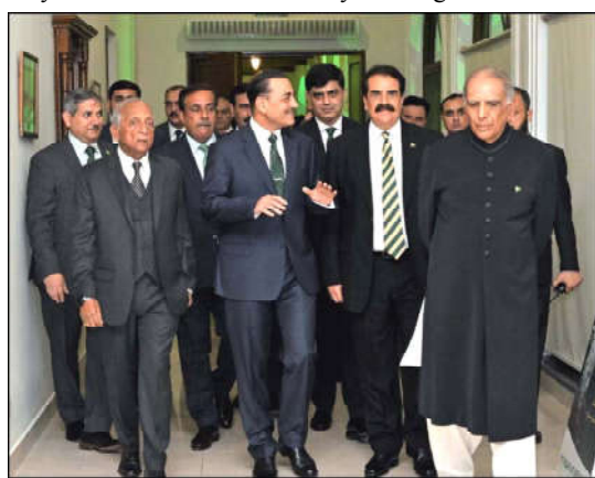
RAWALPINDI: Chief of Army Staff (COAS), General Syed Asim Munir interacts with retired officers of Pakistan Army during a graceful reception in honor of Pakistan Army veterans on the eve of 77th Independence Day of Pakistan held in Rawalpindi.

He reassured that the unwavering support of the nation, including the veterans would foil all such futile efforts.