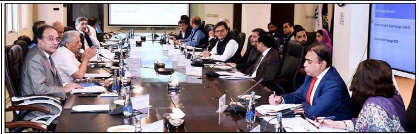
ISLAMABAD: federal Minister for Finance & Revenue Senator Muhammad Aurangzeb presiding over a meeting of Economic Coordination Committee (ECC).

ISLAMABAD (APP): The per tola price of 24 karat gold witnessed a decrease of Rs.300 on Thursday and was traded at Rs 257,400 against its sale at 257,700 on the last trading day in the local market. The price of 10 grams of 24 karat also decreased by Rs256 to Rs.220,680 from Rs.220,936, whereas that of 10 gram 22 karat decreased to Rs202,290 from Rs202,525. All Sindh Sarafa Jewellers Association reported. The price of per tola and ten gram silver remained unchanged at Rs.2,850 and Rs.2,443.41 respectively. Prices of gold in the international market decreased by $4 to $2,454.