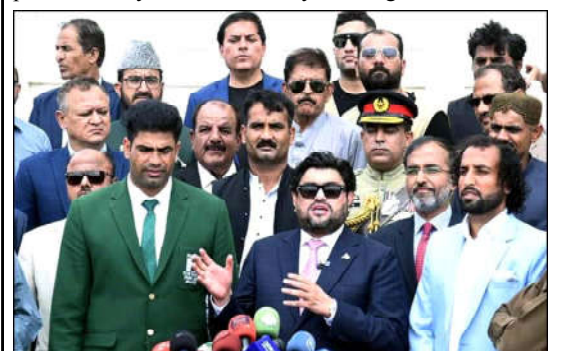
KARACHI: Governor Sindh, Kamran Khan Tessori along with Javelin Thrower Olympian, Arshad Nadeem addresses to media persons after paying homage to Quaid-e-Azam Muhammad Ali Jinnah during ceremony held at Jinnah Mausoleum in Karachi.

Accompanied by Governor Sindh Kamran Khan Tessori, Olympic gold medalist Arshad Nadeem toured the "Umeed Ki Ghanti" (Bell of Hope) initiative, at the Sindh Governor's House here Thursday. Arshad Nadeem expressed pleasant surprise after ringing the "Umeed Ki Ghanti," appreciating the symbolic gesture.