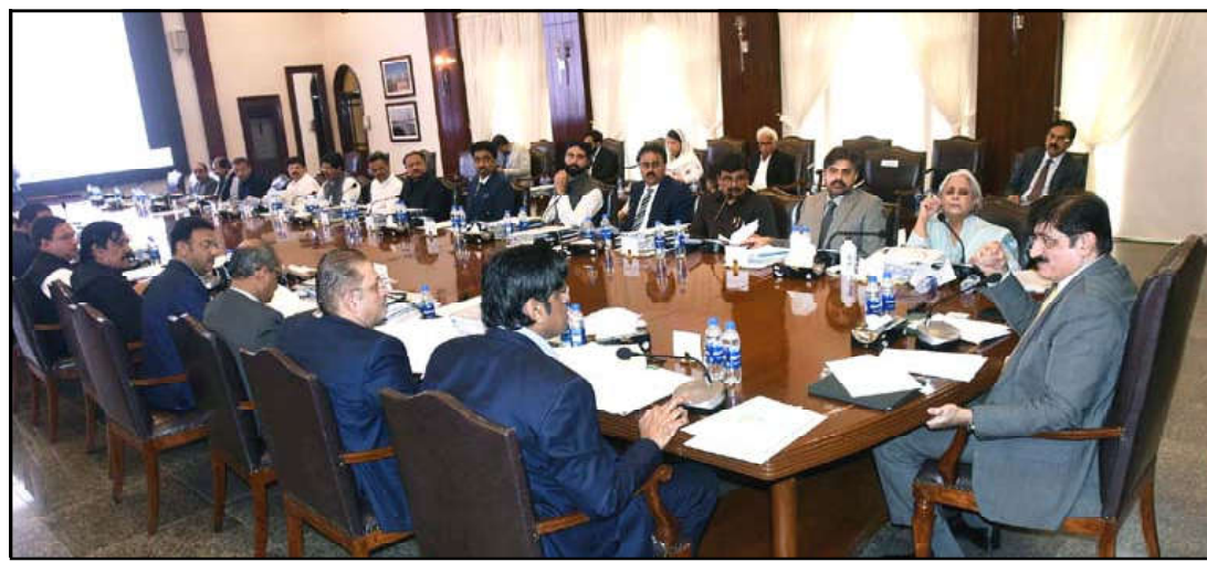
KARACHI: Sindh Chief Minister, Syed Murad Ali Shah presides over a Provincial Cabinet meeting, held at CM House in Karachi.

The appointments of teachers in the closed schools were made at the Taluka (Tehsil) level to ensure teacher availability.