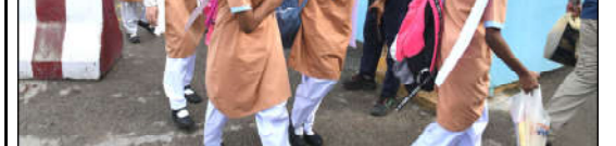
KARACHI: Parents and children arrive at school on the first day for the start of the 2024-2025 school year, after the summer vacation in Karachi.

He acknowledged Shah Latif as a spiritual leader and emphasized the importance of serving his followers.