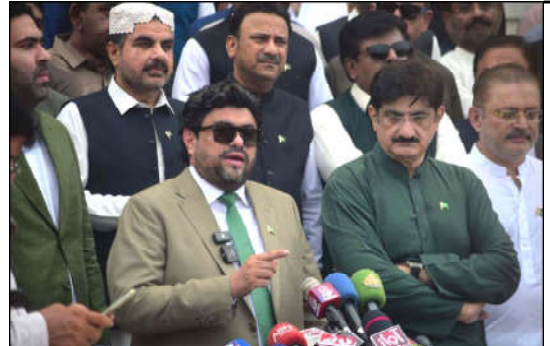
KARACHI: Governor Sindh, Kamran Khan Tessori, Sindh Chief Minister, Syed Murad Ali Shah are talking with media persons after paying homage to Quaid-e-Azam Muhammad Ali Jinnah on the occasion of 77th Independence Day Celebration, held at Jinnah Mausoleum in Karachi.