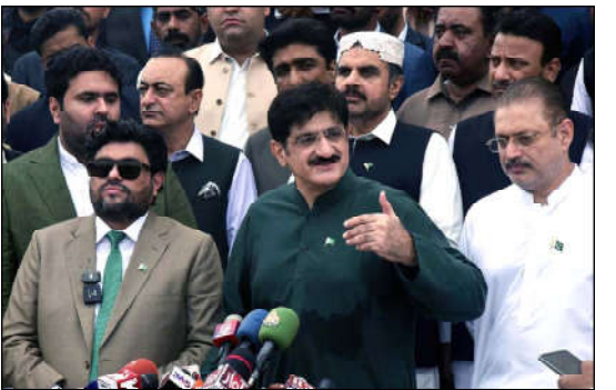
KARACHI: Governor Sindh, Kamran Khan Tessori, Sindh Chief Minister, Syed Murad Ali Shah are talking with media persons after paying homage to Quaid-e-Azam Muhammad Ali Jinnah on the occasion of 77th Independence Day Celebration, held at Jinnah Mausoleum in Karachi.