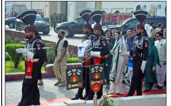
LAHORE: Chief Minister of Punjab Maryam Nawaz Sharif arriving for offering Fateha on the grave of Poet of Nation Dr. Allama Mohammad Iqbal at Mazar-e-Iqbal during Independence Day celebrations in the Provincial Capital.

LAHORE (APP): Punjab Chief Minister Maryam Nawaz Sharif hoisted the national flag at the Alangiri Gate of Lahore Fort on the occasion of Independence Day. National anthem was presented on the occasion. The Chief Minister participated in a special ceremony being held at the Hazuri Bagh. The CM paid a visit to the Mazar-e-Iqbal, laid a floral wreath and offered Fateha at the Mazar-e-Iqbal. She prayed for the integrity, progress, prosperity and stability of the country and paid homage to the Poet of the East Allama Muhammad Iqbal in glowing words. CM Maryam Nawaz Sharif was presented a salute by the smartly turned out contingent of scouts standing on the stairs of Badshahi Mosque and the school bands presented beautiful tunes. The female students clad in Sindhi, Balochi, Kalash, Kashmiri, Punjabi, Cholistan and other regional dresses accorded a warm reception to the CM Punjab by clapping. The excerpts from the speech of Quaid-e-Azam were also presented in the ceremony. The differently-abled children presented the national anthem in connection with the Independence Day.