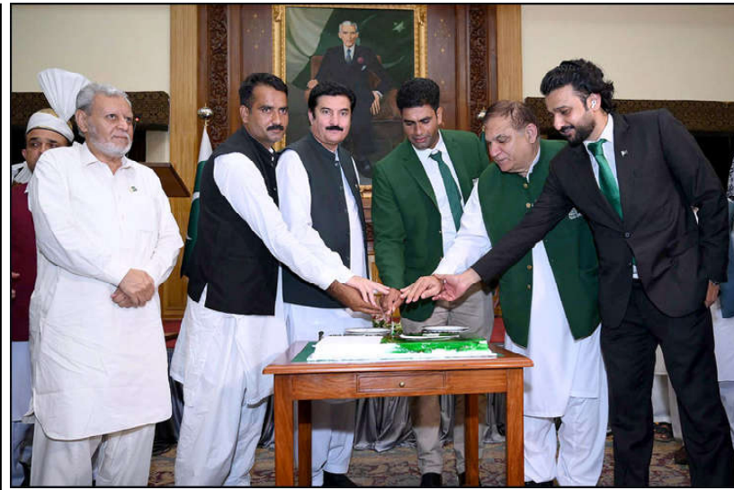
PESHAWAR: Governor Khyber Pakhtunkhwa Faisal Karim Kundi and Olympics Gold Medalist Arshad Nadeem along with other officials cutting the cake of Independence Day at Governor House.