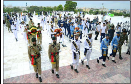
KARACHI: Armed forces commanders are paying homage to Quaid-e-Azam Muhammad Ali Jinnah during Guard of Honor ceremony on the occasion of 77th Independence Day Celebration, held at Jinnah Mausoleum in Karachi.