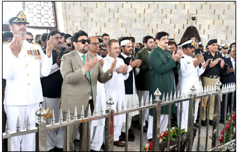
KARACHI: Governor of Sindh, Muhammad Kamran Khan Tessori, Chief Minister of Pakistan's Sindh province Syed Murad Ali Shah and others offer prayers at the mausoleum of founding father Quaid-e-Azam Muhammad Ali Jinnah during Independence Day celebrations, in the Provincial Capital.