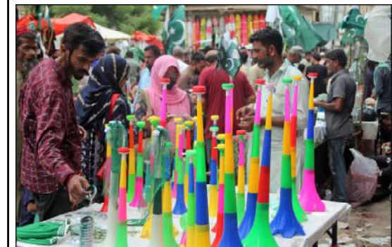
KARACHI: Vendors sell Pakistan's national flags at a roadside stall on the eve of the country's Independence Day, in the Provincial Capital.

Under the agreement signed between WASA Multan and the Korea International Cooperation Agency (KOICA), a master plan will be developed to prevent Multan city from urban flooding and underground water tanks would be constructed to provide relief to low-lying areas of the city during monsoons.