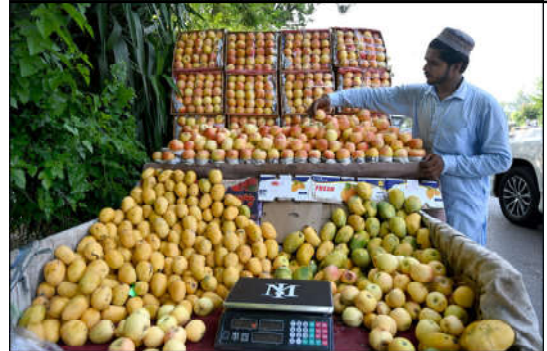
ISLAMABAD: A vendor displays fruits on his roadside setup to attract the customers at F-10 area.

This year's festivities were marked by heartfelt ceremonies that showcased a remarkable bond between the two nations. The day began with a traditional flag-raising ceremony, a moment of great significance for the Pakistani employees. As the Pakistani flag was hoisted against the backdrop of the power plant, the ceremony was conducted with great reverence and national pride, said a news release.