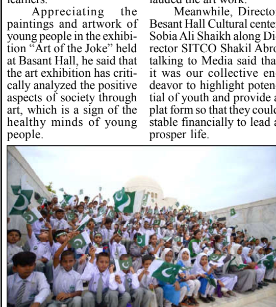
KARACHI: School students are holding National Independence Day, at Jinnah Mausoleum in Karachi.