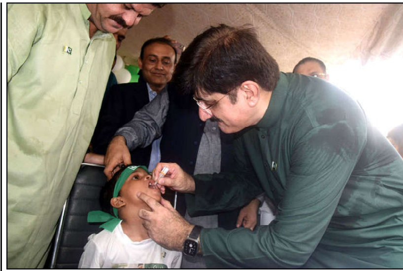
KARACHI: Sindh Chief Minister Syed Murad Ali Shah launches a 10-day polio eradication campaign by administering polio drops to children at Khalid Jameel Dispensary, Garden East.

said that the anti-polio campaign launched in 85 union councils of Karachi city targeted over 1.1 million children under five to receive oral polio vaccine drops. He added that 1,037,000 children (ages four months to five years) would receive fractional inactivated polio vaccine (f-IPV) injections. The Chief Minister stated that innovative and painless jet injector technology is being used to target high-risk areas in Karachi, where the polio virus is still circulating. He added that the mission aims to stop the spread of the virus in the city and prevent its transmission to other parts of the province. Talking about the current polio situation in Pakistan, Murad Ali Shah said that 14 new polio cases were reported in the country this year, including two in Sindh. "Each case represents a child affected by polio emphasize the life-