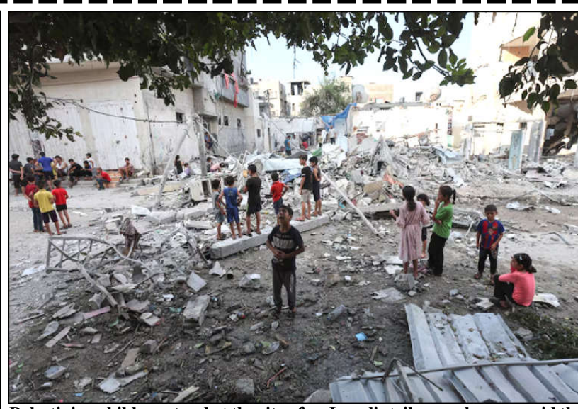
Palestinian children stand at the site of an Israeli strike on a house, amid the Israel-Hamas conflict, in Maghazi refugee camp in the central Gaza Strip.

Monitoring Desk MEXICO CITY: Mexican President Andres Manuel Lopez Obrador told a morning press conference on Wednesday that he would send a diplomatic note to the United States over what he called interference regarding US donations to opposition civil organizations. The president cited US funding for Mexicanos Contra la Corrupcion y la Impunidad, an anti-graft NGO which has investigated possible corruption in his administration as well as that of his predecessors. "We have dealt with it here several times, it has been made public but now we are going to handle it in the appropriate way through the letter I am going to send President Biden," Lopez Obrador said.