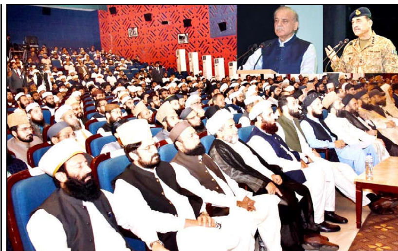
ISLAMABAD: Prime Minister Muhammad Shabbaz Sharif and Chief of Army Staff General Syed Asim Munir NI (M) addressing the National Ulama & Mashaikh Conference.

He said even the army soldiers, who sacrificed their lives to protect millions of other children from being orphaned, were being humiliated on social media.