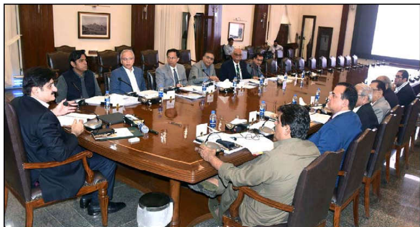
KARACHI: Sindh Chief Minister, Syed Murad Ali Shah chairs a meeting of the Sindh Education Foundation Board, at CM House in Karachi.

Property, children, estates may also be temptation or strife if it diverse you from justice; and the sword for injustice will be a strife including the slogan of Takbeer."