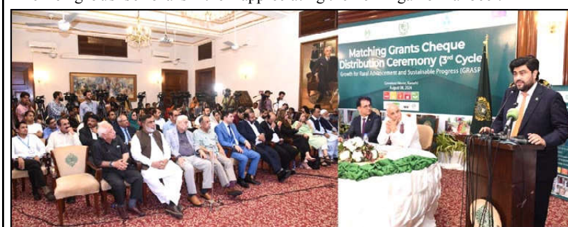
KARACHI: Governor Sindh Kamran Khan Tessori addressing GRASP matching grand cheques distribution ceremony at Governor House.

The increase would be applicable to all the consumer categories except Electric Vehicle Charging Stations (EVCS) and lifeline consumers. It would be shown separately in the consumers' bills on the basis of units billed to the consumers in the month of June 2024. XWDISCOs would reflect the fuel charges adjustment in respect of June 2024 in the billing month of August 2024, said a notification issued here.