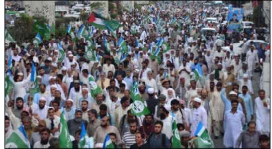
RAWALPINDI: On the call of Ameer Jamaat-Islami Hafiz Naeemur Rahman, the rally against rising electricity bills and inflation is passing through Murree Road.

The delegation, in turn, commended the Governor for his initiatives and commitment to women's empowerment. He also stressed the need for providing digital skills and market exposure to women involved in handicrafts to ensure their efforts are rewarded.