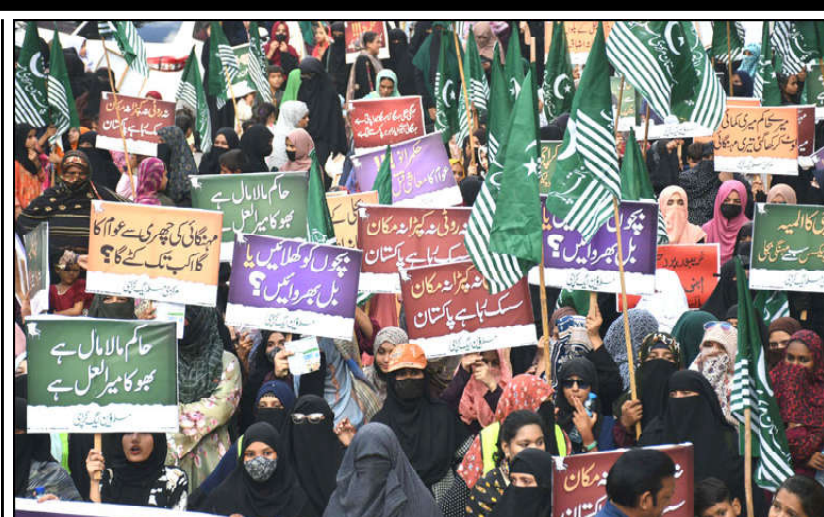
KARACHI: Women supporters of Pakistan Markazi Muslim League protest against inflation during rally in Karachi.