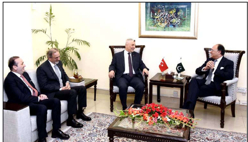
ISLAMABAD: Federal Minister for Finance and Revenue, Senator Muhammad Aurangzeb exchanging views with Prof. Dr. Omer Bolat, Trade Minister of Turkey during meeting held in Islamabad.

MNA Hameed Hussain, and security forces in bringing the situation under control. Naqvi acknowledged that external hands sabotaging peace efforts cannot be ignored. Governor Kundi thanked Minister Naqvi for his support in establishing peace, as the government intensifies efforts to improve public order in Khyber Pakhtunkhwa. The meeting marked a significant step towards forging a joint strategy to tackle future conflicts and ensure lasting peace in the region.