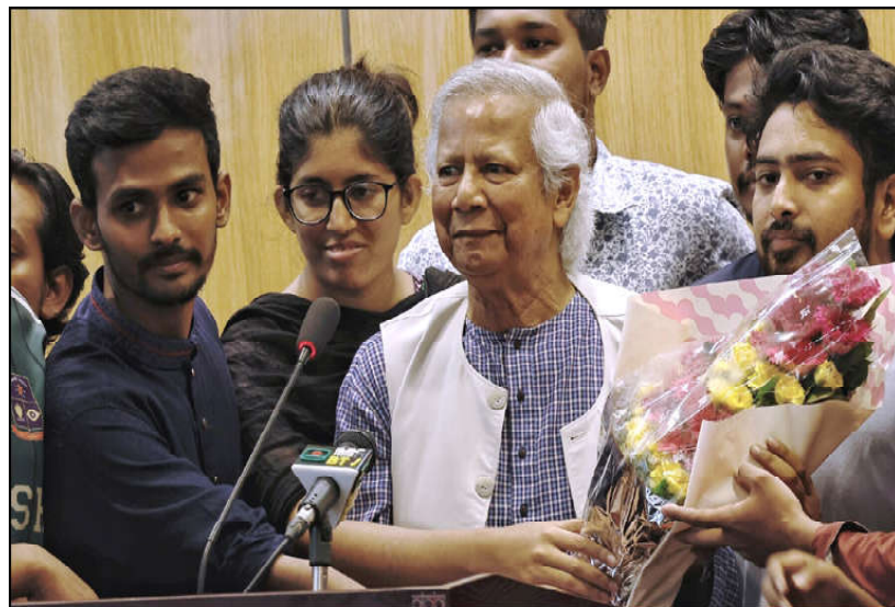
Nobel laureate Muhammad Yunus is pictured during a press briefing, as he arrives at the Hazarat Shahjalal International Airport, in Dhaka.

That operation led to bombardment of Gaza by Israel and the deaths of almost 40,000 people, mostly civilians. In addition to issuing regular statements condemning civilian deaths in Gaza, OIC leaders gathered with their counterparts from the Arab League in November for a summit that condemned Israeli forces' barbaric actions in Gaza.