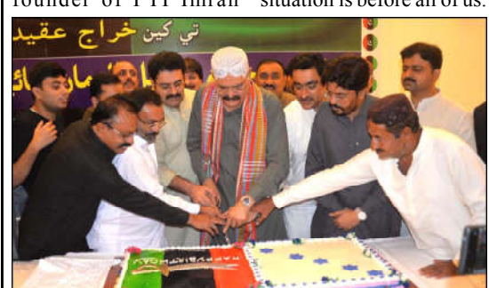
HYDERABAD: Birth anniversary of late spiritual leader of Sarwari Jamat and former central leader PPP late Makhdoom Amin Faheem was observed in a local hotel.

Khan is set free, he said this in his brief talk with media men after his appearance in anti corruption court Rawalpindi Thursday. Government and establishment should give positive response to what PTI founder Imran Khan is talking about and making efforts persistently to lower temperature in politics, he added. Because what change has come in the attitude of Imran Khan and PTI, it is necessary to take it positive. Otherwise Bangladesh situation is before all of us.