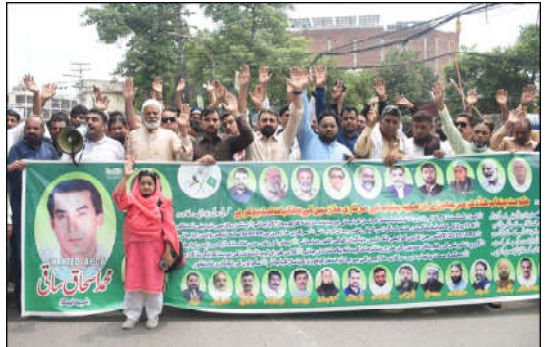
LAHORE: Members of All Pakistan Clerk Association are protesting for their demands in front of the press club of the provincial capital.