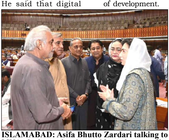
MNAs during national assembly session at parliament house.

claimed that SIFC will take the country into a new race of development.