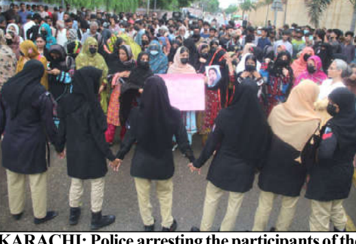
KARACHI: Police arresting the participants of the Baloch Yakjehti Council protest rally at Karachi Arts Council Fawara Chowk.

said that on behalf of the Municipal Corporation, On the occasion of Pakistan's independence, lamps will be lit on important intersections and government buildings in the city and cleaning will be done in the city.