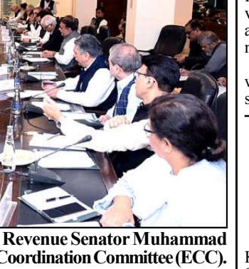
Aurangzeb presiding over a meeting of Economic Coordination Committee (ECC).

The prime minister was making collective efforts to address electricity turbine efficiency of 64 terim government, the Sindh and Punjab govern-