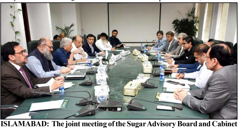
Committee on Monitoring Sugar Export was presided over by Federal Minister for Industries and Production, Rana Tanveer Hussain.

CPI inflation Rural, On month-on-month increased to 8.1% on yearon-year basis in July 2024 as compared to an increase of 9.3% in the previous month and 31.3% in July 2023. On month-on-month basi, it increased to 2.2%.