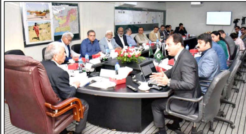
KARACHI: Federal Minister for National Food Security and Research Mr. Rana Tanveer Hussain chaired a meeting with officials and stakeholders of DPP.