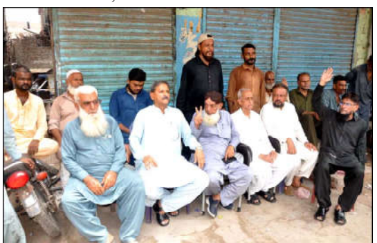
HYDERABAD: Shopkeepers of Anaj Mandi are holding protest demonstration against withholding taxes, in Hyderabad.