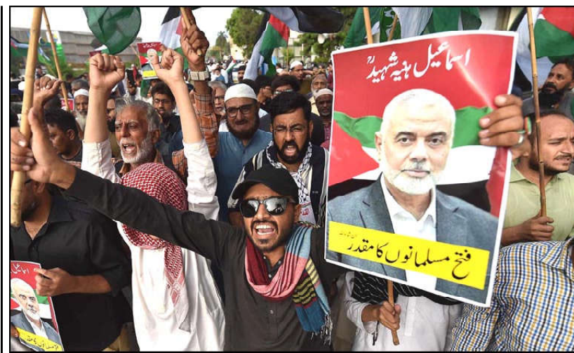
KARACHI: Karachi Jamat e Islami hold protest against Israel Government after killing of Hamas political chief Ismail Haniyeh in Tehran.

Appointed to the Hamas top job in 2017, Haniyeh has moved between Turkey and Qatar's capital Doha, escaping the travel curbs of the blockaded Gaza Strip and enabling him to act as a negotiator in ceasefire talks or to talk to Hamas' ally Iran.