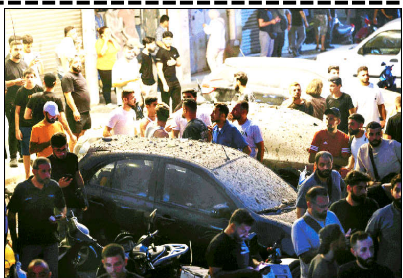
Bystanders surround vehicles covered in debris near the site of an Israeli strike on Beirut's southern suburbs.