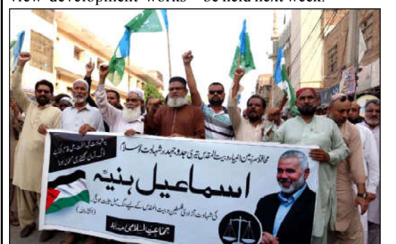
HYDERABAD: Activists of Jamat-e-Islami (JI) are holding protest demonstration against assassination of Hamas Leader Ismail Haniyeh in Tehran, in Hyderabad.

held at Commissioner House here. He said that government now was discouraging the trend of schemes to be completed with 5 or more than 5 years but increasing the investment to get such schemes completed within one or two years. The Divisional Commissioner directed all the Deputy Commissioners (DCs) of the Sukkur division to bring complete data about their performance in the next meeting, which will be held next week.