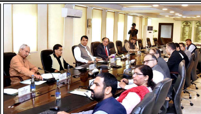
ISLAMABAD: Federal Minister for Finance & Revenue Senator Muhammad Aurangzeb chairing a meeting of the Committee on the issues of Gilgit-Baltistan.

A total of nine ships were engaged at PQA berths during the last 24 hours, out of them Gas carrier 'Epic Sunter' left the port on today morning while three more ships, Apollon-D, Endeavour and Sea Luck-III are expected to sail on today afternoon. Cargo volume of 122,590 tonnes, comprising 62,651 tonnes imports cargo and 59,939 tonnes export cargo carried in 2,470 Containers (980 TEUs Imports & 1,490 TEUs Export) was handled at the port during last 24 hours.