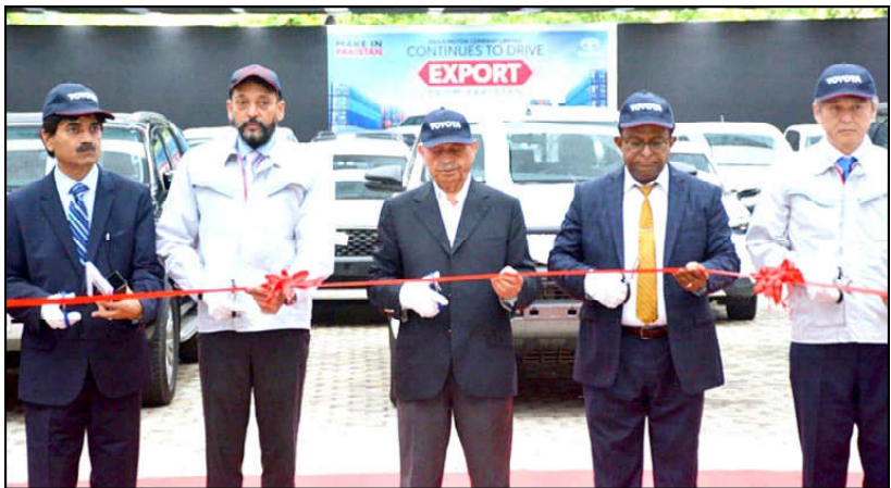
KARACHI: Federal Minister for Industries and Production, Mr. Rana Tanveer Hussain, is cutting the ribbon to inaugurate the vehicle export section at Toyota Indus Motors Company in Karachi.