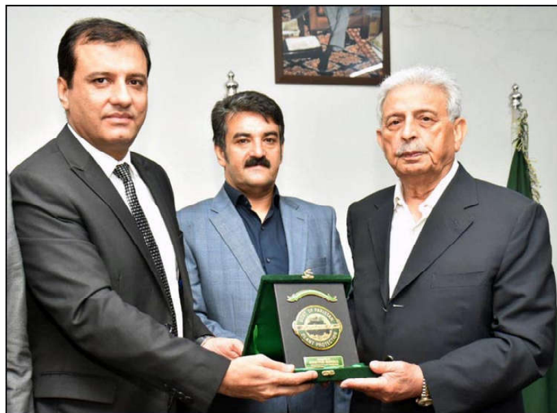
KARACHI: Federal Minister for National Food Security and Research Mr. Rana Tanveer Hussain Presented a Memento by the Director General of Department of Plant Protection.