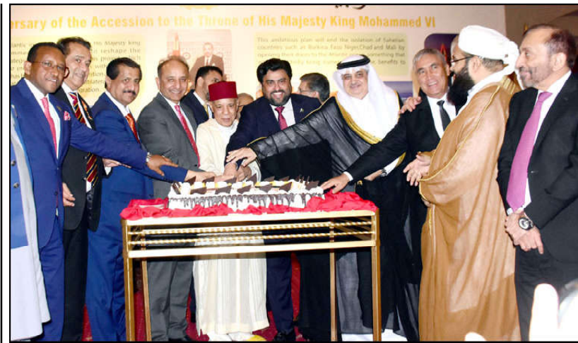
ISLAMABAD: Federal Minister for Petroleum Mussadaq Malik, Governor Sindh Kamran Tesori, Ambassador of the Kingdom of Morocco Mohamed Karmoun and others cutting cake to celebrate the Fifth Anniversary of the Accession to the throne of His Majesty King Mohammed VI at a local hotel in the Federal Capital.

within the discipline matrix against those who trespass their powers, do corruption and show nonprofessional behaviour. The DIG Sukkur said that police force should also ensure immediate resolution of issues of the citizens with their high moral values, professional skills and full fledge actions so that the citizens may be helpful to police for supremacy of law by securing the cooperation and trust of the public. He further said that it is my target and mission to restore and win the prestige of Police force and public trust by the help of public friendly policing and in this regard, all police force will have to take side with me by showing best performance.