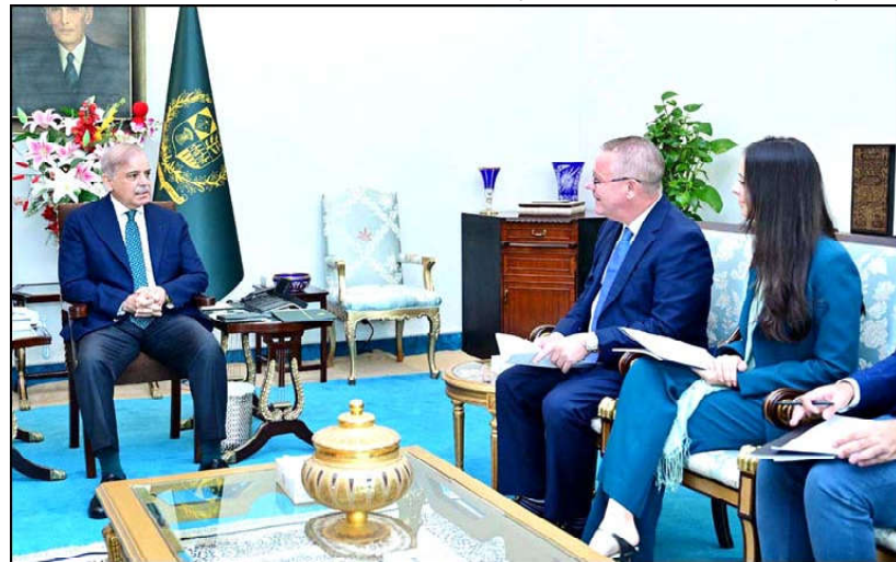
ISLAMABAD: A delegation of Asia Internet Coalition calls on Prime Minister Muhammad Shehbaz Sharif.

The provincial minister assured that development schemes would be implemented at all major shrines of Sindh including Shah Abdul Latif Bhittai and Abdullah Shah Ghazi to resolve issues over there.