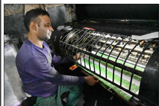
LAHORE: Paper flags of Pakistan are being printed at the printing press in preparation for Independence Day celebrations.

Chief Secretary, who outlined the issues faced by the GB government. Some of these issues were related to insufficient fund allocations and delays in PSDP projects which lead to employee related and other liabilities. The Chief Secretary advocated for solar power projects designed to address the region's growing energy needs. He also proposed initiatives for the digitization of land records and the expansion of airports to enhance tourism potential. These proposals aim to modernize GB's infrastructure and capitalize.