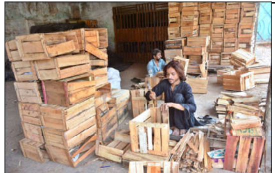
HYDERABAD: Labourers busy in preparing the wooden boxes at his workplace.

He said that the Pakistani rupee also stabilized, and things are moving in a positive direction. Although it was challenging to stabilize the exchange rate, we've successfully achieved it.