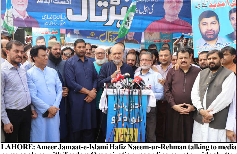
persons along with Traders Organization regarding countrywide shutter down strike during his visit to protest camp.

MULTAN (APP): Two persons of the same family were killed and three others sustained injuries in a traffic accident that occurred near Kheera Chowk area of Multan, tv channels quoting Rescue sources reported on Tuesday. According to details, a rashly driven bus hit the two wheeler near Kheera chowk area.