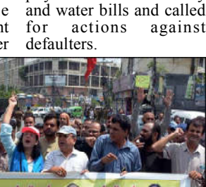
LAHORE: Members of Professors and Lecturers Association are holding protest demonstration for acceptance of their demands, at Lahore press club.

He emphasized the need for community cooperation in timely payments of electricity