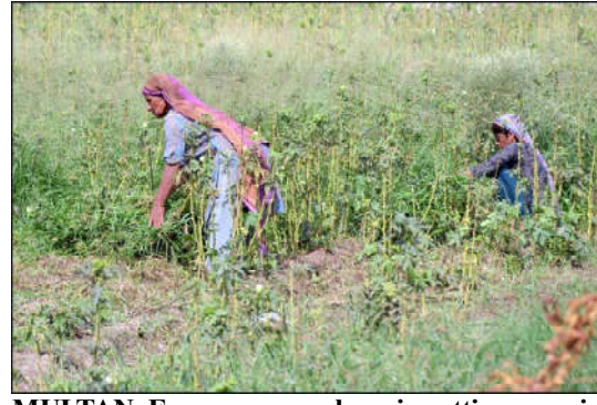
MULTAN: Farmer women busy in cutting grass in the field for their animals.