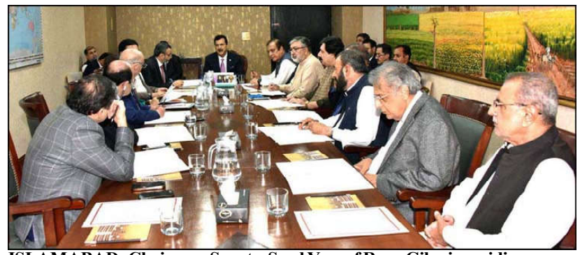
ISLAMABAD: Chairman Senate, Syed Yousuf Raza Gilani presiding over a Senate House Business Advisory Committee meeting at Parliament House.

The prime minister said that yesterday's terrorist attacks in Balochistan were cowardly acts which could not be justified, adding the brave security forces foiled the designs of and order situation in the rorists and initiation of terrorists by sacrificing their