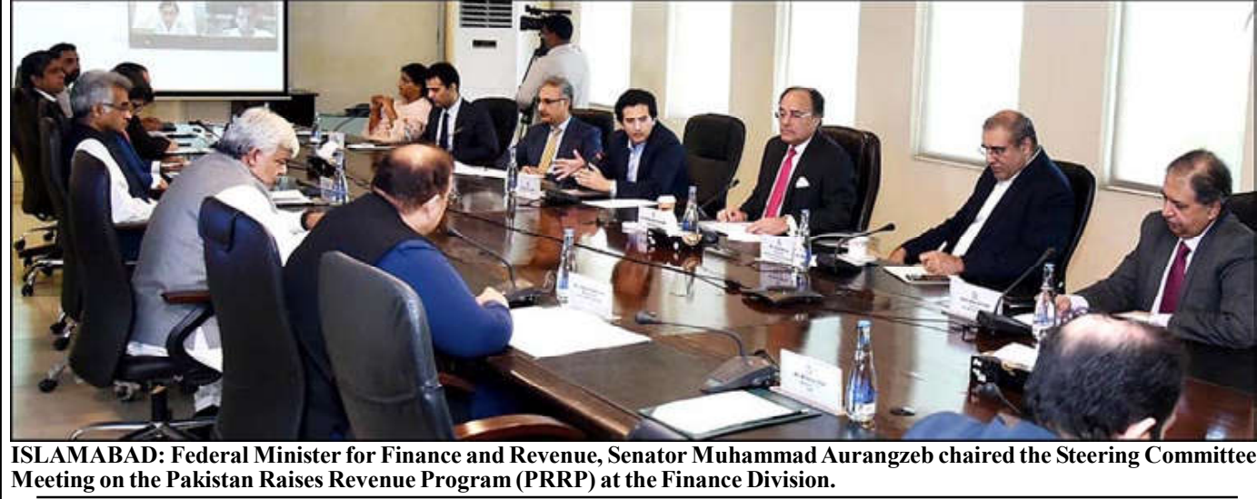
FAISALABAD: Federal Minister for Energy, Awais Ahmad Khan Laghari, charing a meeting at FESCO Headquarters.