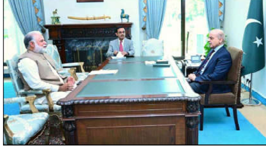
ISLAMABAD: Former Deputy Speaker National Assembly Murtaza Javed Abbasi called on Prime Minister Muhammad Shehbaz Sharif.