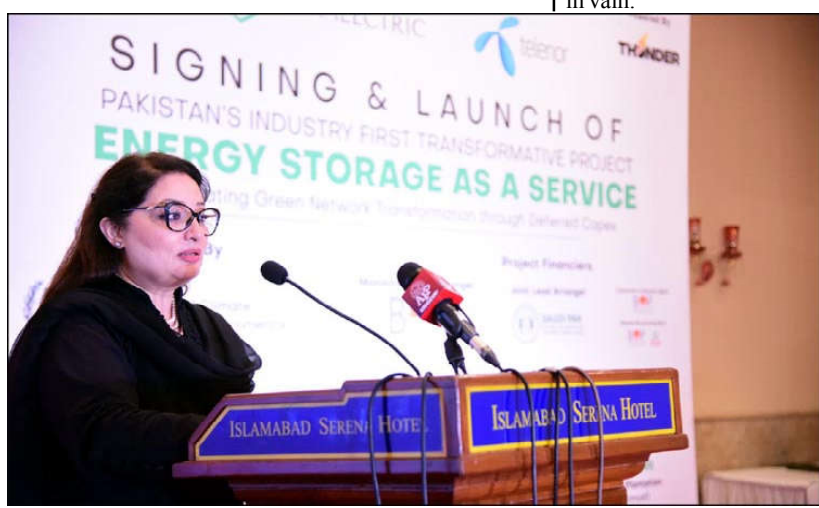
Coordinator to PM on Climate Change, Romina Khurshid Alam addressing as chief guest at a ceremony about launching of industry-first energy storage as a service project in Islamabad