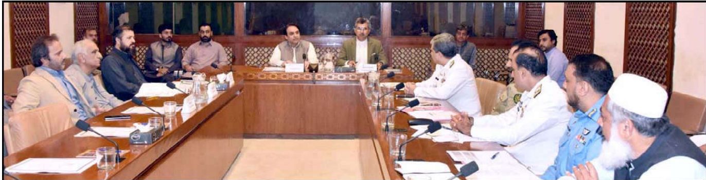
ISLAMABAD: Senator Muhammad Abdul Qadir, Chairman Senate Standing Committee on Defence Production presiding over a meeting of the committee at Parliament House.