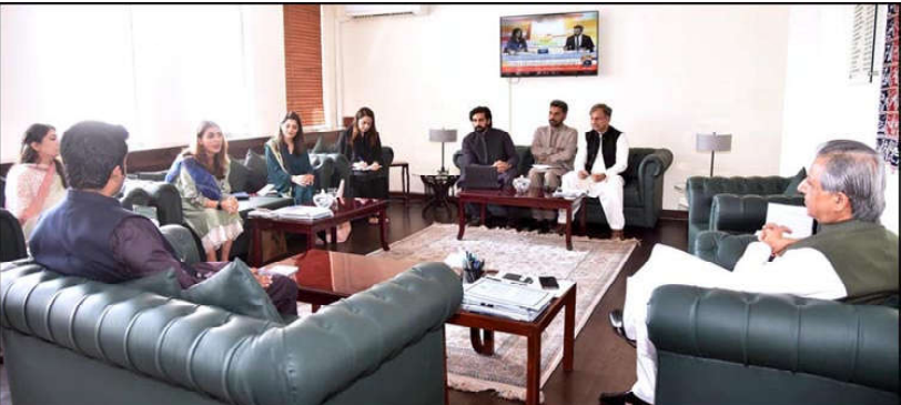
ISLAMABAD: A delegation from Legal Aid Society had a meeting with Federal Minister for Law and Justice and Human Rights Senator Azam Nazeer Tarar in Federal Capital.