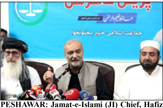
PESHAWAR: Jamat-e-Islami (JI) Chief, Hafiz Naem-ur-Rehman along with others addresses to media persons during press conference, at Markaz-e-Islami in Peshawar.

ISLAMABAD (APP): Prime Minister Muhammad Shabbaz Sharif, expressing profound sorrow and grief over recent catastrophic floods, on Friday offered assistance Bangladesh to help cope with the devastating situation. In a letter to Chief Advisor, Bangladesh Dr. Muhammad Yunus, Prime Minister Muhammad Shabbaz Sharif expressed Pakistan's solidarity with Bangladesh during this challenging time, stating that the country stood with those who have lost loved ones, homes, and livelihoods in the floods. This was shared in a press release by the PM's Office.