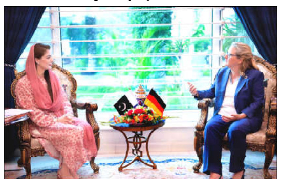
LAHORE: German Minister for Economic Cooperation and Development Svenja Schulze meeting with Punjab Chief Minister Maryam Nawaz.

Sharing additional findings of the report, he acknowledged the progress Pakistan has made in human capital development but noted that the pace remains slower compared to other emerging economies and regional peers. "These findings serve as a sober reminder that much more needs to be done to improve education outcomes across the country. We are in an era of knowledge revolution where the intellectual capital of the nation determines its destiny," he observed. Ahsan Iqbal stressed that Pakistan's education indicators lagged behind those of peer countries and stated "Unless we achieve 90 percent literacy and universal primary enrollment, we cannot enter the development arena." He emphasized the importance of fostering creativity, critical thinking, problem-solving, and teamwork skills in children and vowed to bring 25 million out-of-school children into the education system.