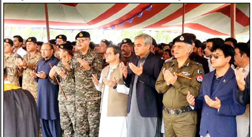
RAHIM YAR KHAN: Federal Minister for Interior, Mohsin Naqvi attending funeral prayer of martyred police personnel in Rahim Yar Khan.

say " reduce the tariff of electricity. Balochistan wala will say provide gas to me. His national interest is this. SP from Punjab Police Lahore appeared in the court and he told that CCTV footage has been provided by family. Nothing could become known from NADRA or forensic agency. Geo-fencing of 10000 number was obtained but nothing has been ascertained so far. No practicable information has been found till today August 23. Safe city project does not cover from every angle. No law enforcement agency could ascertain any thing in this regard so far. The court remarked it seems as if only government is beneficiary of enforced disappearances. How the people in this country are kidnapped and chief executive does nothing.