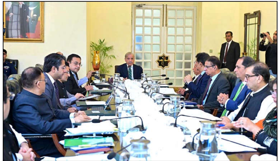
ISLAMABAD: Prime Minister Muhammad Shehbaz Sharif chairs a meeting on matters related to Small and Medium Enterprises Development Authority.

has sought proposals for shutting down the state-owned Utility Stores Corporation (USC) and replaces it with a new system. The prime minister also called for proposals within two weeks for an alternative system in place of the Utility Stores. The government was mulling to give cash amounts to BISP consumers of the Utility Stores. In the meanwhile, the Utility Stores have stopped sale of subsidized items to the BISP consumers.