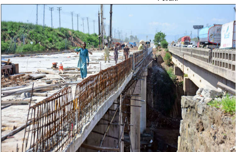
ISLAMABAD: Labourers are busy in construction work of a bridge at Islamabad highway during development work, in the Federal Capital.