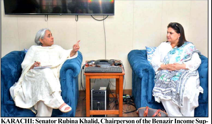
port Programme (BISP) call on Minister of Health Sindh Azra Fazal Pechuho at Sindh Secretariat Karachi.