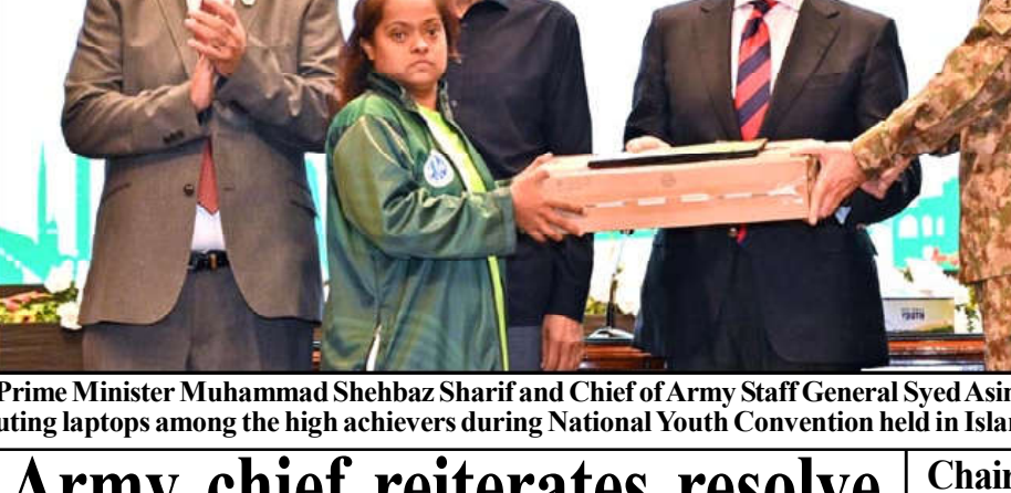
Prime Minister Muhammad Shehbaz Sharif and Chief of Army Staff General Syed Asim Munir distributing laptops among the high achievers during National Youth Convention held in Islamabad.

In the Faiz Hameed case, he said it appeared that the PTI founder had no qualms about using people for his own personal interests. The minister said the PTI founder was expert in ditching his own well wish-