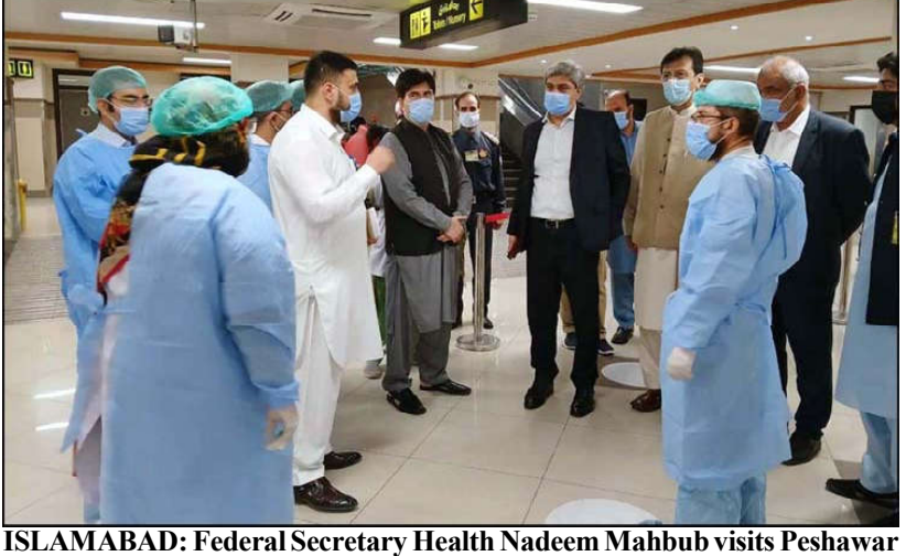
International Airport to review M-pox arrangements.

He was immediately shifted to a nearby hospi